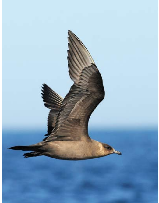
282 Arctic Jaeger / Kleine Jager Stercorarius parasiticus , off southern Portugal, 22 September 2009

algarvebirdman.com, www.birdwatching-algarve.com and www.marilimitado.com. More information on sightings of Wilson's Storm Petrels in the area can be found at www.club300.de/articles/008_wilsons/index.html (with many links to related websites about Wilson's Storm Petrel and pelagic trips off coastal Europe).