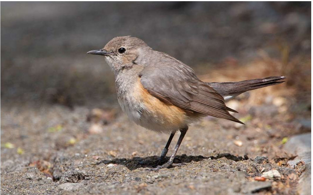
330 White-throated Robin / Perzische Roodborst Irania gutturalis , female, Hartlepool, Cleveland, England, 8 June 2011