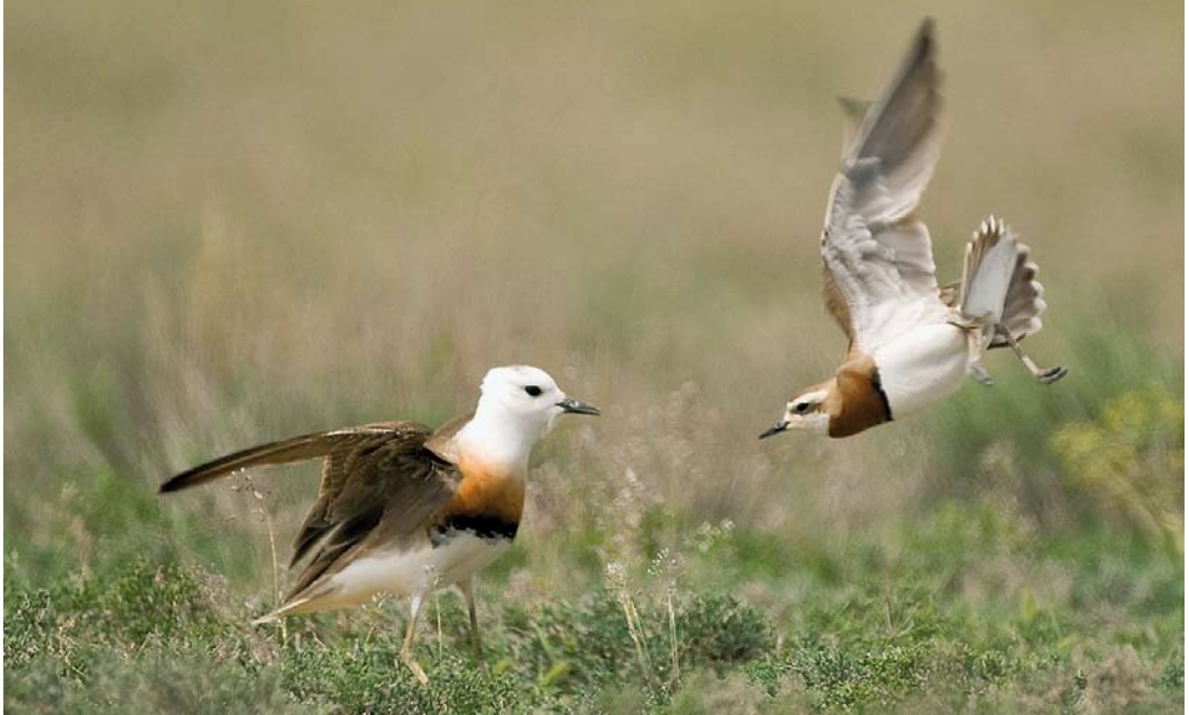
293 Oriental Plover / Steppeplover Charadrius veredus , adult male, with Caspian Plover C asiaticus , adult male, Atanbaschik semi-desert, Aqtöbe province, Kazakhstan, 9 May 2009

The relatively fresh primaries in combination with the well-developed breast pattern indicated that the bird was an adult. First-summer males show very worn primaries and usually attain a dull breast band (Prater et al 1977).