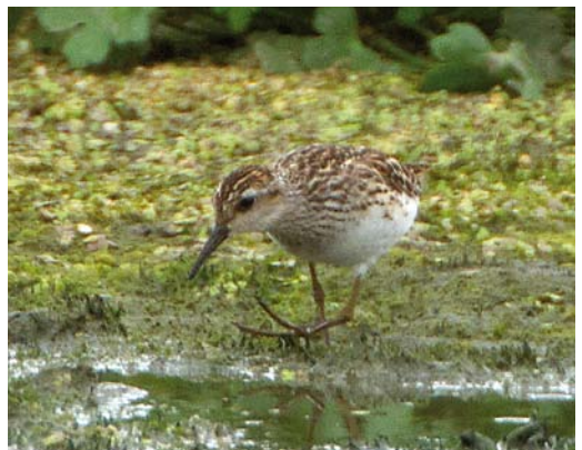
314 Egyptian Vulture / Aasgier Neophron percnopterus , Zandvoorde, West-Vlaanderen, Belgium, 22 April 2011 cf Dutch Birding 33: 203, 2011 315 Crested Honey Buzzard / Aziatische Wespindief Pernis ptilorhynchus , adult male, Villa San Giovanni, Calabria, Italy, 18 May 2011 316 Western Reef Heron / Westelijke Rifeiger Egretta gularis , Embouchure de l'oued Ksob, Diabat near Essaouir, Morocco, 19 June 2011 317 Red-necked Stint / Roodkeelstrandloper Calidris ruticollis , adult, Utopia, Texel, Noord-Holland, Netherlands, 19 July 2011 318 White-rumped Sandpiper / Bonapartes Strandloper Calidris fuscicollis , Comacchio, Po delta, Italy, 17 July 2011 319 Long-toed Stint / Taigastrandloper Calidris subminuta , Braunschweiger Rieselfelder, Niedersachsen, Germany, June 2011