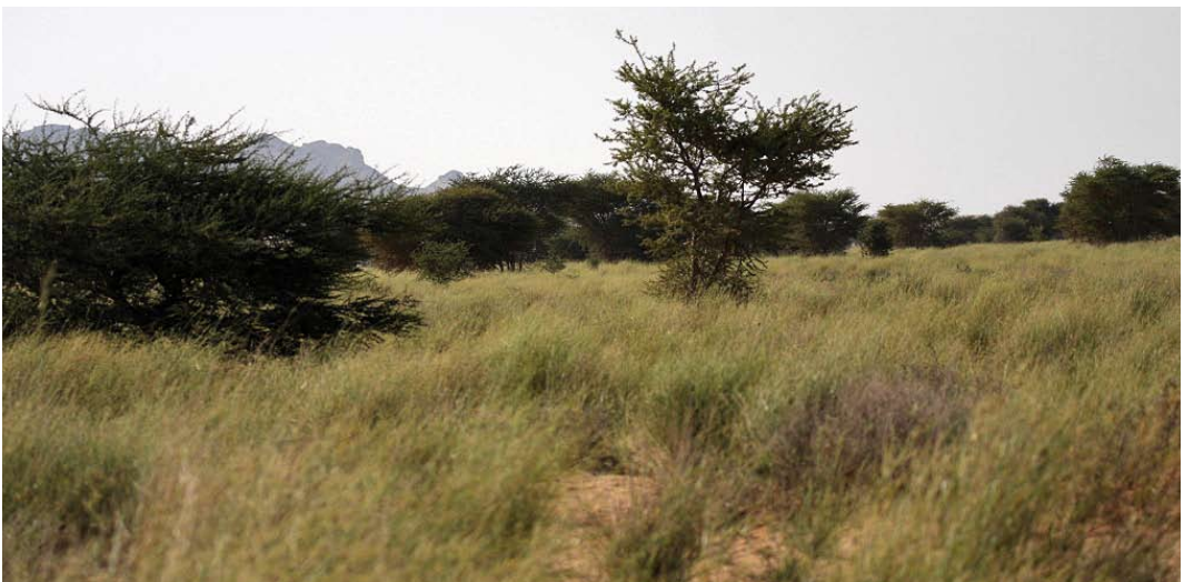
288 Breeding habitat of Cricket Longtail Spiloptila clamans in Oued Jenna, Aousserd, Oued Ed-Dahab, Morocco, 25 October 2010 (Mohamed Radi)

During our survey we recorded the breeding ac-