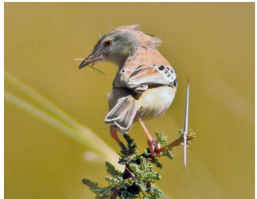
284 Cricket Longtails / Krekelprinia's Spiloptila clamans , adult male with recently fledged juvenile, Aousserd, Oued Ed-Dahab, Morocco, 25 October 2010 ( Mohamed Radi ). Note yellowish gape-flanges in juvenile. 285 Cricket Longtail / Krekelprinia Spiloptila clamans , recently fledged juvenile, Aousserd, Oued Ed-Dahab, Morocco, 25 October 2010 ( Mohamed Radi ). Note yellowish gape-flanges and less black greater coverts. 286-287 Cricket Longtail / Krekelprinia Spiloptila clamans with nest material, Aousserd, Oued Ed-Dahab, Morocco, 3 February 2010 ( Fabian Schneider )

Because of the geopolitical situation of the region, the southernmost Western Sahara (region of Oued Ed-Dahab-Lagouira) and especially the Aousserd region used to be one of the less birded areas in the WP, although it later proved to hold a much sought-after assemblage of desert and subtropical species, some of which are not easy to see inside the WP. One of these, African Dunn's Lark Eremalauda dunnii dunnii , is probably different enough to be considered a potential future split (Lees & Moores 2006, cf Svensson et al 2009). Following the political stabilisation of the region, the number of visiting naturalists has increased considerably in recent years. As a consequence, some significant ornithological discoveries have been made. Since the old records of the 1950s, Black-crowned Sparrow-lark Eremopterix nigri-