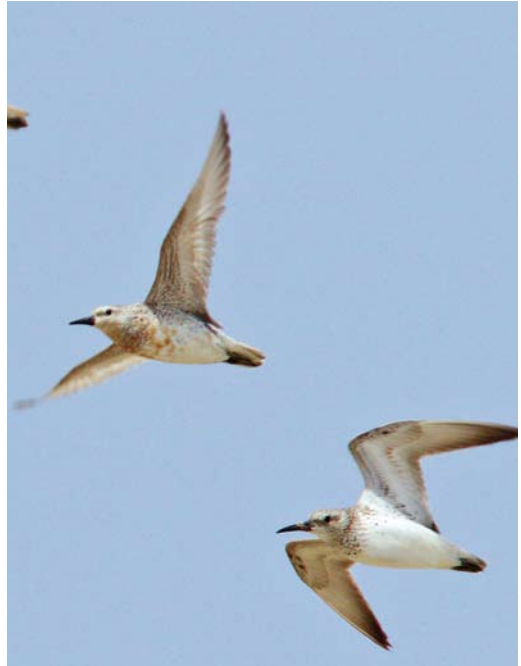
311 Presumed Eastern Common Tern / vermoedelijke Oostelijke Visdief Sterna hirundo longipennis, with Common Tern / Visdief S h hirundo, Heist, West-Vlaanderen, Belgium, 22 June 2011 312 Red Knot / Kanoet Calidris canutus, with Great Knot / Grote Kanoet C tenuirostris, Bandar Abbas, Hormozgan, Iran, 18 May 2011 313 Brown Noddy / Noddy Anous stolidus, Persian Gulf, Iran, 7 June 2011