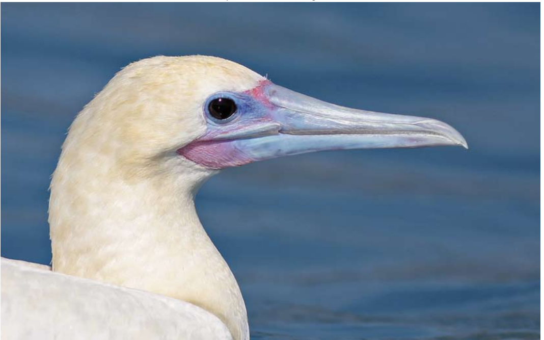
308 Red-footed Booby / Roodpootgent Sula sula , adult, Lac de Sainte-Croix, Alpes-de-Haute-Provence, France, 7 July 2011