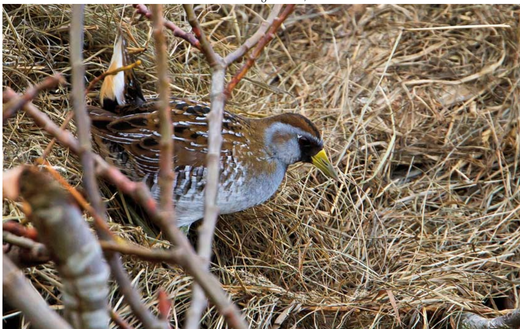
310 Sora / Soraral Porzana carolina , Suðursveit, Iceland, 26 April 2011 ( Ómar Runólfsson ) cf Dutch Birding 33: 203, 2011