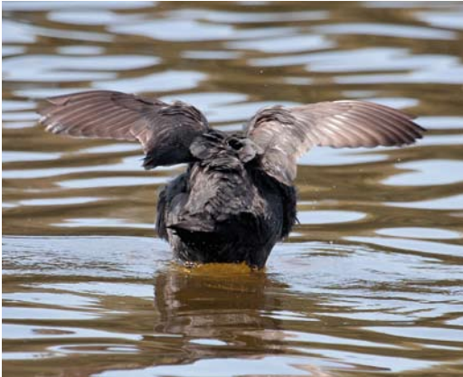
303 Hybrid Eurasian x Red-knobbed Coot / hybride Meerkoet x Knobbelmeerkoet Fulica atra x cristata , Sidi Bou-Rhaba, Morocco, 25 April 2009 (Peter Adriaens). Unlike Eurasian, white trailing edge to secondaries is (almost) absent.