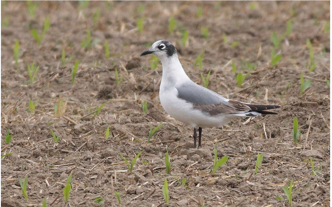
320 Franklin's Gull / Franklins Meeuw Larus pipixcan , second-summer, Delitzsch, Sachsen, Germany, 2 May 2011