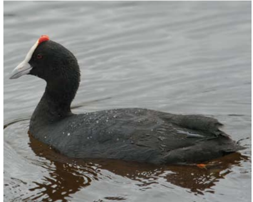
304 Red-knobbed Coot / Knobbelmeerkoet Fulica cristata , Sidi Bou-Rhaba, Morocco, 25 April 2009