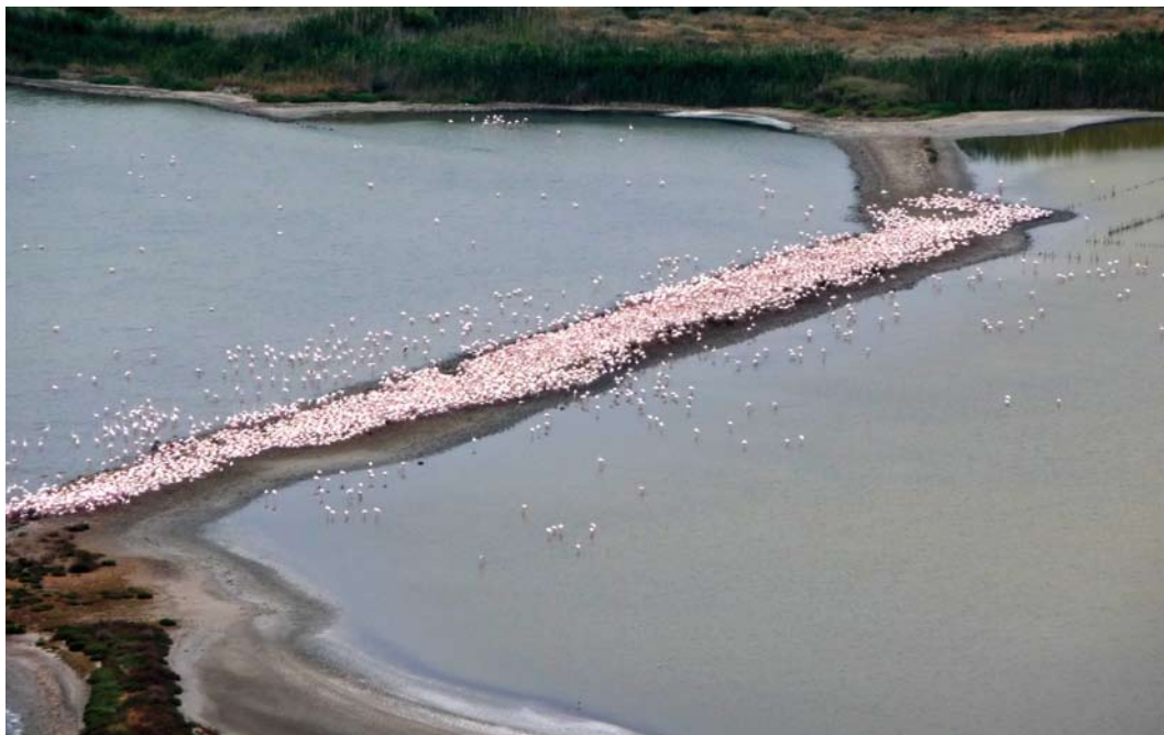
309 Greater Flamingos / Flamingo's Phoenicopterus roseus , breeding colony, Molentargius, Cagliari, Sardinia, Italy, 21 May 2011 ( Marcello Grussu )