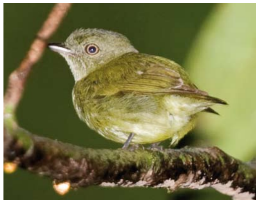
20 Lettered Aracari / Letterarassari Pteroglossus inscriptus, Alta Floresta, Mato Grosso, Brazil, November 2006 21 Red-necked Aracari / Roodhalsarassari Pteroglossus bitorquatus, Alta Floresta, Mato Grosso, Brazil, November 2006 22 Rufous-bellied Euphonia / Roodbuikorganist Euphonia rufiventris, male, Rio Cristalino, Alta Floresta, Mato Grosso, Brazil, 22 July 2006 23 Dusky-tailed Flatbill / Chapmans Breedbektiran Ramphotrigon fuscicauda, Rio Cristalino, Alta Floresta, Mato Grosso, Brazil, 15 August 2006 24 Amazonian Tyrannulet / Bruinkopinezia Inezia subflava, Alta Floresta, Mato Grosso, Brazil, November 2006 25 Dwarf Tyrant-manakin / Dwergtiranmanakin Tyrannetes stolzmanni, Rio Cristalino, Alta Floresta, Mato Grosso, Brazil, December 2006.