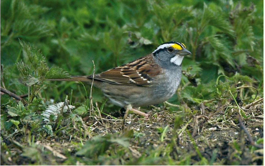
222 White-throated Sparrow / Witkeelgors Zonotrichia albicollis , Old Winchester Hill, Hampshire, England, 19 April 2009 ( John Carter )