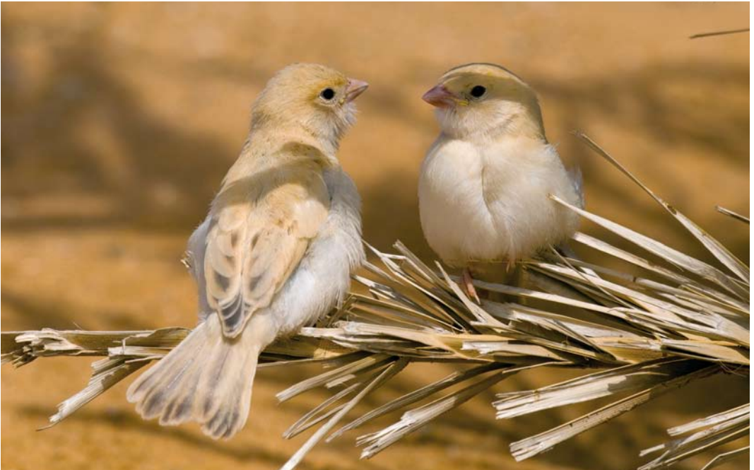
223 Desert Sparrows / Woestijnmussen Passer simplex , fledglings, Merzouga, Tafilalt, Morocco, 30 March 2009 ( Arnoud B van den Berg )