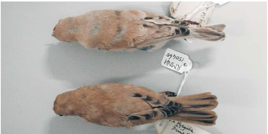
162 Desert Sparrows / Afrikaanse Woestijnmussen Passer simplex , Nationaal Natuurhistorisch Museum Naturalis, Leiden, Netherlands, July 2008 (Guy M Kirwan). Dorsal comparison of female P s simplex (bottom) and P s saharae (top).