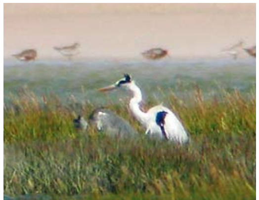
212 Purple Heron / Puperreiger Ardea purpurea , off Gough, Tristan da Cunha archipelago, South Atlantic Ocean (40°25'91"S, 9°59'53"W), 8 April 2009 213 Magnificent Frigatebird / Amerikaanse Fregatvogel Fregata magnificens , Curral Velho, Boavista, Cape Verde Islands, 26 March 2009 214 Chinese Shrike / Chinese Klauwier Lanius arenarius , male, Bibi Shirvan, Golestan, Iran, 19 January 2009 215 Caspian Plover / Kaspische Plevier Charadrius asiaticus , Mandria beach, Cyprus, 9 April 2009 216 Cricket Warbler / Kreckelprinia Spiloptila clamans , between Dakhla and Aousserd, Morocco, 21 April 2009 217 Mauritainian Heron / Mauritaanse Blauwe Reiger Ardea cinerea monicae , Hoja Lamera, Dhakla bay, Morocco, 22 April 2009