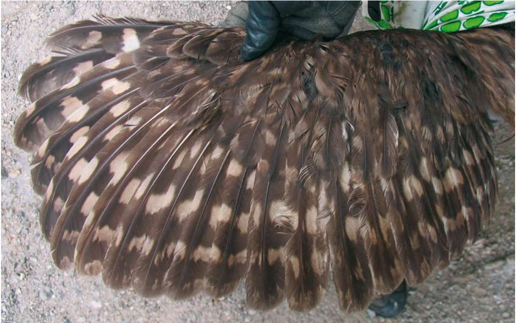
181 Ural Owl / Oeraluil Strix uralensis macroura , central Slovenia, 6 June 2007. Wing of melanistic morph.