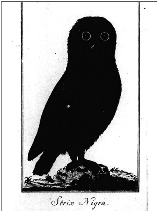
FIGURE 3 First published illustration of melanistic morph of Carpathian-Dinaric Ural Owl Strix uralensis macrourea given by Hacquet (1791) and described as ' Strix nigra '

to dark is clinal, the number of distinguishable morphs is difficult to define and the four morphs proposed here and their demarcation must be considered somewhat arbitrary.