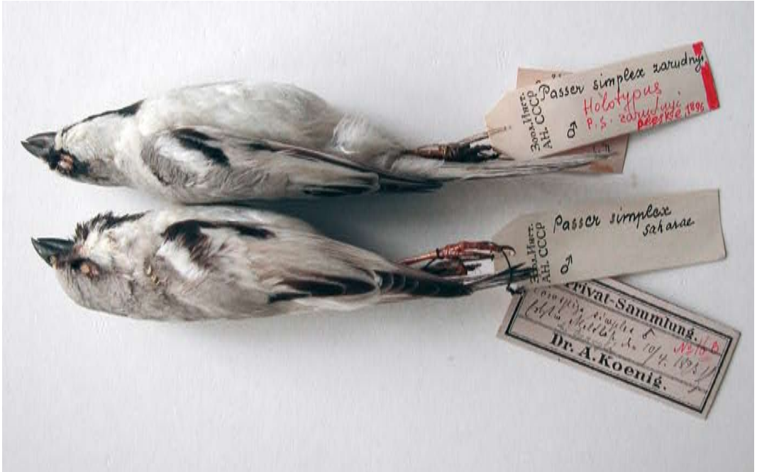
153-155 Zarudny's Sparrow / Zarudny's Woestijnmus Passer (simplex) zarudnyi , holotype (top), and Desert Sparrow / Afrikaanse Woestijnmus P s saharae , male, Zoological Institute, Russian Academy of Sciences, St Petersburg, Russia (ZISP), July 2007.