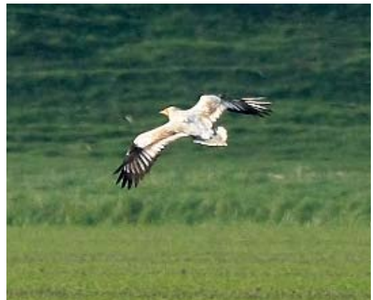
231 Roodkeelpieper / Red-throated Pipit Anthus cervinus , De Pomp, Lauwersmeer, Friesland, 26 april 2009 (Roef Mulder) 232 Roodstuitzwaluw / Red-rumped Swallow Cecropis daurica , Kraaijensbergse Plassen, Gelderland, 7 april 2009 (Harvey van Diek) 233 Rode Rotslijster / Rufous-tailed Rock Thrush Monticola saxatilis , mannetje, Veenhuizerstukken, Groningen, 1 mei 2009 (Phil Koken) 234 Aagier / Egyptian Vulture Neophron percnopterus , Wieringermeer, Noord-Holland, 25 april 2009 (Fred Visscher)

Ruigpootuil Aegolius funereus gevonden; de vogel bleek te zijn geslagen door een Havik A. gentilis . Een overvliegende Alpengierzwaluw Apus melba werd op 3 april gefotografeerd bij Kamperhoek. Een spectaculaire melding was die van een helaas niet twitchbare Huisgierzwaluw A. affinis op 16 maart boven Reek, Noord-Brabant. Indien aanvaard gaat het om het derde geval; de vorige waren op 17 mei 2001 op Terschelling en op 20 november 2006 in IJmuiden. De eerste Hop Upupa epops van het voorjaar werd op 15 maart gefotografeerd in Asten, Noord-Brabant. Vanaf 4 april verschenen soortgenoten op ten minste 20 andere plekken. In het merendeel van de gevallen ging het om kortstondige waarnemingen. Het meeste bekijks trok een exemplaar op de Maasvlakte van 17 tot 19 april. Vanaf 10 april werden verspreid over het land weer verscheidene Draaihalzen Jynx torquilla waargenomen. Het exemplaar dat op die datum in de Eemshaven verbleef, kreeg misschien nog