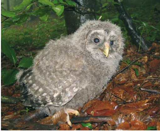
187 Ural Owl / Oeraluil Strix uralensis macrourea , central Slovenia, 21 May 2008 (Al Vrezec). Fledgling of partially melanistic or melanistic morph, with no visible bars on back or belly and with dark facial disk.