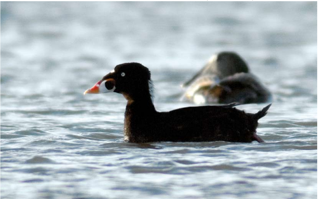
207 Surf Scoter / Brilzee-eend Melanitta perspicillata , adult male, with Common Eider / Eider Somateria mollissima , De Slufter, Texel, Noord-Holland, Netherlands, 10 May 2009 (René Pop)