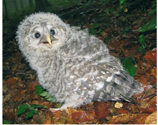
188 Ural Owl / Oeraluil Strix uralensis macrourea , central Slovenia, 21 May 2008 (Al Vrezec). Fledgling of pale or grey morph, with well distinguishable barring pattern on back and belly.

individuals of the pale and grey morphs, much less so in partially melanistic birds and almost imperceptible in melanistic individuals. The circumocular barring is present only in pale and grey morph individuals but not in melanistic birds. I have found that circumocular barring is present in all grey morph owls but is absent in c 43% of pale morph individuals (table 1). The increase of pigments (melanin) is shown also in the barring pattern of the primaries and secondaries, with the dark bars generally being larger in melanistic individuals than in pale or grey birds. Also in the tail-feathers, especially the pair of central feathers, only a few pale patches with no clear barring pattern are present in melanistic individuals. Similar almost unicoloured central tail-feathers are also found in davidi (Scherzinger & Fang 2006).