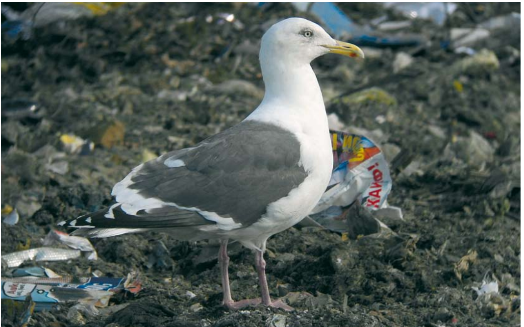
205 Slaty-backed Gull / Kamtsjatkameeuw Larus schistisagus , adult, Riga, Latvia, 13 April 2009