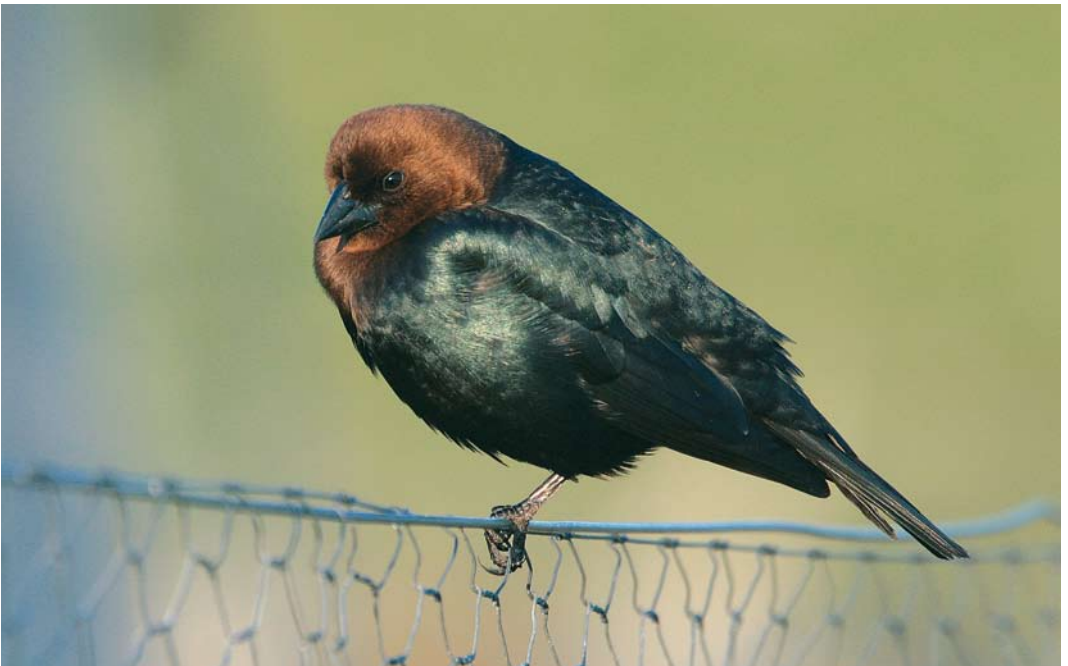
225 Brown-headed Cowbird / Bruinkopkoevogel Molothrus ater , Fair Isle, Shetland, Scotland, 10 May 2009 (Steve Minton)