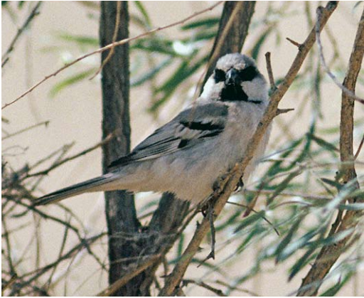
170 Zarudny's Sparrow / Zarudny's Woestijnmus Passer (simplex) zarudnyi , male, Repetek, Turkmenistan, May 1993