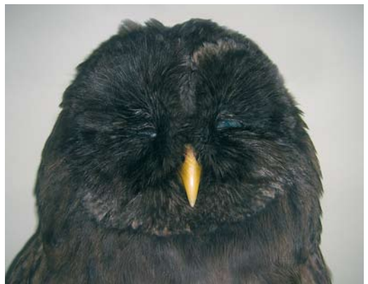
173 Ural Owl / Oeraluil Strix uralensis liturata , southern Finland, 19 April 2008 ( Al Vrezec ). Pale facial disk is typical for northern subspecies of Ural Owl. 174 Ural Owl / Oeraluil Strix uralensis 'momiymae' (included in S u hondoensis ), Honshu, Japan, 17 April 2004 ( Aki Higuchi ). In eastern part of range, southern Ural Owls are darker and more brownish than northern subspecies. 175 Ural Owl / Oeraluil Strix uralensis macroura , central Slovenia, 6 April 2007 ( Al Vrezec ). Facial disk of pale morph. 176 Ural Owl / Oeraluil Strix uralensis macroura , central Slovenia, 11 May 2007 ( Andrej Kapla ). Grey morph individual with prominent circumocular barring. 177 Ural Owl / Oeraluil Strix uralensis macroura , central Slovenia, 6 June 2007 ( Andrej Kapla ). Facial disk of melanistic morph. 178 Ural Owl / Oeraluil Strix uralensis macroura , Ljubljana, Slovenia, 20 November 2004 ( Al Vrezec ). Facial disk of melanistic morph; very dark individual with almost blackish facial disk.