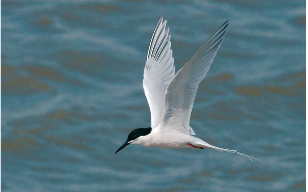
208 Roseate Tern / Dougalls Stern Sterna dougallii , adult, Stellendam, Zuid-Holland, Netherlands, 7 May 2009