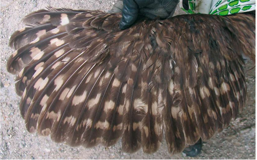
181 Ural Owl / Oeraluil Strix uralensis macroura , central Slovenia, 6 June 2007 ( Andrej Kapla ). Wing of melanistic morph.