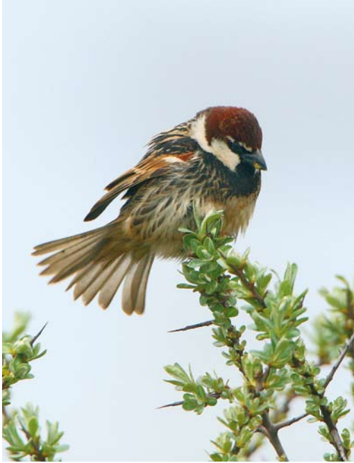
240 Spaanse Mus / Spanish Sparrow Passer hispaniolensis , mannetje, Maasvlakte, Zuid-Holland, 21 april 2009 (Michel Veldt)