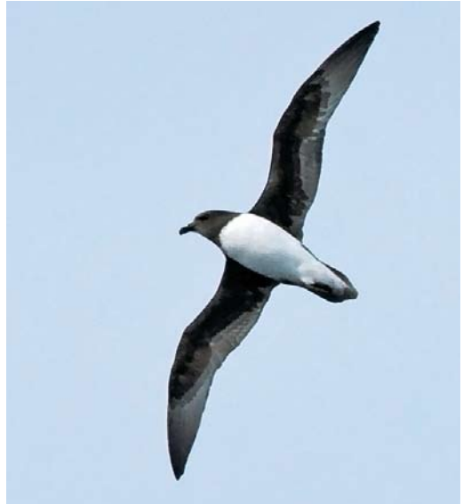
189 Magenta Petrel / Magentastormvogel Pterodroma magentae , Chatham Rise, Pacific Ocean, 22 November 2008

Magenta Petrel (or Taiko) was described from a single specimen collected 800 km east of the Chatham Islands, near the Tubai Islands in the South Pacific on 22 July 1867 during a voyage around the world of the Italian ship Magenta (Giglioli & Salvadori 1869). The link between this bird and the presumed-extinct Chatham Island 'Taiko' was revealed when a bird was caught on Chatham Island, New Zealand, by David Crockett on 1 January 1978 (Crockett 1994). Formerly widespread on Chatham Island, Magenta Petrel is now confined to one small forested valley system on the south-west of the main island. Not surprisingly, the species is listed as 'Critically Endangered' by BirdLife International, due to an assumed 80% decline in population in the last 60 years and the fact that it is restricted to one small location. The current population is estimated at 100-150 individuals and it is often referred to as the world's rarest seabird. In 2005, the 13 known breeding pairs successfully fledged 11 chicks. Molecular analysis discovered that 95% of the non-breeding adults were male. This suggests that the critically low population level may cause males difficulty in attracting a mate, as their calls are too spread out to attract the infrequent females which pass by (BirdLife International 2008). Conservationists are planning to increase the males' pulling power by