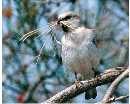
171 Zarudny's Sparrow / Zarudny's Woestijnmus Passer (simplex) zarudnyi , female, Repetek, Turkmenistan, May 1993 (Marc Raes)

winged Finch Rhodopechys sanguineus and African Crimson-winged Finch R. alienus deserve species status, and Kirwan & Shirihai (2006) recommended specific status for Striolated Bunting Emberiza striolata (= Striated Bunting; cf Redactie Dutch Birding 2009) (in Asia and east Africa) and House Bunting E. sahari (elsewhere in Africa) (cf van den Berg 2008).