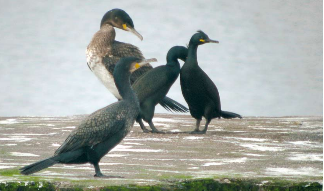
227 Grote Aalscholver / Atlantic Great Cormorant Phalacrocorax carbo carbo (achter), Aalscholver / Continental Great Cormorant P c sinensis (voor) en Kuifaalscholwers / European Shags P aristotelis , adult (rechts), Noordersluis, IJmuiden, Noord-Holland, 5 april 2009 (Enno B Ebels)