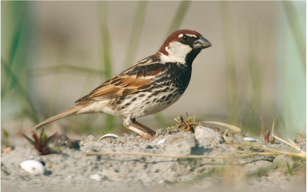
238 Spaanse Mus / Spanish Sparrow Passer hispaniolensis , mannetje, Eemshaven, Groningen, 11 april 2009