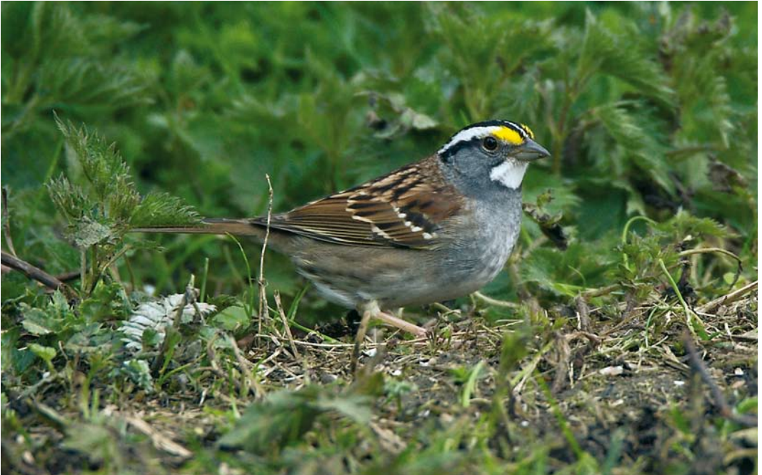
222 White-throated Sparrow / Witkeelgors Zonotrichia albicollis , Old Winchester Hill, Hampshire, England, 19 April 2009 ( John Carter )