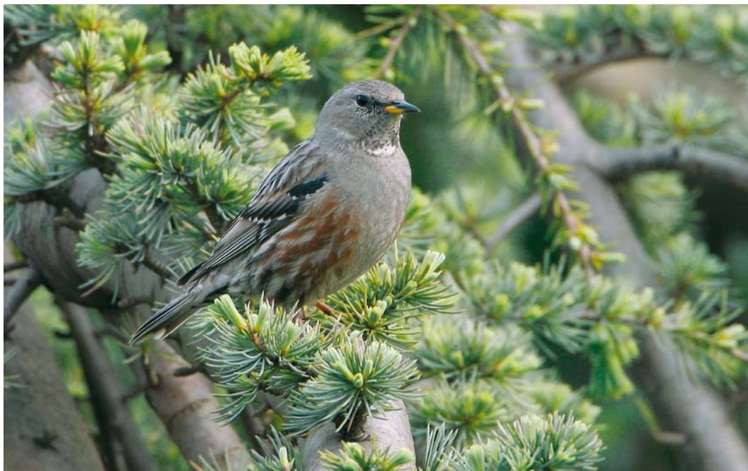
235 Alpenheggenmus / Alpine Accentor Prunella collaris , Eibergen, Gelderland, 26 april 2009 (Martin van der Schalk)