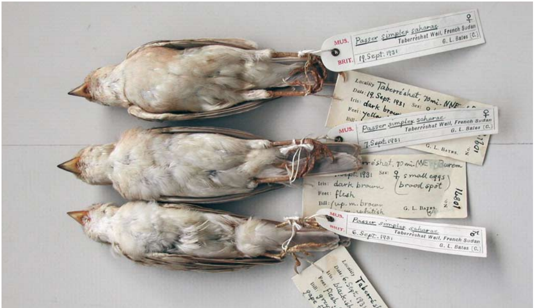
168 Desert Sparrows / Afrikaanse Woestijnmussen Passer simplex , Natural History Museum, Tring, England, February 2007. Ventral comparison of saturation in three specimens of P s simplex from Mali. From top to bottom: female (September), female (September) and young male (September). Similar variation can be seen in upperparts coloration of specimens from Mali.