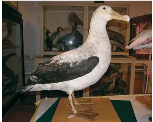
199 Tristan Albatross / Tristanalbatros Diomedea exulans dabbenena , immature male (collected at Palermo, Sicily, Italy, on 4 October 1957), Museo di Storia Naturale, Terrasini, Sicily, Italy, February 2008 (Fabio Lo Valvo)

Soldaat et al (2009) mentioned the bill size (length 150 mm, width c 39 mm) published in Orlando (1958) as being characteristic for dabbenena . Apart from this, the overall smaller size separates it from Wandering Albatross D e exulans but does not exclude Antipodean Albatross D e antipodensis which is similar in size. However, antipodensis is extremely unlikely to occur in the WP because it is distributed mainly in the Pacific Ocean. Separating the 'wandering albatross' taxa, which are often regarded as five separate species (cf Burg & Croxall 2004, Soldaat et al 2009), is very difficult but measurements should lead to the correct taxon. The Sicilian specimen is thus as-