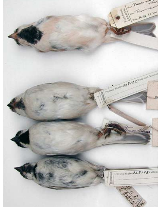
156-157 Zarudny's Sparrows / Zarudny's Woestijnmussen Passer (simplex) zarudnyi , two males and female (lower three), and Desert Sparrow / Afrikaanse Woestijnmus P s saharae , young male, National Museum of Natural History, Smithsonian Institution, Washington DC, USA, August 2006 (Guy M Kirwan)