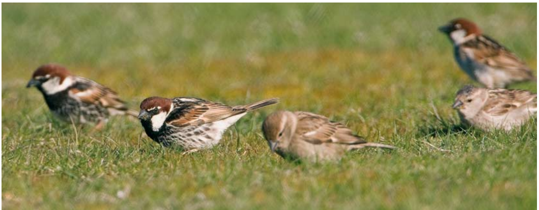
237 Spaanse Mussen / Spanish Sparrows Passer hispaniolensis , mannetjes en vrouwtjes, Eemshaven, Groningen, 10 april 2009 (Roland Jansen)

Omdat niet eerder groepjes Spaanse Mussen rond de Noordzee waren gezien, werd over de herkomst gespeculeerd. Zo was enkele dagen voor de ontdekking in de haven een graanschip uit Griekenland aangekomen dat onderweg geen andere haven had aangedaan. Voor zover bekend zijn de vogels echter niet op of in de buurt van dat schip gezien. Verder zijn er geen aanwijzingen dat de vogels met een schip zijn meegekomen. De soort is in het verleden wel verdacht van het zich verplaatsen per schip. Zo verbleven in mei 1995 zes Spaanse Mussen te Antifer in Normandië, Frankrijk, waarvan werd verondersteld dat ze met een schip waren gearriveerd (Birding World 8: 355, 1995). Daar staat tegenover dat de soort in Zuid-Europa trekvogel is en normaliter in groepjes vliegt. De CDNA neemt vogels waarvan is aangetoond dat ze met behulp van een schip zijn aangekomen niet