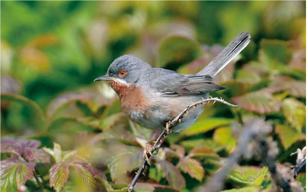
224 Eastern Subalpine Warbler / Oostelijke Baardgrasmus Sylvia cantillans albistriata , male, Portland Bill, Dorset, England, 9 May 2009 (Nick Hopper)