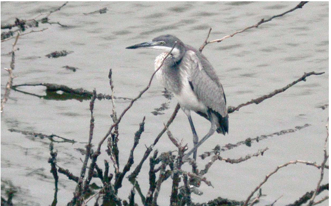
209 Black-headed Heron / Zwartkopreiger Ardea melanocephala , Barragem de Poilao, Santiago, Cape Verde Islands, 21 March 2009