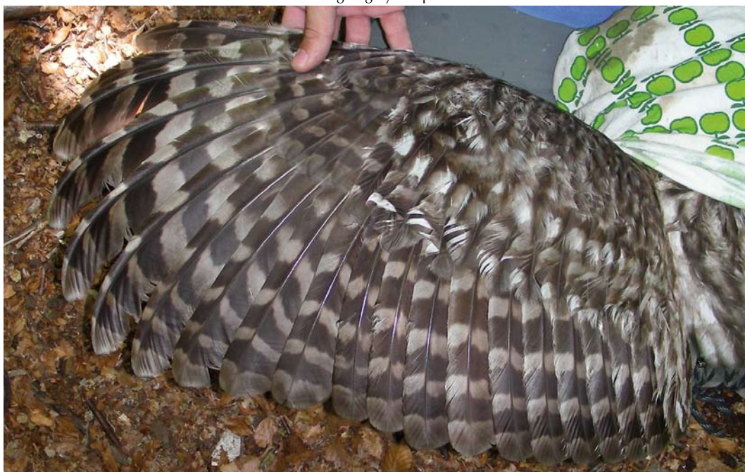
180 Ural Owl / Oeraluil Strix uralensis macroura , central Slovenia, 11 May 2007 ( Andrej Kapla ). Wing of grey morph.