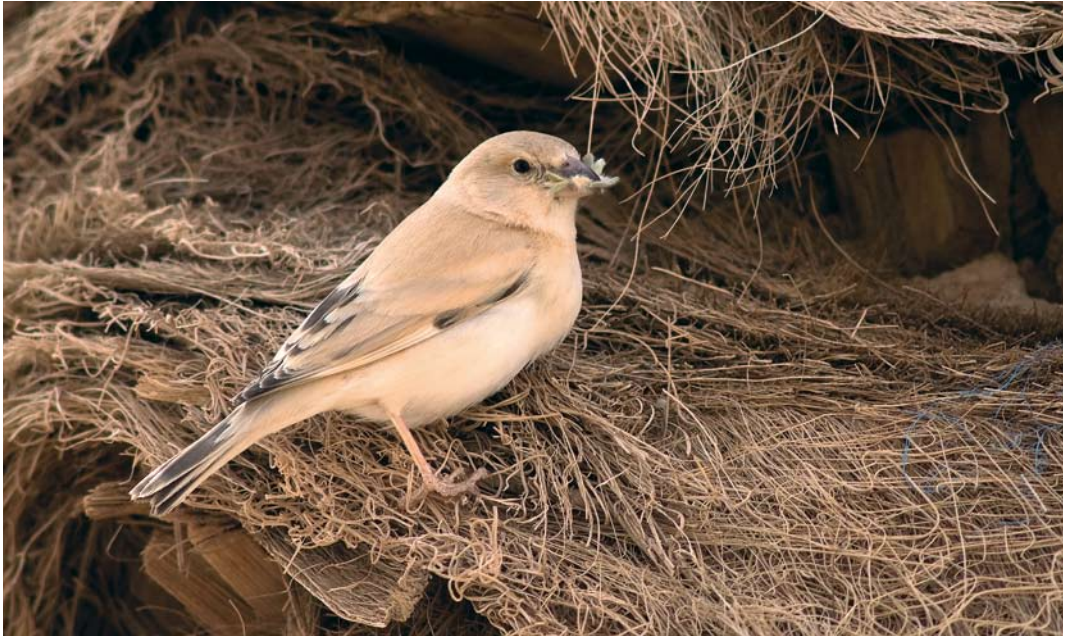
172 Desert Sparrow / Afrikaanse Woestijnmus Passer simplex saharae , female, Merzouga, Tafilalt, Morocco, 30 March 2004 (Arnoud B van den Berg)

qualifies for Red Data listing, given that its core range is now potentially rather small and shows evidence of having declined in recent decades.