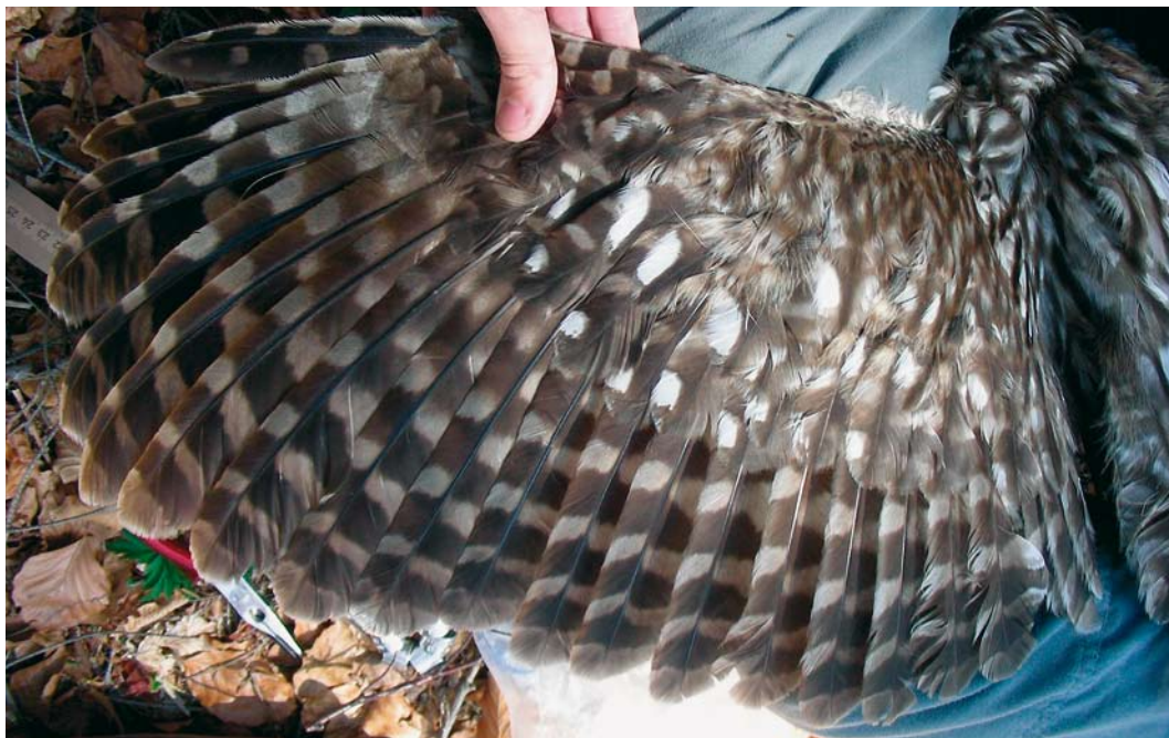
179 Ural Owl / Oeraluil Strix uralensis macroura , central Slovenia, 6 April 2007 ( Andrej Kapla ). Wing of pale morph.