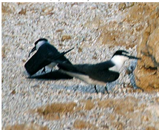
192 Bridled Terns / Brilsterns Onychoprion anaethetus , adults in courtship, Nachlieli, western Galilee, Israel, 7 July 2008 (Eyal Miller)