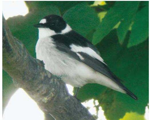
218 Maghreb Tawny Owl / Maghrebbosuil Strix aluco mauritanica , Taroudannt, Morocco, 12 April 2009 (Arnaud B van den Berg) 219 Houbara Bustard / Westelijke Kraagtrap Chlamydotis undulata , Merzouga, Tafilalt, Morocco, 10 April 2009 (Arnaud B van den Berg) 220 Semicollared Flycatcher / Balkanvliegenvanger Ficedula semitorquata , Curdefin, Vaud, Switzerland, 5 May 2009 (Beni Sutter) 221 Collared Flycatcher / Withalsvliegenvanger Ficedula albicollis , first-summer male, Southwell, Portland, Dorset, England, 2 May 2009 (Paul Hackett)

Denmark but just 10 in the Netherlands) and 14-22 May 2007 (the largest-ever for the Netherlands and Belgium with more than 2000 and c 300, respectively) (Dutch Birding 19: 135, 1997, 27: 214, 2005, 29: 198-199, 241-251, 2007). In a recent paper, it has been shown that American Sandwich Tern (Cabot's Tern) Sterna (sandvicensis) acufflavida should be regarded as a separate species from European Sandwich Tern S (s) sandvicensis (Cayenne Tern eurygnatha becoming a subspecies of acufflavida ) (Efe et al 2009, Multigene phylogeny and DNA barcoding indicate that the Sandwich tern complex ( Thalasseus sandvicensis , Laridae, Sternini) comprises two species, Mol Phylogen Evol doi:10.1016/j.ympev.2009.03.030). The first WP record of this taxon concerns a ringing recovery of an individual ringed as a chick on 23 June 1978 in North Carolina, USA, and found dead on 23 December 1978 at Veerse Meer, Zeeland, the Netherlands, and the second was one ring-