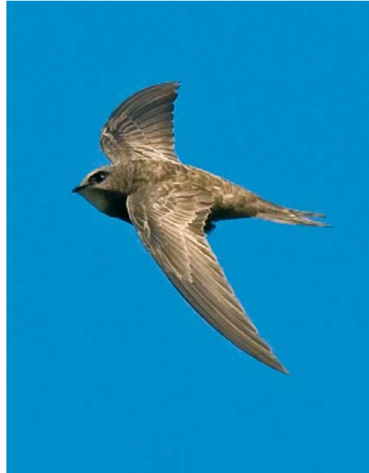
211 Pallid Swift / Vale Gierzwaluw Apus pallidus , Seaforth, Merseyside, England, 4 May 2009

1998 and 16 in 2006 (when 11 pairs produced 24 young). In April-May, up to two adult Bearded Vultures Gypaetus barbatus were frequently seen at Oukaimeden, High Atlas, Morocco, where the species is considered to be close to extinction. A near-adult Egyptian Vulture Neophron percnopterus near Den Oever, Noord-Holland, on 25 April (and probably flying over Castricum, Noord-Holland, as well) was the second for the Netherlands; the first was in May 2001. In the Netherlands, for the eighth summer this century, a Short-toed Snake Eagle Circaetus gallicus appeared at Fochteloeerveen, Drenthe/Friesland; two individuals were present here in the summers of 2001 and 2006, and singles in 2002-05 and 2007. In Malta, more than 25 Pallid Harriers Circus macrourus were seen this spring until the last week of April. In Italy, a second-year female Atlas Long-legged Buzzard Buteo rufinus cirtensis on Pantellaria appeared to be paired with a Common Buzzard B. buteo which had been paired with another Atlas Long-legged in a previous year; there was a second mixed pair as well. In Syria, a flock of eight adult Greater Spotted Eagles Aquila clanga was soaring above Shnan on 9 March. A second calendar-year male (Tönn) born in western Estonia and tagged with a GPS transmitter spent the night of 24/25 April at Delden, Overijssel, without actually being seen by anyone, entering the Netherlands at 16:30 and leaving it again at 09:00. After leaving Estonia on 25 September 2008, Tönn became