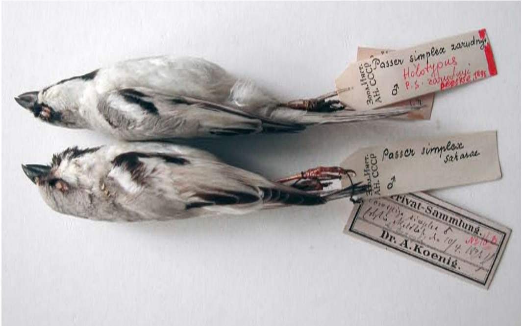
153-155 Zarudny's Sparrow / Zarudny's Woestijnmus Passer (simplex) zarudnyi , holotype (top), and Desert Sparrow / Afrikaanse Woestijnmus P s saharae , male, Zoological Institute, Russian Academy of Sciences, St Petersburg, Russia (ZISP), July 2007 (Guy M Kirwan).