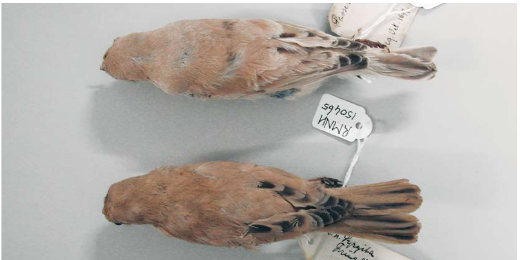
162 Desert Sparrows / Afrikaanse Woestijnmussen Passer simplex , Nationaal Natuurhistorisch Museum Naturalis, Leiden, Netherlands, July 2008 (Guy M Kirwan). Dorsal comparison of female P s simplex (bottom) and P s saharae (top).