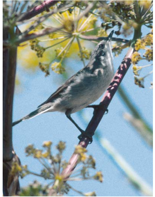
201-203 Lesser Whitethroat / Braamsluiper Sylvia curruca , Lesvos, Greece, May 1995. Used as mystery bird and presumed to be an 'orphan warbler S hortensis/crassirostris ' (then: Orphean Warbler S hortensis ) by the authors (Dutch Birding 19: 244-248, 1997), but in retrospect a Lesser Whitethroat, as most of the entrants rightly suggested.