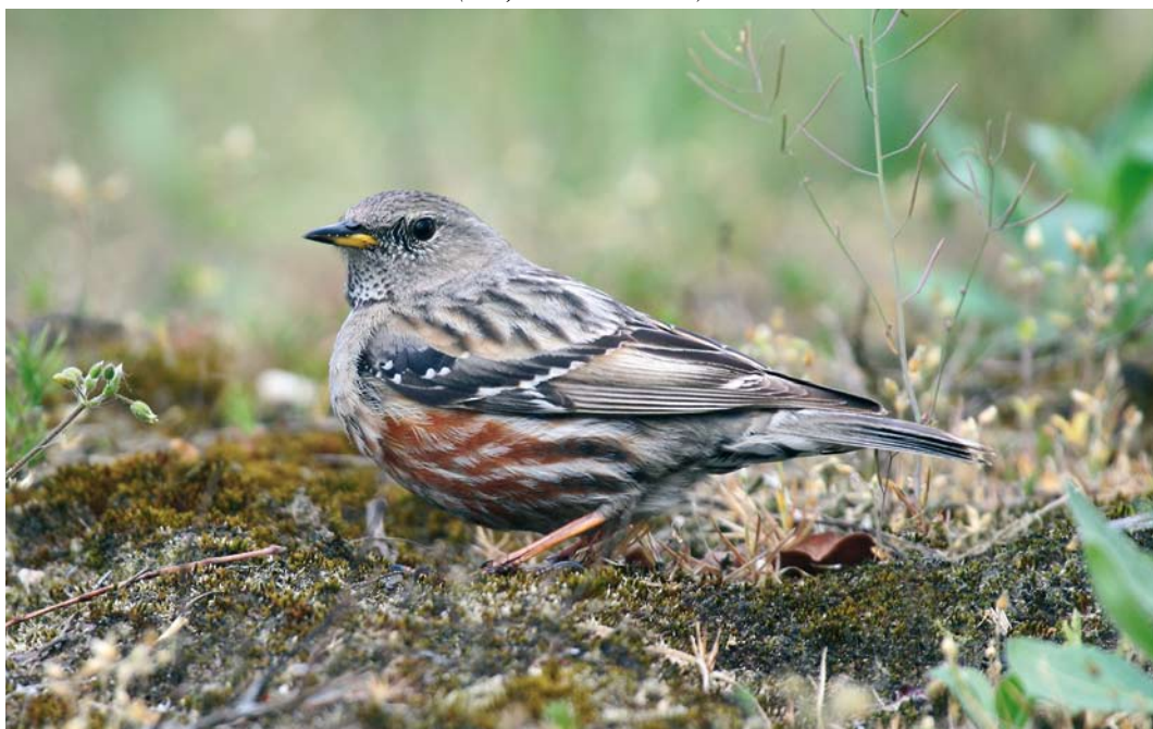
236 Alpenheggenmus / Alpine Accentor Prunella collaris , Eibergen, Gelderland, 27 april 2009 (Leo J R Boon/Cursorius)