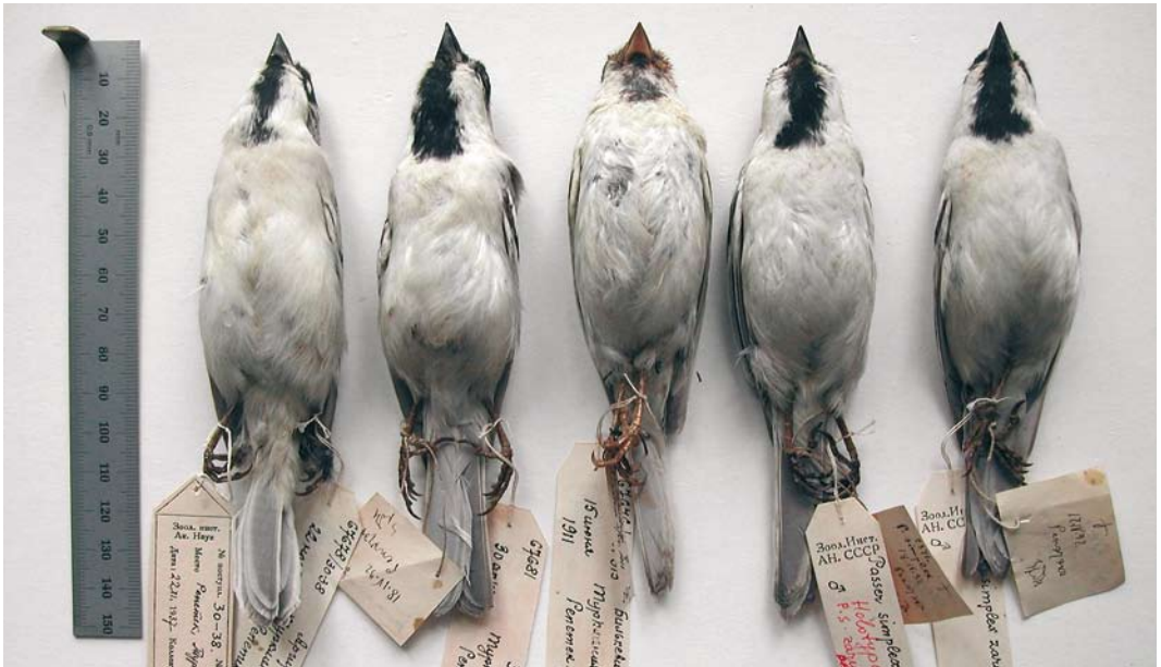
158-160 Zarudny's Sparrows / Zarudny's Woestijnmussen Passer (simplex) zarudnyi, Zoological Institute, Russian Academy of Sciences, St Petersburg, Russia (ZISP), July 2007. All specimens from Repetek, Turkmenistan; from left to right: female, male, female and two males.