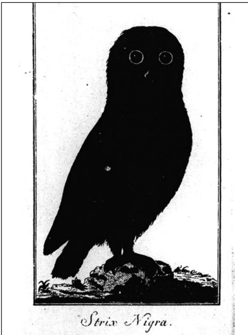
FIGURE 3 First published illustration of melanistic morph of Carpathian-Dinaric Ural Owl Strix uralensis macrourea given by Hacquet (1791) and described as ' Strix nigra '

to dark is clinal, the number of distinguishable morphs is difficult to define and the four morphs proposed here and their demarcation must be considered somewhat arbitrary.