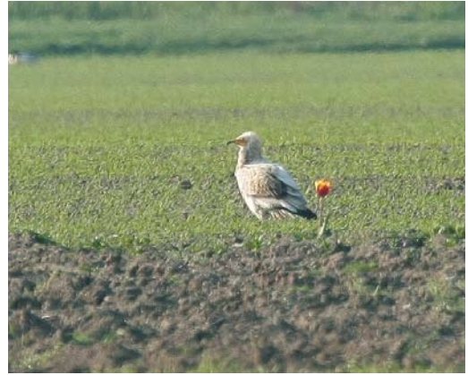
242-243 Aasgier / Egyptian Vulture Neophron percnopterus , Wieringermeer, Noord-Holland, 25 april 2009