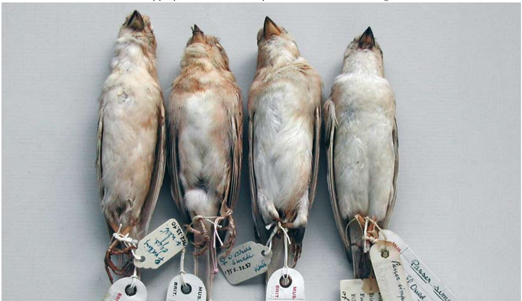
169 Desert Sparrows / Afrikaanse Woestijnmussen Passer simplex , Natural History Museum, Tring, England, February 2007. Ventral comparison of saturation in specimens from range of P s saharae . From left to right: Libya (April), Libya (September), Libya (April) and Algeria (April). Similar variation can be seen in upperparts coloration of specimens from the same regions.