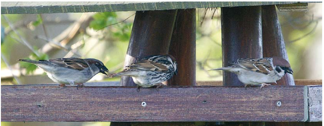
241 Spaanse Mus / Spanish Sparrow Passer hispaniolensis , mannetje (midden), met Huisemus / House Sparrow P. domesticus , mannetje, en Ringmus / Eurasian Tree Sparrow P. montanus , Den Hoorn, Texel, Noord-Holland, 18 april 2009

Oude Stuifdijk op de Maasvlakte, Zuid-Holland. Deze vogel werd dezelfde avond door enkele 10-tallen vogelaars gezien en liet zich de volgende dag gedurende iets meer dan een uur wederom bekijken. Een week later, op 26 en 27 april, volgden nog twee korte waarnemingen (beide met foto) bij de Verzinking, c 1 km van de plek waar hij werd ontdekt. Of het hier uitgezwermde exemplaren van het groepje uit de Eemshaven betrof zal wel altijd een open vraag blijven; de Texelse vogel was echter hemelsbreed op meer dan 150 km en die van de Maasvlakte zelfs op meer dan 250 km ten zuidwesten van de Eemshaven.