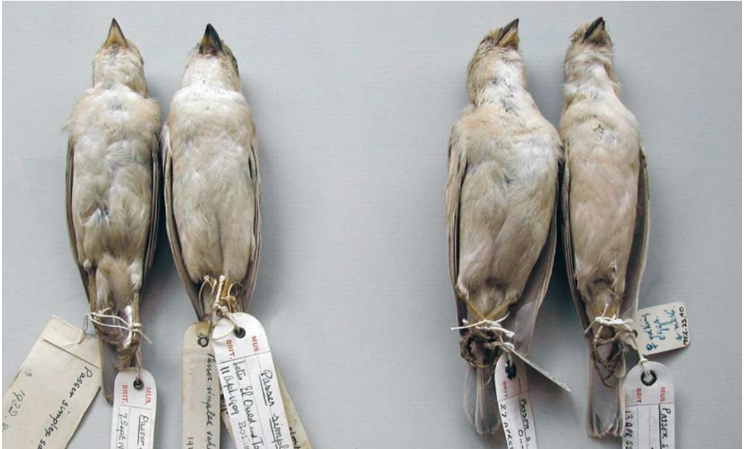
166-167 Desert Sparrows / Afrikaanse Woestijnmussen Passer simplex , females, Natural History Museum, Tring, England, February 2007. Comparison of specimens from ranges generally ascribed to P s simplex and P s saharae , as follows: simplex (Mali, September); saharae (Algeria, April); saharae (Libya, April); and saharae (Libya, April). Note that Mali specimen was originally labelled as saharae , and two Libyan specimens were attributed to simplex . Based on relative saturation of their upperparts and underparts colorations, these attributions appear unsurprising.