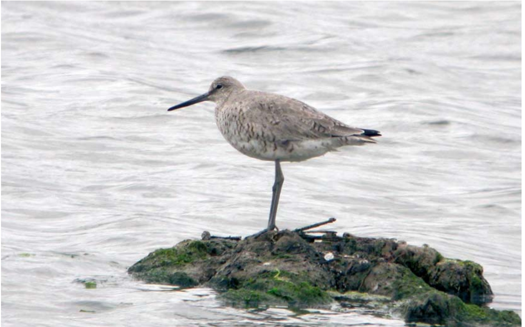
204 Western Willet / Willet Tringa semipalmata inornata , Ribeira das Enguias, Portugal, 29 April 2009 (Alfonso Rocha)