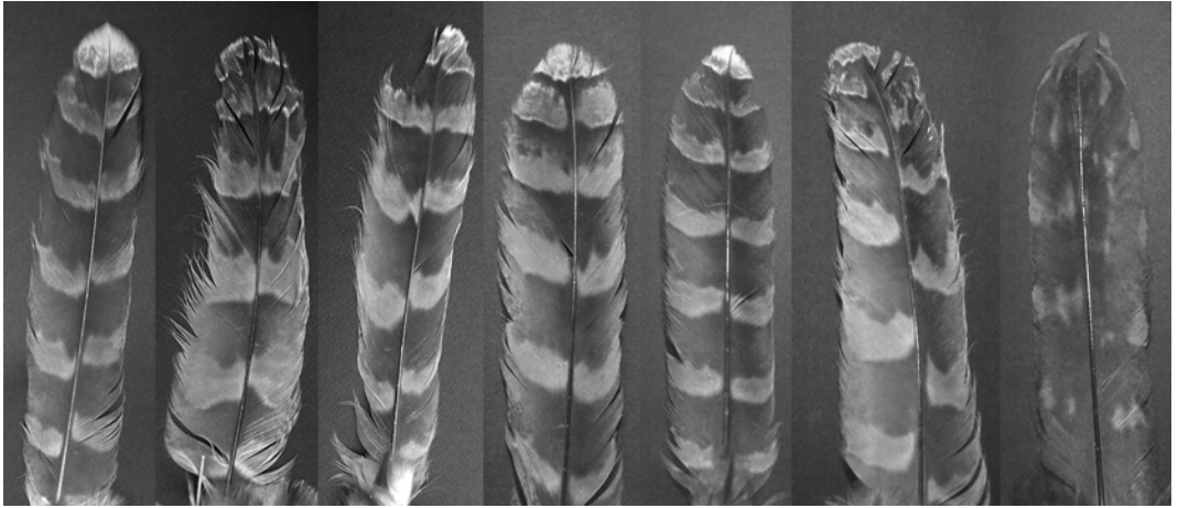
183 Variability of barring pattern on central tail-feathers in Ural Owls Strix uralensis macrourea (Al Vrezec). Note that on the right feather from dark melanistic morph individual barring pattern is greatly reduced due to increase of melanin.

istic birds are the rarest and individuals of the pale morph and grey morph are the most common (table 1). Because the plumage variation from pale