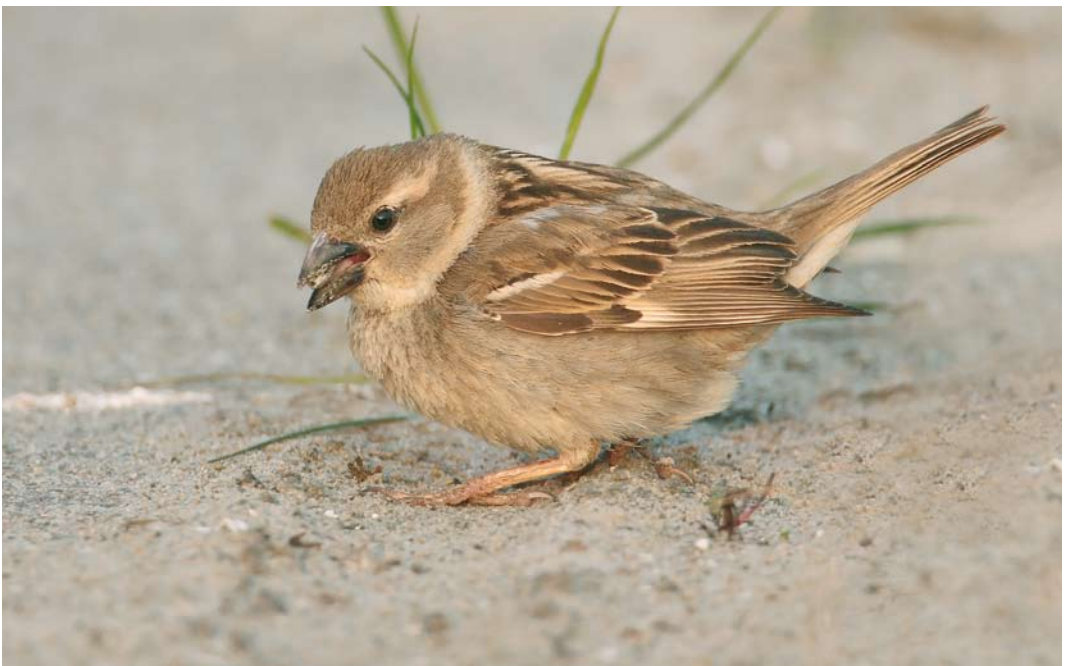
239 Spaanse Mus / Spanish Sparrow Passer hispaniolensis , vrouwtje, Eemshaven, Groningen, 11 april 2009 (Mark Schuurman)