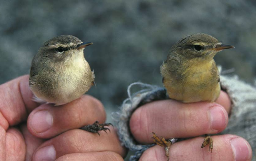
200 Willow Warblers / Fitissen Phylloscopus trochilus , Valassaaret, Finland, September 1995. Both birds were used as mystery bird in the Masters of Mystery competition. The left one was the most difficult mystery bird in 12 years of competition: no entrant identified it correctly.

Raptors (hawks Accipitridae and falcons Falconidae) were chosen 16 times (11%) and gulls Laridae 11 times (8%). Of these most 'popular' families, the mystery photographs of gulls resulted in the lowest percentage of correct answers (on average correctly identified by only 39% of the entrants), whereas the waders were the most easy ones (on average, 54% correct answers). Of the families with more than five mystery photographs, wag-tails Motacillidae (including pipits Anthus ) were the most difficult to identify. On average, only 30% of the entrants managed to identify the mystery photographs of the latter family correctly.