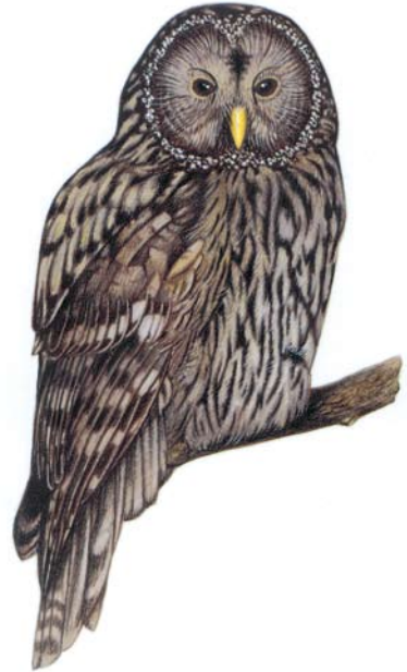
FIGURE 2 Variability of plumage coloration in Carpathian-Dinaric Ural Owls Strix uralensis macroura with four colour morphs: 1 pale morph, 2 grey morph, 3 partially melanistic morph, and 4 melanistic morph (Žarko Vrezec)