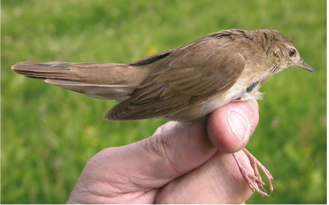
194 Aberrant Savi's Warbler / afwijkende Snor Locustella luscinioides , Korte Waarden, Elburg, Gelderland, Netherlands, 21 June 2008 ( Symen Deuzeman ) 195 Aberrant Savi's Warbler / afwijkende Snor Locustella luscinioides , Korte Waarden, Elburg, Gelderland, Netherlands, 21 June 2008 ( Symen Deuzeman ). Note dark centres of median and lesser coverts and very weak emargination of outer web of p8.