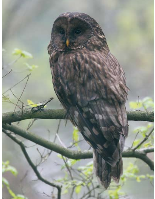
184 Ural Owl / Oeraluil Strix uralensis macroura , central Slovenia, 14 December 2007 (Miha Krofel). Pale morph individual. 185 Ural Owl / Oeraluil Strix uralensis macroura , near Krakow, Poland, 2 May 2008 (Chris van Rijswijk/birdshooting.nl). Partially melanistic morph individual. Appearance of partially melanistic or melanistic morph birds is almost blackish in the field. 186 Ural Owl / Oeraluil Strix uralensis macroura , near Krakow, Poland, 2 May 2008 (Chris van Rijswijk/birdshooting.nl). Grey morph individual.