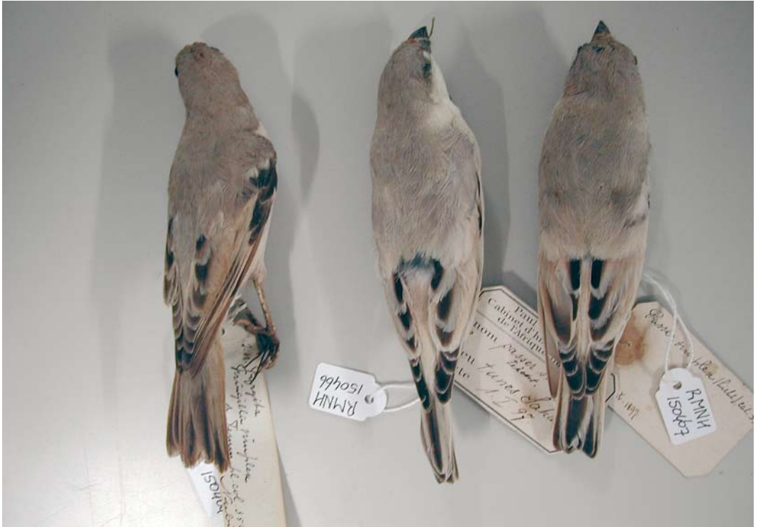
161 Desert Sparrows / Afrikaanse Woestijnmussen Passer simplex , Nationaal Natuurhistorisch Museum Naturalis, Leiden, Netherlands, July 2008 (Guy M Kirwan). Dorsal comparison of male P s simplex (left-hand bird) and P s saharae (right-hand two).