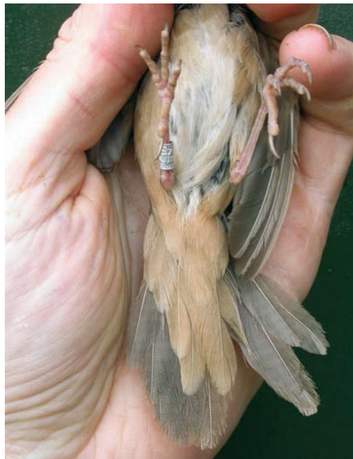
196 Aberrant Savi's Warbler / Snor Locustella luscinioides , Korte Waarden, Elburg, Gelderland, Netherlands, 21 June 2008 (Symen Deuzeman). Note dark instead of white shaft of undertail-coverts. 197 Savi's Warbler / Snor Locustella luscinioides , Zwarte Meer West, Overijssel, Netherlands, 29 June 2008 (Symen Deuzeman). Note white shaft of undertail-coverts. 198 Savi's Warbler / Snor Locustella luscinioides , Castricum, Noord-Holland, Netherlands, 27 August 2007 (André J van Loon). Note unmarked median and lesser coverts.