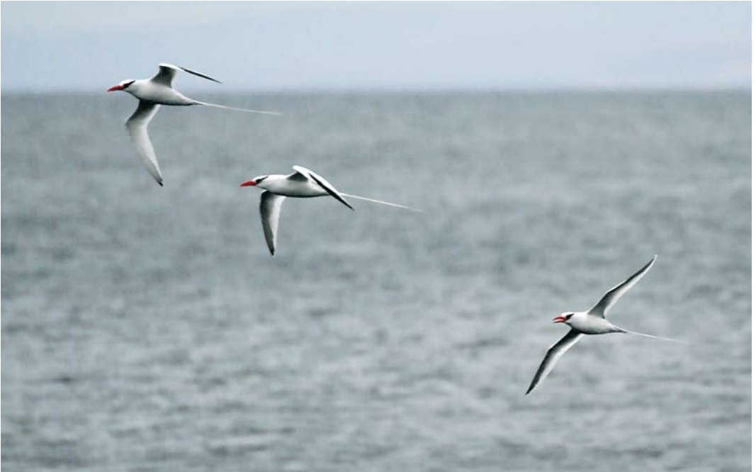
206 Red-billed Tropicbirds / Roodsnavelkeerkringvogels Phaeton aethereus , Puerto del Carmen, Lanzarote, Canary Islands, 26 April 2009 (Francisco Javier García Vargas)