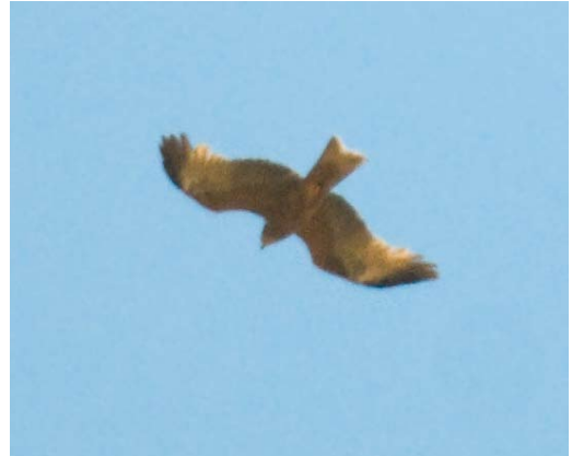
190-191 Yellow-billed Kite / Geelsnavelwouw Milvus aegyptius , Tizi-n-Tichka, High Atlas, Morocco, 8 April 2008

bill is sometimes blackish (Ferguson-Lees & Christie 2005). The possibility of a hybrid Black x Red could be ruled out because, for instance, the bird's features like tail length and underwing pattern, were not intermediate. Dick Forsman (in litt) responded that, judging from the photographs, the bird looked like an eastern African nominate rather than a M a parasitus from central and western Africa. Like our bird, Egyptian birds are redder and more uniformly coloured than western African ones, which are nearer to European Black Kite M m migrans in colour.