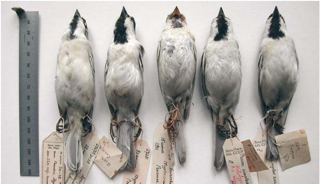
158-160 Zarudny's Sparrows / Zarudny's Woestijnmussen Passer (simplex) zarudnyi, Zoological Institute, Russian Academy of Sciences, St Petersburg, Russia (ZISP), July 2007. All specimens from Repetek, Turkmenistan; from left to right: female, male, female and two males.