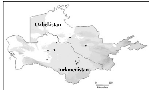
FIGURE 2 Map showing specimen localities for Passer simplex zarudnyi in Turkmenistan and Uzbekistan