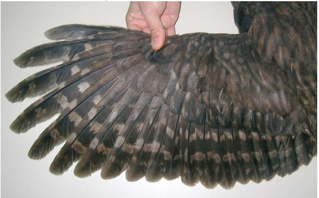
182 Ural Owl / Oeraluil Strix uralensis macroua , Ljubljana, Slovenia, 20 November 2004 ( Al Vrezec ). Wing of melanistic morph. Very dark individual.