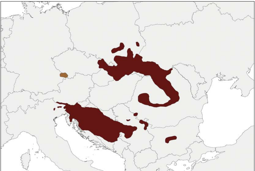
FIGURE 1 Distribution of Carpathian-Dinaric Ural Owl Strix uralensis macroura according to currently available data (population in Bohemian Forest on borders of Austria, Czech Republic and Germany is introduced)

macroura and are therefore regarded as synonyms (Kohl 1977, cf König et al 1999). The Chinese population is also treated as a single subspecies, S u davidi (hereafter davidi ) and, in recent taxonomic studies, has been regarded as a separate species, Sichuan Wood Owl S davidi (eg, del Hoyo et al 1999, König et al 1999), although morphological and bioacoustic studies did not support specific separation from Ural Owl (Scherzinger & Fang 2006). Japanese Ural Owls are the smallest and comprise c three recognized subspecies (cf del Hoyo et al 1999, König et al 1999): S u fuscescens , S u hondoensis (including ' momiyamae ') and S u japonica (König et al 1999 also include japonica in hondoensis ). The other, northern, subspecies are nominate S u uralensis (eastern Russia;