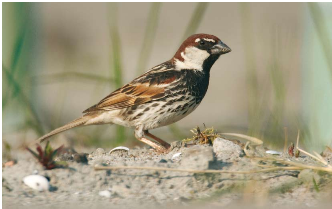
238 Spaanse Mus / Spanish Sparrow Passer hispaniolensis , mannetje, Eemshaven, Groningen, 11 april 2009