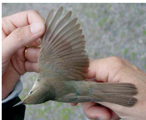
310 Blyth's Reed Warbler / Struikrietzanger Acrocephalus dumetorum , adult male, Espoo, Finland, 30 June 2004