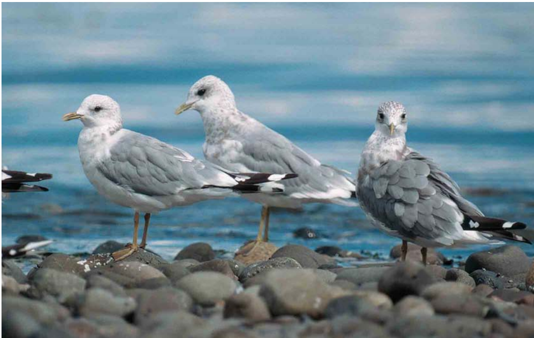
296 Short-billed Gulls / Amerikaanse Stormmeeuwen Larus canus brachyrhynchus , Vancouver Island, British Columbia, Canada, 12 September 1998

Short-billed Gull on Terceira, Azores, in February-March 2003 and identification of the 'Mew Gull complex'