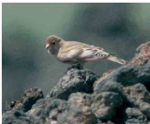
336 Greenish Warbler / Grauwe Fitis Phylloscopus trochiloides , Dobratsch, Kärnten, Austria, 8 June 2007 337 Blue-cheeked Bee-eater / Groene Bijeneter Merops persicus , Muselievo, Bulgaria, 6 June 2007 338 Horned Lark / Strandleeuwerik Eremophila alpestris , Malta, 2 June 2007 339 Mongolian Finch / Mongoolse Woestijnvink Bucanetes mongolicus , Serpmetas, Turkey, 21 May 2007

on 12-26 May, at Sandgerði, Iceland, on 17 June, on South Uist, Outer Hebrides, from 19 June to at least mid-July (a first-summer), and at Fäholmen, Sölvesborg, Blekinge, Sweden, on 1-4 July. In England, a first-summer Laughing Gull L atricilla at Topsham, Devon, until at least 10 June was one of c five this spring. The sixth for Sweden was in Västergötland on 15 May. On 27 May, an adult flew over Helgoland, Schleswig-Holstein, Germany. If accepted, an adult at the Vistula mouth near Gdąnsk on 10 July will be the first for Poland. In Devon, an adult Franklin's Gull L pipixcan was also reported at Topsham on 10 June. A second-summer Audouin's Gull L audouinii briefly at Dungeness, Kent, on 16 May was the third for Britain (the first was at the same site on 5-7 May 2003). The first for Finland was an immature photographed at a dump in Espoo on 24 June. In Cagliari, Sardinia, 60-65 pairs started to breed for the first time in the unlikely envi-