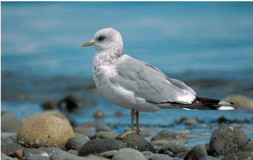
297 Short-billed Gull / Amerikaanse Stormmeeuw Larus canus brachyrhynchus , Vancouver Island, British Columbia, Canada, 12 September 1998 (René Pop)