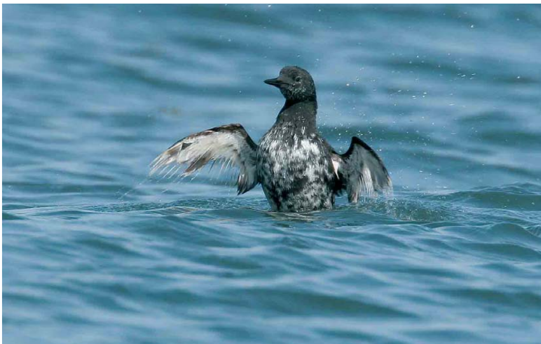
357 Zwarte Zeekoet / Black Guillemot Cepphus grylle , adult, De Val, Zierikzee, Zeeland, 19 mei 2007