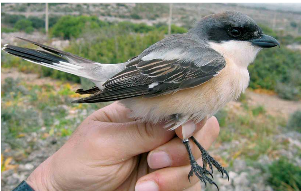
346 Hybrid shrike / hybride klauwier Lanius , Comino, Malta, 27 April 2007 ( Raymond Galea )