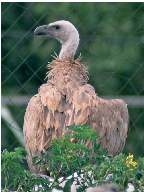
344 Yellow-billed Stork / Afrikaanse Nimmerzat Mycteria ibis , Lake Nasser, Egypt, 23 May 2007 ( Dick Hoek )