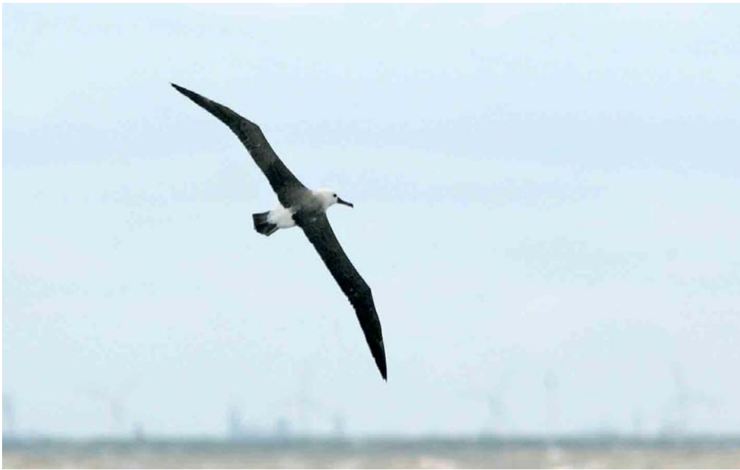
326-327 Atlantic Yellow-nosed Albatross / Atlantische Geelneusalbatros Thalassarche chlororhynchos , off Malmö, Skåne, Sweden, 8 July 2007