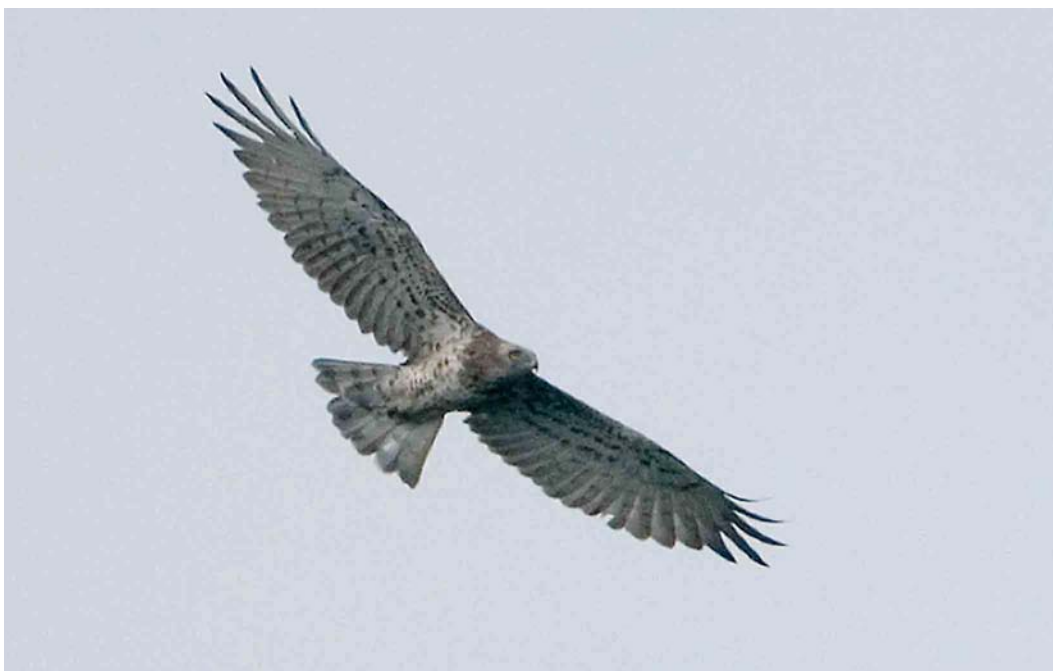
356 Slangenarend / Short-toed Eagle Circaetus gallicus , Fochteloërveen, Friesland, 13 juni 2007 (Roland Jansen)