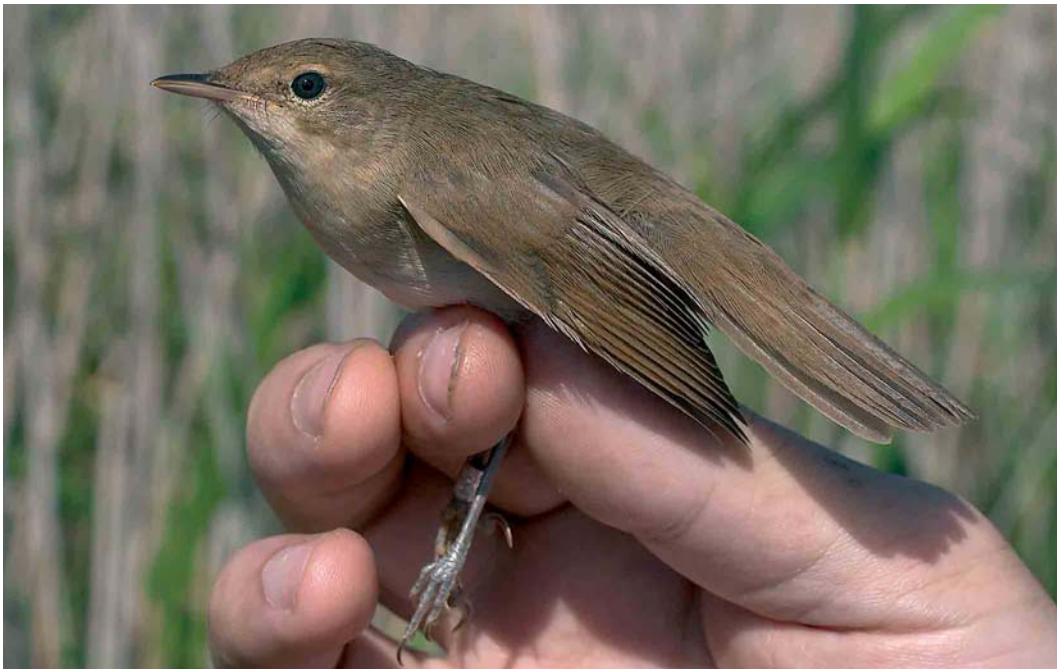
316 Blyth's Reed Warbler / Struikrietzanger Acrocephalus dumetorum , first-year, Espoo, Finland, 7 August 2004 (Annika Forsten & Antero Lindholm)