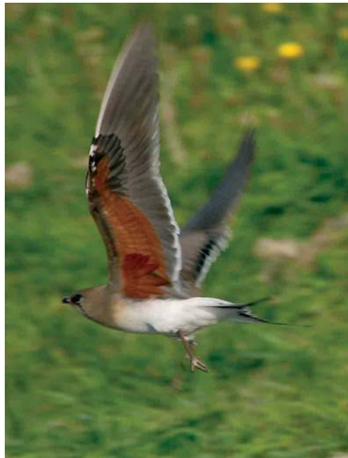
347 Stone-curlew / Griel Burhinus oedicnemus , Düne, Helgoland, Schleswig-Holstein, Germany, 13 May 2007 (Roef Mulder) 348 Collared Pratincole / Vorkstaartplevier Glareola pratincola , Annagh Head, Mayo, Ireland, 8 June 2007 (Paul & Andrea Kelly/irishbirdimages.com) 349 Basra Reed Warblers / Basrakarekieten Acrocephalus griseldis , adult, Lehavot Habashan, Israel, 19 June 2007 (Itai Shanni)