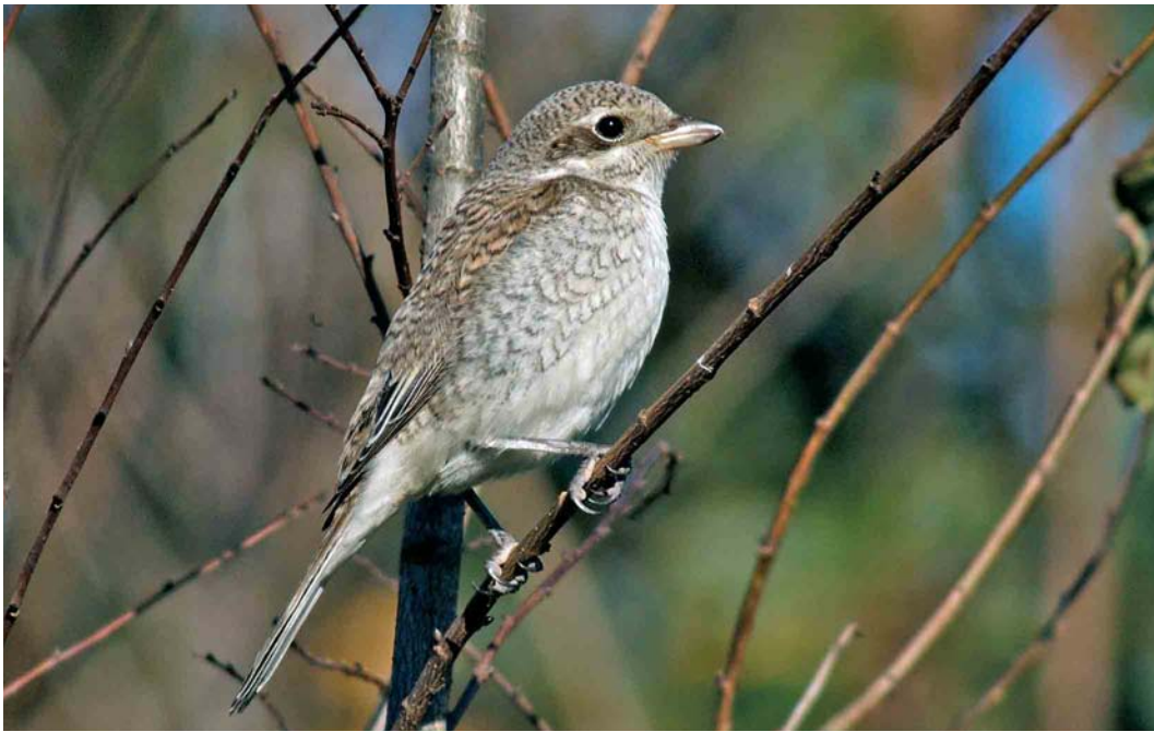
319 Red-backed Shrike / Grauwe Klauwier Lanius collurio , juvenile, Texel, Noord-Holland, Netherlands, 4 October 2005