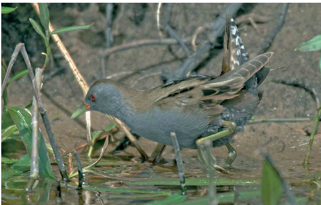
341 Little Crake / Klein Waterhoen Porzana parva , Burrafirth, Unst, Shetland, Scotland, 10 June 2007