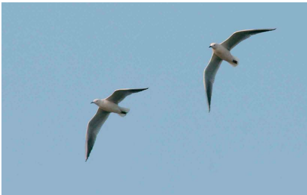
301 Dunbekmeeuwen / Slender-billed Gulls Larus genei , adult en tweede-zomer, Enkhuizen, Noord-Holland, 6 mei 2006 (Michel Veldt)

gen (Ebels et al 2006). De waarneming werd onlangs (mei 2007) ingediend bij de CDNA en is nog in behandeling. In de vroege avond van 17 mei werd gedurende c 30 min een eerste-zomer Dunbekmeeuw gezien bij Den Oever, Noord-Holland. Deze waarneming is kort na de waarneming ingediend en eveneens nog in behandeling bij de CDNA.