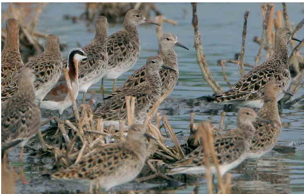
340 Wilson's Phalarope / Grote Franjepoot Phalaropus tricolor , adult female, with Ruffs / Kemphanen Philomachus pugnax , Szabadszallas, Kiskunsagi national park, Hungary, 24 May 2007