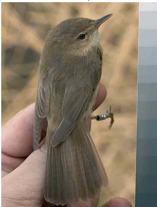
313 European Reed Warbler / Kleine Karekiet Acrocephalus scirpaceus , adult, Espoo, Finland, 13 August 2006 (Annika Forsten & Antero Lindholm). Same bird as in plate 315.