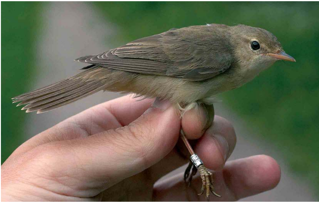
314 Marsh Warbler / Bosrietzanger Acrocephalus palustris , adult, Espoo, Finland, 7 June 2006 (Annika Forsten & Antero Lindholm)