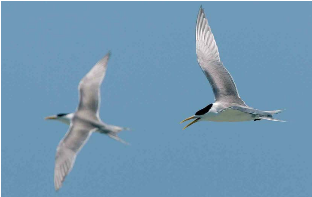
342 Greater Crested Terns / Grote Kuifsterns Sterna bergii , adult, El Gouna, Egypt, 14 May 2007 (Edwin Winkel)