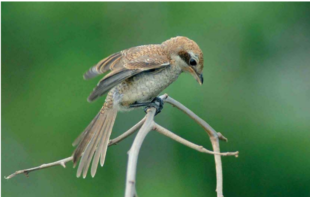
320 Brown Shrike / Bruine Klauwier Lanius cristatus , juvenile, Chilbaldo, South Korea, 20 June 2007