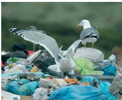
300 American Herring Gull / Amerikaanse Zilvermeeuw Larus smithsonianus , adult, Flores, Azores, 27 December 2005. Note distinctive wing pattern with long grey tongue on all primaries (although not visible on p10 here), broad white tongue-tip on p8, small mirror on p9, obvious black 'bayonet' on p7-8, complete black subterminal band on p10, and W-shaped black marking on p5-6.