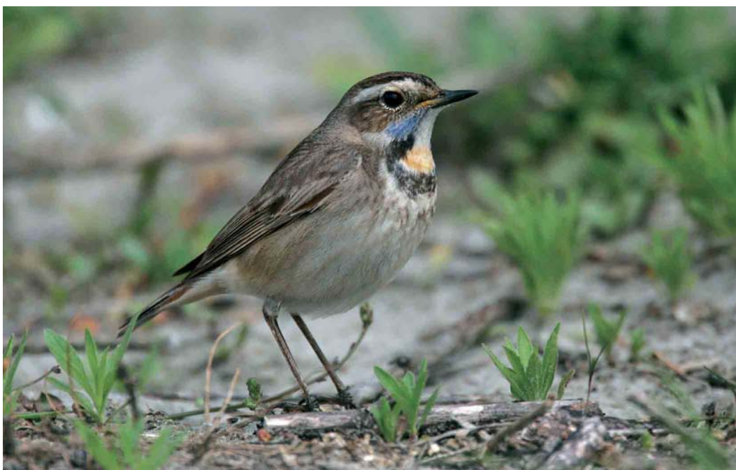
378 Blauwborst / Bluethroat Luscinia svecica , Maasvlakte, Zuid-Holland, 26 mei 2007 (Chris van Rijswijk)