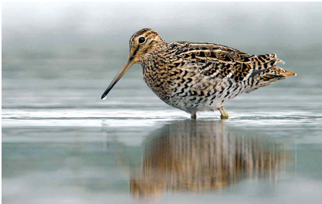
384 Poelsnip / Great Snipe Gallinago media , adult, Elen, Limburg, 6 mei 2007 (Vincent Legrand)