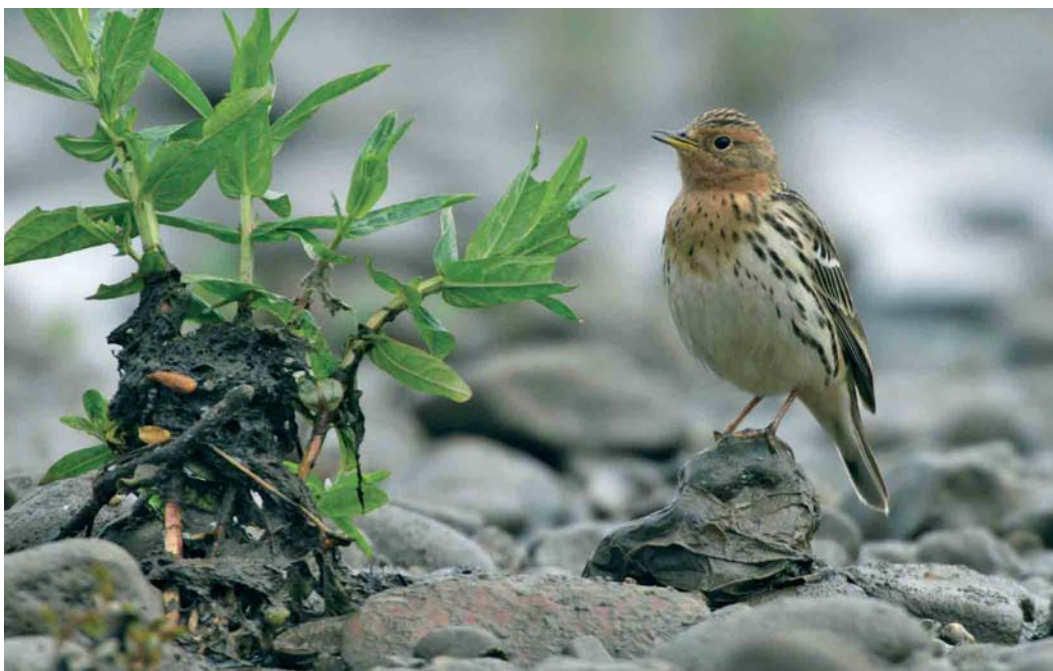
377 Roodkeelpieper / Red-throated Pipit Anthus cervinus , Itteren, Limburg, 6 mei 2007