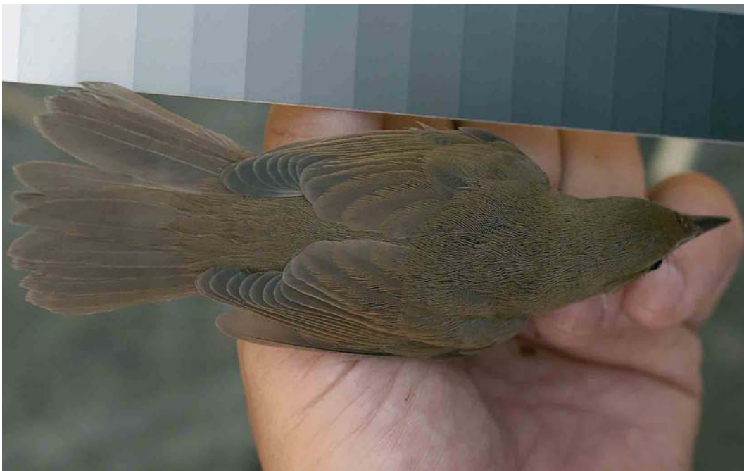
317 Blyth's Reed Warbler / Struikrietzanger Acrocephalus dumetorum , first-year, Espoo, Finland, 5 August 2006