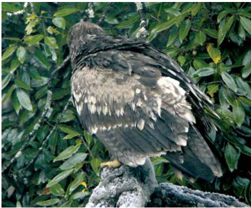
Mystery photograph VII (December)

Red-backed (8%), others for Brown (11%) and, surprisingly, about 22% for Woodchat Shrike L senator . Entrants with the latter solution were probably confused by the pale-centred median wing-coverts of the mystery bird. However, juvenile Woodchat should appear rather grey (and not reddish-brown) and would show grey vermiculated upperparts, much more pale scapulars and a rather stout bill.