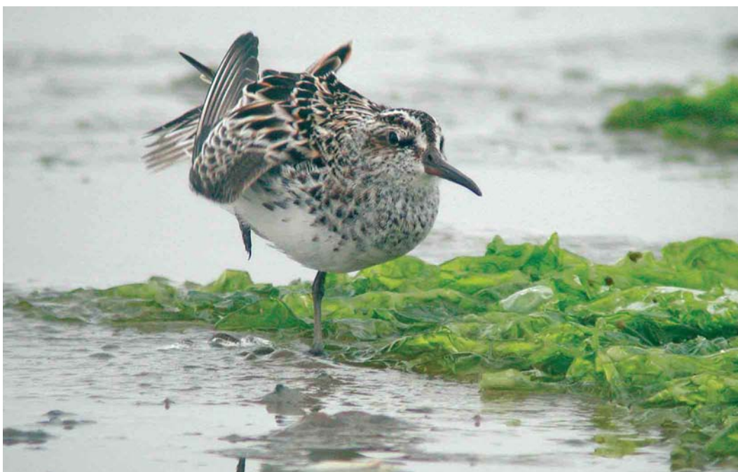
376 Breedbekstrandloper / Broad-billed Sandpiper Limicola falcinellus , Slikken van Flakkee, Zuid-Holland, 17 mei 2007