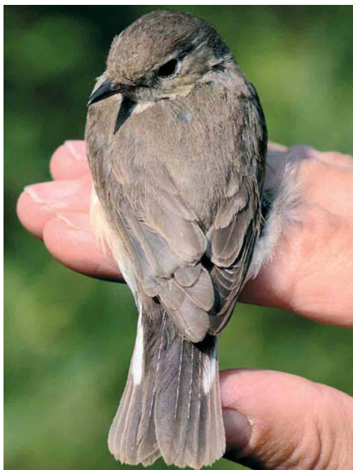
391 Kleine Vliegenvanger / Red-breasted Flycatcher Ficedula parva , tweede-kalenderjaar vrouwtje, Groene Glop, Schiermonnikoog, Friesland, 8 juni 2007 (Henk Luten & Jan Westera)

RED-BREASTED FLYCATCHER On 8 June 2007, a second calendar-year female Red-breasted Flycatcher Ficedula parva with a brood patch was trapped on Schiermonnikoog, Friesland, the Netherlands. This is a very strong indication that the bird was breeding or had attempted to breed on the island. In the same period, a singing adult male was found at a distance of 2.5 km. In 2006, another albeit weaker indication of the species' breeding on Schiermonnikoog was the presence of two first-year birds with remnants of the spotted juvenile body plumage trapped at the same site on 26 August and 10 September. However, an origin outside Schiermonnikoog of these two immature birds can not be excluded. Although possible or probable breeding of Red-breasted Flycatcher in the Netherlands has been reported several times in the past, there is still no confirmed and properly documented breeding record.