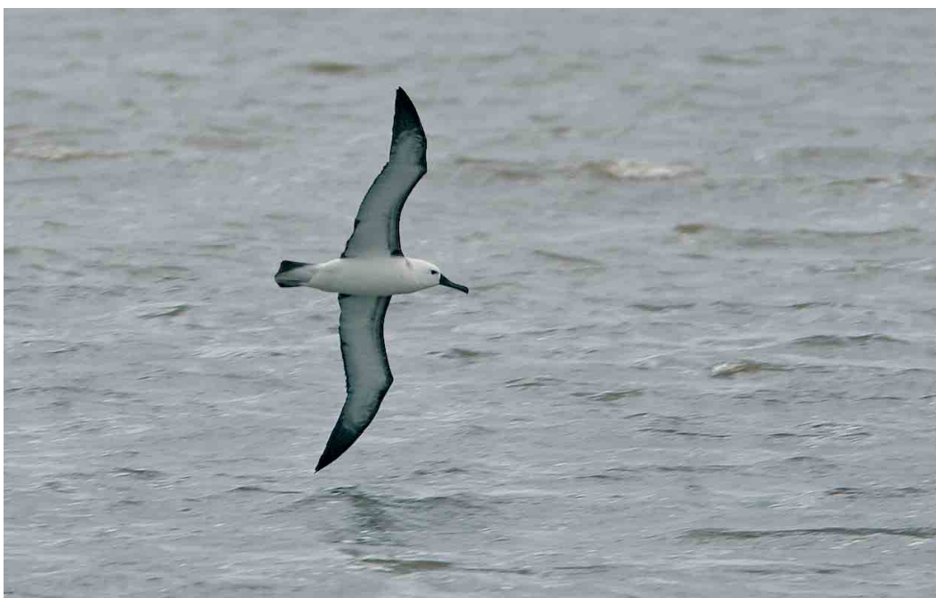
325 Atlantic Yellow-nosed Albatross / Atlantische Geelneusalbatros Thalassarche chlororhynchos , off Malmö, Skåne, Sweden, 8 July 2007 (Kristian Ståhl)