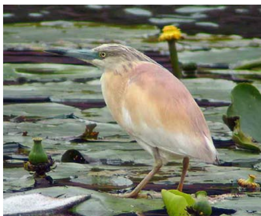
361 Witvleugelstern / White-winged Tern Chlidonias leucopterus , Veenoordkolk, Deventer, Overijssel, 16 mei 2007 362 Witvleugelstern / White-winged Tern Chlidonias leucopterus , Waverhoek, Utrecht, 16 mei 2007 363 Amerikaanse Wintertaling / Green-winged Teal Anas carolinensis , Philipsdam, Zeeland, 8 mei 2007 364 Ralreiger / Squacco Heron Ardeola ralloides , adult, Nieuwerbrug, Zuid-Holland, 27 juni 2007 365 Ralreiger / Squacco Heron Ardeola ralloides , adult, Schipluiden, Zuid-Holland, 29 mei 2007 366 Ralreiger / Squacco Heron Ardeola ralloides , adult, Diemen, Noord-Holland, 23 juni 2007