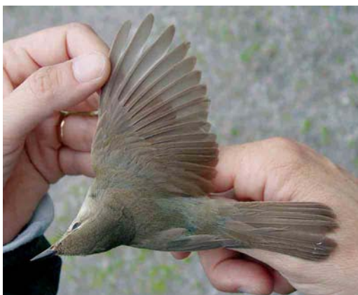
310 Blyth's Reed Warbler / Struikrietzanger Acrocephalus dumetorum , adult male, Espoo, Finland, 30 June 2004