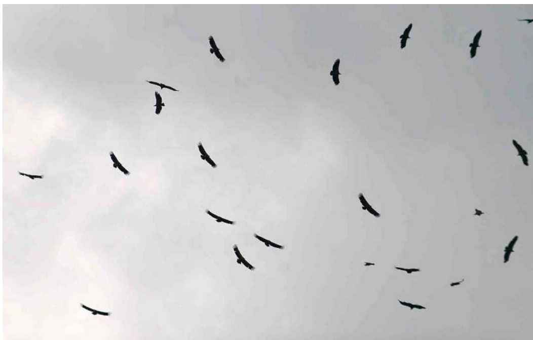
390 Vale Gieren / Eurasian Griffon Vultures Gyps fulvus , Zuidzande, Zeeland, 18 juni 2007

het er zeker 20 waren maar anderen kwamen – naar later bleek – die avond al tot 33. De volgende ochtend, woensdag 19 juni, bezocht ik het gebied opnieuw en koos weer positie in de Brandstraat vanwaar een aantal vogels in de gaten kon worden gehouden. Tegen 10:00 begonnen ze in zuidelijke richting weg te vliegen en de teller kwam op 41 of 42 exemplaren; later die dag waren er in Noord-Brabant waarnemingen van 33 bij Sint-Oedenrode en kleinere aantallen langs Eindhoven. Eén exemplaar bij Oss bleef tot in de avond achter maar bleek een dag later eveneens verdwenen. Ook de vogels van Oss kregen massale belangstelling van bijna alle denkbare actualiteitenprogramma's op televisie.