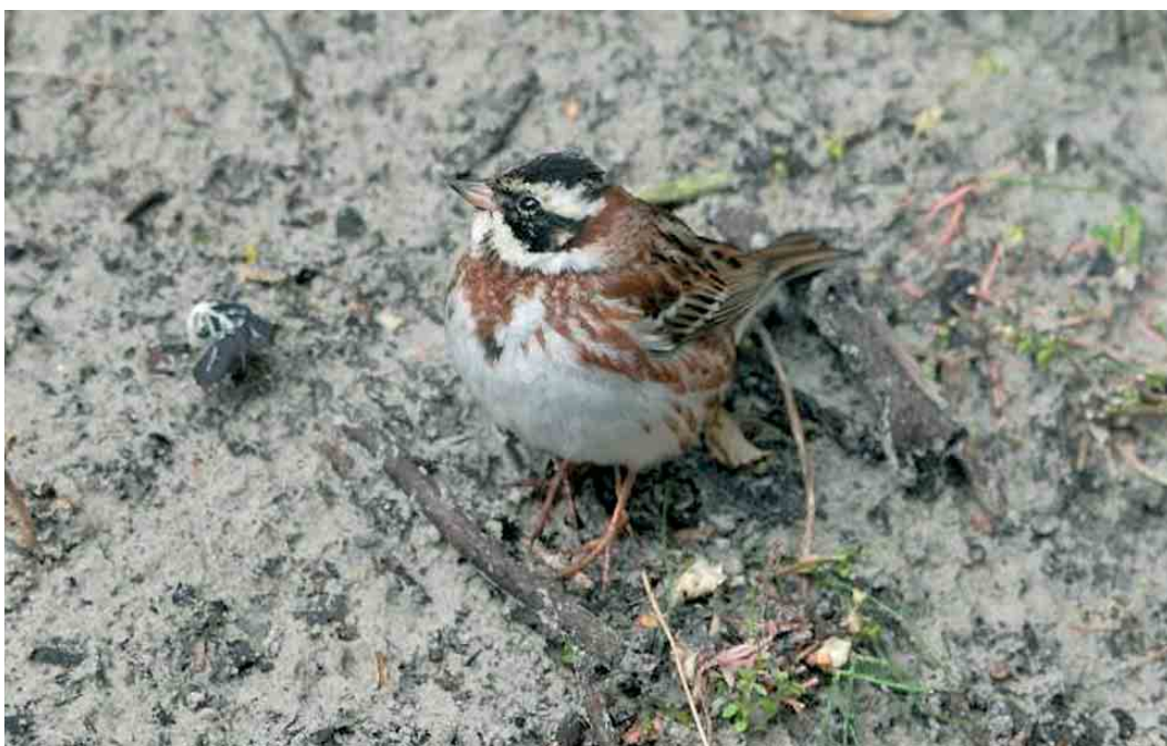
382 Bosgors / Rustic Bunting Emberiza rustica , mannetje, Rottumerplaat, Groningen, mei 2007 (Hans Roersma)