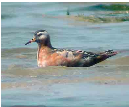
367 Arendbuizerd / Long-legged Buzzard Buteo rufinus , Vlieland, Friesland, 20 mei 2007 368 Amerikaanse Goudplevier / American Golden Plover Pluvialis dominica , Slufter, Texel, Noord-Holland, 26 mei 2007 369 Blonde Ruiters / Buff-breasted Sandpiper Tryngites subruficollis , Slikken van Flakkee, Zuid-Holland, 27 juni 2007 370 Rosse Franjepoot / Red Phalarope Phalaropus fulicarius , Den Helder, Noord-Holland, 15 mei 2007

grafeerd langs Breskens. Later die dag werd de soort gemeld bij de Sliedrechtse Biesbosch, Zuid-Holland. Op 18 en 20 mei werd er één gefotografeerd op Vlieland, Friesland. Op 6 mei werden fraaie foto's gemaakt van een overtrekkende arend Aquila bij Budel-Dorplein, Noord-Brabant, die aanvankelijk als Schreeuwarend A pomarina werd gedetermineerd maar bij nader inzien misschien toch meer kenmerken vertoonde van een ' fulvescens ' Bastaardarend A clanga . Zoals gewoonlijk waren er weer eens meer of minder overtuigende meldingen van Dwergarenden A pen-nata , en wel op 5 mei over Valkenburg, Limburg, en de Ooijpolder, Gelderland; op 21 mei bij Loenen, Utrecht; op 30 mei bij Mijdrecht, Utrecht; op 17 juni over Leiderdorp, Zuid-Holland; en op 19 juni over Ermelo, Gelderland, en Hilversum, Noord-Holland. Van 1 tot 12 mei werden maximaal vier Roodpootvalken Falco vespertinus gezien in het Fochteloërveen. Daarnaast