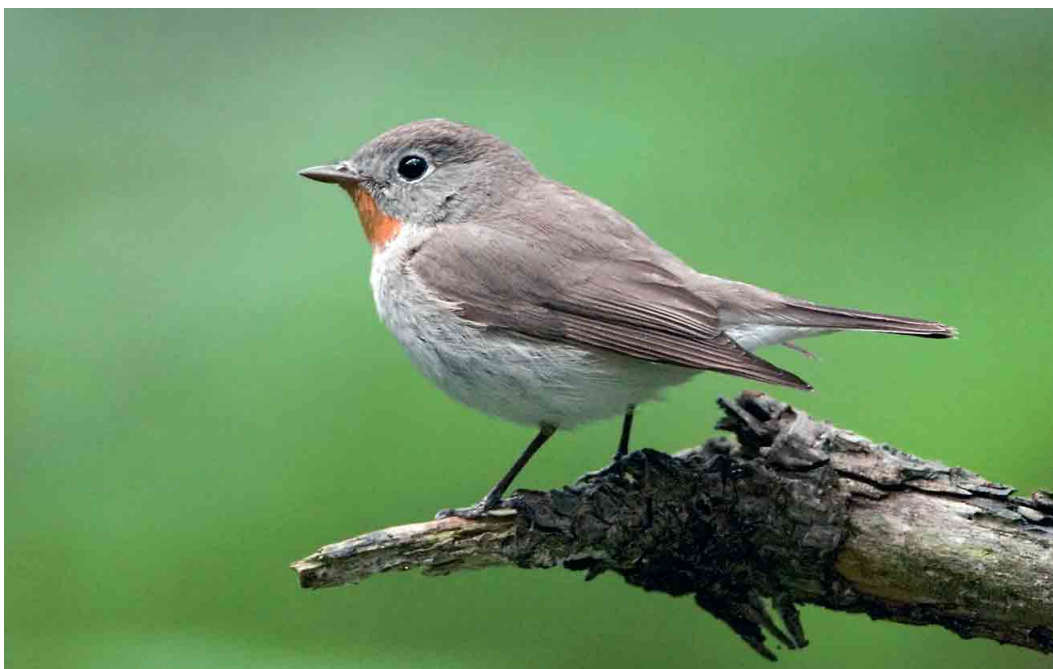
381 Kleine Vliegenvanger / Red-breasted Flycatcher Ficedula parva , mannetje, Tweede Dennenbos, Schiermonnikoog, Friesland, 26 mei 2007