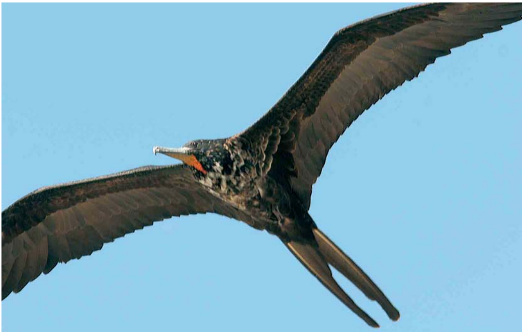
322 Magnificent Frigatebird / Amerikaanse Fregatvogel Fregata magnificens , immature, Pochotal, Costa Rica, 19 December 2006 (Mark Zekhuis). Note characteristic pale and dark striped pattern of axillaries.