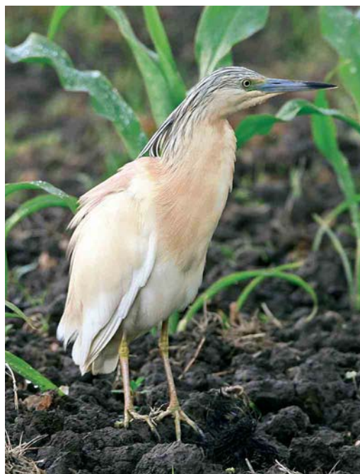
358 Groene Reiger / Green Heron Butorides virescens , Zijkanaal H-weg, Amsterdam, Noord-Holland, 1 juni 2007 359 Ralreiger / Squacco Heron Ardeola ralloides , adult, Wieringen, Noord-Holland, 17 juni 2007 360 Ralreiger / Squacco Heron Ardeola ralloides , adult, Watergraafsmeer, Amsterdam, Noord-Holland, 22 juni 2007