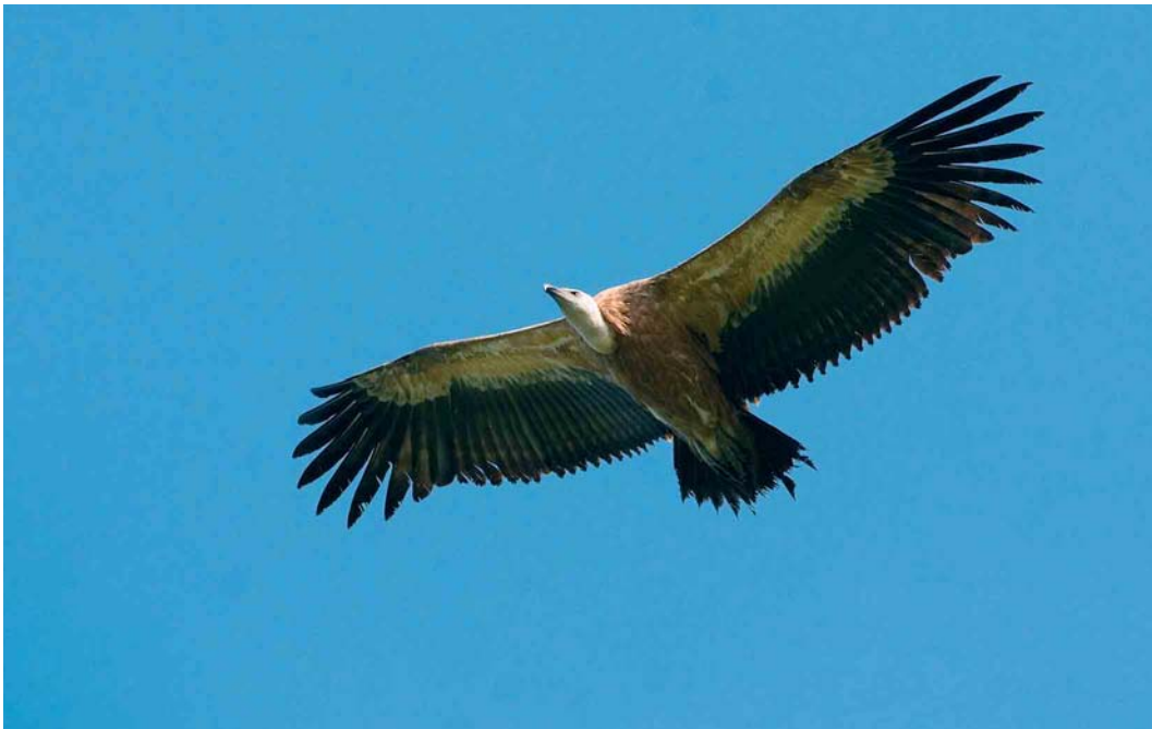
354 Vale Gier / Eurasian Griffon Vulture Gyps fulvus , Oss, Noord-Brabant, 19 juni 2007 (Jankees Schwiebbe)