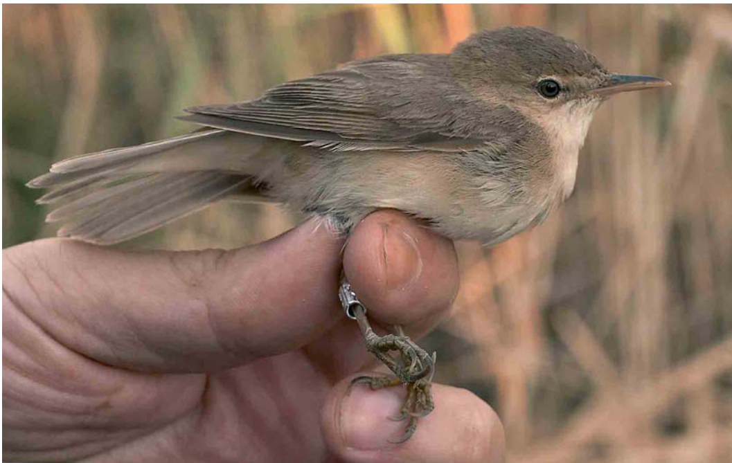
315 European Reed Warbler / Kleine Karekiet Acrocephalus scirpaceus , adult, Espoo, Finland, 13 August 2006. Same bird as in plate 313.