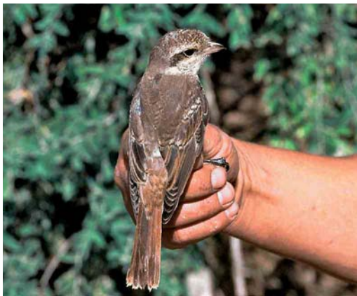
318 Turkestan Shrike / Turkestaanse Klauwier Lanius phoenicuroides , juvenile moulting to first-winter plumage, Chokpak pass, Kazakhstan, September 2003 (Arend Wassink)

brown colours are visible. Daurian is, therefore, safely excluded as possible solution.