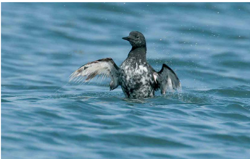
357 Zwarte Zeekoet / Black Guillemot Cepphus grylle , adult, De Val, Zierikzee, Zeeland, 19 mei 2007