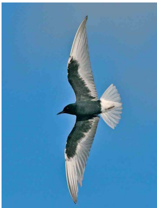
350 Iraq Babbler / Iraakse Babbelaar Turdoides altirostris , juvenile, Birecik, Sanliurfa, Turkey, 22 May 2007 ( Mike Crewe ) 351 White-winged Tern / Witvleugelstern Chlidonias leucopterus , Nordkehdingen, Niedersachsen, Germany, 17 May 2007 ( Stefan Pützke ) 352 Hybrid Black x Common Redstart / hybride Zwarte x Gekraagde Roodstaart Phoenicurus ochruros x phoenicurus , Godovic, Slovenia, 8 May 2007 ( Dare Šere ) 353 Blyth's Reed Warbler / Struikrietzanger Acrocephalus dumetorum , Vallø, Køge, Sjælland, Denmark, 30 June 2007 ( Henrik Knudsen )