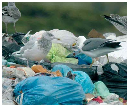
298-299 American Herring Gull / Amerikaanse Zilvermeeuw Larus smithsonianus , adult, with Atlantic Yellow-legged Gull / Atlantische Geelpootmeeuw L. michahellis atlantis , adult, Flores, Azores, 27 December 2005. Note broad necklace of brown, dense and transverse texture contrasting with pale grey upperparts. In plate 299, also note pale bill colour, thin dark smudge in front of eye and flat forehead.