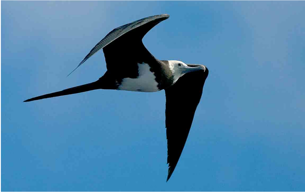
321 Ascension Frigatebird / Ascensionfregatvogel Fregata aquila , immature, Ascension Island, 7 April 2006. Note entirely white axillaries.