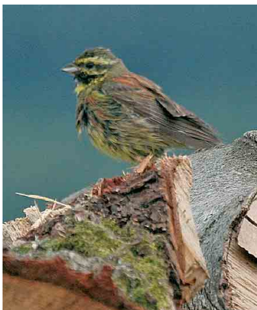
385 Buidelmees / Eurasian Penduline Tit Remiz pendulinus , Zeebrugge, West-Vlaanderen, 13 juni 2007 (Johan Buckens) 386 Veldrietzanger / Paddyfield Warbler Acrocephalus agricola , Heist, West-Vlaanderen, 12 juni 2007 (Johan Buckens) 387 Cirlgors / Cirl Bunting Emberiza cirlus , mannetje, Treignes, Mazée, Namur, 3 juni 2007 (Vincent Legrand) 388 Cirlgors / Cirl Bunting Emberiza cirlus , mannetje, Treignes, Mazée, Namur, 3 juni 2007 (Marc Ameels)

van een kleuring. In De Fonteintjes in Zeebrugge werd op 3 mei een langstreckende Lachstern Gelochelidon nilotica opgemerkt. Op 1 juni was een Reuzenster Hydroprogne caspia aanwezig in de Voorhaven van Zeebrugge en op 23 juni vloog er één over de Watersportbaan in Gent. In de Voorhaven van Zeebrugge werden vanaf 23 mei regelmatig Dougalls Sterns Sterna dougallii gezien, waarvan de meeste gekleuringd bleken, en in totaal waren het er minstens negen! Op 12 mei verschenen de eerste twee Witwangsters Chlido-