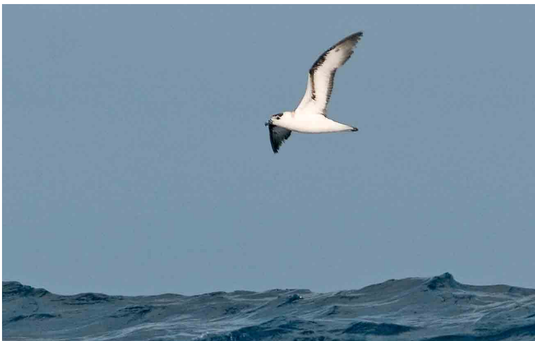
324 Black-capped Petrel / Zwartkapstormvogel Pterodroma hasitata , c 16 km south-east off Graciosa, Azores, 26 May 2007