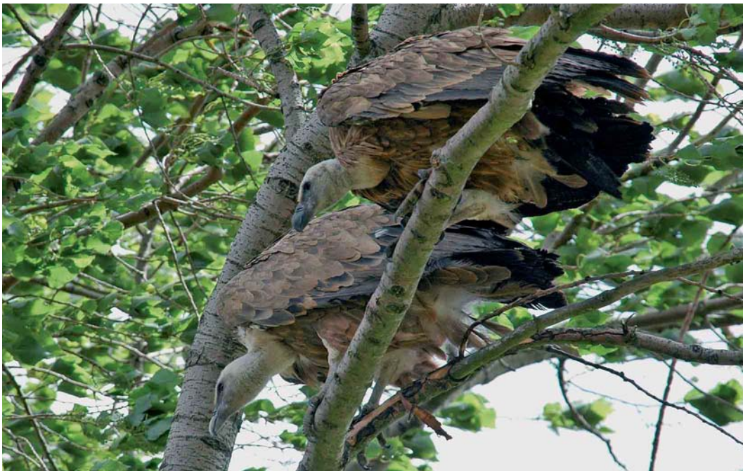
355 Vale Gieren / Eurasian Griffon Vultures Gyps fulvus , Driewegen, Zeeland, 26 juni 2007 (René M van Loo)