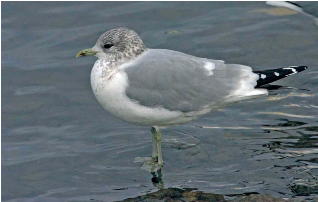
294-295 Common Gull / Stormmeeuw Larus canus canus , adult, Nimmo's Pier, Galway, Ireland, 2 February 2007 (Killian Mullarney)

Short-billed Gull on Terceira, Azores, in February-March 2003 and identification of the 'Mew Gull complex'