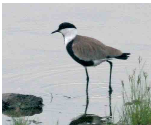
328 Black Scoter / Amerikaanse Zee-eend Melanitta americana , male, Jenny Brown's Point, Silverdale, Lancashire, England, 16 May 2007 ( Jim Beattie ) 329 Black-capped Petrel / Zwartkapstormvogel Pterodroma hasitata , c 16 km south-east off Graciosa, Azores, 26 May 2007 ( Killian Mullarney/The Sound Approach ) 330 White-tailed Lapwing / Witstaartkievit Vanellus leucurus , Caerlaverock, Dumfries and Galloway, Scotland, 6 June 2007 ( Adrian Kettle ) 331 Spur-winged Lapwing / Sporenkievit Vanellus spinosus , Mandra lake, Bulgaria, 23 May 2007 ( James Lidster )

Germany was a second-year over Lebrade, Schleswig-Holstein, on 27 May (the previous one was at Kreis Viersen, Nordrhein-Westfalen, on 12 April). In 2006, 136 pairs of Lesser Kestrel Falco naumanni with 225 fledglings were counted in Crau, Bouches-du-Rhône, France, where only 30-60 pairs were present in the 1990s. The 12th for Sweden was a female in Västerbotten on 10 May. If accepted, a Saker Falcon F cherrug at Korppoo on 4 June will be the second for Finland. A calling but not sound-recorded Sora Porzana carolina at Salo, Halikonlahti, on 2 June will be the first for Finland, if accepted. The third Little Crane P parva for Shetland was at Burrafirth, Unst, from at least 29 May through June.