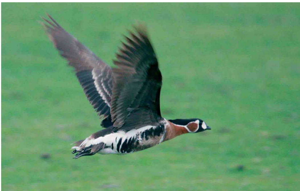
375 Roodhalsgans / Red-breasted Goose Branta ruficollis , Texel, Noord-Holland, 24 juni 2007