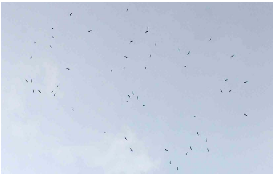
383 Vale Gieren / Eurasian Griffon Vultures Gyps fulvus , Nederename, Oudenaarde, Oost-Vlaanderen, 17 juni 2007

16 juni, toen tenminste 18 exemplaren hoog over Ruisbroek, Antwerpen, vlogen. Op 17 juni werd meteen de omvang van de invasie duidelijk toen eerst 55 over Virelles trokken, waarna een massieve 'bel' van 94 werd ontdekt en gefotografeerd boven Nederename, Oost-Vlaanderen. De meeste belangstelling ging naar overnachtende groepen van 64 in Ursel, Oost-Vlaanderen, van 17 op 18 juni en van 34 in Meerbeke, Oost-Vlaanderen, van 18 op 19 juni. Een overzicht van de waarnemingen is materie voor een uitgebreider artikel maar wel is al duidelijk dat tussen 18 en 26 juni naar schatting c 200 vogels zijn waargenomen. Ze verschenen in alle provincies maar Oost-Vlaanderen werd het beste bedeed. De gegevens die na de mediabelangstelling kwamen zijn moeilijk op betrouwbaarheid in te schatten; verschillende ingezonden waarnemingen betroffen Buizerds Buteo buteo ... Bij Antoing, Hainaut, werd op 17 mei een Slangenarend Circaetus gallicus gezien. Op 15 juni was er een waarneming in Het Hageven in Neerpelt, gevolgd door een tweede op 23 juni. Op 19 juni vloog er één laag over Engsbergen, Limburg. Een zeer waarschijnlijk vrouwtje Steppiekiekendief Circus macrourus vloog op 19 juni over Mortsel, Antwerpen. Mei was goed voor 27 Grauwe Kiekendieven C. pygargus . Een Bastaard- of Schreeuwend Aquila clanga/pomarina vloog op 3 mei over Roeselare, West-Vlaanderen. Een lichte vorm Dwergarend A. pennata die op 5 mei over Wezel, Antwerpen, vloog kon kort daarop worden onderschept boven de