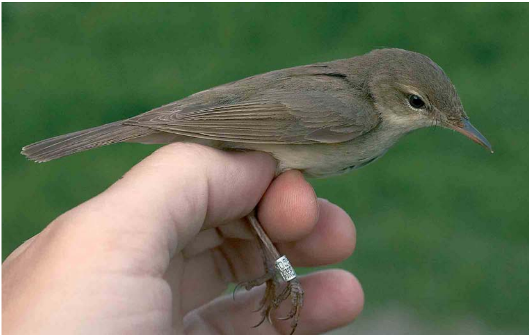
311 Blyth's Reed Warbler / Struikrietzanger Acrocephalus dumetorum , adult male, Espoo, Finland, 21 May 2006 (Annika Forsten & Antero Lindholm)