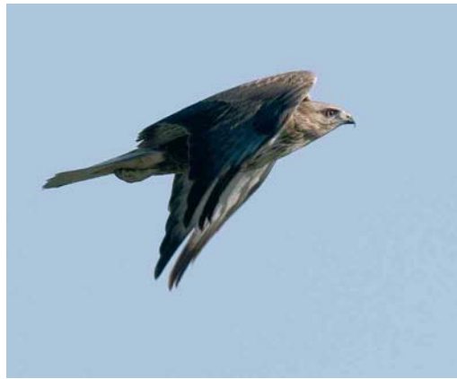
Mystery photograph VIII (January)

In Magnificent Frigatebird, immature and adult females and immature males are easily distinguished from Ascension Frigatebird and Lesser Frigatebird by the pattern on the axillaries. The latter two species show entirely white axillaries, sometimes referred to as 'spurs' (cf plate 321). These may appear as extensions of the white breast patches of young and female birds. Magnificent, however, only shows pale fringes to these feathers creating a characteristic pale and dark striped