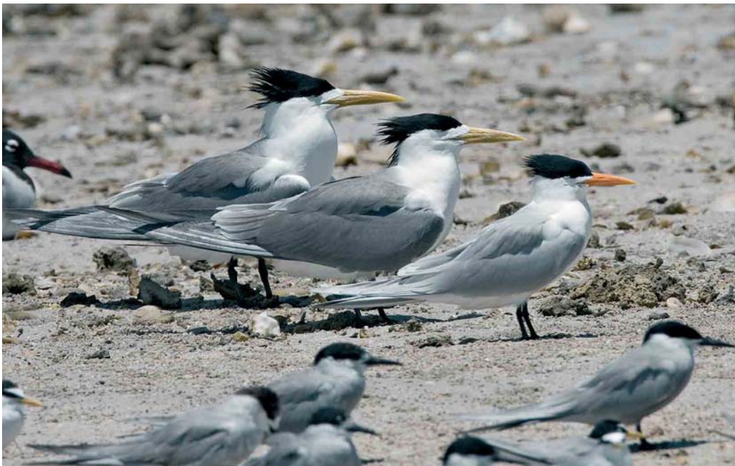
343 Greater Crested Terns / Grote Kuifsterns Sterna bergii , adult, with Lesser Crested Tern / Bengaalse Stern S. bengalensis , White-cheeked Terns / Arabische Sterns S. repressa , Little Terns / Dwergsterns Sternula albifrons and White-eyed Gull / Witoogmeeuw Larus leucophthalmus , El Gouna, Egypt, 14 May 2007 (Edwin Winkel)