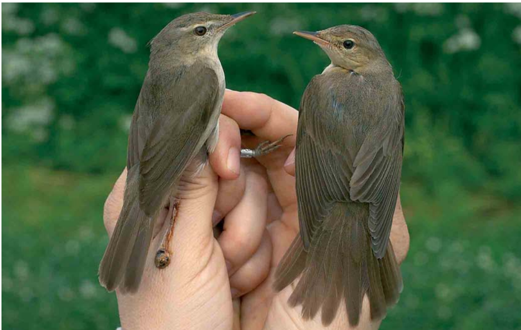
312 Blyth's Reed Warbler / Struikrietzanger Acrocephalus dumetorum (left) and Marsh Warbler / Bosrietzanger A palustris , adult males, Espoo, Finland, 18 June 2005 (Annika Forsten & Antero Lindholm)