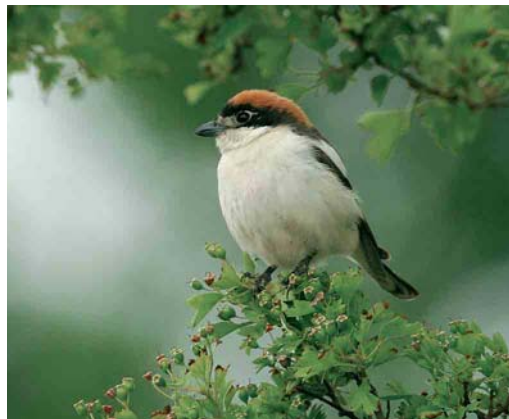
371 Bijeneters / European Bee-eaters Merops apiaster , Kollumerwaard, Friesland, 16 mei 2007 372 Roodstuitzwaluw / Red-rumped Swallow Cecropis daurica , Koarnwertersân, Friesland, 13 mei 2007 373 Roodkopklauwier / Woodchat Shrike Lanius senator , Colijnsplaat, Zeeland, 31 mei 2007 374 Roodkopklauwier / Woodchat Shrike Lanius senator , Colijnsplaat, Zeeland, 31 mei 2007

over de Maasvlakte, Zuid-Holland; en op 19 juni mogelijk in Meijndel, Zuid-Holland. Een Steppevorkstaartplevier Glareola nordmanni verbleef vanaf 21 juni tot 5 juli bij Exloo, Drenthe. Op Texel verbleven tot 5 mei maximaal 14 Morinelplevieren Charadrius morinellus . Daarna volgden er tot 20 mei nog 22 op andere plekken in het land en was er een laat exemplaar van 6 tot 9 juni in de Kennemerduinen, Noord-Holland. Amerikaanse Goudplevieren Pluvialis dominica werden opgemerkt op 26 mei bij De Slufter op Texel, op 26 en 27 mei in de Workumerwaard, Friesland, en op 15 juni in De Brekken. Verspreid over de periode werden 11 Gestreepte Strandlopers Calidris melanotos aangetroffen. Er werd eenzelfde aantal Breedbekstrandlopers Limicola falcinellus opgemerkt, vrijwel allemaal in mei en voornamelijk langs de Waddenkust. De laatste twee werden waargenomen op 1 juni in de Ezumakeeg. Op 27 juni liep een Blonde Ruiter Tryngites subruficollis op