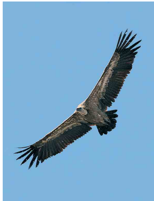
389 Vale Gier / Eurasian Griffon Vulture Gyps fulvus , Oss, Noord-Brabant, 19 juni 2007

dag voor vogelaars van buiten Zeeland geen situatie voor dat je 'kon gaan rijden' op een groep pleisterende gieren en naarmate het later werd had ik (Co van der Wardt) wat dat betreft de hoop al vrijwel opgegeven. Tegen 20:30 belde WJ echter dat er een melding was van c 20 mogelijke Vale Gieren die zich op dat moment zouden bevinden langs de Brandstraat in Geffen, Noord-Brabant. De Brandstraat is nog geen 15 min rijden van mijn huis in Vinkel. Bij aankomst op de plek stonden er al groepjes buurtbewoners te kijken en vrijwel direct vielen de 'witte bontkragen' op die her en der in de bomen te zien waren. Ik kon WJ dus goed nieuws doorbellen dat hij vervolgens verder wereld- kundig maakte. Ik had nog net tijd om met een onder- gaande zon wat foto's te maken. Ter plekke – er was inmiddels een behoorlijke groep mensen gearriveerd – hoorde ik hoe het allemaal gegaan was. Een aantal 'grote vogels' was geland in een paar bomen in de wei- landen aan de Brandstraat en omgeving. Een familie die daar woont zag dat en consulteerde de Vogelwerkgroep Oss. Die ondernamen actie en zo bereikte het bericht uiteindelijk ook WJ. Hoeveel het er nu precies waren was moeilijk te zeggen. Ze zaten behoorlijk verspreid over het gebied en wisten zich in sommige bomen goed te verstoppen. We dachten dat