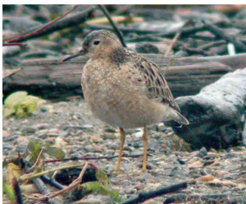
332 Spotted Sandpiper / Amerikaanse Oeverloper Actitis macularia , Århus, Jylland, Denmark, 18 May 2007 (Martin Søgaard Nielsen) 333 Caspian Plover / Kaspische Plevier Charadrius asiaticus , Eilat, Israel, 1 May 2007 (Otto Plantema) 334 Hudsonian Whimbrel / Amerikaanse Regenwulp Numenius hudsonicus , Walney Island, Cumbria, England, July 2007 (Steve Young/Birdwatch) 335 Buff-breasted Sandpiper / Blonde Ruitr Tryngites subruficollis , Rheindelta, Austria, 28 May 2007 (Ernst Albeegger)

first Red-necked Stint C ruficollis for Spain was reported at Guadalhorce ponds, Málaga, on 15 May and the third for Norway was an adult at Orreosen, Klepp, Rogaland, on 27-28 June. If accepted, a Temminck's Stint C temminckii at Grímsey on 7 June will be the first for Iceland. The first Long-toed Stint C subminuta for Finland and c 10th for the WP was an adult at Salminlahti, Kotka, on 26-28 June. In May-June 2004, up to four breeding attempts of Pectoral Sandpiper C melanotos occurred in Scotland of which three were on different islands in the Outer Hebrides and one (ie, a pair in display in early June and an adult accompanying a very fresh juvenile in early July) was on the north-eastern mainland (Br Birds 100: 321-367, 2007). On 22 May, the eighth Sharp-tailed Sandpiper C acuminata for Norway turned up at Ekkerøy, Vadsø, Finnmark. The seventh for the Netherlands was an adult at Rockanje, Zuid-Holland, on 14 July. In England, a