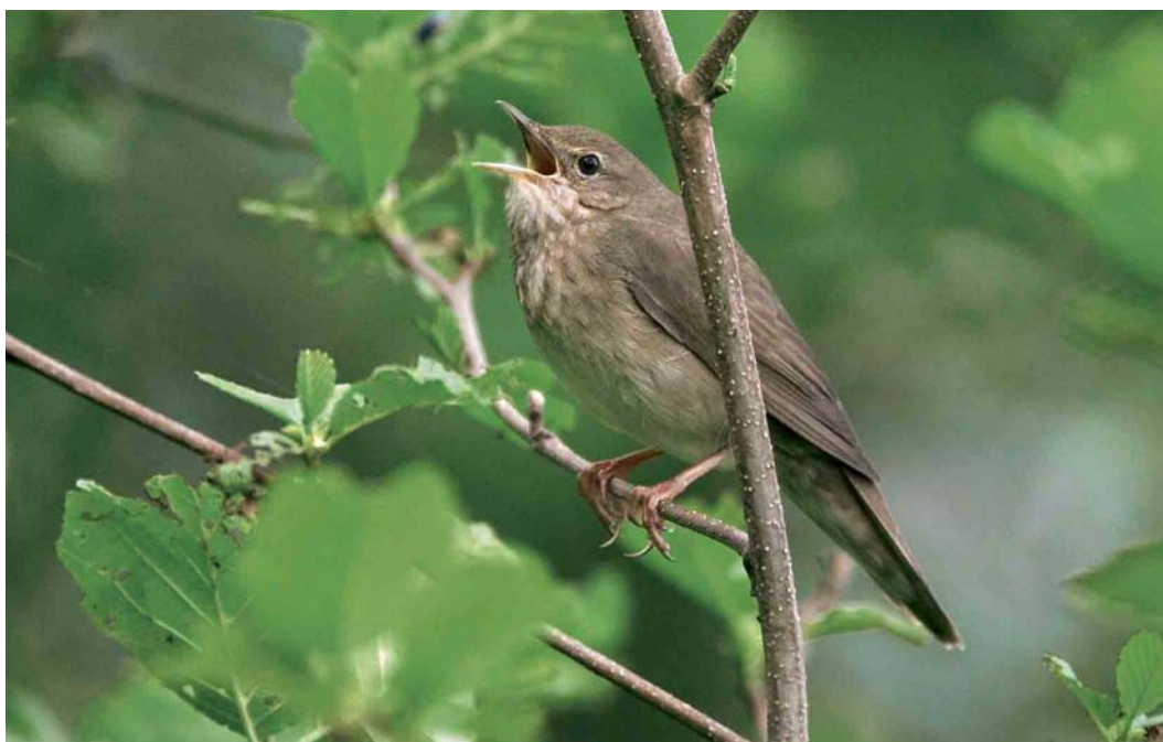
380 Kregelzanger / River Warbler Locustella fluviatilis , Kollumerwaard, Lauwersmeer, Friesland, 15 mei 2007