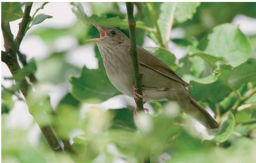
379 Kregelzanger / River Warbler Locustella fluviatilis , Brunssum, Limburg, 19 mei 2007 (Ran Schols)