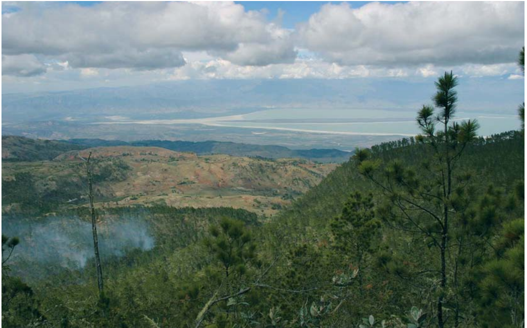
132 Breeding habitat of Hispaniolan Crossbill Loxia megaplaga , Sierra de Bahoruco, Dominican Republic, 15 March 2004. Deforestation is visible in the background, which is Haitian territory.

species could be elevated to species status as well – and maybe even with better credentials. Prevailing taxonomic treatments were challenged further when research in North America (Groth 1988, 1993, cf Sangster 1996) revealed that nine different vocal types of Common Crossbill found in North America did not correspond with the seven appointed subspecies in that region and that each vocal type could in theory represent a 'cryptic species'. Research on the other side of the Atlantic Ocean (Robb 2000), indicated that at least six different vocal types also exist in the Palearctic region – all within populations that are presumed to be part of the nominate subspecies L. c. curvirostra . This suggests that further research may eventually lead to the recognition of more crossbill taxa (mainly based on vocal differences) and that upgrading of known subspecies or even currently unnamed taxa to species level may be anticipated. The 'break-down' of formerly polytypic species into two or more separate species has also affected Two-barred Crossbill. Once