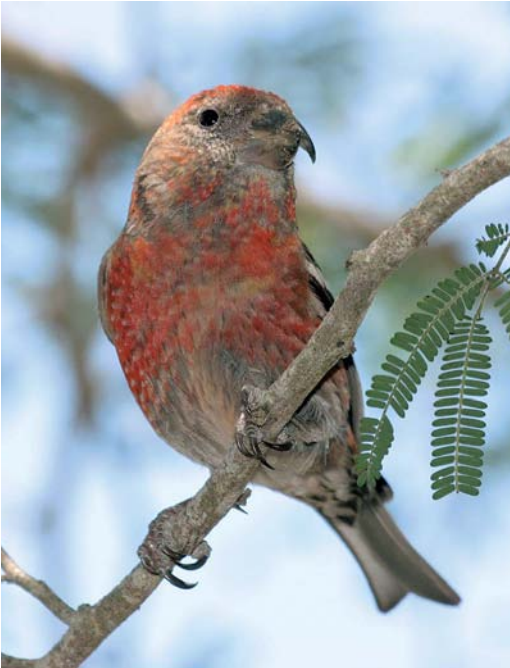
137 Hispaniolan Crossbill / Hispaniolakruisbek Loxia megaplaga , adult male, Sierra de Bahoruco, Dominican Republic, 16 March 2004