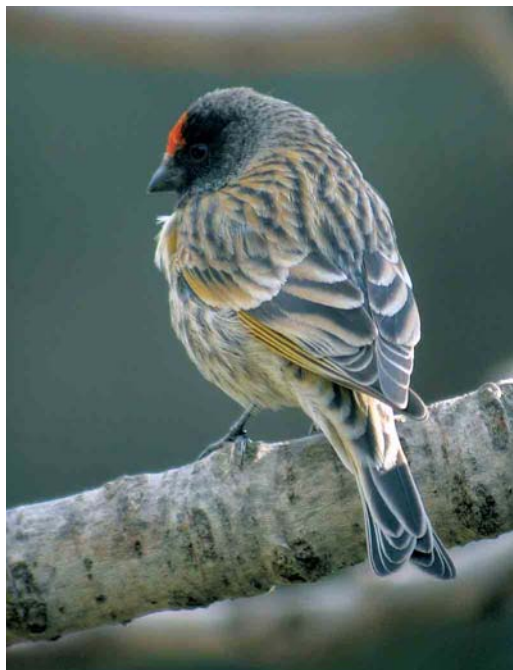
152 Daurian Shrike / Daurische Klauwier Lanius isabellinus , Eilat, Israel, 8 February 2006 (Wouter Puyk) 153 Red-fronted Serin / Roodvoorhoofdkanarie Serinus pusillus , Rosh Pinna, Israel, 4 January 2006 (Tomer Landsberger) 154 Black-throated Thrush / Zwartkeellijster Turdus atrogularis , male, Swansea, Glamorgan, Wales, 4 March 2006 (Andrew Lawson)