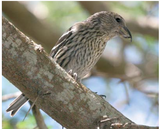
139-140 Hispaniolan Crossbill / Hispaniolakruisbek Loxia megaplaga , immature male, Sierra de Bahoruco, Dominican Republic, 16 March 2004 (Leo J R Boon/Cursorius) 141 Hispaniolan Crossbill / Hispaniolakruisbek Loxia megaplaga , juvenile, Sierra de Bahoruco, Dominican Republic, 16 March 2004 (Leo J R Boon/Cursorius) 142 Hispaniolan Crossbill / Hispaniolakruisbek Loxia megaplaga , juvenile, Sierra de Bahoruco, Dominican Republic, 16 March 2004 (Leo J R Boon/Cursorius)

long bill with long projecting mandible tips, quite different from the long but much finer bill of White-winged Crossbill and Two-barred Crossbill. Hispaniolan shares the white wing-bars (formed by the tips of the median and greater coverts) with these two taxa. In Hispaniolan, however, the bars are not quite as broad – the greater covert bar is often very restricted – and run more or less parallel, while in the other two taxa the bars run at different angles (ie, there is a greater size difference between the inner and outer greater coverts). Juveniles are mainly brownish grey and heavily streaked, especially on the underparts. Females are mainly grey with greenish yellow on breast, throat, rump and (in a variable amount) head and mantle and faint