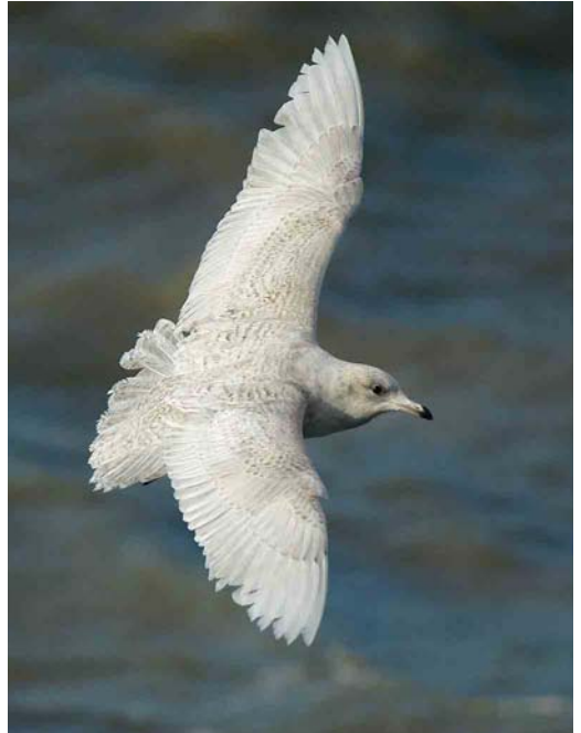
166 Pontische Meeuw / Caspian Gull Larus cachinnans , eerste-winter, IJmuiden, Noord-Holland, 3 februari 2006 167 Kleine Burgemeester / Iceland Gull Larus glaucooides , eerste-winter, Scheveningen, Zuid-Holland, 24 februari 2006 168 Roodbuikwaterspreeuw / Red-bellied Dipper Cinclus cinclus aquaticus , De Hamert, Limburg, 19 februari 2006