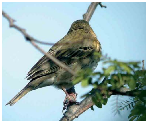
Mystery photograph IV (May)

dark crown or crown-side and a contrasting supercilium, which are both absent in the mystery bird. Zitting Cisticola can also be ruled out as it shows more contrasting pale lines on the mantle. In addition, it does not show such a primary projection as the mystery bird.