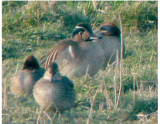
155 Lappet-faced Vulture / Oorgier Torgos tracheliotus , Muscat, Oman, 3 February 2006 ( Adrian Jordi ) 156 Grey-headed Gull / Grijskopmeeuw Larus cirrocephalus , Zira, Banc d'Arguin, Mauritania, 11 January 2006 ( Chris Batty ) 157 Kittlitz's Plover / Herdersplevier Charadrius pecuarius , adult, West Sehel, Aswan, Egypt, 5 February 2006 ( Dick Hoek ) 158 Three-banded Plover / Driebandplevier Charadrius tricollaris , adult, West Sehel, Aswan, Egypt, 27 January 2006 ( Dick Hoek ) 159 Sociable Lapwing / Steppekievit Vanellus gregarius , Sohar, Oman, 30 January 2006 ( Adrian Jordi ) 160 Baikal Teal / Siberische Taling Anas formosa , male, with Common Teals / Wintertalingen A. crecca , male, Belfast Lough, Down, Northern Ireland, 29 January 2006 ( Andrea Kelly/irishbirdimages.com )