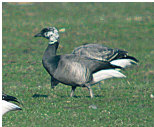
129 Dark-bellied Brent Goose / Rotgans Branta bernicla , adult with extensive white flecking on head, Banckspolder, Schiermonnikoog, Friesland, Netherlands, 1 April 2005 (Enno B Ebels)

white parts in the rest of the plumage. Outside the Netherlands, a similarly looking bird with a largely white head with dark forehead and loreal region was photographed near South Fambridge, Essex, England, on 11 February 2005.