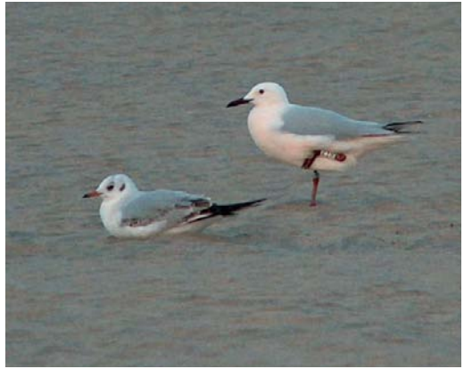
93 Slender-billed Gull / Dunbekmeeuw Larus genei , adult, Préverengues, Vaud, Switzerland, 10 May 2001 ( Lionel Maumary ) 94 Slender-billed Gull / Dunbekmeeuw Larus genei , second calendar-year, Les Grangettes, Vaud, Switzerland, May 1998 ( Lionel Maumary ) 95 Slender-billed Gull / Dunbekmeeuw Larus genei , adult, with Black-headed Gulls / Kokmeeuwen L. ridibundus , Pori, Satakunta, Finland, May 1993 ( Hannu Kettunen ) 96 Slender-billed Gull / Dunbekmeeuw Larus genei , adult, with Black-headed Gull / Kokmeeuw L. ridibundus , Playa de Sotavento, Fuerteventura, Canary Islands, 22 March 2004 ( Michiel Versluys )

to select the most suitable breeding site (Oro 2002). This is another cause for the high breeding site turnover in this species, which is confirmed by several ringing programmes.