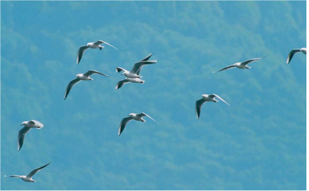
97 Slender-billed Gulls / Dunbekmeeuwen Larus genei , adults, Les Grangettes, Vaud, Switzerland, 14 May 1997 (Jean-Marc Fivat)