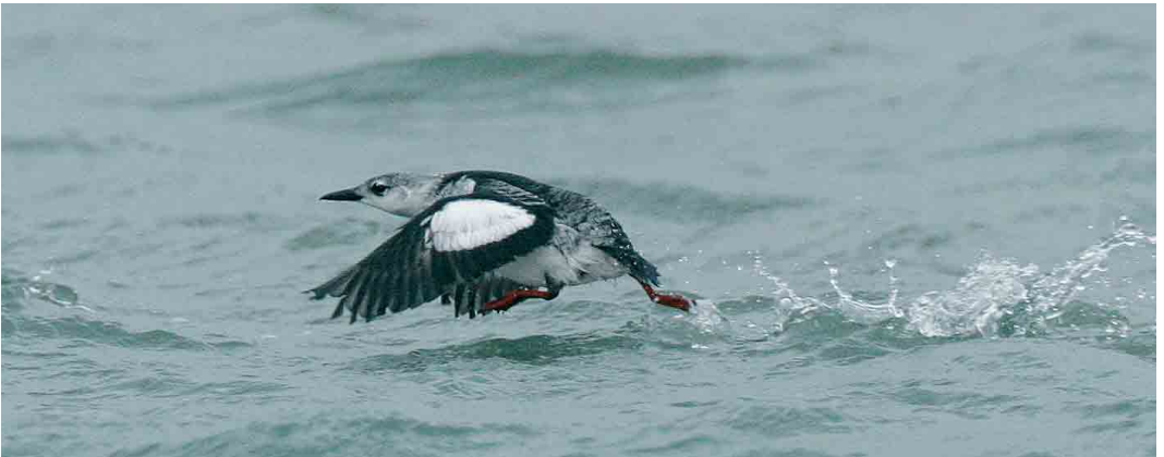
163 Zeearend / White-tailed Eagle Haliaeetus albicilla , adult, Oostvaardersplassen, Flevoland, 27 februari 2006 164 Middelste Bonte Specht / Middle Spotted Woodpecker Dendrocopos medius , Eindhoven, Noord-Brabant, 3 maart 2006 165 Zwarte Zeekoet / Black Guillemot Cephus grylle , NIOZ-haven, Texel, Noord-Holland, 21 januari 2006

Zee, Noord-Holland. Van 11 locaties werden Witoog-eenden A nyroca gemeld. Tot 22 januari zwommen er één en soms twee vrouwtjes Ringsnaveleend A collaris bij Budel-Dorplein, Noord-Brabant. Een Brilzee-eend Melanitta perspicillata werd weer eens opgemerkt vanuit een vliegtuigje tijdens zeevogeltellingen en wel op 16 februari in het Brouwershavensche Gat, Zeeland. Het adulte mannetje Buffelkopeend Bucephala albeola van de Gaatkensplas bij Barendrecht, Zuid-Holland, liet zich daar tot 18 februari bewonderen. Een andere op 10 en 14 januari op het Gooimeer bij Huizen, Noord-Holland, bleek (op basis van een kleuring) dezelfde als degene die daar vorige winter verbleef. Mogelijk hetzelfde exemplaar werd vanaf 2 januari tot in maart regelmatig in het Naardermeer, Noord-Holland, waargenomen maar liet daar zijn ring (nog) niet zien... Er waren meldingen van Bronskopeenden Anas falcata op 1 januari bij Oost-Maarland, Limburg, en op 19 februari in de Koornwaard bij Gewande,