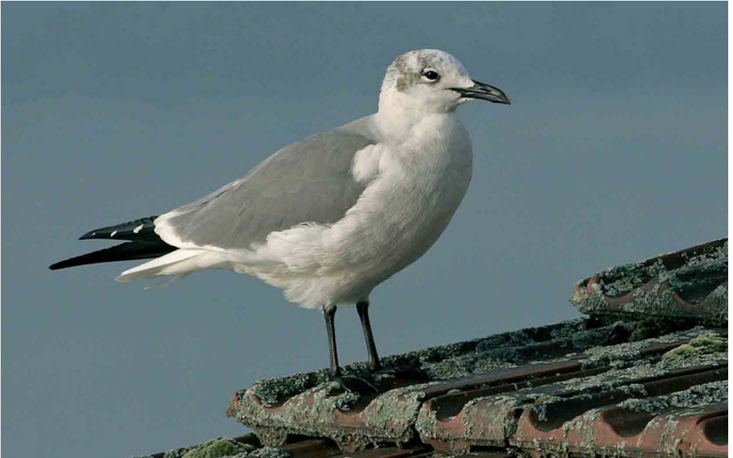
150 Laughing Gull / Lachmeeuw Larus atricilla , Merligen, Thuner See, Bern, Switzerland, 7 January 2006 (Christian Schüler)