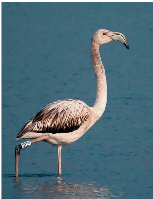
148 Greater Flamingo / Flamingo Phoenicopterus roseus , Secovlje's Salin, Slovenia, November 2005