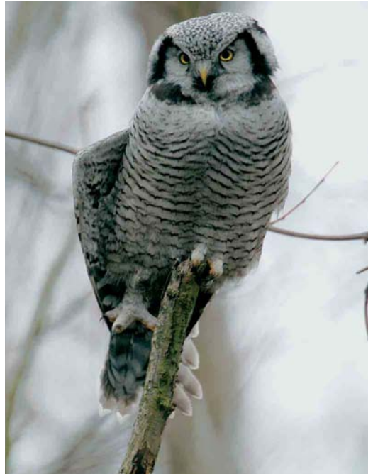
145 Forster's Tern / Forsters Stern Sterna forsteri, Nimmo's Pier, Galway, Ireland, 2 January 2006 146 Northern Hawk Owl / Sperweruil Surnia ulula, Dubrau, Brandenburg, Germany, February 2006 147 Kumlien's Gull / Kumliens Meeuw Larus glaucoides kumlieni, Nimmo's Pier, Galway, Ireland, 11 February 2006