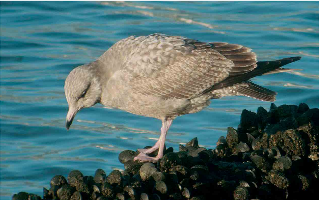
151 American Herring Gull / Amerikaanse Zilvermeeuw Larus smithsonianus , first-year, Getxo, Bizkaia, Spain, 13 February 2006