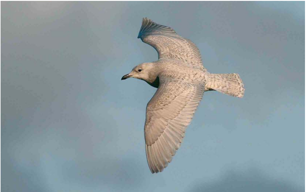
174 Kleine Burgemeester / Iceland Gull Larus glaucooides , eerste-winter, Oostduinkerke, West-Vlaanderen, 18 december 2005 (Diederik D'Hert) cf Dutch Birding 28: 67, 2006