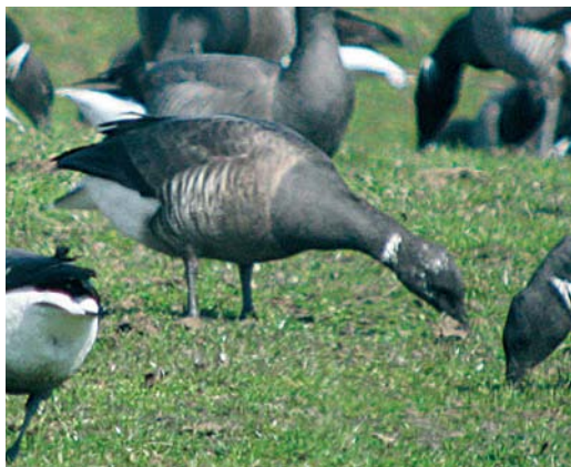
128 Dark-bellied Brent Goose / Rotgans Branta bernicla , adult with limited white flecking on head, Banckspolder, Schiermonnikoog, Friesland, Netherlands, 1 April 2005