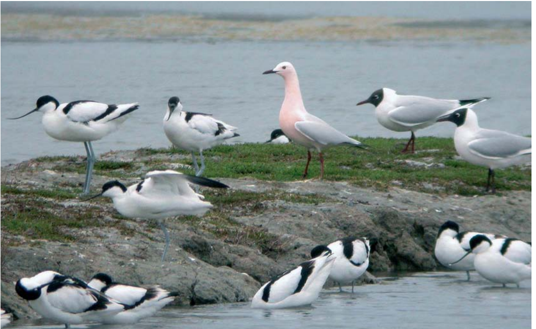
98 Slender-billed Gull / Dunbekmeeuw Larus genei , adult, with Pied Avocets / Kluten Recurvirostra avosetta and Black-headed Gulls / Kokmeeuwen L. ridibundus , île de Noirmoutier, Vendée, France, 29 March 2005