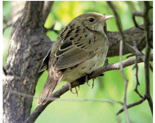
143 Lanceolated Warbler / Kleine Sprinkhaanzanger Locustella lanceolata , Happy Island, Hebei, China, May 2005 (Nils van Duivendijk)

The tertial length and clear-cut fringes fit several Acrocephalus and Locustella warblers perfectly, as well as Zitting Cisticola Cisticola juncidis . However, the Acrocephalus species all show a