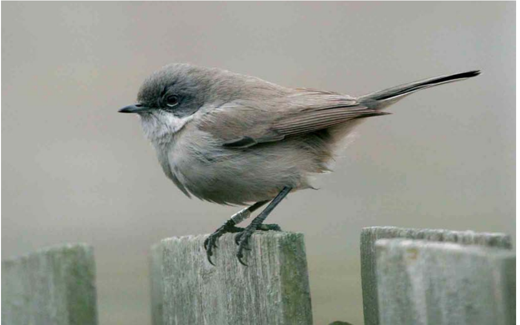
169 Braamsluiper / Lesser Whitethroat Sylvia curruca , Vinkhuizen, Groningen, Groningen, 10 februari 2006 (Edwin Winkel)