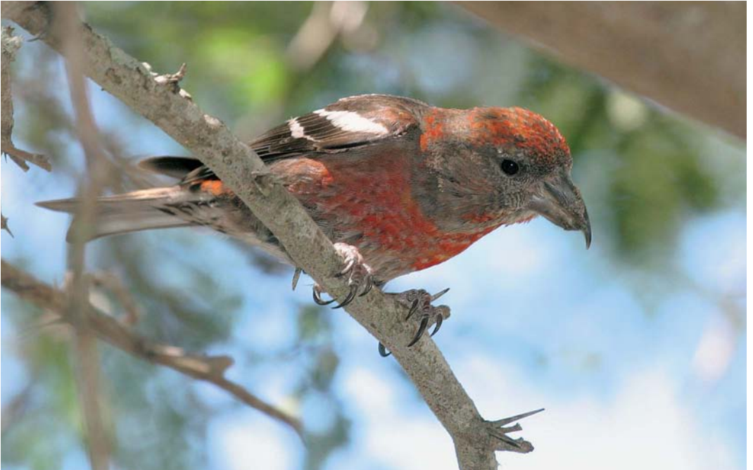
133-134 Hispaniolan Crossbill / Hispaniolakruisbek Loxia megaplega , adult male, Sierra de Bahoruco, Dominican Republic, 16 March 2004