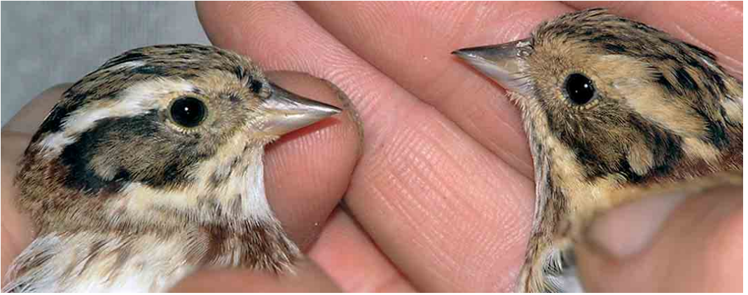
161 Rustic Buntings / Bosgorzen Emberiza rustica , Godovic, Slovenia, 24 November 2005 (Dare Sere)

time high of at least 18 House Crows Corvus splendens were counted at Hoek van Holland, Zuid-Holland, during February; the first successful breeding occurred here in 1997. The first Fan-tailed Raven C rhipidurus for the United Arab Emirates flew over the Qusaihwiira area in south-eastern Abu Dhabi, c 1000 km from the species' nearest breeding area, and headed south into Saudi Arabia. The adult male Spotless Starling Sturnus unicolor at Tane SØ, Oksbøl, Jylland, first seen in spring 2002 and back from 15 April to at least 18 May 2003 has recently been accepted as the first for Denmark. The second Common Crossbill Loxia curvirostra for Madeira was a male photographed on 26 February. The fourth Pine Bunting Emberiza leucocephalos for Spain was a male at Cases del Señor, Monovar, Alacant, from 15 January to at least 16 February. In Finland, one occurred at Närpiö, on 17-18 January. The third record of Rustic Bunting E rustica for Slovenia concerned two trapped and a third individual seen at Godovic on 24 November 2005.