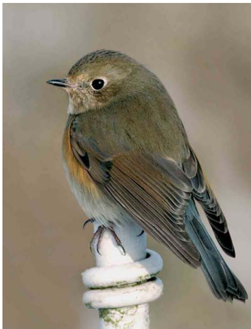
149 Red-flanked Bluetail / Blauwstaart Tarsiger cyanurus , Hannover-Lehrte, Niedersachsen, Germany, February 2006 (Stefan Pfützke)