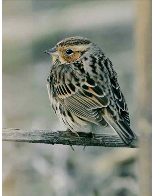
171 Huis kraaien / House Crows Corvus splendens , Hoek van Holland, Zuid-Holland, 10 maart 2006 (Renée de Kleijn & George Pieterse) 172 Dwerggors / Little Bunting Emberiza pusilla , Katwijk, Zuid-Holland, 26 februari 2006 (René van Rossum) 173 Witstuitbarmsijs / Arctic Redpoll Carduelis hornemanni , IJmuiden, Noord-Holland, 27 januari 2006 (Arnaud B van den Berg)