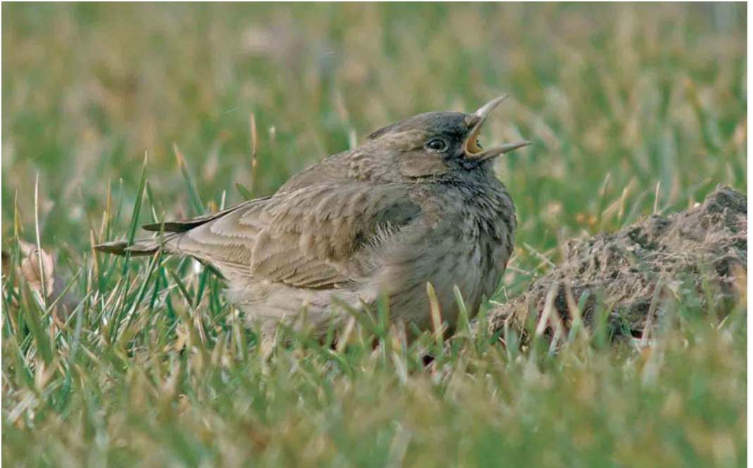
170 Kuifleeuwerik / Crested Lark Galerida cristata , Sevenum, Limburg, 23 februari 2006