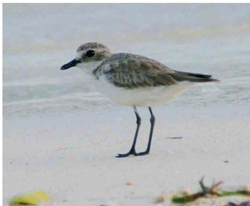
Mystery photograph III (July)