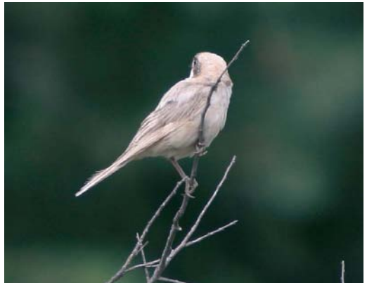
120 Woodchat Shrikes / Roodkopklauwieren Lanius senator , aberrantly coloured female with normally coloured male, Zlatoklas, Silistra, Bulgaria, 26 June 2004 ( Boris P Nikolov ) 121-122 Woodchat Shrike / Roodkopklauwier Lanius senator , female, Zlatoklas, Silistra, Bulgaria, 26 June 2004 ( Boris P Nikolov ) 123 Woodchat Shrike / Roodkopklauwier Lanius senator , female, Zlatoklas, Silistra, Bulgaria, 26 June 2004 ( Iva P Hristova ) 124 Woodchat Shrike / Roodkopklauwier Lanius senator , female, Baskaltsi, Blagoevgrad, Bulgaria, 6 August 2005 ( Iva P Hristova ) 125 Woodchat Shrike / Roodkopklauwier Lanius senator , female, Baskaltsi, Blagoevgrad, Bulgaria, 6 August 2005 ( Boris P Nikolov )