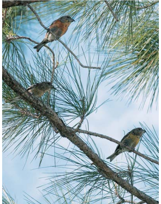
138 Hispaniolan Crossbills / Hispaniolakruisbekken Loxia megaplaga , Sierra de Bahoruco, Dominican Republic, 16 March 2004

divided into three subspecies, the latest systematic treatments recognize at least two and sometimes three separate species (cf Smith 1997, American Ornithologists' Union 1998, Barthel & Helbig 2005): White-winged Crossbill L (l) leucoptera from North America, Two-barred Crossbill L (l) bifasciata from Eurasia and Hispaniolan Crossbill L megaplaga from Hispaniola.