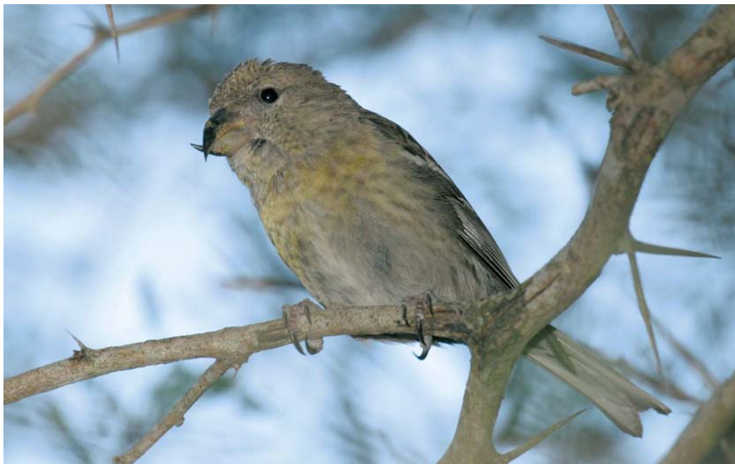
135-136 Hispaniolan Crossbill / Hispaniolakruisbek Loxia megaplaga , adult female, Sierra de Bahoruco, Dominican Republic, 15 March 2004