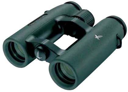
Swarovski 8x32 EL binoculars