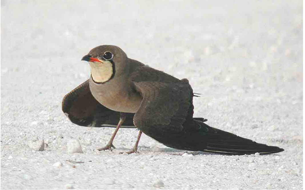
14 Oriental Pratincole / Oosterse Vorkstaartplevier Glareola maldivarum , adult-summer, Malaysia, probably late July 2001. Although tail looks ridiculously short, it is impossible to verify its length in relation to primary tips. Individual with pale lore and showing thin black throat-surround, even lacking the white border on the outer edge. This all points to a female. Lower breast shows reasonable amount of orangy-salmon wash. Easier to check is uniformly dark set of secondaries, not showing a hint of a trailing edge. Also, inner primaries look very dark with sharply demarcated edge over the top of (in particular) the outer web and are in favour of Oriental. Finally, this close view allows to see the oval nostril shape.

men should be treated as an aberrant bird of either species or a hybrid of both species.