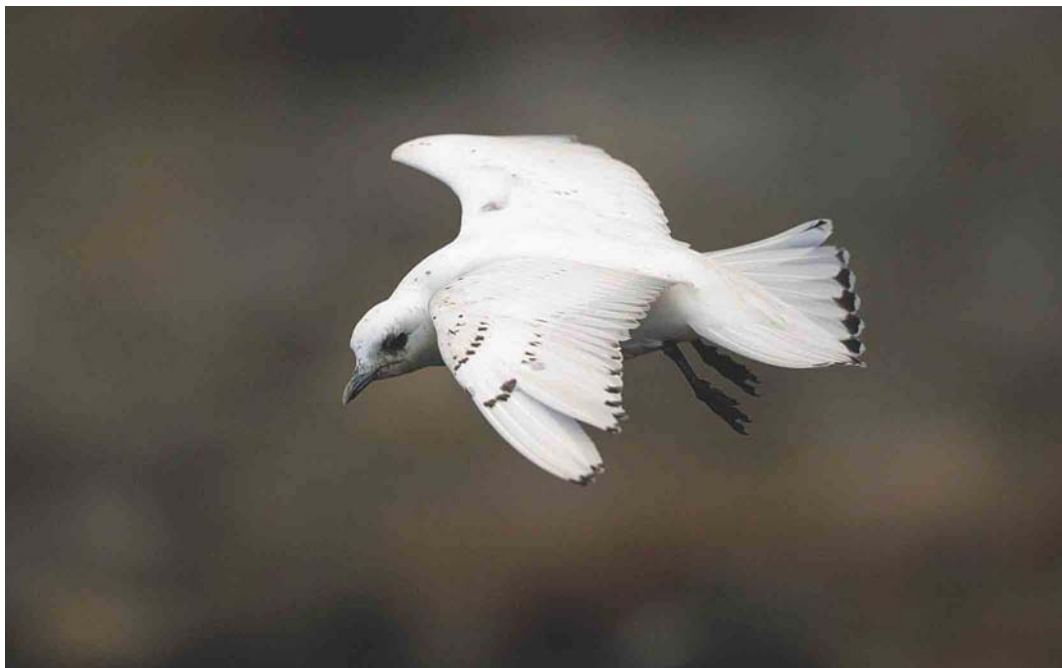
54 Ivory Gull / Ivoormeeuw Pagophila eburnea , first-winter, Lerkil, Halland, Sweden, 18 December 2004 (Bas van den Boogaard)