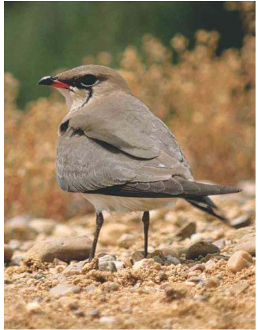
4 Collared Pratincole / Vorkstaartplevier Glareola pratincola , adult-summer, Histria, Romania, July 2004 (Laszlo Szabo). Brown lore and pale throat suggest a female. Dark chest could suggest Oriental Pratincole G maldivarum . Nostril shape, amount of red on lower mandible and long contrasting white wedge on outer tail-feathers are, however, useful characters for Collared. 5 Collared Pratincole / Vorkstaartplevier Glareola pratincola , adult-summer, Spain, June 1987 (Dirk de Moes). Ideal angle to assess colour difference between darker outer and paler inner web of inner primaries in Collared. This feature is never shown by Oriental Pratincole G maldivarum .