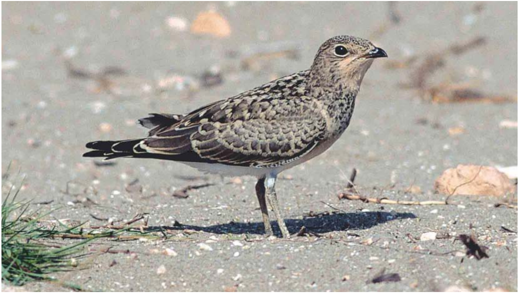
31 Collared Pratincole / Vorkstaartplevier Glareola pratincola , juvenile, Ebro delta, Tarragona, Spain, 18 July 2003 (Karel A Mauer). Bird in fresh juvenile plumage, difficult to identify. Elongated Collared silhouette is not yet developed as the primaries are still rather short. Nevertheless, the tail is already too long for Oriental Pratincole G maldivarum , showing two quite widely spaced tips to the outer tail-feathers. Slit-shaped nostril is not reliably visible. Feather centres on upperparts are mid-brown, lacking harsh contrast with pale tips of Oriental and creating buff cast over the plumage. 32 Collared Pratincole / Vorkstaartplevier Glareola pratincola , juvenile, Ebro delta, Tarragona, Spain, 18 July 2003 (Karel A Mauer). Same bird as in plate 31, practically impossible to identify in this posture, except for broad, white tips to secondaries, visible on underside of wing. 33 Collared Pratincole / Vorkstaartplevier Glareola pratincola , juvenile, Histria, Romania, August 1998 (Laszlo Szabo). Rather dark, moulting juvenile. Underside of outer tail-feather is visible and shows broad black tip. Nostril shape too narrow for Oriental.