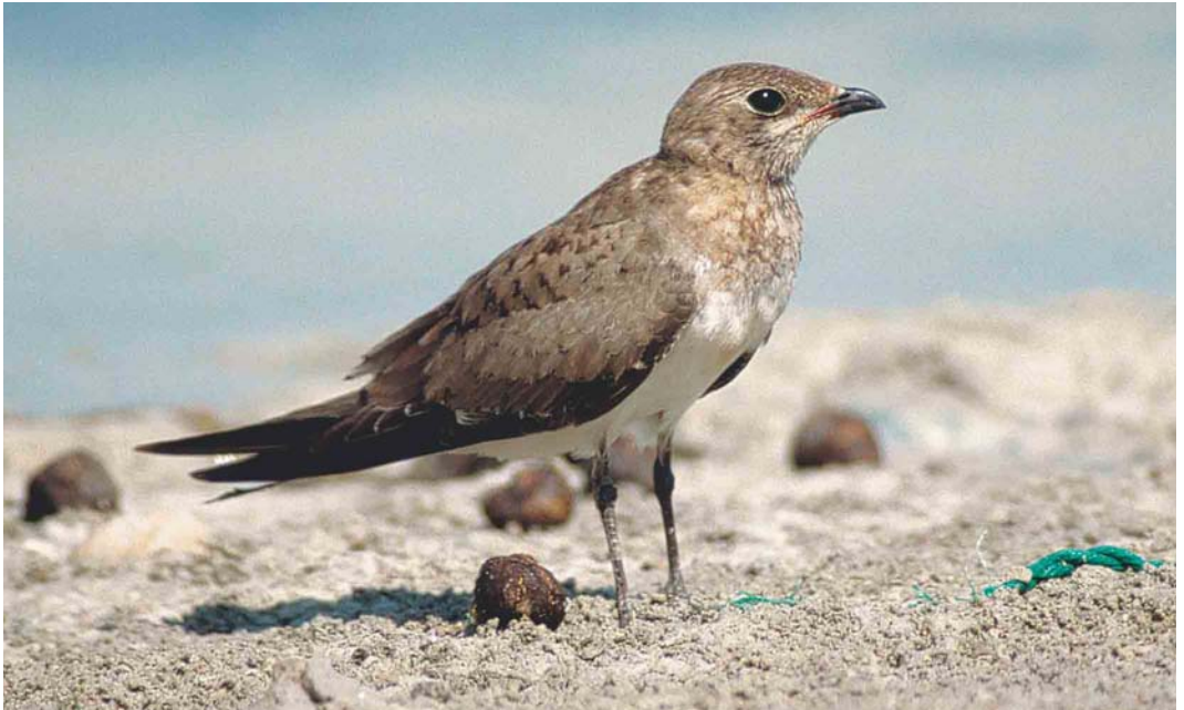
27-28 Collared Pratincole / Vorkstaartplevier Glareola pratincola , first-winter, Salalah, Oman, 9 November 2003 (Ray Tipper). Worn first-winter, showing worn juvenile scapulars (pale tips have abraded) and greater coverts and pale-fringed juvenile primaries (thus pattern not useful) and ruffled tail-feathers. Tail length, grey-brown plumage tone and lack of obvious dark throat-surround are characters pointing to Collared. Nostril shape difficult to judge in plate 27 but slit-shape visible in plate 28. Whitish tips to secondaries only visible on outer secondary hanging down under greater coverts (more buff in juvenile Oriental Pratincole G maldivarum ).