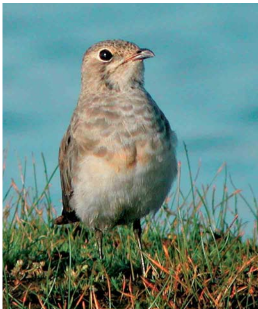
23 Oriental Pratincole / Oosterse Vorkstaartplevier Glareola maldivarum , adult-winter, Ängsnäset, Sweden, 16 August 2001 ( Jens Morin ). Same bird as in plate 22. Difficult posture, pro Oriental characters being the contrasting dark-brown centre on the breast-feathers, creating obvious scaly pattern and few deep orangy-buff feathers on centre of lower breast. Ageing on this posture alone would be impossible.

plumage (December to late July), the extent of the red on the lower mandible when seen from below differed. In pratincola , there is a bright red portion reaching 1.5-2.5 mm outside the feathering at the base of the lower mandible, whereas in maldivarum there is generally no red, or only a hint of brown-red reaching less than 1 mm outside the feathering. Only one or two out of nearly 125 examined specimens appeared to have a little more red, approaching the pattern of pratincola . It is possible to see this difference also in many late summer and autumn adults, although the red colour has darkened by this time. On some, the darkening of the red makes them appear to have all-black bills, and so the character cannot be used until the birds become sexually active again in winter.