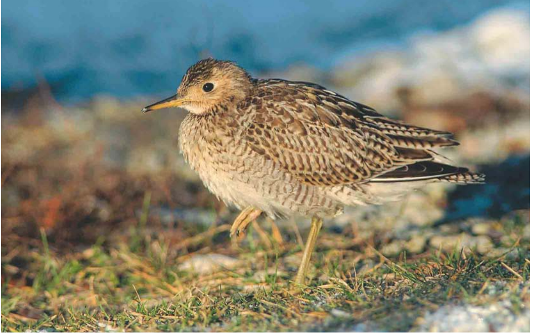
56 Upland Sandpiper / Bartrams Ruiters Bartramia longicauda , Kälder, Gotland, Sweden, 20 December 2004 (Johan Träff)