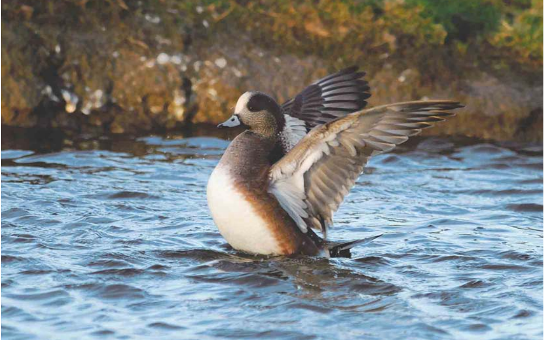
78 Amerikaanse Smient / American Wigeon Anas americana , mannetje, Heerepolder, Zeeland, 25 december 2004 ( Niels de Schipper )