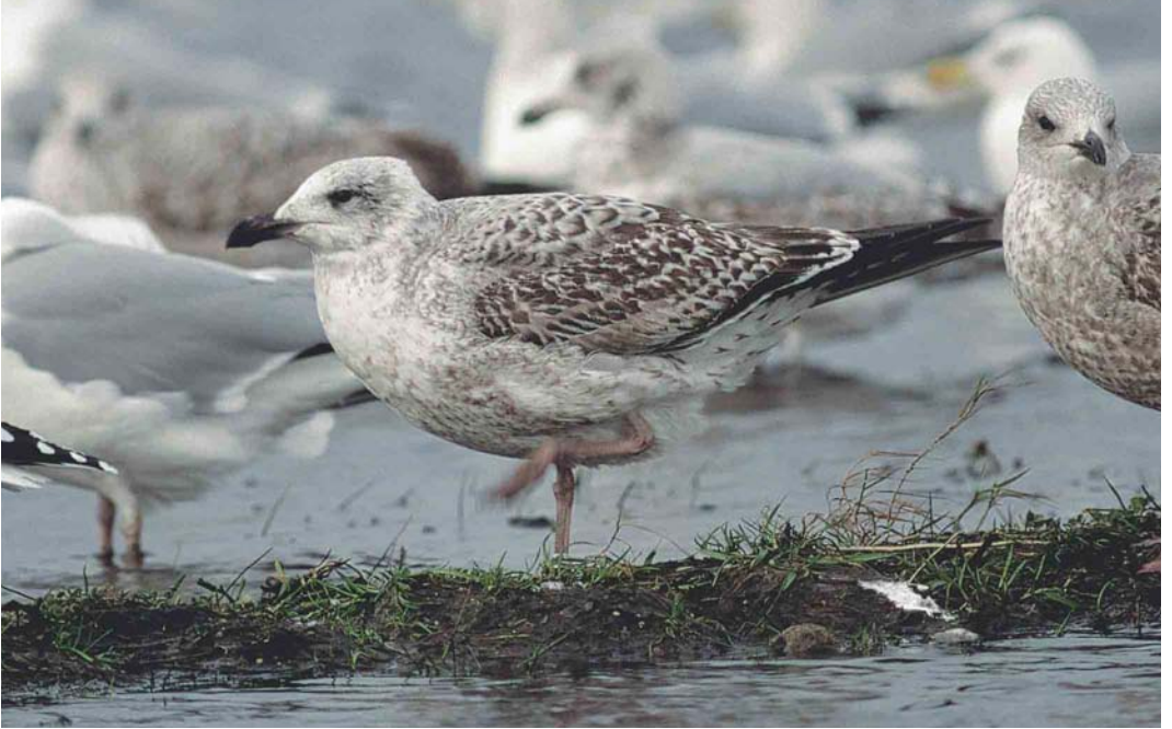
Mystery photograph I (January)