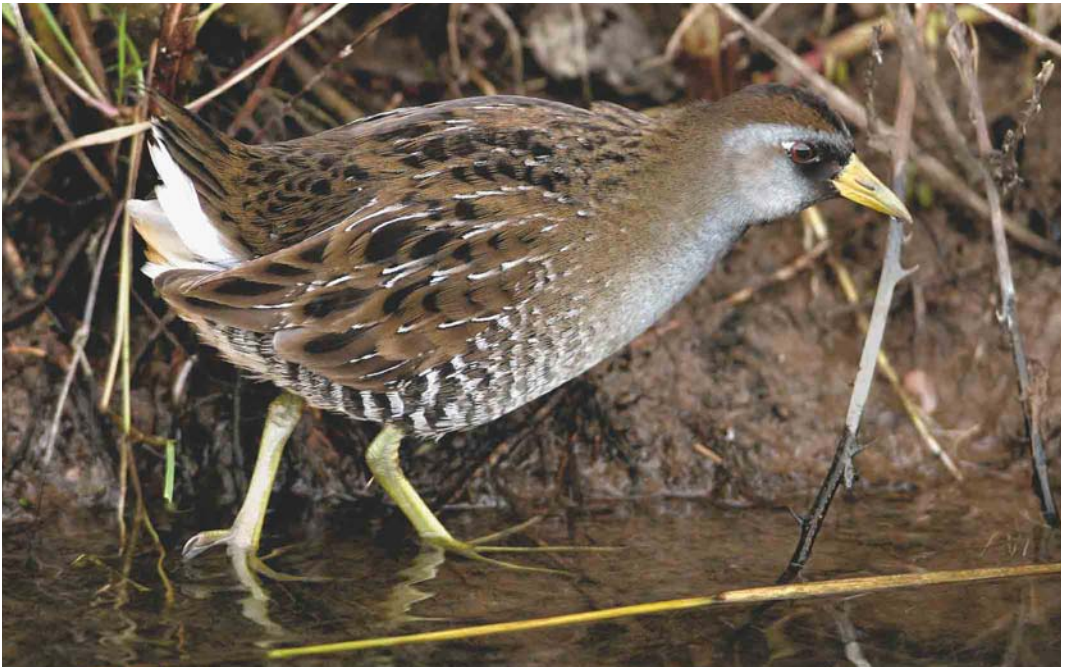
57 Sora / Soraral Porzana carolina , Attenborough, Nottinghamshire, England, December 2004