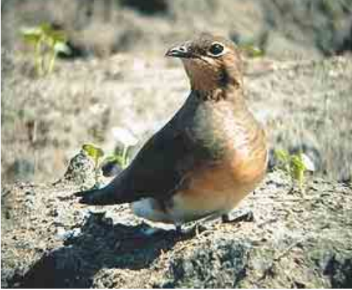
16 Oriental Pratincole / Oosterse Vorkstaartplevier Glareola maldivarum , adult-winter, Asia, probably Japan, autumn 2001 (Laurence Poh). Typical individual. Easily identified by all-black bill with oval nostrils. Finally, quite intensively coloured throat-patch (although still in winter plumage) and large amount of deep orangey to nearly brick-red wash on lower breast running down to upper belly are also pointers to Oriental.