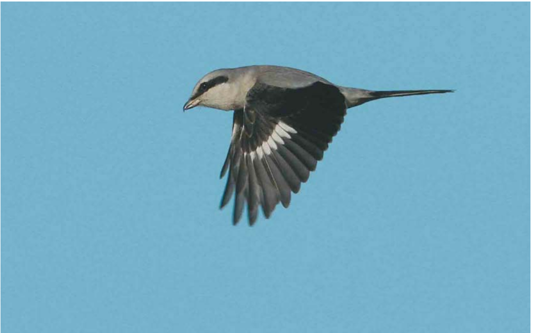
83 Klapekster / Great Grey Shrike Lanius excubitor , Zijdebrug, Alblasserwaard, Zuid-Holland, 24 december 2004 (Arie Ouwerkerk)