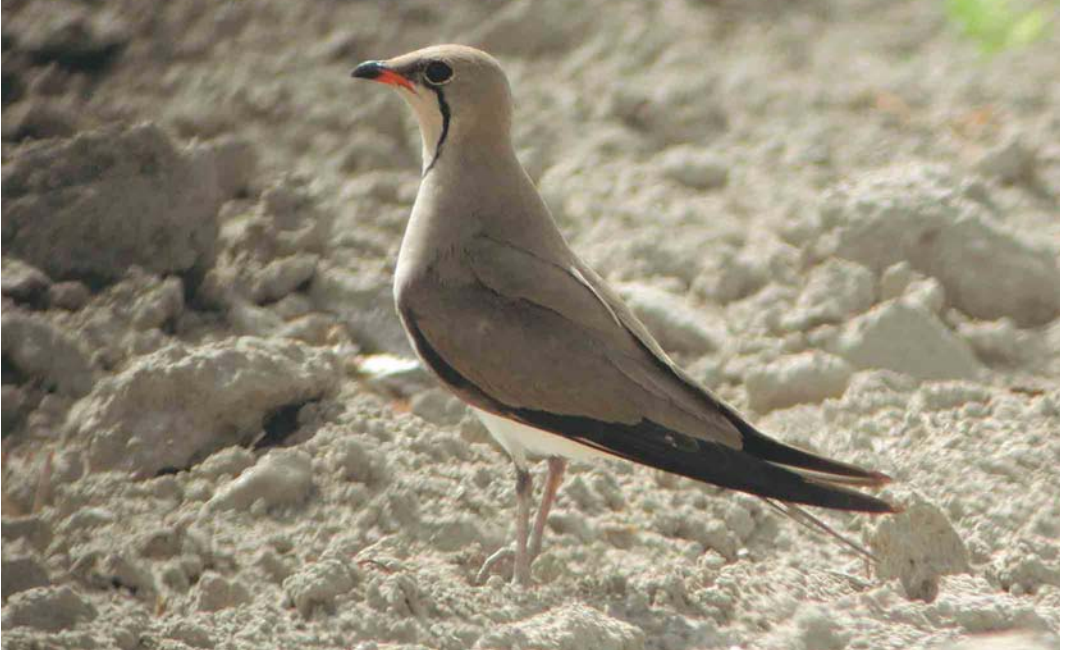
10 Collared Pratincole / Vorkstaartplevier Glareola pratincola , adult-summer, Ebro delta, Tarragona, Spain, June 2002. Classic adult-summer. Oriental Pratincole G maldivarum never shows this much red to base of lower mandible. Shade of grey-brown on upperparts does not occur in Oriental. Pattern of inner primaries is just visible under tertials. Tail-streamers look abraded, and thus rather slender. 11 Collared Pratincole / Vorkstaartplevier Glareola pratincola , adult-summer, Sevilla, Andalucía, Spain, 26 April 2000. Typical Collared in all aspects. Note, in particular, slit-shaped nostril, just visible whitish outer primary shaft and typical pattern of inner primaries, showing combination of slightly paler inner web and pale edge over inner web. In flight, the latter would create a continuation of the pale trailing edge over the inner primaries.