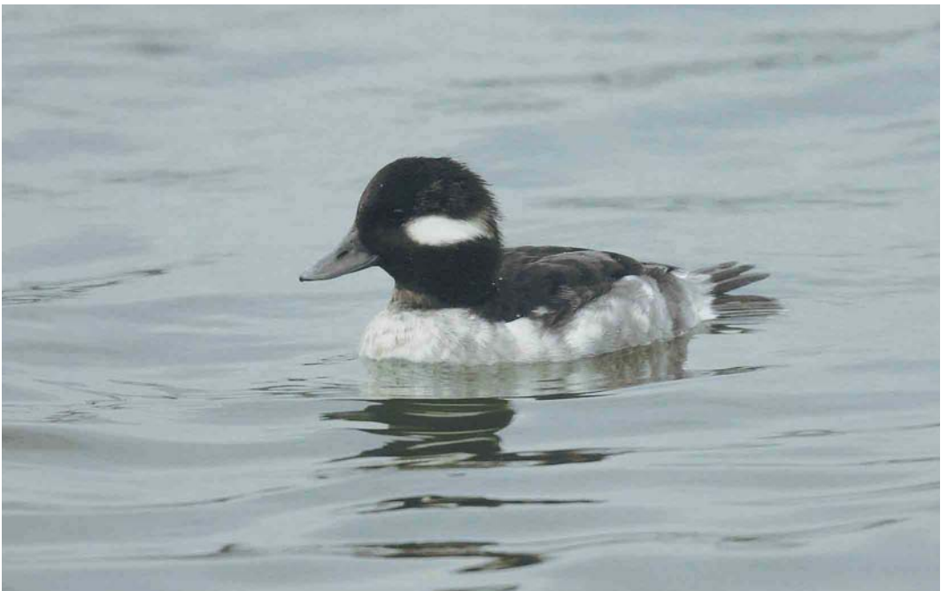
79 Buffelkopeend / Bufflehead Bucephala albeola , Gaatkensplas, Barendrecht, Zuid-Holland, 27 november 2004 ( Chris van Rijswijk )