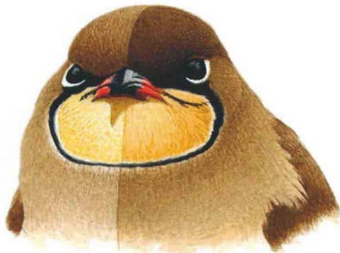
FIGURE 2 Head characters of nominate Collared Pratincole / Vorkstaartplevier Glareola pratincola (left half) and typical Afrotropical Collared Pratincole / Afrikaanse Vorkstaartplevier G p erlangeri/fuelleborni/riparia (right half) summer (Gerald Driessens). Afrotropical Collared Pratincole typically has 1 darker brown forehead, decreasing contrast with lores; 2 richer buff throat-patch; 3 often longer black mouth-line; and 4 broader black throat surround (especially below eye).

Many Afrotropical pratincola show the same colour as typical Palearctic pratincola : a buffish salmon-pink wash on the lower breast and a white belly. A minority of Afrotropical pratincola show a more saturated orange-buff but never as deeply as in well-marked maldivarum . In some birds, the wash on the underparts runs down to the belly but it is never as intensively coloured as in maldivarum . When such Afrotropical pratincola have fresh feathers, they appear – just like maldivarum – rather scaly on the underparts as the orange feathers are clearly paler tipped.