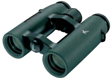
Swarovski 8x32 EL binoculars