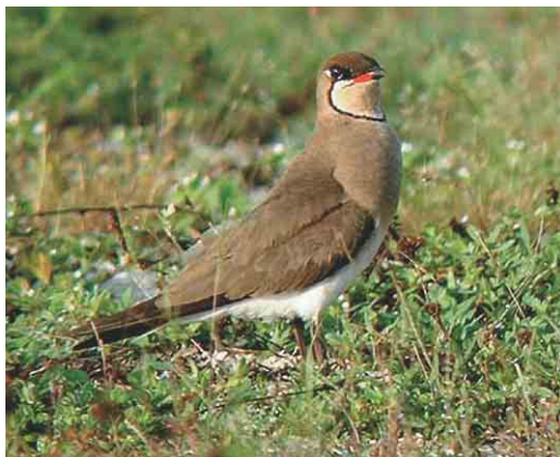
18 Oriental Pratincole / Oosterse Vorkstaartplevier Glareola maldivarum , adult-summer, Asia, probably Malaysia, 2001. Typical bird in several aspects: warm dark brown forehead showing little contrast with black lore, deep buff throat-patch, quite dark, somewhat warm brown upperparts (although there is still a clear contrast between tertials and primaries), and tail falling short of primary tips. Less pronounced are width of black-and-white throat-surround and orangy-buff wash on lower breast.

maldivarum generally have all-red under greater secondary coverts, and both can rarely show some dark grey patches on some outer underwing-coverts, or have a few outer coverts entirely dark. Both species have invariably dark grey or blackish under primary coverts. Both species have wing-lining and lesser coverts mainly dark brown-grey (with some off-white admixed, c 10 mm wide). Both species have the same rufous-red colour.