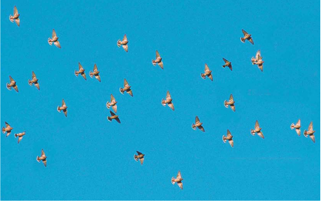
82 Pestvogels / Bohemian Waxwings Bombycilla garrulus , Den Haag, Zuid-Holland, 30 november 2004 (Henk Harmsen)