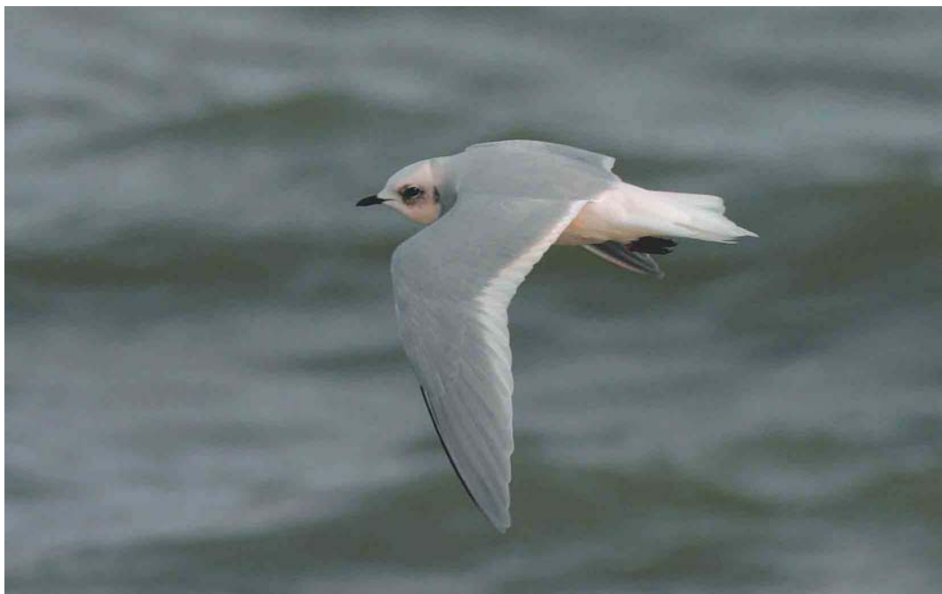
77 Ross' Meeuw / Ross's Gull Rhodostethia rosea , adult, Scheveningen, Zuid-Holland, 23 november 2004