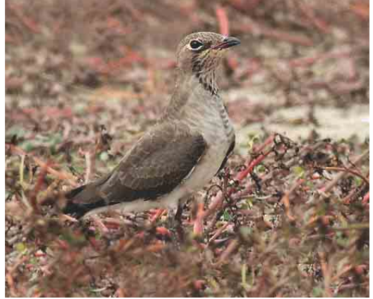
17 Oriental Pratincole / Oosterse Vorkstaartplevier Glareola maldivarum , adult-winter, Japan, 24 August 2002. Typical individual. The darker brown body-feathers produce a stronger scaly effect than in Collared Pratincole G. pratincola , in which the brown tinge is (usually) softer. Bill shows average amount of red on base of lower mandible for Oriental. Oval nostril is visible. Deep buff throat-patch with quite broad surround (even in winter plumage) are spot on for Oriental. This should prove to be a male.

in 1993 in Rosair et al (1995) and in Higgins & Davies (1996), and comparison of museum skins indicate that this character has no importance at all (it was, indeed, not described in the text in Hayman et al 1986). Fresh central tail-feathers of both species will frequently show paler parts distally. Also, in both species, the dark portions of the inner tail-feathers can look paler as they are often paler grey distally (rather than just showing a white fringe at the top). In conclusion, the exact pattern of the central tail-feathers is of no importance for identification.