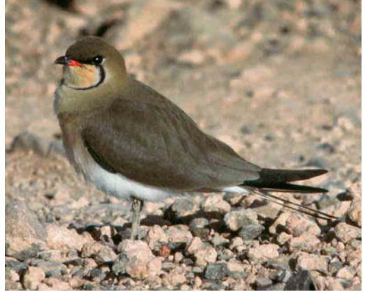
44 Collared Pratincole / Vorkstaartplevier Glareola pratincola , adult-summer, Ouarzazate, Morocco, 13 April 1992 (Willem Pompert). Dark, sepia-brown crown and upperparts, deep buff throat-patch and warm orangy-buff wash on lower breast produce a very fuelleborni -like appearance. Probably, such birds appear more regularly in North Africa than in the European population.

only a slight contrast between the pale inner and the dark outer web of the inner primaries (cf darker individuals in Palearctic pratincola ).