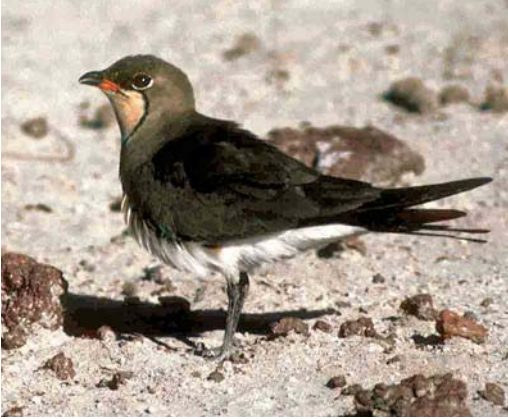
43 Afrotropical Collared Pratincole / Afrikaanse Vorkstaartplevier Glareola pratincola fuelleborni , adult-summer, Amboseli NP, Kenya, 7 januari 1995. Typical African Collared (probably male), showing very dark sepia-brown upperparts, little contrast between forecrown and lore and very deep orangy-brown coloured throat-patch with practically no indication of a white border. Birds of the fuelleborni -type more often show a clear black mouth-line than nominate pratincola . Structure is identical to nominate pratincola , including slit-shaped nostril.