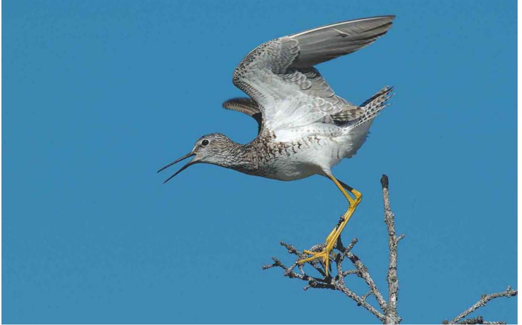
53 Lesser Yellowlegs / Kleine Geelpootruiter Tringa flavipes , Dalton Highway, Brook's Range, Alaska, USA, 18 June 2004 (René Pop)

Greenshank T. nebularia and Greater Yellowlegs T. melanoleuca the barring can be as strong as in the mystery bird and accompanied by large spots on the lower breast. Note that we are not dealing with the flanks, which are invisible in the mystery bird, but with the lower breast, which is important for a correct identification. For instance, Wood Sandpiper T. glareola in breeding plumage shows prominent barred flanks but only diffuse streaking on the breast sides and is, therefore, eliminated as a possible solution. When talking about the pattern on the lower breast side, only Common Greenshank and Greater Yellowlegs show this type of strong barring. Especially in Greater Yellowlegs, the barring is very strong with the dark 'chevrons' more or less in parallel lines. In Common Greenshank, the pattern is less tidy. Finally, the identification can be clinched as Greater Yellowlegs by looking at the upperparts which just reveal a few feathers with large whitish dots; a pattern not shown by Common Greenshank.