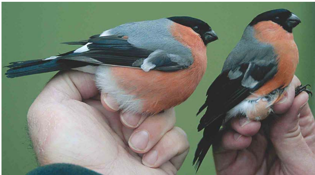
101 Noordse Goudvink / Northern Bullfinch Pyrrhula pyrrhula , adult of eerste-winter mannetje 'trompetgoudvink' / 'trumpeter bullfinch' (links) en Goudvink / Central European Bullfinch P p europaea , eerste-winter mannetje, Bloemendaal, Kennemerduinen, Noord-Holland, 1 november 2004

genoemde periode bijna 1400 vogels geteld, tegen ruim 300 in 2003, c 175 in 2002 en ruim 500 in 2001. Deze aantallen moeten in het licht worden gezien van een recente, sterk toegenomen belangstelling om trektellingen te verrichten maar desondanks kan worden gesteld dat 2004 een erg goed, zo niet het beste jaar ooit voor de trek van deze soort was. Hetzelfde werd niet alleen vastgesteld in België, Brittannië (met record-aantallen op Shetland, Schotland) en Zuid-Scandinavië, maar ook in Midden- en Oost-Europa en westelijk tot in Ierland en IJsland (waar in totaal 33 exemplaren werden gezien). In het verleden betroffen invasies van Goudvinken in deze landen voornamelijk Noordse Goudvink P p pyrrhula uit Scandinavië en Rusland. Ook bij de invasie van 2004 leek dat het geval. Echter, dit keer werd door diverse waarnemers vrijwel direct opgemerkt dat de vogels een andere roep hadden. De roep klonk lager en nasaler dan het bekende Goudvink-fluitje en was minder makkelijk na te fluiten. Het geluid deed denken aan een kindertrompetje, vandaar de bijnamen 'trompetgoudvink' of (in België) 'teuter'; in Brittannië spreekt men van 'trumpeter bullfinch' en in Duitsland en Oostenrijk van 'Trumpetgimpel'. Aanvankelijk ontstond zelfs verwarring met de roep van Witbandkruisbek Loxia leucoptera en Woestijnvink Bucanetes githagineus .