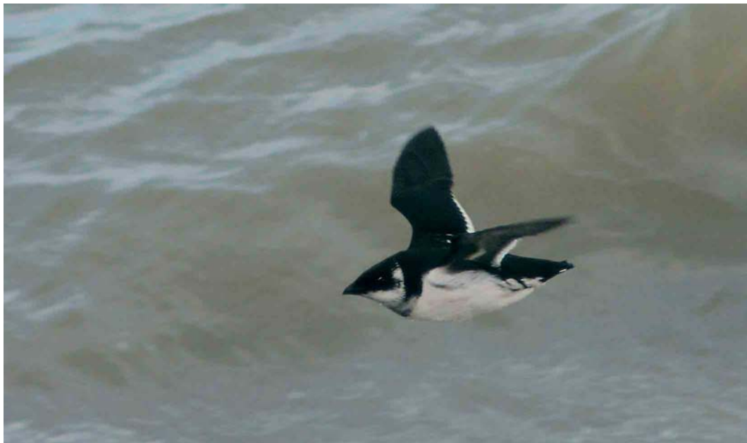
96 Kleine Alk / Little Auk Alle alle , Oostende, West-Vlaanderen, 20 november 2004 (Johan Buckens)