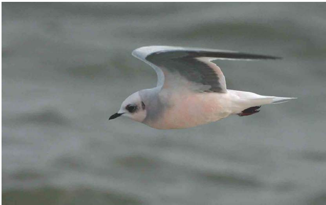
76 Ross' Meeuw / Ross's Gull Rhodostethia rosea , adult, Scheveningen, Zuid-Holland, 23 november 2004 ( Edwin Winkel )