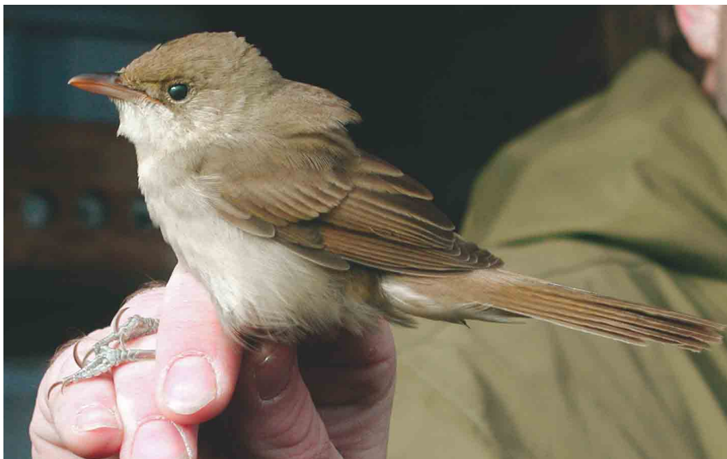
73 Thick-billed Warbler / Diksnavelrietzanger Acrocephalus aedon , Utsira, Rogaland, Norway, 6 October 2004 cf Dutch Birding 26: 407, 2004