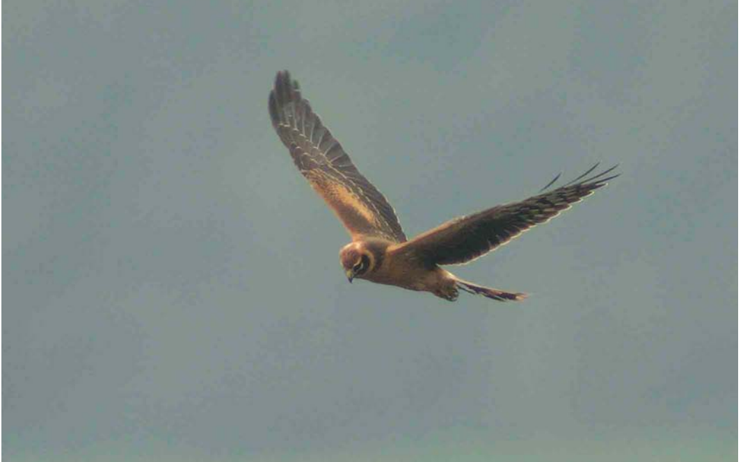
95 Steppekiekendief / Pallid Harrier Circus macrourus , juveniel, Thuillies, Hainaut, 2 november 2004

segena opgemerkt. Late Grauwe Pijlstormvogels Puffinus griseus werden waargenomen op 5 november langs De Panne (drie) en op 19 november langs Oostende en De Panne (telkens twee). Op 19 november vlogen bovendien twee Stormvogeltjes Hydrobates pelagicus langs Nieuwpoort, West-Vlaanderen, en één langs De Panne. Tussen 13 en 22 november werden in totaal nog acht Vale Stormvogeltjes Oceanodroma leucorhoa opgemerkt. Kuifaalscholvers Phalacrocorax aristotelis deden het naar 'moderne' tendenzen weer iets beter dan het vorige jaar met waarnemingen in De Panne (18 en 20 november); Nieuwpoort (van 1 tot 6 en twee op 19 november); Oostende (22 november) en Zeebrugge, West-Vlaanderen (30 november en 10 december). Net zoals tijdens de vorige winter kreeg een tuinvijver in Schilde, Antwerpen, eind december weer regelmatig bezoek van een adulte Kwak Nycticorax nycticorax . Op 8 december was een eerste-winter aanwezig in Mariembourg, Namur. De hoogste concentraties van Kleine Zilverreiger Egretta garzetta waren 45 in Lissewege, West-Vlaanderen; 33 in Knokke, West-Vlaanderen; 13 in Zeebrugge; vijf in Verrebroek, Oost-Vlaanderen; en telkens drie in Zonhoven, Limburg, en Harchies-Hensies, Hainaut. Er werden ook weer heel wat Grote Zilverreigers Casmerodius albus opgemerkt met opvallende concentraties in Zonhoven (59 op 5 december); Zolder, Limburg (56 op 4 november); Harchies-Hensies (22 op 19 december); Essen en Heindonk, Antwerpen (13 op 21 december);