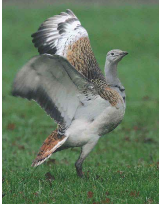
69 Blue-naped Mousebird / Blauwnekmuivogel Colius macrourus , Aghkmakou, Mauritania, 2 January 2005 (Kris De Rouck) 70 Great Bustard / Grote Trap Otis tarda , female, Borculo, Gelderland, Netherlands, 8 December 2004 (Chris van Rijswijk) 71 Cricket Warbler / Krekelpriinia Spiloptila clamans , Aghkmakou, Mauritania, 2 January 2005 (Kris De Rouck)