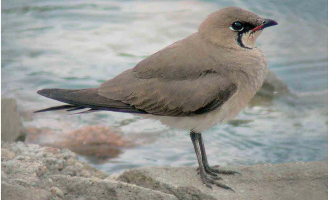
19 Oriental Pratincole / Oosterse Vorkstaartplevier Glareola maldivarum , adult-summer, Eochoeng Do Islands, South Korea, early May 2003. Rather dull-plumaged individual. In May, birds can already look very much abraded. Amount of red on bill-base and oval nostril typical for Oriental. High-legged stance and tail length are also visible. This bird clearly illustrates the lack of contrast between inner and outer primary webs near the shaft, even when bleached. 20 Oriental Pratincole / Oosterse Vorkstaartplevier Glareola maldivarum , adult-summer, Kinta National Park, Malaysia, 12 March 2003. Probably a male, showing quite long outer tail-feathers (compare with other plates of adults). Rather large amount of red on lower mandible. High-legged appearance is obvious.