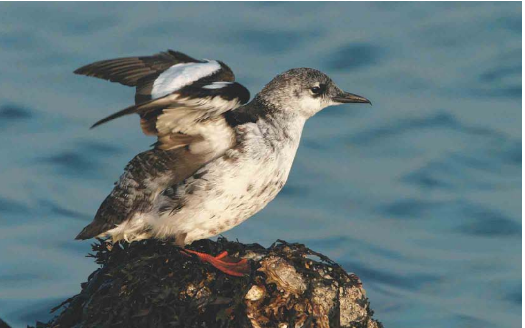
81 Zwarte Zeekoet / Black Guillemot Cepphus grylle , adult-winter, West-Terschelling, Terschelling, Friesland, 4 oktober 2004