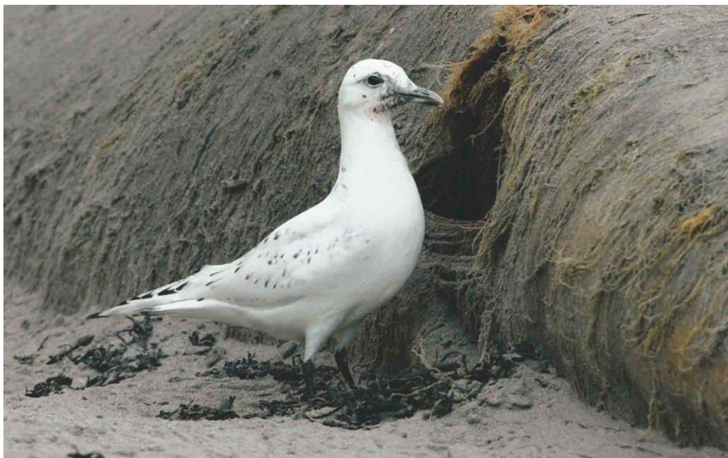
55 Ivory Gull / Ivoormeeuw Pagophila eburnea , first-winter, Coldbackie Bay, Kyle of Tongue, Highland, Scotland, 5 December 2004