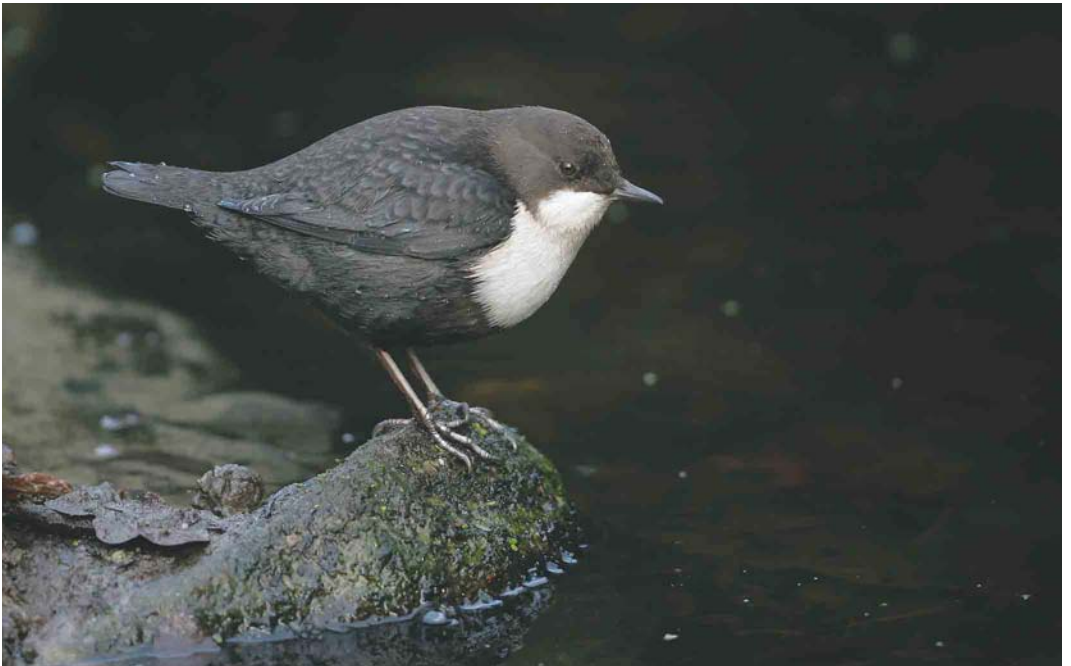
88 Zwartbuikwaterspreeuw / Black-bellied Dipper Cinclus cinclus cinclus , Emmen, Drenthe, 14 december 2004 (Roland Jansen)