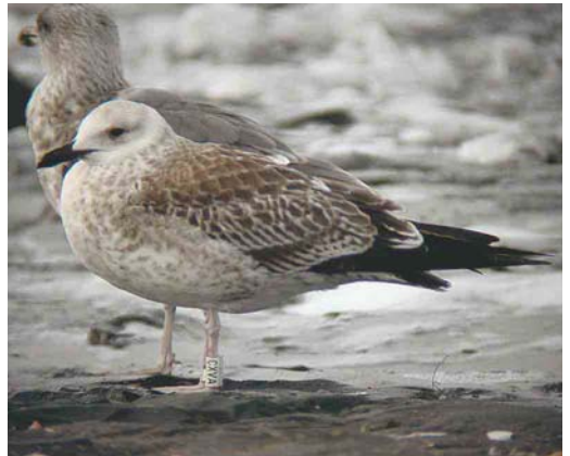
89 Noordse Boszanger / Arctic Warbler Phylloscopus borealis , Herdershut, Schiermonnikoog, Friesland, 30 september 2004 cf Dutch Birding 26: 419, 2004 90 Cetti's Zanger / Cetti's Warbler Cettia cetti , Starrevaart, Leidschendam, Zuid-Holland, 7 november 2004 91 Provençalse Grasmus / Dartford Warbler Sylvia undata , Kraloërheide, Pesse, Drenthe, 15 januari 2005 92 Grote Pieper / Richard's Pipit Anthus richardi , Seeryp, Terschelling, Friesland, 25 november 2004 93 Zwarte Ibis / Glossy Ibis Plegadis falcinellus , Ezumazijl, Friesland, 26 december 2004 94 Baltische Mantelmeeuw / Baltic Gull Larus fuscus fuscus , eerstejaars, Westkapelle, Zeeland, 16 oktober 2004