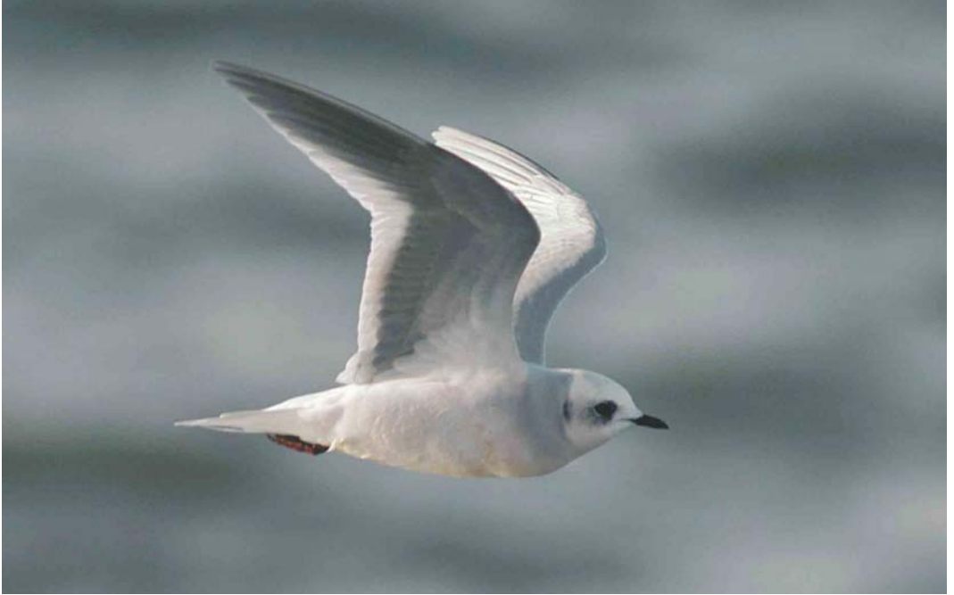
97 Ross' Meeuw / Ross's Gull Rhodostethia rosea , adult, Scheveningen, Zuid-Holland, 23 november 2004 98 Ross' Meeuw / Ross's Gull Rhodostethia rosea , adult, Scheveningen, Zuid-Holland, 23 november 2004 99 Ross' Meeuw / Ross's Gull Rhodostethia rosea , adult, Scheveningen, Zuid-Holland, 23 november 2004