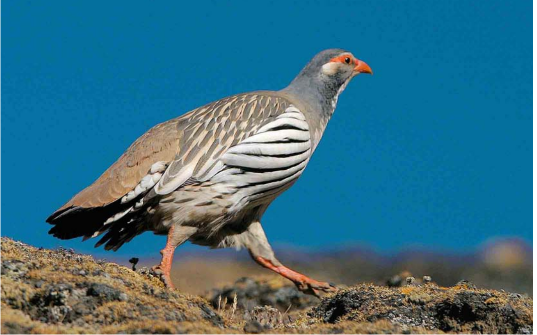
47-48 Tibetan Snowcock / Tibetaanse Berghoen Tetraogallus tibetanus , Gorak Shep, Nepal, altitude 5200 m, October 2003