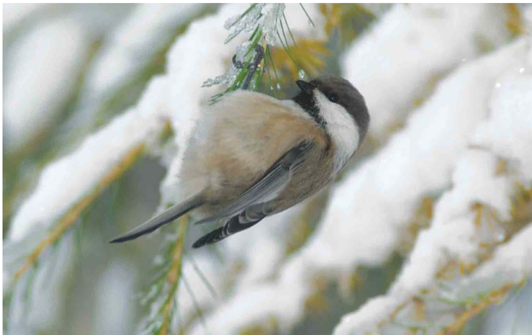
72 Siberian Tit / Bruinkopmees Parus cinctus , Uppsala, Uppland, Sweden, 20 November 2004