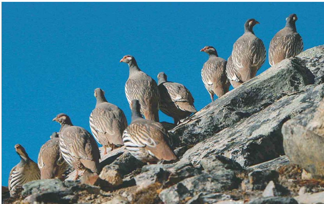
49-50 Tibetan Snowcocks / Tibetaanse Berghoenders Tetraogallus tibetanus , Gorak Shep, Nepal, altitude 5200 m, October 2003 (Otto Plantema)