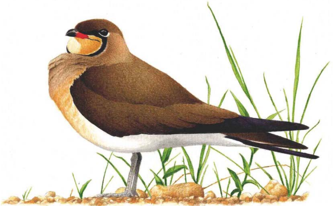
FIGURE 1 Afrotropical Collared Pratincole / Afrikaanse Vorkstaartplevier Glareola pratincola erlangeri/fuelleborni/riparia , adult-summer (Gerald Driessens). Typical individual. Note dark forehead and upperparts, rich buff throat-patch with long, dark mouth-line, narrow white edge along inner border of throat-patch, wash over lower-breast running down towards belly and primaries showing distinct blue-purple gloss.

Probably, the best way to assess the presence of a dark cap in the field is by looking at a bird head-on. The dark forehead will stand out against the red bill-base and (in pale-throated