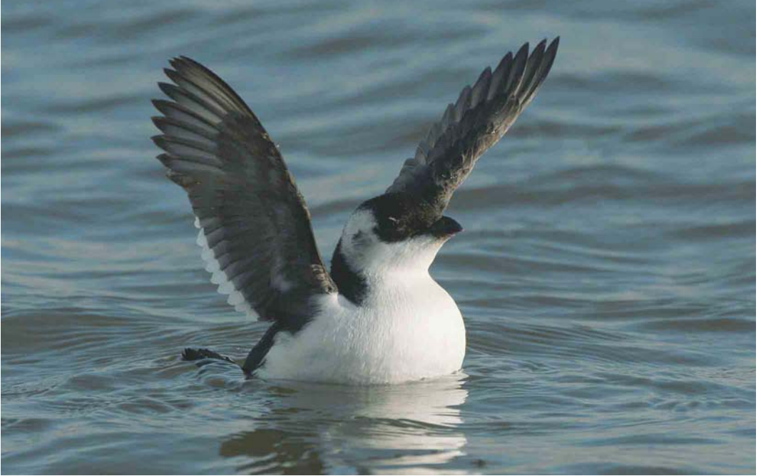
80 Kleine Alk / Little Auk Alle alle , Trintelhaven, Flevoland, december 2004