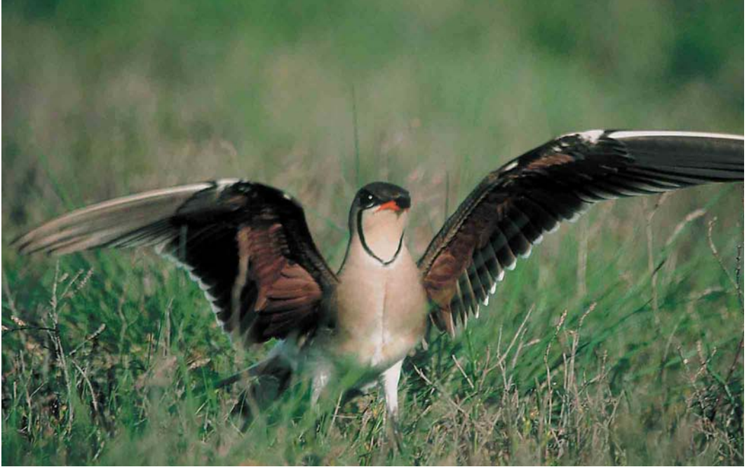
42 Collared Pratincole / Vorkstaartplevier Glareola pratincola , adult-summer, Histria, Romania, 1998. Fresh adult-summer showing broad, pure white tip to the secondaries, most prominent on the outer (usually, they are broadest on the inner).