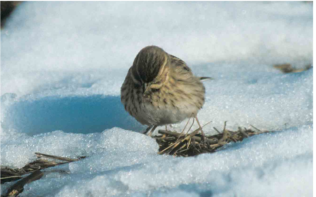
Mystery photograph II (February)