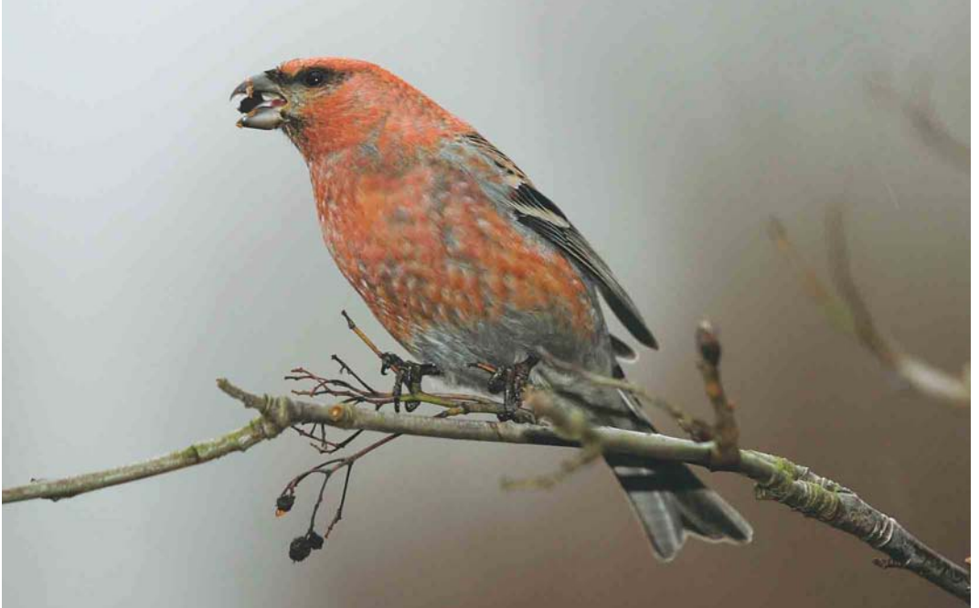
87 Haakbek / Pine Grosbeak Pinicola enucleator , adult mannetje, Beijum, Groningen, Groningen, 17 november 2004 (Roland Jansen)