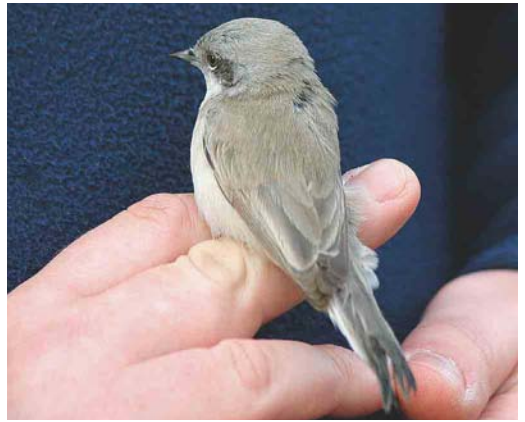
63 Eastern Crowned Warbler / Oostelijke Kroonzanger Phylloscopus coronatus , Kokkola, Finland, 23 October 2004 ( Harri Taavetti ) cf Dutch Birding 26: 407, 2004 64 Northern Hawk Owl / Sperweruil Sumia ulula , Knutby, Uppland, Sweden, 9 January 2005 ( Lee Gregory ) 65 Cream-coloured Courser / Renvogel Cursorius cursor , Lleida, Catalunya, Spain, 9 December 2004 ( Rafael Armada ) 66 Dusky Thrush / Bruine Lijster Turdus naumanni eunomus , first-winter, Enontekiö, Lapland, Finland, 16 November 2004 ( Pirka Aalto ) 67 Water Pipit / Waterpieper Anthus spinoletta , Pape lake, Liepaja, Latvia, 15 October 2004 ( Maris Jaunzemis ) 68 Desert Whitethroat / Woestijnbraamsluiper Sylvia curruca minula , Aberdeen, Scotland, 5 December 2004 ( Peter & Sue Morrison )