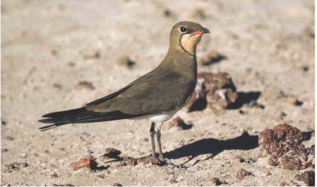
45 Afrotropical Collared Pratincole / Afrikaanse Vorkstaartplevier Glareola pratincola fülleborni , adult-summer, Amboseli, Kenya, January 1985. Another African Collared (probably female) showing most of its characters. Upperparts perhaps not as typically dark as in figure 1 but still showing little contrast with remiges. Note lack of white throat-surround. Black parts (primaries, tail-feathers) show deep purplish-blue gloss, much more pronounced than in average pratincola . Inner primary pattern is generally less pronounced than in nominate, as a result of the blacker remiges. 46 Collared Pratincole / Vorkstaartplevier Glareola pratincola , worn adult, Chobe, Botswana, 4 December 2001. A worn, rather pale bird, either a wintering nominate pratincola or a paler individual of the resident Afrotropical subspecies-group.