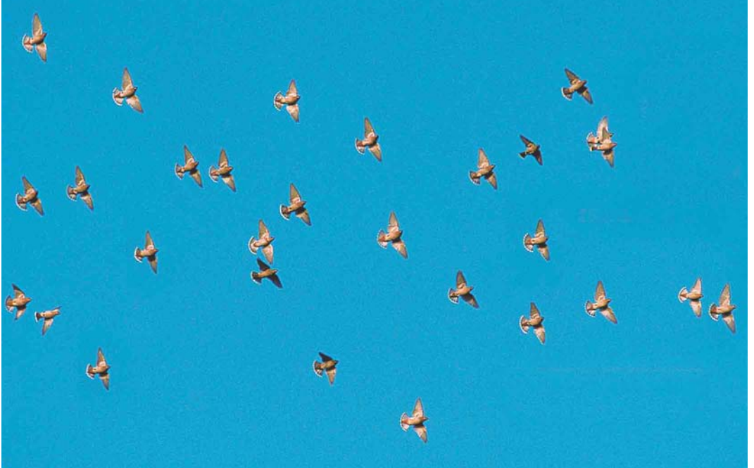
82 Pestvogels / Bohemian Waxwings Bombycilla garrulus , Den Haag, Zuid-Holland, 30 november 2004 (Henk Harmsen)