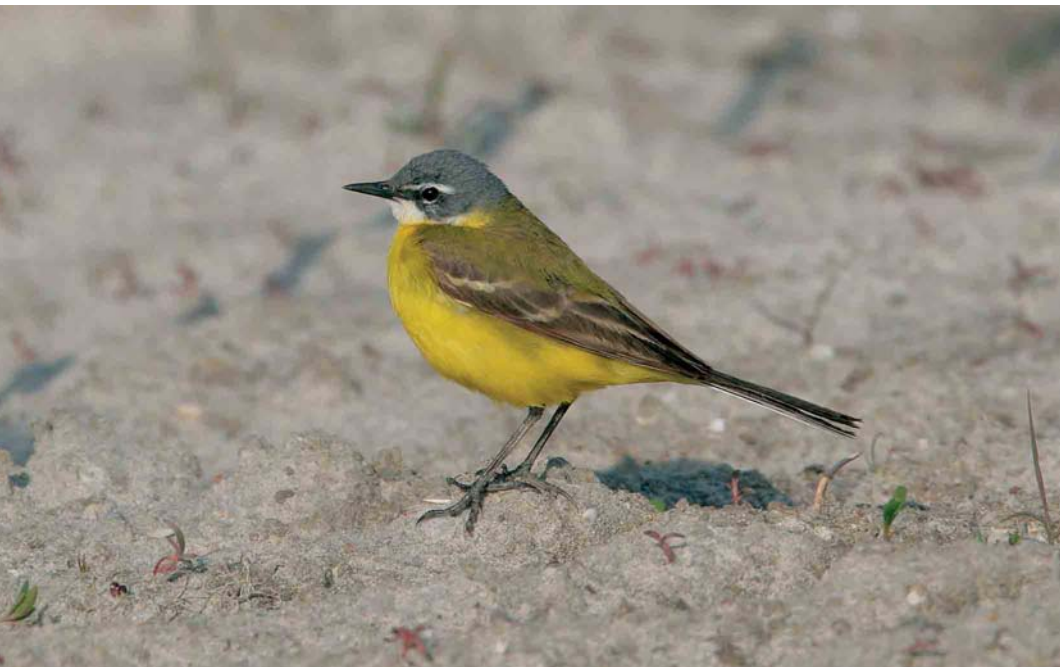
352 Waarschijnlijke Iberische Kwikstraat / probable Iberian Wagtail Motacilla iberiae , mannetje, Nieuwerkerk aan den IJssel, Zuid-Holland, 18 mei 2005