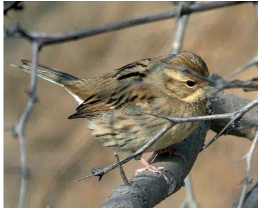
Mystery photograph VIII (May)

concerns the pattern of the flank-feathers. In the mystery bird, a subterminal pale line in the flank-feathers is present, creating dark U-shaped subterminal marks. This is typical for Blue-winged. In Baikal, the flank-feathers are more uniformly coloured brown with a pale fringe.