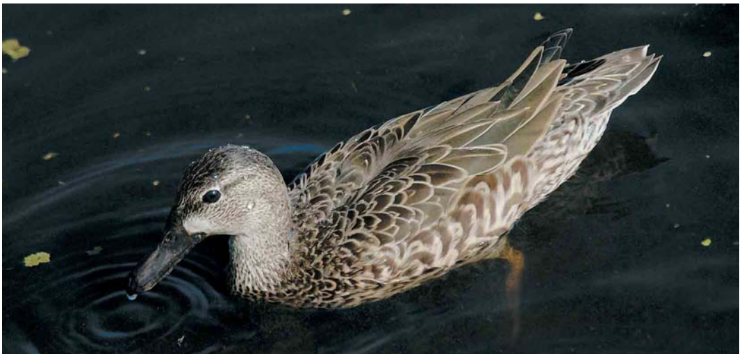
317 Blue-winged Teal / Blauwvleugeltaling Anas discors , Wakodahatchee, Palm Beach, Florida, USA, 18 February 2005

In other dabbling duck species, only Gadwall A strepera , Blue-winged Teal A discors and Baikal Teal A formosa show yellowish legs. Female Gadwall can be eliminated as this species would show extensive pale markings on the scapulars, forming dark U-shaped bars reminiscent of the flank-feathers, and grey-centred tertials. The absence of a white streak at the base of the tail in the mystery bird is another clue to eliminate Gadwall. In Baikal Teal, this pale patch should also be present. In addition, an important difference between Baikal and Blue-winged Teal