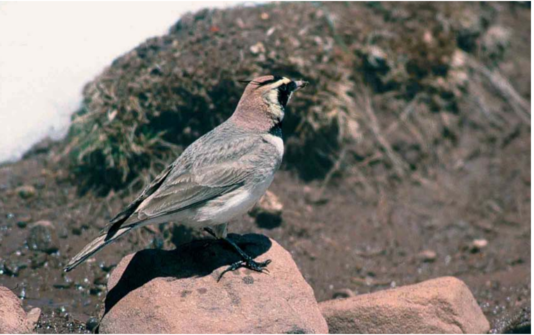
311-312 Atlas Horned Lark / Atlasstrandleeuwerik Eremophila alpestris atlas , Oukaimeden, High Atlas, Morocco, 5 April 2002