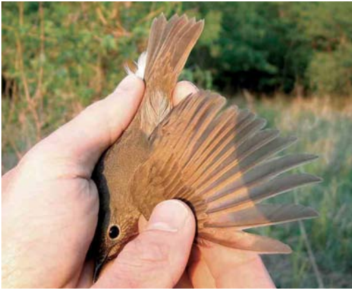
Mystery photograph VII (May)