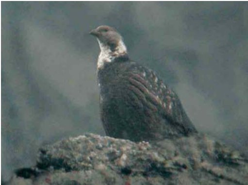
304 Caucasian Snowcock / Kaukasisch Berghoen Tetraogallus caucasicus , mount Kuro, Kazbegi, Khevi, Georgia, 12 June 2005 (Calum D Scott)