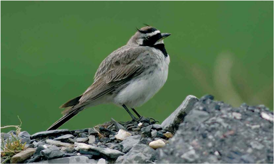
297 Caucasian Horned Lark / Kaukasische Strandleeuwerik Eremophila alpestris penicillata , Krestovy pass at 2300 m elevation, Khevi, Georgia, 26 June 2005 (Arnoud B van den Berg)