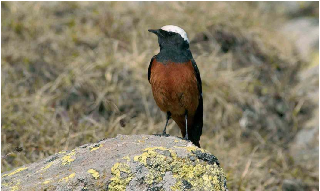
299 Güldenstädt's Redstart / Witkruidroodstaart Phoenicurus erythrogastrus , male, mount Kazbeg at 3000 m elevation, Kazbegi, Khevi, Georgia, 24 June 2005

In late April and early May, the snow line is usually below 1900 m which means that altitudinal migrants can still be found in the river valley, especially in the dense bushes of Sea Buckthorn ('duindoorns' in Dutch) Hippophae rhamnoides south of Kazbegi. For instance, after heavy snow-