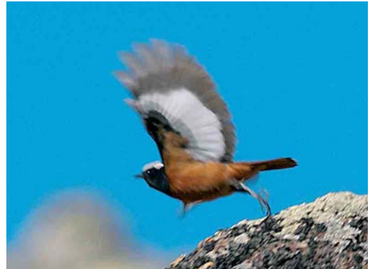
305 Güldenstädt's Redstart / Witkruinroodstaart Phoenicurus erythrogastrus , male, mount Kazbeg at 3000 m elevation, Kazbegi, Khevi, Georgia, 24 June 2005 (René Pop)