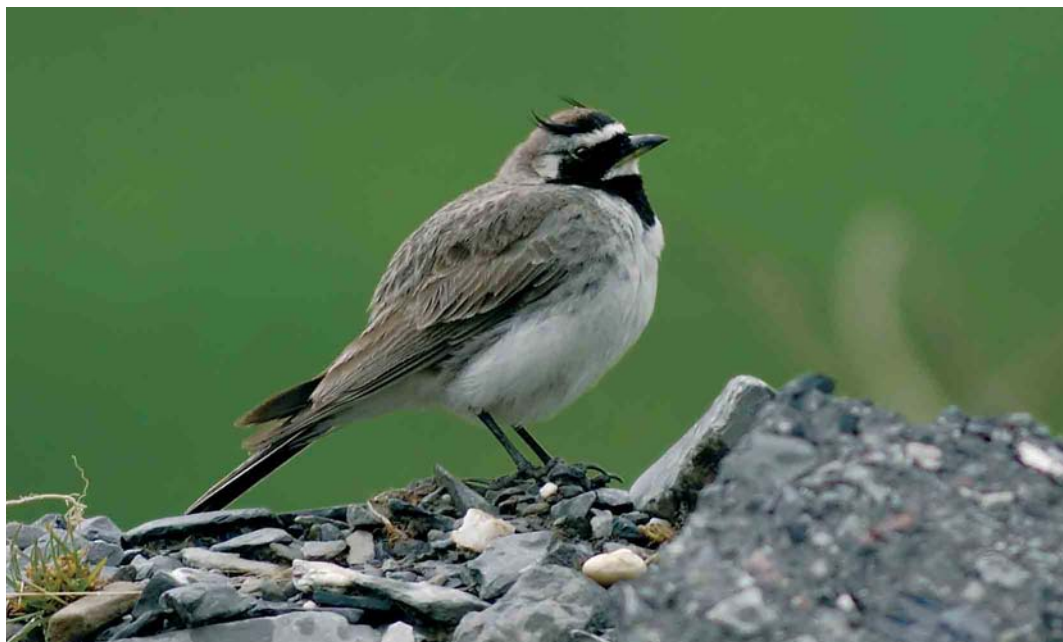
297 Caucasian Horned Lark / Kaukasische Strandleeuwerik Eremophila alpestris penicillata , Krestovy pass at 2300 m elevation, Khevi, Georgia, 26 June 2005