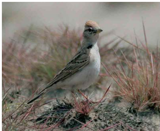
356 Roodkopklauwier / Woodchat Shrike Lanius senator , Laren, Limburg, 5 mei 2005 ( Marc Jacobs ) 357 Baardgrasmus / Subalpine Warbler Sylvia cantillans , mannetje, Kieldrecht, Oost-Vlaanderen, 25 mei 2005 ( Johan Buckens ) 358 Bijeneter / European Bee-eater Merops apiaster , Wachtebeke, Oost-Vlaanderen, 4 juni 2005 ( Miel Ferdinande ) 359 Kortteenleeuwerik / Greater Short-toed Lark Calandrella brachydactyla , Kalmthoutse Heide, Antwerpen, 10 juni 2005 ( Chris De Groof )

Vlaanderen (vier); Roly, Namur; Sint-Andries, West-Vlaanderen; Stalhille, West-Vlaanderen; Stuvekenskerke (vier); Walem, Antwerpen; Willebroek, Antwerpen (twee); en Woumen (twee). In de Achterhaven van Zeebrugge werden maximaal 10 Graszangers Cisticola juncidis geteld op 15 mei. Van 6 tot ten minste 24 mei zong er één in het Groot Rietveld bij Kallo en op 16 mei werd er één gehoord langs de Schelde in Temse, Oost-Vlaanderen. Er werden zangposten van Snorren Locustella luscinioides opgetekend in Assenede; op Blokkersdijk (twee); in Doel; Emblem, Antwerpen; Kallo/Melsele; Lier (twee); Stuvekenskerke (twee); Veurne; Wachtebeke; en Woumen. Grote Karekieten Acrocephalus arundinaceus deden het minder goed met zingende exemplaren bij Amay op 15 mei, op Blokkersdijk op 20 mei en in Kallo-Melsele van 23 tot 29 mei. In Gelinden, Limburg, werd een dood exemplaar gevonden in de nestkast van een Steenuil Athene