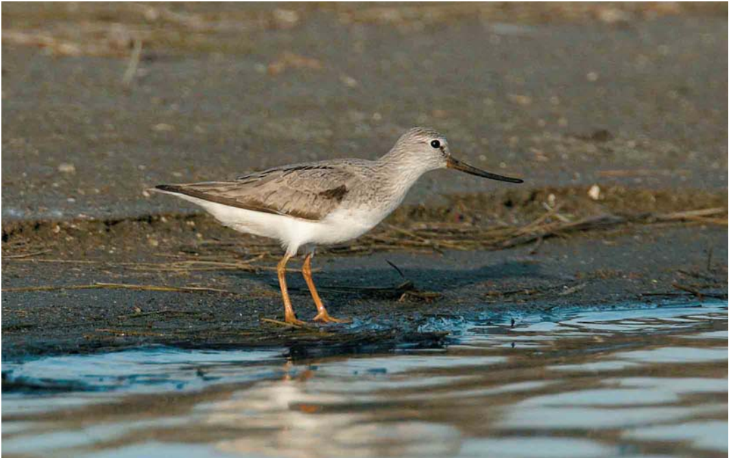
353 Terekruiter / Terek Sandpiper Xenus cinereus , Kieldrecht, Oost-Vlaanderen, Antwerpen, juni 2005 (Kris De Rouck)