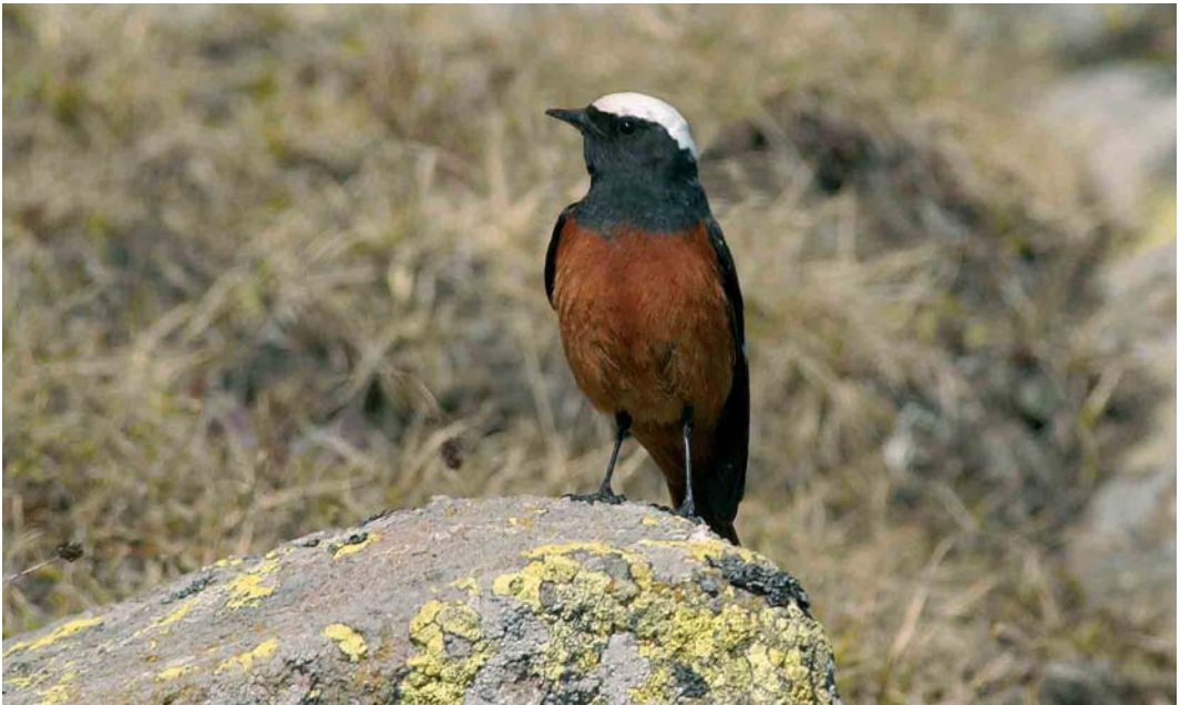
299 Güldenstädt's Redstart / Witkruidroodstaart Phoenicurus erythrogasterus , male, mount Kazbeg at 3000 m elevation, Kazbegi, Khevi, Georgia, 24 June 2005 (René Pop)

In late April and early May, the snow line is usually below 1900 m which means that altitudinal migrants can still be found in the river valley, especially in the dense bushes of Sea Buckthorn ('duindoorns' in Dutch) Hippophae rhamnoides south of Kazbegi. For instance, after heavy snow-