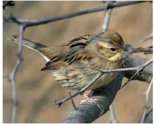
Mystery photograph VIII (May)

concerns the pattern of the flank-feathers. In the mystery bird, a subterminal pale line in the flank-feathers is present, creating dark U-shaped subterminal marks. This is typical for Blue-winged. In Baikal, the flank-feathers are more uniformly coloured brown with a pale fringe.