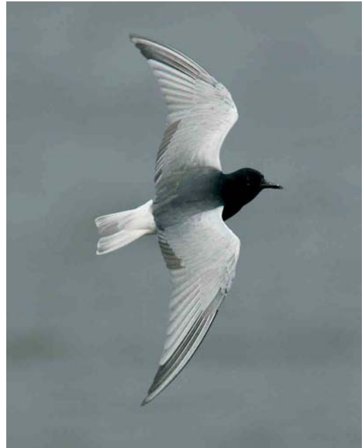
355 Witvleugelstern / White-winged Tern Chlidonias leucopterus , Nieuwpoort, West-Vlaanderen, 14 mei 2005 (Koen Verbanck)