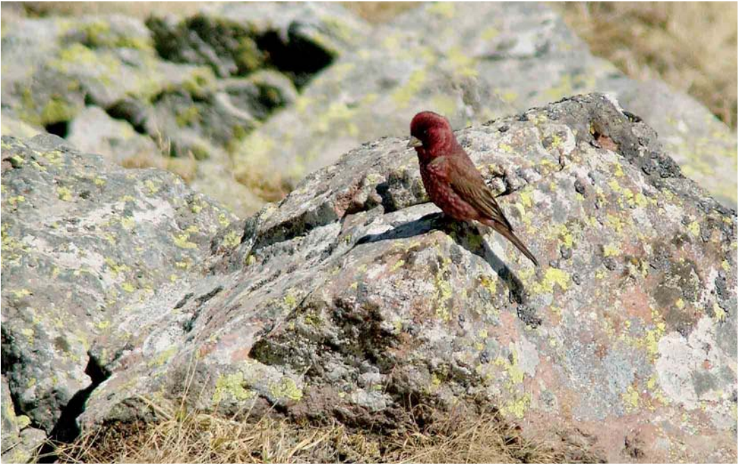
302-303 Caucasian Great Rosefinch / Grote Roodmus Carpodacus rubicilla , male, mount Kazbeg at 2900 m elevation, Kazbegi, Khevi, Georgia, 24 June 2005 (René Pop)