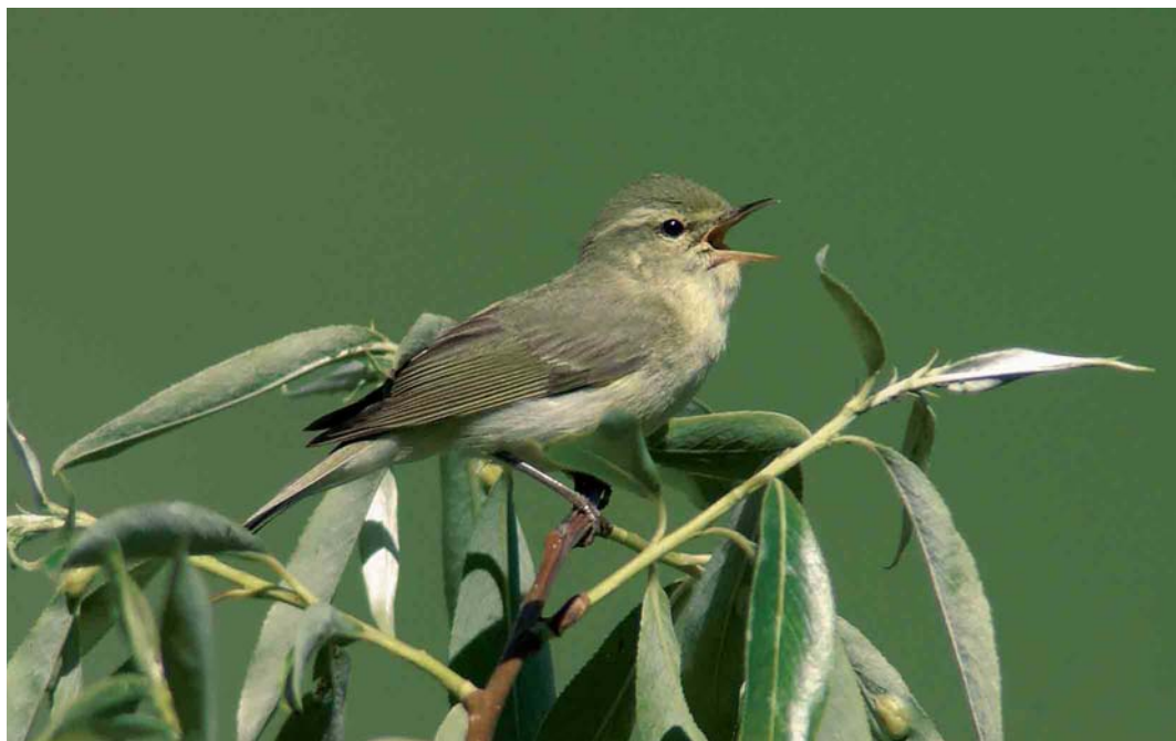
300 Bright-green Warbler / Groene Fitis Phylloscopus nitidus , Stepantsminda Hotel, Kazbegi, Khevi, Georgia, 23 June 2005