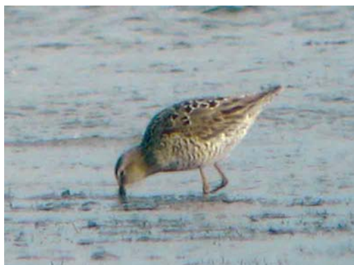
310 Steltstrandloper / Stilt Sandpiper Calidris himantopus , Ezumakeeg, Friesland, 7 juli 2004 (Martijn Bot)

De combinatie van bouw, grootte, lange lichtgebogen snavel, lange geelgroene poten en uniform grijs verenkleed past alleen op Steltstrandloper. In juni, toen de vogel voor een groot deel in zomerkleed was, was de determinatie uiteraard nog eenvoudiger (cf Sibley 2000, Svensson et al 2000). De leeftijdsbepaling is lastiger. Gezien het onvolledige zomerkleed (minder zwaar gebandeerd en met minder roodbruine tekening dan in volledig zomerkleed) en de niet geruide vleugelveren lijkt een eerste-zomer vogel het meest voor de hand te liggen omdat steltlopers soms in hun eerste zomer niet het volledig uitgekleurde adulte kleed bereiken. Het is echter lastig om een niet geheel doorgeruide adulte vogel uit te sluiten.