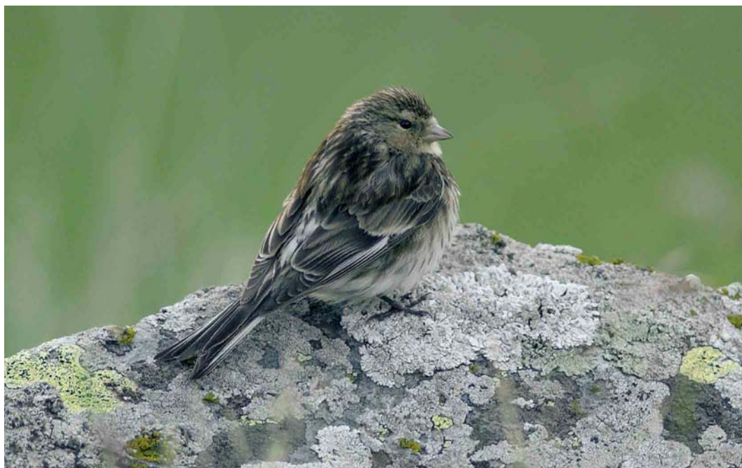
301 Turkish Twite / Turkse Frater Carduelis flavirostris brevirostris , mount Kuro, Kazbegi, Khevi, Georgia, 22 June 2005