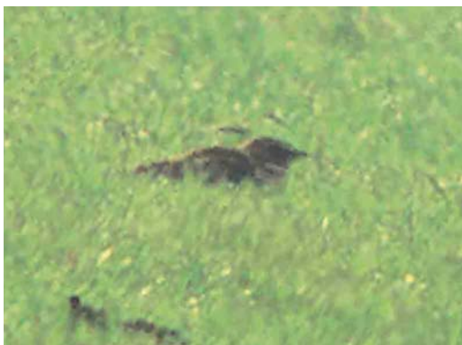
360 Kalanderleeuwerik / Calandra Lark Melanocorypha calandra , Eemshaven, Groningen, 27 mei 2005