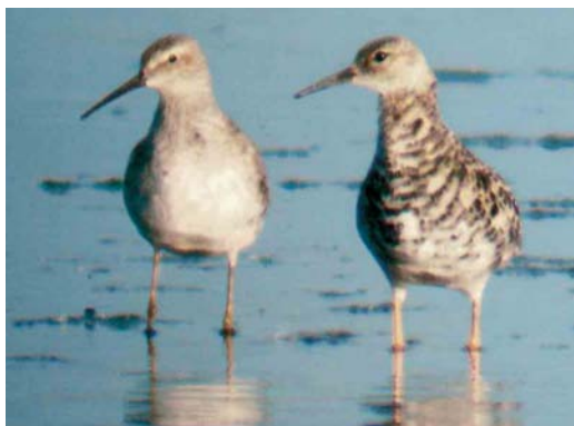
309 Steltstrandloper / Stilt Sandpiper Calidris himantopus , met Kempphaan / Ruff Philomachus pugnax , Ezumakeeg, Friesland, 16 mei 2004 (Bart-Jan Prak)