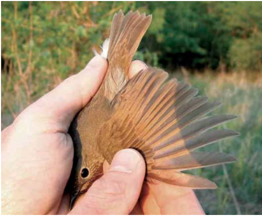
Mystery photograph VII (May)