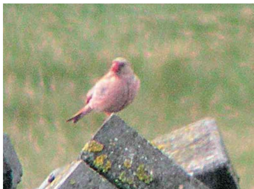
361 Woestijnvink / Trumpeter Finch Bucanetes githagineus , adult mannetje, Eemshaven, Groningen, 12 juni 2005

Deze waarneming is de tweede voor Nederland. De eerste was op 31 mei 2003 op de Maasvlakte, Zuid-Holland. De waarneming in de Eemshaven past in het patroon van een ware influx van Woestijnvinken in Europa in april-juni 2005. In totaal werden tot begin