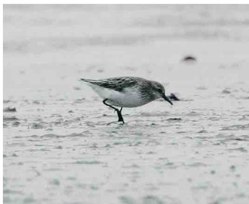
326 Slender-billed Gull / Dunbekmeeuw Larus genei , Ile de Noirmoutier, Vendée, France, 11 June 2005 327 Sabine's Gull / Vorkstaartmeeuw Larus sabini , Lago di Garlate, Lecco, Lombardia, Italy, May 2005 328 Lesser Crested Tern / Bengaalse Stern Sterna bengalensis , Banc d'Arguin, Arcachon, Gironde, France, June 2005 329 White-tailed Lapwing / Witstaartkievit Vanellus leucurus , Brake, Hannover, Niedersachsen, Germany, 7 June 2005 330 Caspian Plover / Kaspische Plevier Charadrius asiaticus , Rovaniemi, Finland, 3 June 2005 331 Semipalmated Sandpiper / Grijze Strandloper Calidris pusilla , Esbjerg, Jylland, Denmark, 30 May 2005