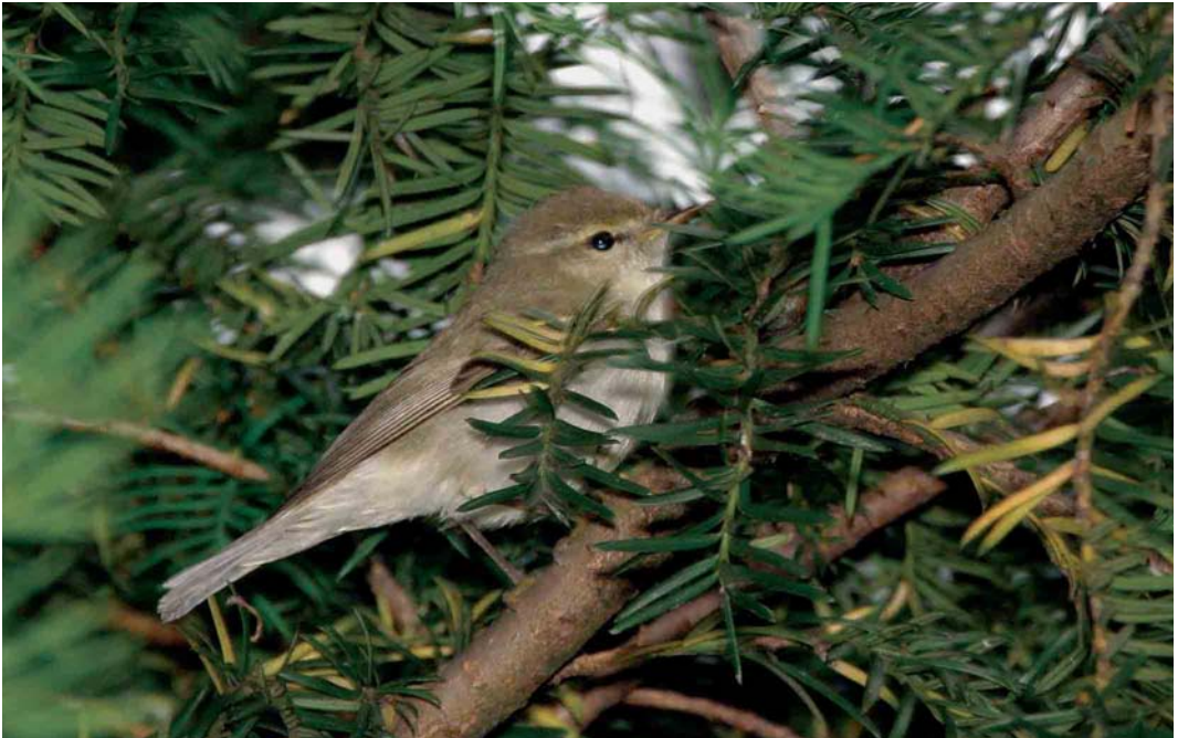
351 Grauwe Fitis / Greenish Warbler Phylloscopus trochiloides , Bodegraven, Zuid-Holland, juni 2005 (Phil Koken)