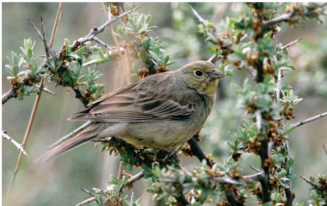
340 Cinereous Bunting / Smyrnagors Emberiza cineracea , Skagen, Nordjylland, Denmark, 28 May 2005 (Ole Krogh)