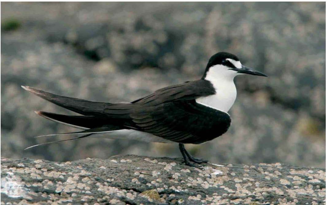
320 Sooty Tern / Bonte Stern Sterna fuscata , The Skerries, Anglesey, Wales, 8 July 2005