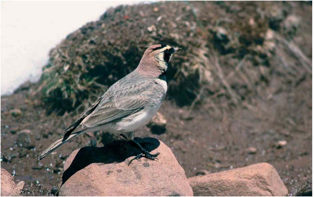
311-312 Atlas Horned Lark / Atlasstrandleeuwerik Eremophila alpestris atlas , Oukaimeden, High Atlas, Morocco, 5 April 2002