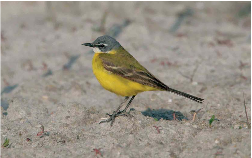
352 Waarschijnlijke Iberische Kwikstraat / probable Iberian Wagtail Motacilla iberiae , mannetje, Nieuwerkerk aan den IJssel, Zuid-Holland, 18 mei 2005