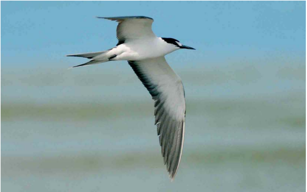
319 Sooty Tern / Bonte Stern Sterna fuscata , The Skerries, Anglesey, Wales, 10 July 2005