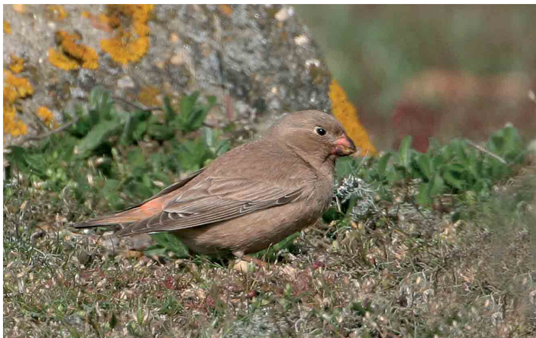
341 Trumpeter Finch / Woestijnvink Bucanetes githagineus , Landguard, Suffolk, England, 21 May 2005