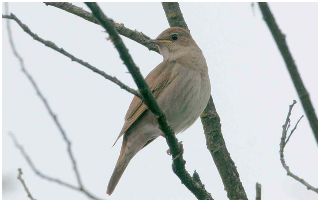
348 Noordse Nachtegaal / Thrush Nightingale Luscinia luscinia , Flevocentrale, Flevoland, 21 mei 2005 (Roland Jansen) 349 Orpheusspotvogel / Melodious Warbler Hippolais polyglotta , Swalmen, Limburg, 3 juni 2005 (Otto Plantema) 350 Orpheusspotvogel / Melodious Warbler Hippolais polyglotta , Arnemuïden, Zeeland, 12 juni 2005 (Pim A Wolf)