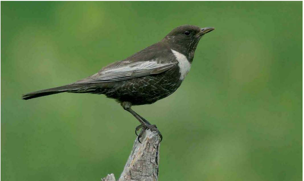
298 Caucasian Ring Ouzel / Kaukasische Beflijster Turdus torquatus amicornum , near Kobi, Khevi, Georgia, 21 June 2005 (René Pop)