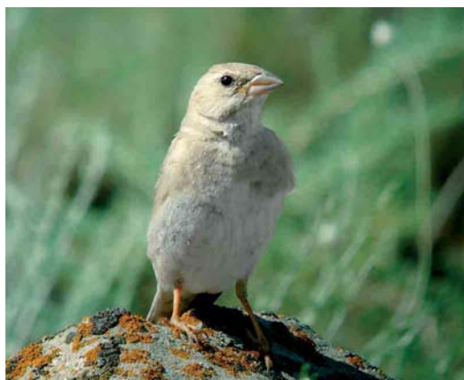
332 Steppe Grey Shrike / Steppeklapekster Lanius pallidirostris , Lågskär, Åland, Finland, 23 May 2005 333 Paddyfield Warbler / Veldrietzanger Acrocephalus agricola , Helgoland, Schleswig-Holstein, Germany, 3 June 2005 334 Marmora's Warbler / Sardijnse Grasmus Sylvia sarda , Skagen, Nordjylland, Denmark, 12 June 2005 335 Pale Rockfinch / Bleke Rotsmus Carpospiza brachydactyla , Oorts hills, Armenia, 15 June 2005

were in Outer Hebrides, Scotland, from 18 May until early June. The fifth Sabine's Gull L sabini for Italy was an adult-summer at Garlate, Lecco, Lombardia, on at least 17-18 May. An adult Audouin's Gull L audouinii turned up at St Ouen's Pond, Jersey, Channel Islands, at 07:00 on 31 May. A second-summer was present for 30 min at Beacon Pond, Spurn, East Yorkshire, in the afternoon of 1 June. The largest colony for Italy was found this spring in southern Sardinia where 600 pairs were counted. In the Netherlands, the number of nesting Black-legged Kittiwakes Rissa tridactyla on an oil rig at Friese Front (where the species bred for the first time in 2003 with three pairs) had increased to 45 pairs on 22 June 2005. A first-summer Ross's Gull Rhodostethia rosea was reported at Húsavík, Iceland, on 28 May. In northern Noord-Holland, the first breeding of Gull-billed Terns Gelochelidon nilotica for the Netherlands