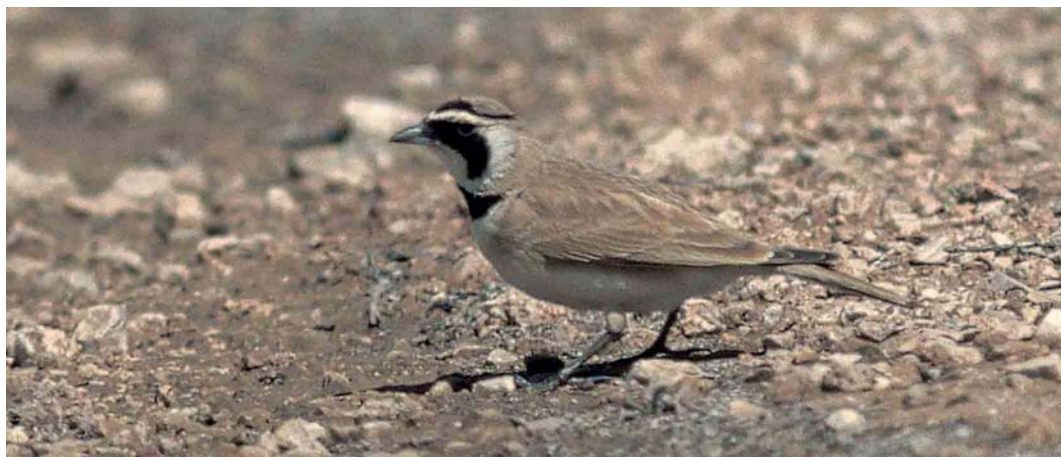
313 Temminck's Lark / Temmincks Strandleeuwerik Eremophila bilopha , Boumalne de Dadès, Morocco, 10 April 1997 (Arnoud B van den Berg)

Eurasian Horned by having, for instance, on average even longer horns, a wider black mask across the eye and down the cheek, a broader black breast band pointing upwards at the centre, paler grey upperparts, plainer, less streaky flanks suffused with grey, and a quite contrasting reddish-cinnamon crown, nape and uppermantle merging into the grey of the mantle. Below the cheek, the black mask narrows into a black line almost completely encircling the yellow throat by connecting with the pointed centre of the black breast band.