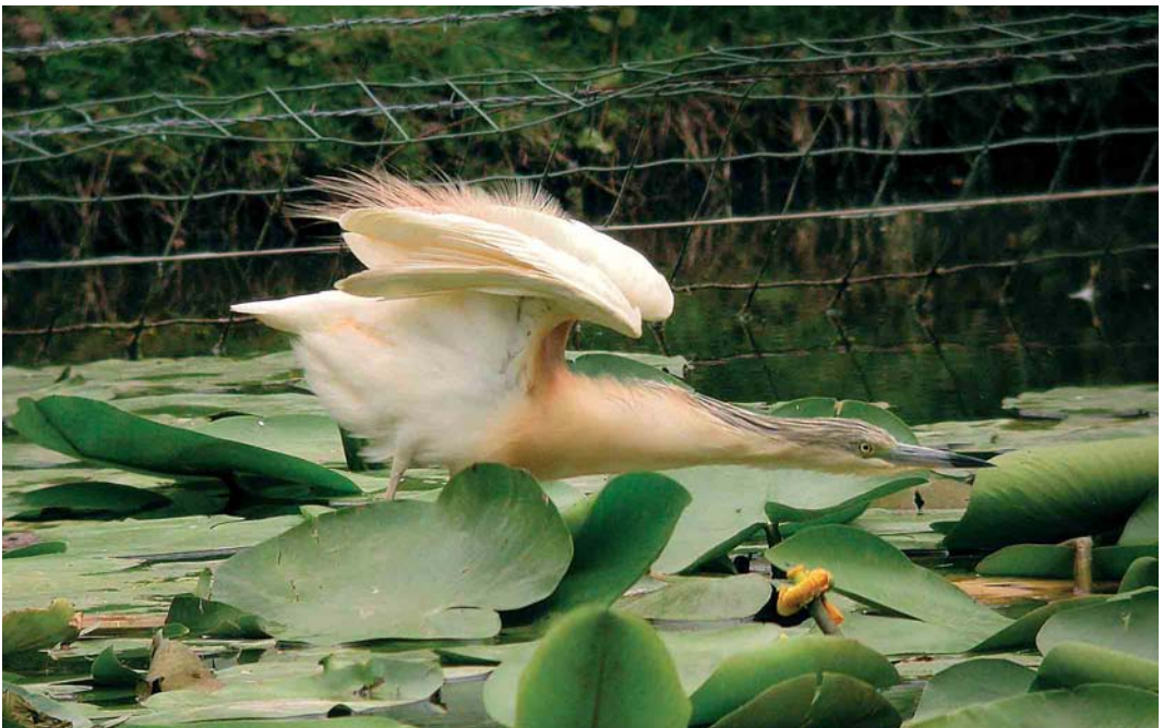
354 Ralreiger / Squacco Heron Ardeola ralloides , Kruikebeke, Oost-Vlaanderen, 26 juni 2005 (Vincent Legrand)