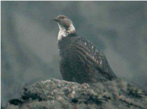
304 Caucasian Snowcock / Kaukasisch Berghoen Tetraogallus caucasicus , mount Kuro, Kazbegi, Khevi, Georgia, 12 June 2005 (Calum D Scott)