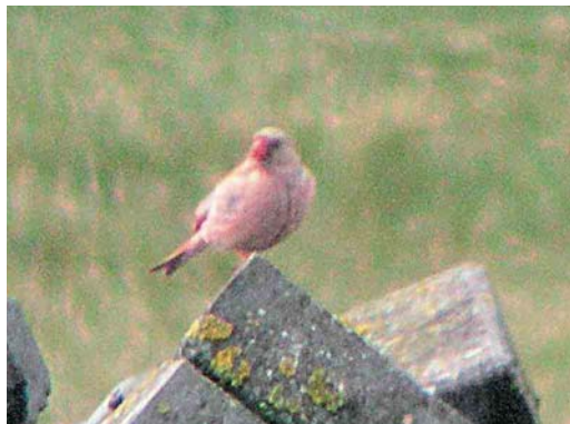
361 Woestijnvink / Trumpeter Finch Bucanetes githagineus , adult mannetje, Eemshaven, Groningen, 12 juni 2005

Deze waarneming is de tweede voor Nederland. De eerste was op 31 mei 2003 op de Maasvlakte, Zuid-Holland. De waarneming in de Eemshaven past in het patroon van een ware influx van Woestijnvinken in Europa in april-juni 2005. In totaal werden tot begin