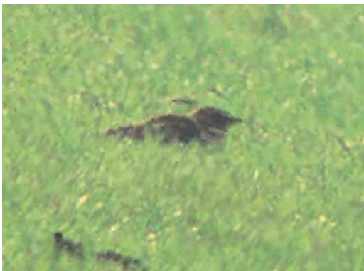
360 Kalanderleeuwerik / Calandra Lark Melanocorypha calandra , Eemshaven, Groningen, 27 mei 2005 (Martijn Bot)