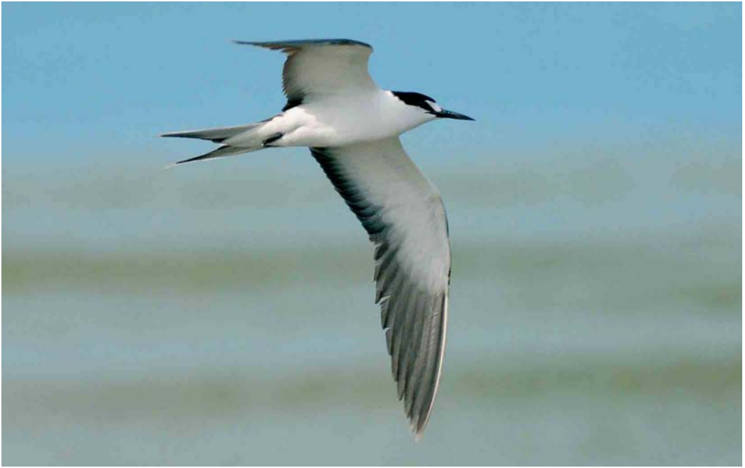
319 Sooty Tern / Bonte Stern Sterna fuscata , The Skerries, Anglesey, Wales, 10 July 2005