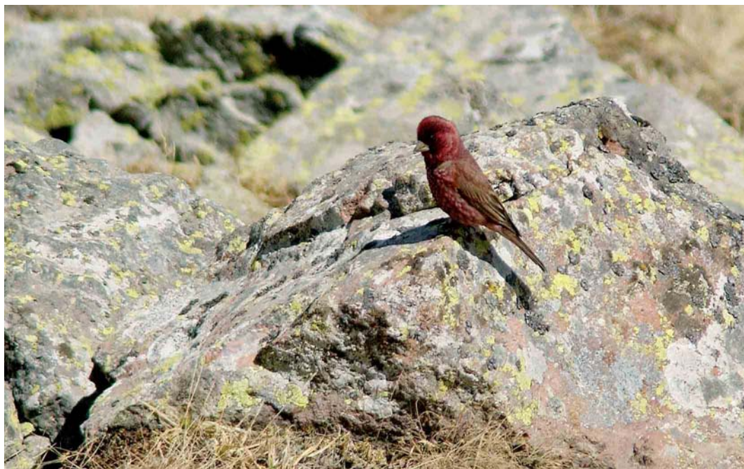
302-303 Caucasian Great Rosefinch / Grote Roodmus Carpodacus rubicilla , male, mount Kazbeg at 2900 m elevation, Kazbegi, Khevi, Georgia, 24 June 2005