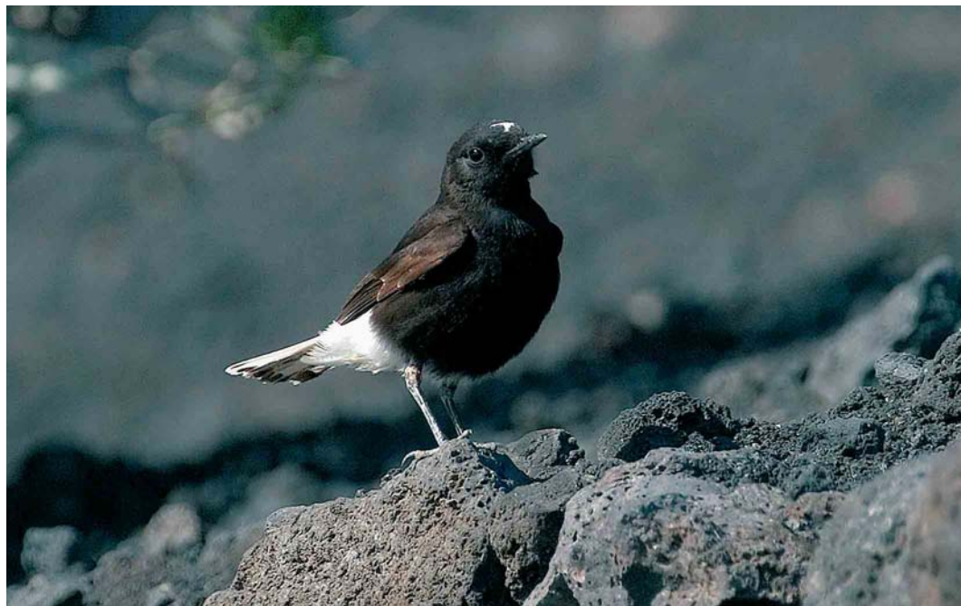
314 White-crowned Wheatear / Witkruintapuit Oenanthe leucopyga , first-year, La Palma, Canary Islands, Spain, 10 January 2005

If accepted by the Spanish rarities committee, this is the first record for the Canary Islands and the first for Spain. An old record of two birds (an immature and an adult male) at Sabinar del Marquez, Reserva Biológica de Doñana, Huelva, on 28 May 1977 (Soriquer 1978) has recently been reviewed and will not appear in the next version of the Spanish avifaunal list (Ricard Gutiérrez in litt). In western Europe, there have been just three previous records, in England (June 1982), Germany (May 1986, Category D) and Portugal (March 2001) (Tipper & Beale 2002). Other records in Europe are from Cyprus, Greece and Malta. Remarkably, the first for the Cape Verde Islands was reported near Fort Real on Santiago on 16 January 2005 (van den Berg 2005). White-crowned Wheatear breeds in rocky areas in deserts in North Africa and the Middle