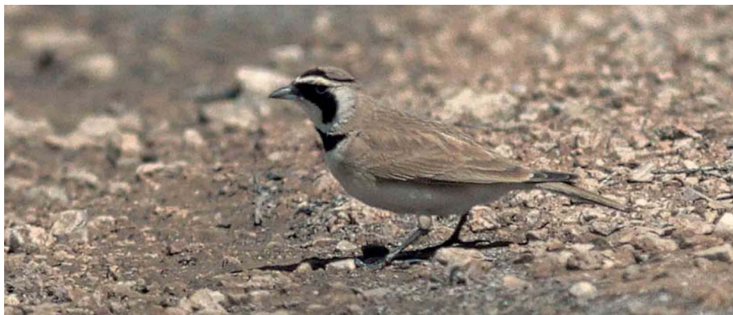
313 Temminck's Lark / Temmincks Strandleeuwerik Eremophila bilopha , Boumalne de Dadès, Morocco, 10 April 1997 (Arnoud B van den Berg)

Eurasian Horned by having, for instance, on average even longer horns, a wider black mask across the eye and down the cheek, a broader black breast band pointing upwards at the centre, paler grey upperparts, plainer, less streaky flanks suffused with grey, and a quite contrasting reddish-cinnamon crown, nape and uppermantle merging into the grey of the mantle. Below the cheek, the black mask narrows into a black line almost completely encircling the yellow throat by connecting with the pointed centre of the black breast band.