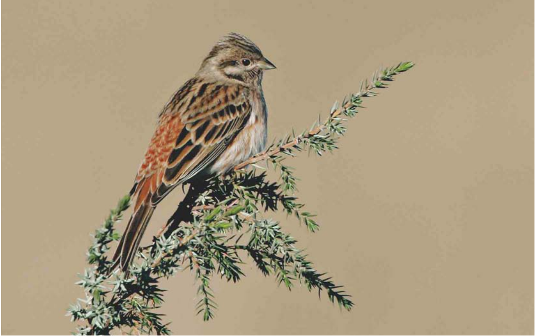
74 Pine Bunting / Witkopgors Emberiza leucocephalos , male, Macchia Lucchese, Toscana, Italy, November 2004 ( Daniele Occhiato )