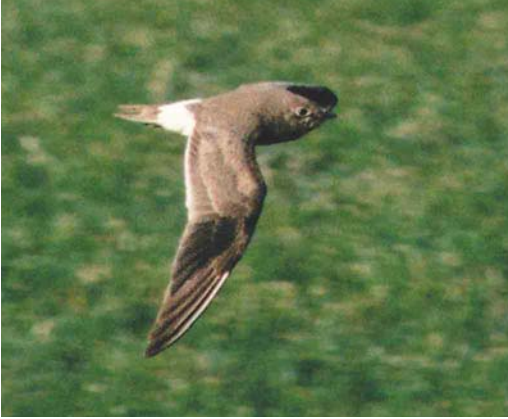
29 Collared Pratincole / Vorkstaartplevier Glareola pratincola , first-winter, Terneuzen, Zeeland, Netherlands, November 1987 (Patrick Beirens). Same bird as in plate 26. Short, juvenile tail reminiscent of Oriental Pratincole G maldivarum . Tips of juvenile secondaries buff instead of white (as in adults). Typically, secondary-tips are not sharply demarcated and lack dark sub-terminal markings, as would be the case in Oriental. Note that pale trailing edge gives the impression to protrude onto the tips of the inner primaries, as they have paler inner webs.