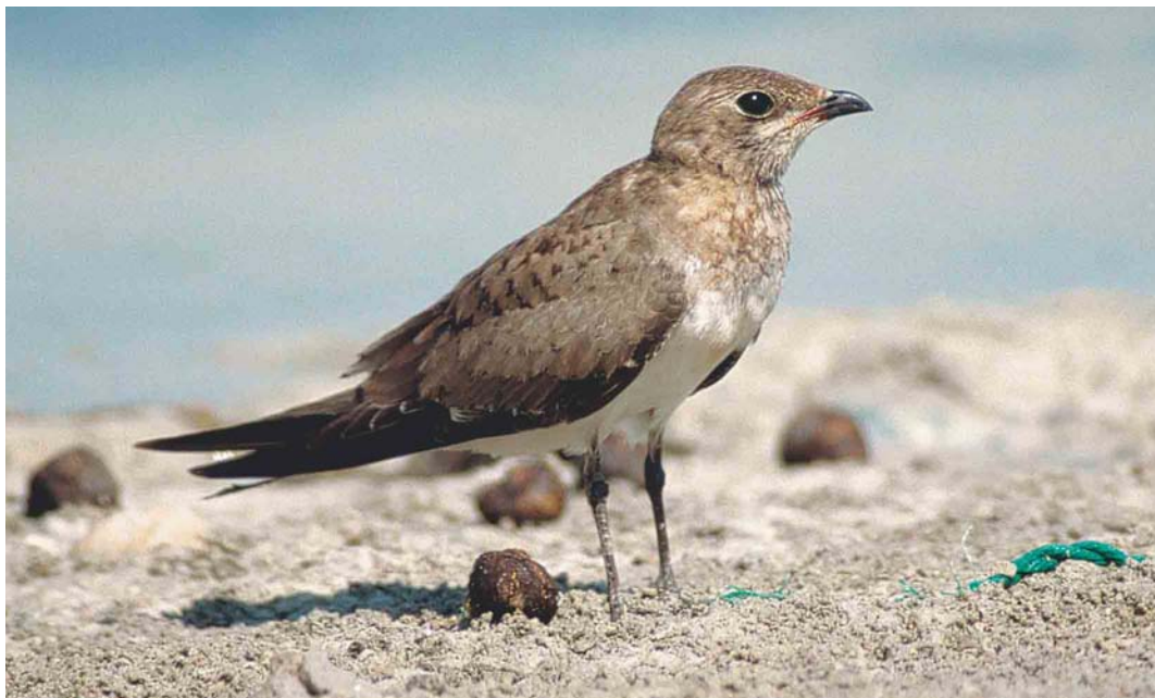
27-28 Collared Pratincole / Vorkstaartplevier Glareola pratincola , first-winter, Salalah, Oman, 9 November 2003. Worn first-winter, showing worn juvenile scapulars (pale tips have abraded) and greater coverts and pale-fringed juvenile primaries (thus pattern not useful) and ruffled tail-feathers. Tail length, grey-brown plumage tone and lack of obvious dark throat-surround are characters pointing to Collared. Nostril shape difficult to judge in plate 27 but slit-shape visible in plate 28. Whitish tips to secondaries only visible on outer secondary hanging down under greater coverts (more buff in juvenile Oriental Pratincole G maldivarum ).