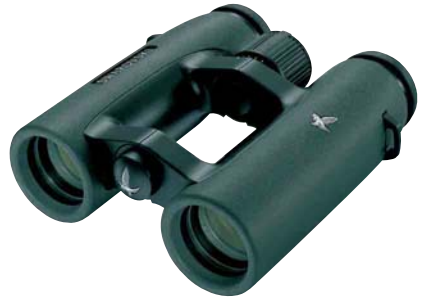
Swarovski 8x32 EL binoculars