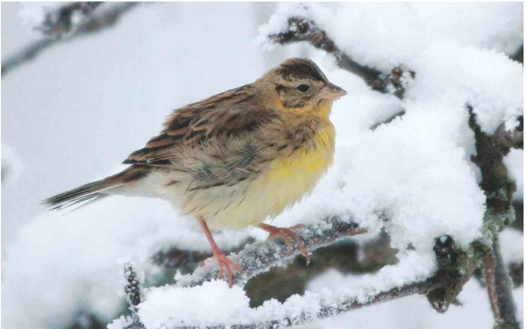
75 Yellow-breasted Bunting / Wilgengors Emberiza aureola , first-winter male, Hellkås, Telemark, Norway, 3 December 2004 ( Christian Tiller )