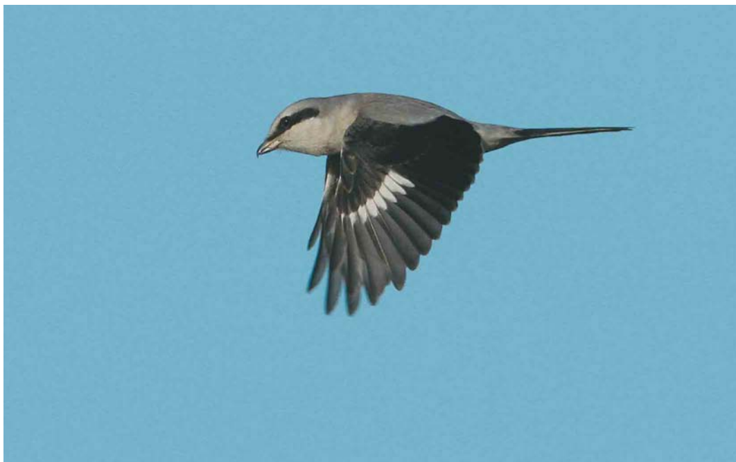
83 Klapekster / Great Grey Shrike Lanius excubitor , Zijdebrug, Alblasserwaard, Zuid-Holland, 24 december 2004