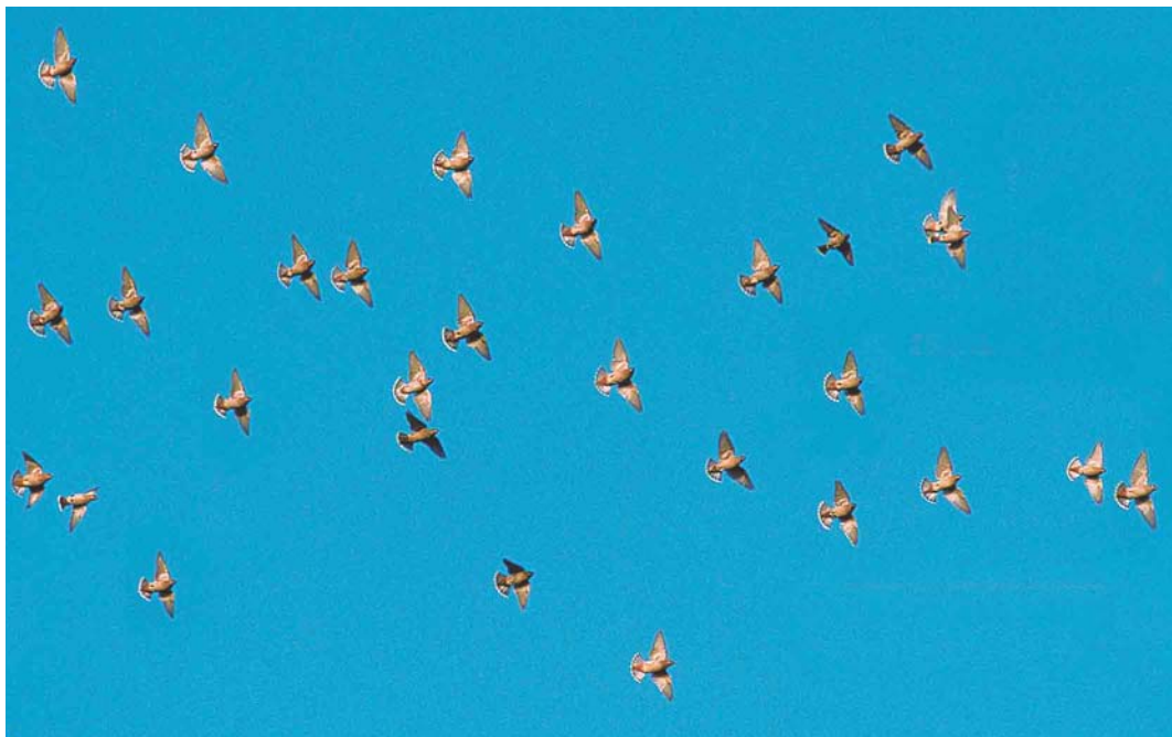
82 Pestvogels / Bohemian Waxwings Bombycilla garrulus , Den Haag, Zuid-Holland, 30 november 2004