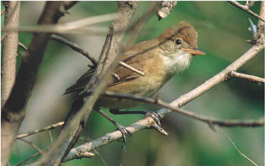
51 Thick-billed Warbler / Diksnavelrietzanger Acrocephalus aedon , Happy Island, Hebei, China, 19 May 2004

The only other remaining Acrocephalus war-