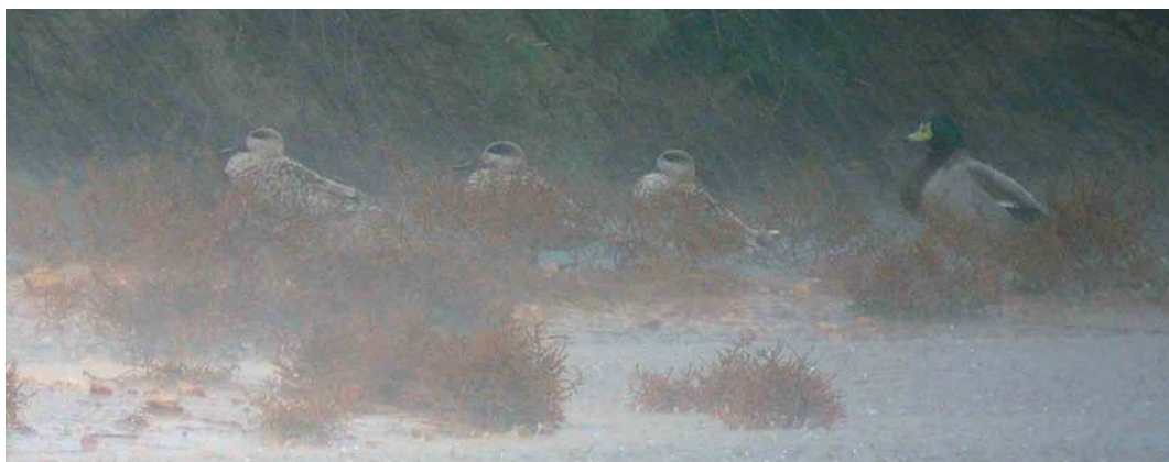
58 Laughing Gull / Lachmeeuw Larus atricilla , adult, Angelochori salt pools, Macedonia province, Greece, 13 January 2005 59 Laughing Gull / Lachmeeuw Larus atricilla , adult, San Remo, Liguria, Italy, 28 November 2004 60 Intermediate Egret / Middelste Zilverreiger Egretta intermedia , Yotvata, Israel, 6 November 2004 61 Greater Spotted Eagle / Bastaardarend, first-year, Camargue, Bouches-du-Rhône, France, 28 November 2004 62 Marbled Ducks / Marmereenden Marmaronetta angustirostris , with Mallard / Wilde Eend Anas platyrhynchos , male, Ghadira, Malta, 17 December 2004