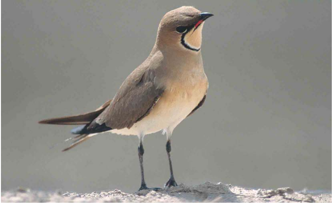
12 Collared Pratincole / Vorkstaartplevier Glaucopis trichotis , adult-summer, Sevilla, Andalucía, Spain, 26 April 2002 (Ray Tipper). Brightly coloured individual with darker forehead, black mouth-line, deep buff throat-patch, broad black-and-white throat-surround and orangy-buff wash on lower breast reminiscent of Oriental Pratincole G. maldivarum . Tail length clearly clinching identity as Collared. Beware that frontal view can produce high-legged impression in Collared as well! 13 Collared Pratincole / Vorkstaartplevier Glaucopis trichotis , adult-summer, Sevilla, Andalucía, Spain, 26 April 1999 (Ray Tipper). Nostril shape or presence of skin difficult to assess on other wise typical Collared.