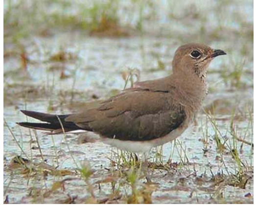
30 Oriental Pratincole / Oosterse Vorkstaartplevier Glareola maldivarum , first-winter, Japan, 18 August 2001. Leg length is hidden in this bird. A first-winter Collared Pratincole G pratincola with short tail could prove to be hard to tell apart. Some wing-coverts and at least one scapular are still juvenile. Also, the dull-coloured bill base points out that this is a first-winter bird which has completed its body moult, or nearly so. Inner four or five primaries are new. Probably a bird which hatched early in the season.

18 Darker lore in summer plumage Maldivarum in adult-summer plumage not only has somewhat more prominently marked black lores than pratincola but also has darker brown (almost blackish) sides of the forehead, which add to the impression that the black lores are prominent. Note that when strong light falls in a certain angle, also pratincola can appear to have broad dark lores and dark sides of the forehead but if the light is more neutral, on an overcast day – so that the lores can be properly judged – this difference can prove a useful supplementary character.