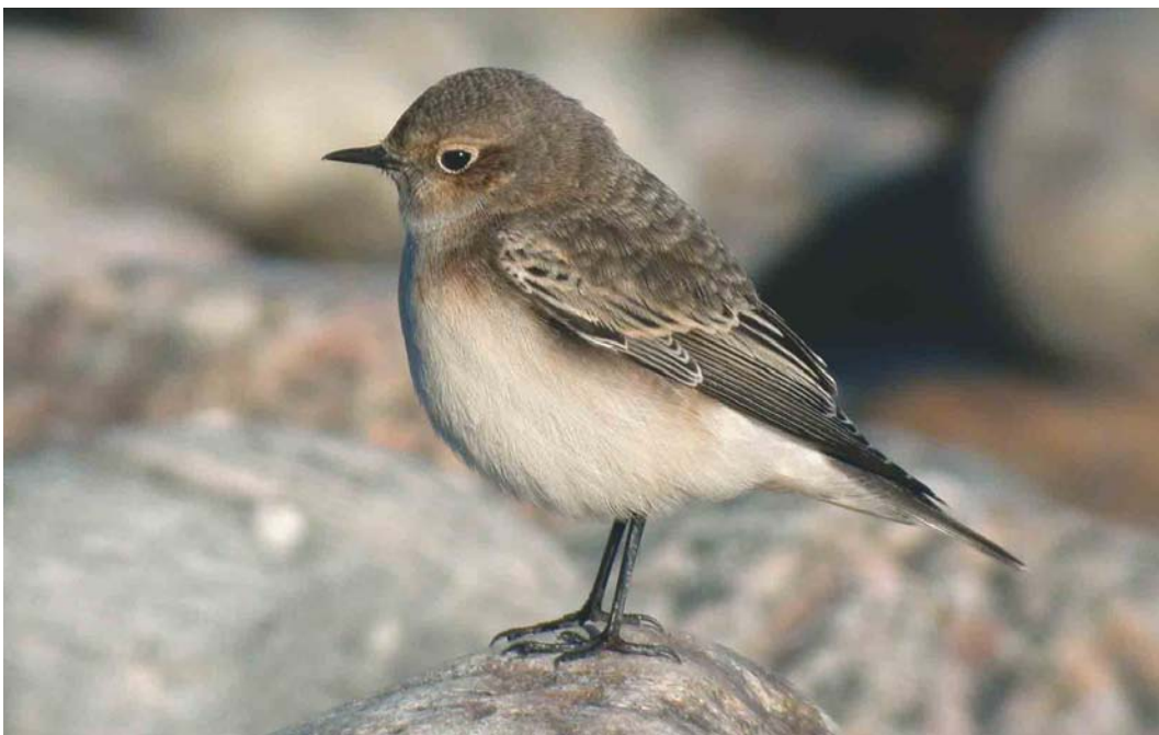
115 Pied Wheatear / Bonte Tapuit Oenanthe pleschanka , first-winter male, Falkenberg, Halland, Sweden, December 2003 ( Mikael Nord )