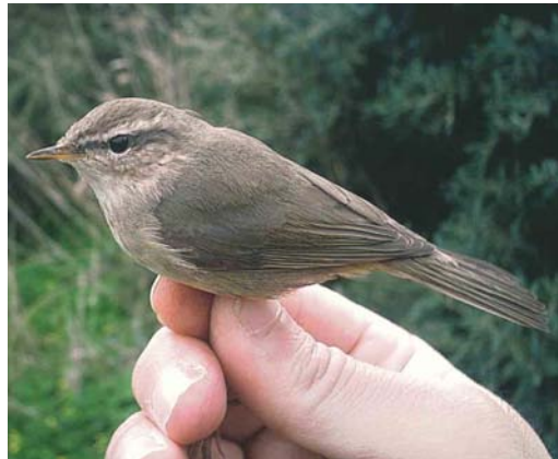
121 Dusky Warbler / Bruine Boszanger Phylloscopus fuscatus , Simar, Malta, 7 January 2004