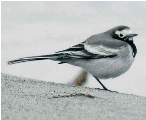
120 Masked Wagtail / Maskerkwikstaart Motacilla personata , first-winter male, Lista, Vest-Agder, Norway, November 2003