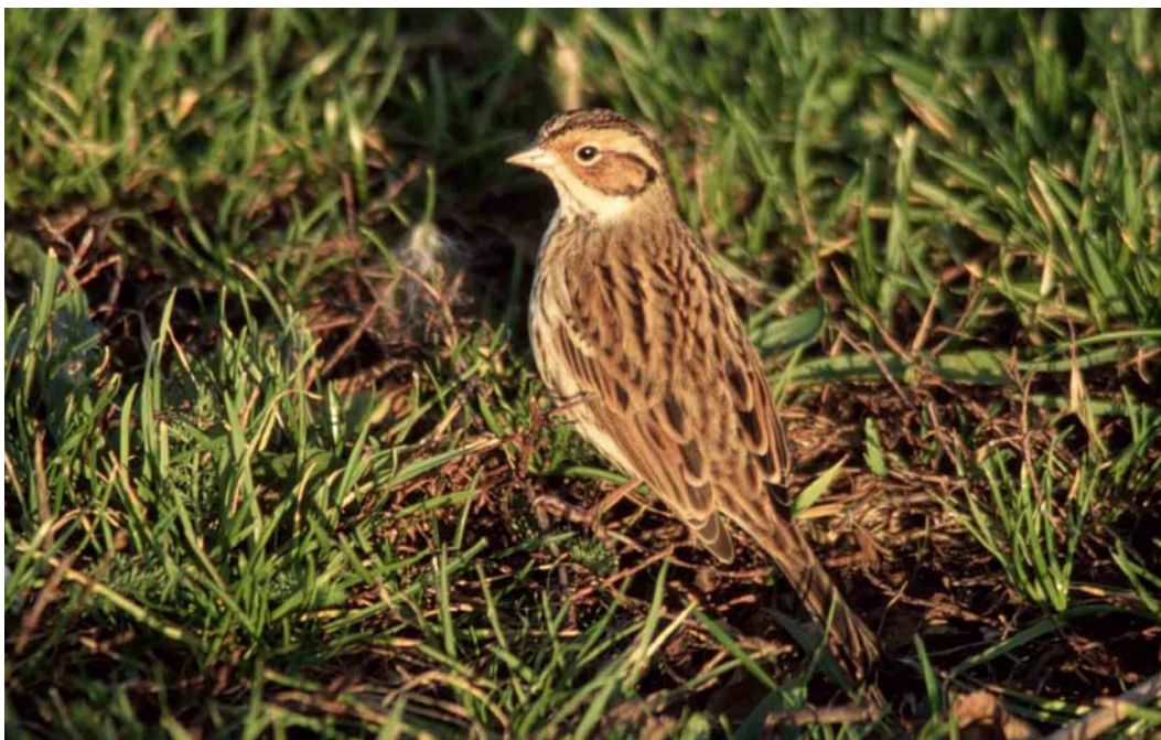
139 Dwerggors / Little Bunting Emberiza pusilla , eerste-winter, Nieuwpoort, West-Vlaanderen, 8 december 2003