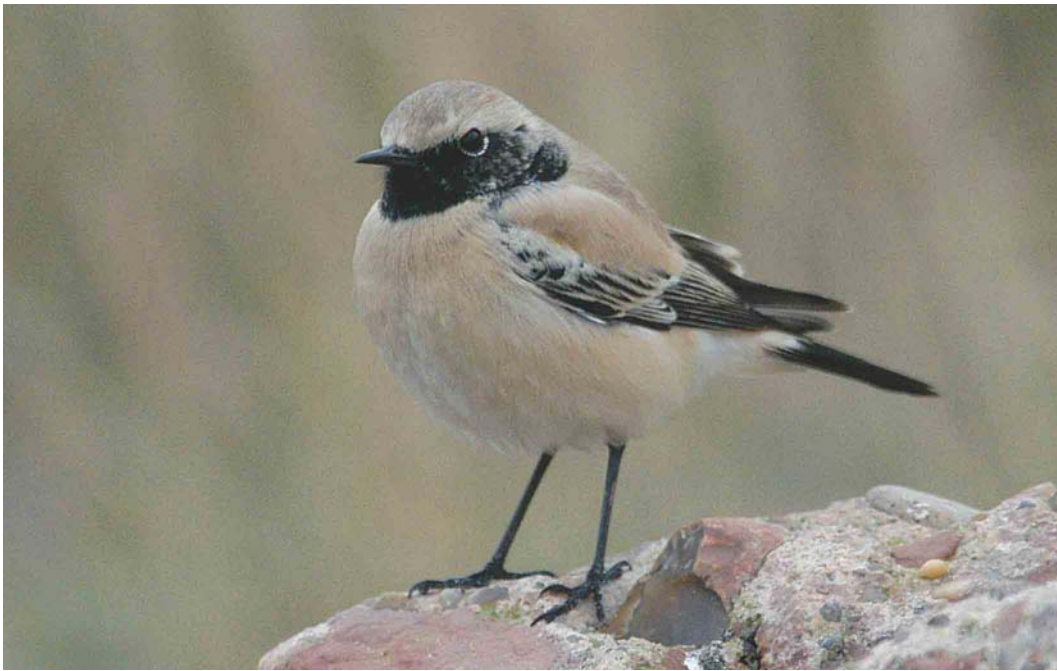
112 Desert Wheatear / Woestijntapuit Oenanthe deserti , male, Helgoland, Schleswig-Holstein, Germany, November 2003 (F Jackman)