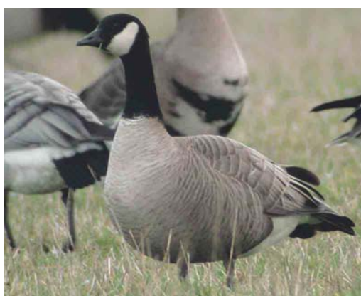
125 Siberische Tjiftjaf / Siberian Chiffchaff Phylloscopus collybita tristis , Lauwersoog, Groningen, 17 november 2003 (Oane Tol) 126 Vermoedelijke Westelijke Orpheusgrasmus / presumed Western Orpheaan Warbler Sylvia hortensis , Middelburg, Zeeland, 1 november 2003 (Bas van den Boogaard) 127 Bronskopeend / Falcated Duck Anas falcata , mannetje, Zurich, Friesland, 3 januari 2004 (Rob Versteeg) 128 Witkopeend / White-headed Duck Oxyura leucocephala , eerstejaars, Dijkwater, Zeeland, 21 november 2003 (Marten van Dijl) 129 Stormvogeltje / European Storm-petrel Hydrobates pelagicus (dood gevonden bij Langevelderslag, Zuid-Holland, op 13 december 2003), Amsterdam, Noord-Holland, 29 december 2003 (Vincent van der Spek) 130 Hutchins' Canadese Gans / Hutchins's Canada Goose Branta hutchinsii hutchinsii , Doniaburen, Friesland, 29 december 2003 (Leo J R Boon/Cursorius)