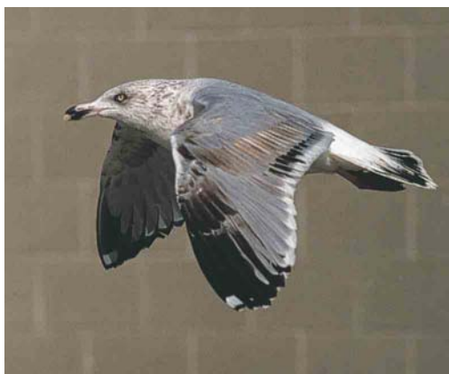
72 American Herring Gull / Amerikaanse Zilvermeeuw Larus smithsonianus , third-winter, Boston, Massachusetts, USA, February 1999 (Killian Mullarney). Note extensive black markings on secondaries.

than second-winter birds, and virtually all will have adult-like grey (rather than pale brownish) inner primaries (Martin Elliott pers comm).