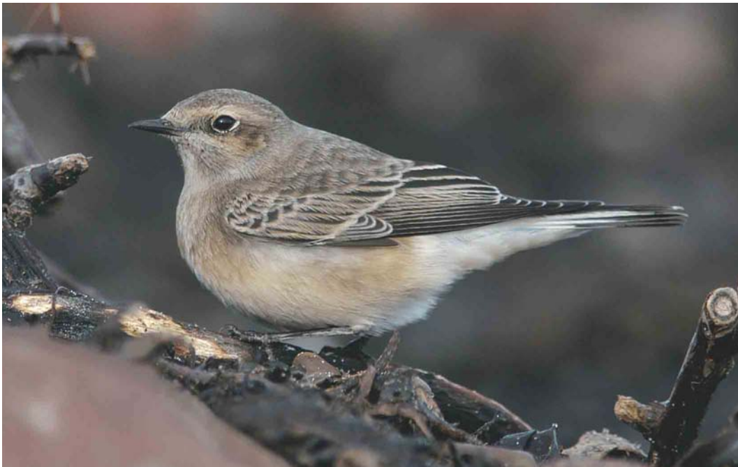
114 Pied Wheatear / Bonte Tapuit Oenanthe pleschanka , male, Helgoland, Schleswig-Holstein, Germany, November 2003