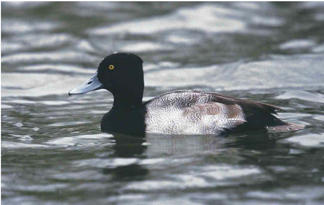
106 Lesser Scaup / Kleine Topper Aythya affinis , Huningue, Haut-Rhin, France, 30 November 2003 (Daniel Kratzer)