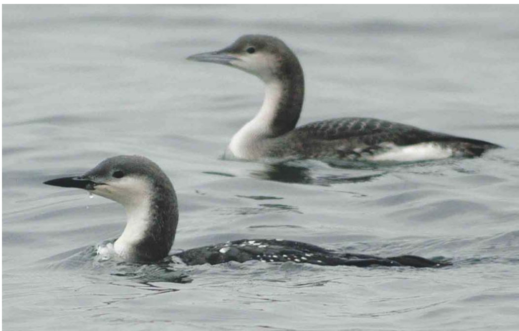
124 Parelduikers / Black-throated Loons Gavia arctica , adult (voor) en juveniel, Brouwersdam, Zeeland, 23 november 2003

sprong (voornamelijk Brandgans B leucopsis x Kleinste Canadese Gans). Er werden c 16 Roodhalsganzen B ruficollis , acht Witbuikrotganzen B hrota en vier Zwarte Rotganzen B nigricans gemeld. Bij het Wagejot op Texel werd vanaf 26 december een Witbuikrotgans gepaard met een Rotgans B bernicla en drie hybride jongen gezien. Een paar Rotgans en Zwarte Rotgans bij Oosterland op Wieringen, Noord-Holland, had één hybride jong. In de Haagse Waterleidingduinen, Zuid-Holland, werden op 3 december niet minder dan 27 Krooneenden Netta rufina geteld. Witoogeenden Aythya nyroca werden gezien tot 6 november bij Naarden, Noord-Holland, op 1 november op de Berkel bij Lochem, Gelderland, en bij De Blocq van Kuffeler, Flevoland, van 14 tot 16 november een mannetje en op 6 december een vrouwtje in de Botshol, Utrecht, vanaf 23 november op de plas Aquabest bij Eindhoven, Noord-Brabant, met op 10 december hier zelfs twee, op 7 en 31 december bij Heel, Limburg, en op 10 en 11 december bij Alphen aan den Rijn, Zuid-Holland. Een eerstejaars Witkopeend Oxyura leucocephala verbleef van 20 tot 23 november op het Dijkwater bij Sirjansland, Zeeland, en op 24 en 25 november werd naar wordt aangenomen dezelfde vogel gezien in de Prunjepolder, Zeeland. Een – mogelijk eerste-winter – mannetje Bronskopeend Anas falcata werd vanaf 23 december onregelmatig binnen- en buitendijks waargenomen ten zuiden van Harlingen, Friesland. Een mannetje Amerikaanse Smient A americana pleisterde van