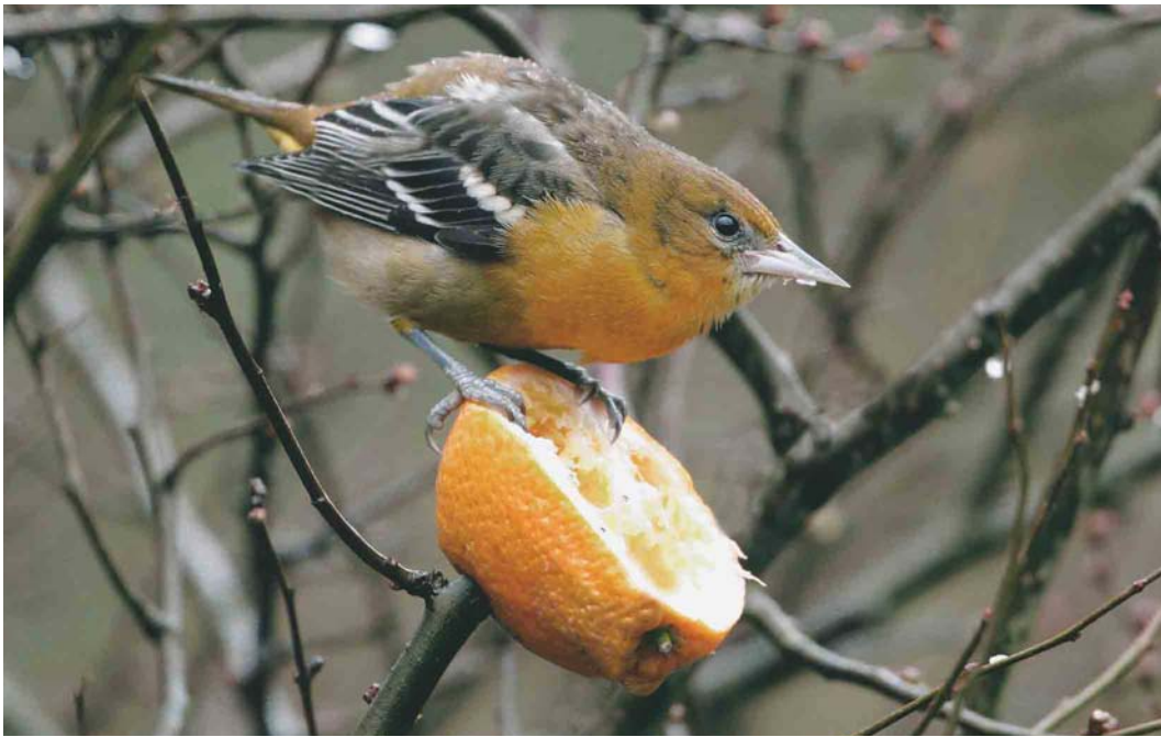
116 Baltimore Oriole / Baltimoretroepiaal Icterus galbula , Headington, Oxford, Oxfordshire, England, 29 December 2003