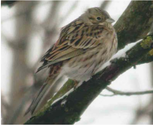
136 Hybride Witkopgors x Geelgors / hybrid Pine Bunting x Yellowhammer Emberiza leucocephalos x citrinella , vrouwtje, Hoegaarden, Vlaams-Brabant, 2 januari 2004 (Kris De Rouck)