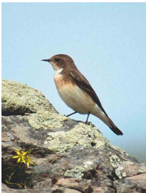
99-101 Pied Wheatear / Bonte Tapuit Oenanthe pleschanka , pale-throated ('vittata') morph, female, Chokpak pass, Kazakhstan, April 2002. Combination of upperparts colour, very pale throat without any dusky colouration, orangy-brown breast-band and brownish smudge on breast-sides makes this bird look extremely similar to a number of female Eastern Black-eared Wheatears O melanoleuca and these birds may not be identifiable with certainty. This bird was paired with a 'normal' male Pied Wheatear (see plate 102).