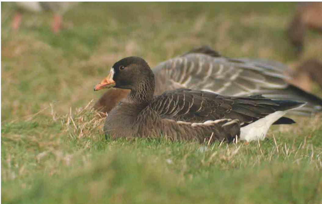
135 Groenlandse Kolgans / Greenland White-fronted Goose Anser albifrons flavirostris , juveniel, Uitkerke, West-Vlaanderen, 22 december 2003 (Koen Verbanck)

bergen, Oost-Vlaanderen, en van 19 tot 23 december was een tweede te zien in de Bourgoyen bij Gent, Oost-Vlaanderen. In november werden in totaal negen en in december zes Krooneenden Netta rufina gemeld. Het mannetje Ringsnaveleend Aythya collaris dat op 16 en 31 december werd gezien op de Meerdamplas in Dendermonde, Oost-Vlaanderen, was wellicht dezelfde vogel die eerder verbleef bij Waasmunster, Oost-Vlaanderen. De vogel van Blokkersdijk, Antwerpen, keerde na 13 jaar niet meer terug. Witoogeenden A nyroca werden gezien in Harelbeke en bij Maaseik, Limburg, op 1 november; te Lier-Duffel vanaf 9 november; in Boorseme, Limburg, op 11 november; in Zevegem, Oost-Vlaanderen, op 4 december; in Brecht (twee van dubieuze origine vanaf 10 december); en in Boom-Niel, Antwerpen, van 13 tot 19 december. Van 1 tot 10 november verbleef een Ijseend Clangula hyemalis op de Skiput in De Pinte, Oost-Vlaanderen, en op 25 december één bij Pommeroeul, Hainaut; op 29 december trok er één langs Oostende, West-Vlaanderen. Een mannetje Brilzee-eend Melanitta perspicillata zwom op 5 december weer op zee voor Oostduinkerke, West-Vlaanderen. Enkele goede trekdagen in Oostende resulteerden in 286 kleine duikers Gavia stellata/arctica op 27 en 398 op 29 december. Parelduikers G arctica werden gezien bij De Panne, West-Vlaanderen (32, met 14 op 29 december); Heist, West-Vlaanderen (twee); Hensies, Hainaut; Kruikebe, Oost-Vlaanderen; op het Lac de la Plate-Taille; in Lier;