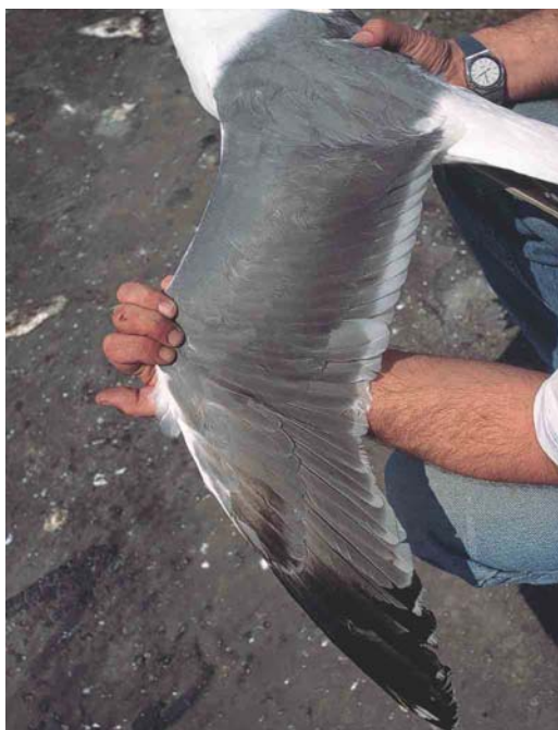
89 Geelpootmeeuw / Yellow-legged Gull Larus michahellis , derde-zomer mannetje (wit = / rood 4), IJmuiden, Noord-Holland, 3 juni 1996. Zelfde vogel als in plaat 87-88. Bovenvleugel met donkere tekening op handdekveren duidt op derde-zomer.