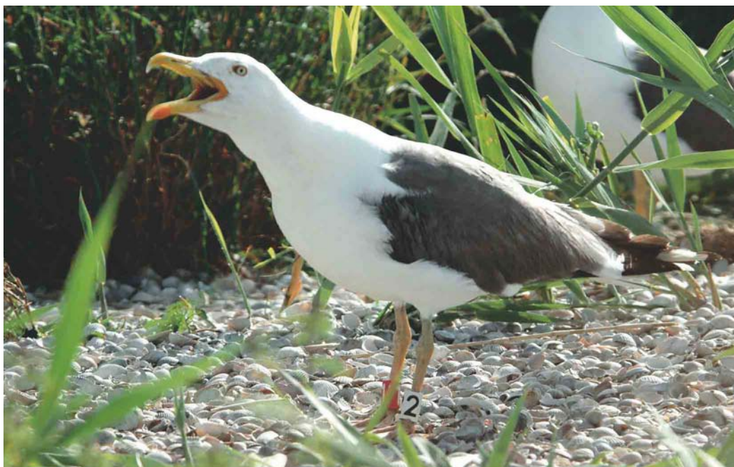
94-95 Hybride geelpootmeeuw / hybrid yellow-legged gull Larus , negen jaar oud, geslacht onbekend (wit 2 / rood 1), nazaat van 'stammoeder' in plaat 90 (wit = / rood 9), Holendrecht, Amsterdam, Noord-Holland, 25 juni 2003. Vogel lijkt op 'forse' Kleine Mantelmeeuw L. fuscus graellsii ; kleur van bovendelen lijkt iets te donker voor Geelpootmeeuw L. michahellis .

Geelpootmeeuwcomplex van IJmuiden: in hoeverre zijn geelpootmeeuwen echte Geelpootmeeuwen?