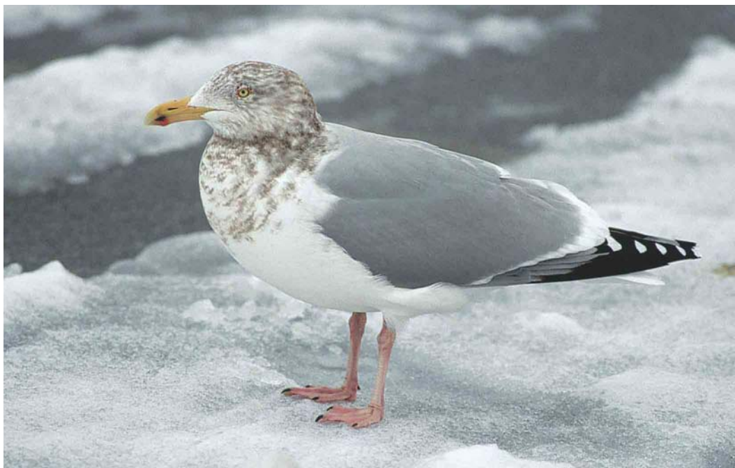
83 American Herring Gull / Amerikaanse Zilvermeeuw Larus smithsonianus, adult, Boston, Massachusetts, USA, January 2001. Note rather blotchy head pattern and very fine blackish shaft-streaks on primary coverts.