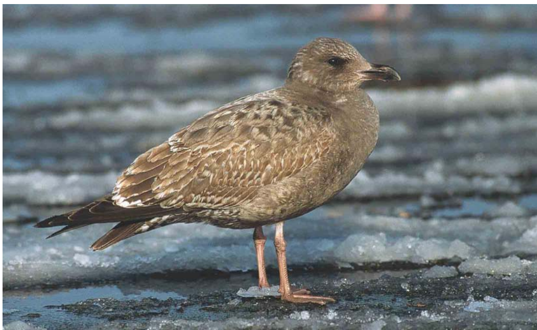
38 American Herring Gull / Amerikaanse Zilvermeeuw Larus smithsonianus , first-winter, Boston, Massachusetts, USA, January 2001 ( Killian Mullarney ). Very dark-headed bird. Note rather 'plain' rear-most (second generation) scapulars; also that one inner median covert has been moulted. 39 American Herring Gull / Amerikaanse Zilvermeeuw Larus smithsonianus , first-winter, Boston, Massachusetts, USA, January 2001 ( Pat Lonergan ). Not particularly pale-headed individual but note very solid-dark colouration on lower hindneck, mantle and underparts.