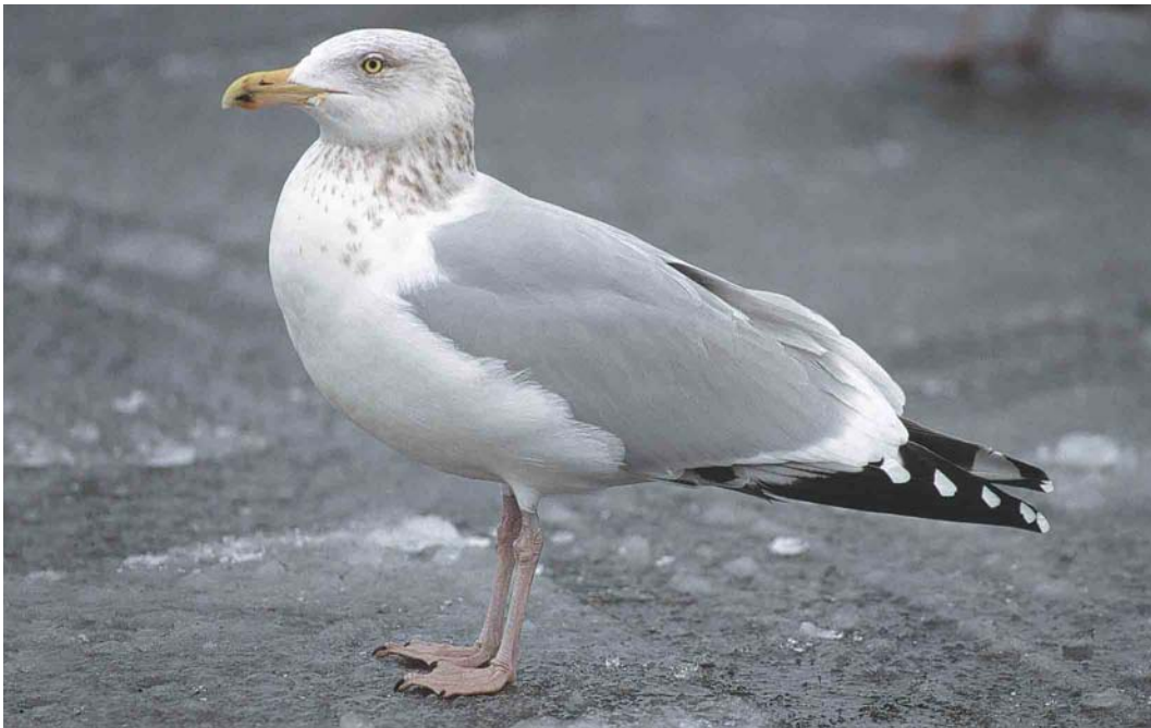
84 American Herring Gull / Amerikaanse Zilvermeeuw Larus smithsonianus , near-adult, Boston, Massachusetts, USA, January 2001 ( Pat Lonergan ). Note very well-defined, solid-black centre to primary coverts.