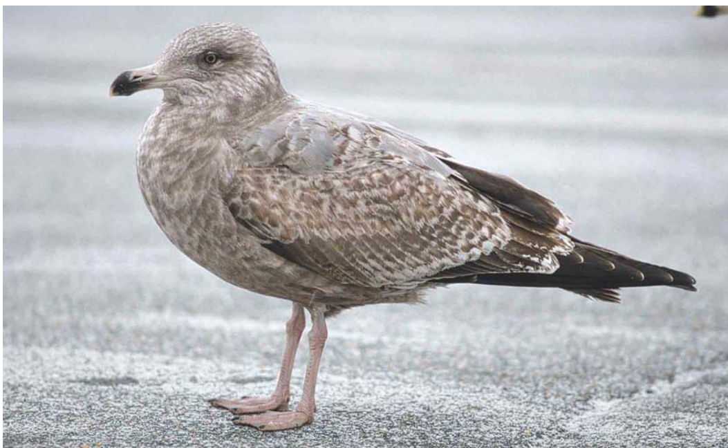
53 American Herring Gull / Amerikaanse Zilvermeeuw Larus smithsonianus , second-winter, Boston, Massachusetts, USA, January 2001 ( Pat Lonergan ). Note rather solidly dark hindneck, extensively brown underparts and reduced pale markings on tertial-tips. Dark greater-covert panel is not exclusive to smithsonianus . 54 American Herring Gull / Amerikaanse Zilvermeeuw Larus smithsonianus , second-winter, Boston, Massachusetts, USA, February 1999 ( Pat Lonergan ). Note rather uniform mantle and underparts and lack of barring in upperparts, a pattern seldom if ever seen in second-winter European Herring Gull L. argentatus .