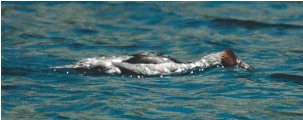
Mystery photograph I (July)

the Netherlands during 1998-2000, edited and donated by SOVON Vogelonderzoek Nederland. Swarovski Benelux generously agreed to sponsor this competition again in 2004. This year, the overall winner after six rounds will receive a Swarovski ATS 65 telescope, with a 20-60x zoom eyepiece.