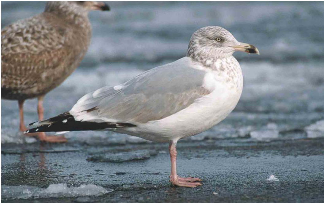
67 American Herring Gull / Amerikaanse Zilvermeeuw Larus smithsonianus , third-winter, Boston, Massachusetts, USA, January 2001 ( Killian Mullarney )