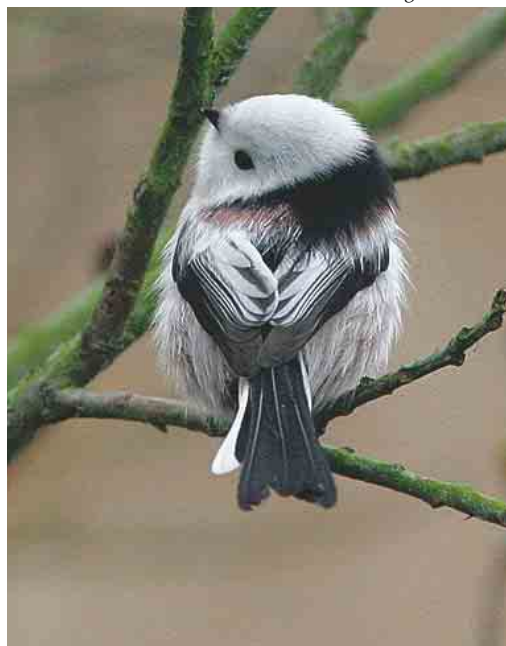
140 Witkopstaartmees / White-headed Long-tailed Tit Aegithalos caudatus caudatus , Makkum, Friesland, 29 november 2003 (Bas van den Boogaard)

Onderzoek door Justin Jansen in de collecties van de natuurhistorische musea in Leiden, Zuid-Holland (NNM), en Tring, Engeland (NHM), en door Maarten-Pieter Lantsheer in Amsterdam, Noord-Holland (ZMA), bracht aan het licht dat er ten minste één overtuigende Witkopstaartmees in Nederland is verzameld, door A van Bemmelen op 1 november 1859 te Leiden, Zuid-Holland. In de Leidse collectie bevinden zich voorts verschillende exemplaren uit hetzelfde en het volgende jaar met gemengde kenmerken van A c caudatus en A c europaeus . In Nederland zijn geen ringvangsten