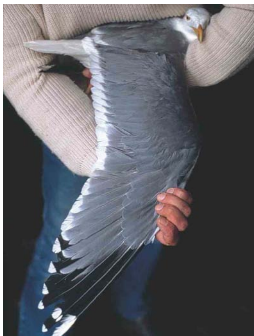
90 Hybride geelpootmeeuw / hybrid yellow-legged gull Larus , adult vrouwtje ('stammoeder' wit = / rood 9), IJmuiden, Noord-Holland, 23 mei 1994. Bovenvleugel; patroon op vleugelpunt vertoont gelijk-nis met Geelpootmeeuw L. michahellis .

door één of meerdere Vossen Vulpes vulpes werden verstoord waarna de vestiging van meeuwen op daken in de volgende jaren behoorlijk toenam. Deze vogel heeft ons veel informatie verschaft, omdat zij in ieder geval tot en met 2002 op dezelfde plek broedde. Zo konden gegevens verzameld worden over de eieren en kuikens (die vanaf 1994 allemaal werden gekleuringd). Op 12 mei 1997 werd zij teruggevangen op het nest waarbij bloed voor mtDNA-onderzoek werd afgenomen en kleurringen werden aangebracht (aan de linkerpoot een witte ring met twee bars (dwarsbanden) en aan de rechterpoot een rode ring met inscriptie 9; hierna weergegeven als wit = / rood 9). Verschillende pogingen om haar partner, een Kleine Mantelmeeuw, te vangen en te kleurringen mislukten.