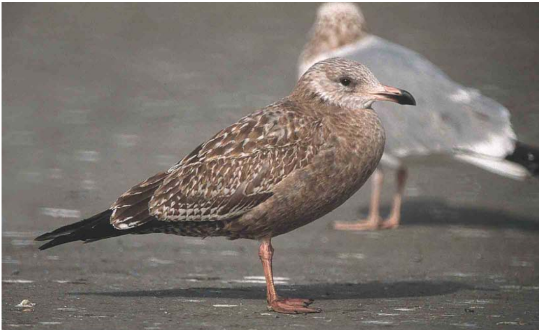
36 American Herring Gull / Amerikaanse Zilvermeeuw Larus smithsonianus , first-winter, Boston, Massachusetts, USA, February 1999 (Pat Lonergan). Very distinctive individual with bicoloured bill, contrastingly pale head, dark lower hindneck continuous with uniformly dark underparts and many retained juvenile scapulars. Note dark base to greater coverts and dense patterning on vent and undertail-coverts. 37 American Herring Gull / Amerikaanse Zilvermeeuw Larus smithsonianus , first-winter, Boston, Massachusetts, USA, January 2001 (Pat Lonergan). Note pronounced greater-covert bar, and that, unusually for second calendar-year smithsonianus , bill has acquired very little pale at base.