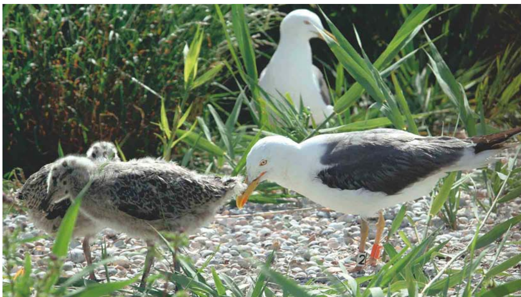
96 Hybride geelpootmeeuw / hybrid yellow-legged gull Larus , negen jaar oud, geslacht onbekend (wit 2 / rood 1), nazaat van 'stammoeder' in plaat 90 (wit = / rood 9), Holendrecht, Amsterdam, Noord-Holland, 25 juni 2003. Zelfde vogel als in plaat 94-95.

ringen en Martijn de Jonge voor het ter beschikking stellen van fotomateriaal en informatie over de hybride bij Holendrecht.