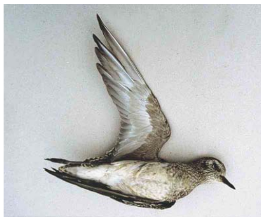
146-147 Amerikaanse Goudplevier / American Golden Plover Pluvialis dominica , eerste-winter, Hindeloopen, Friesland, 8 december 2003 (Joop Jukema)

bovendelen met mantel, rug, en schouderveren waren zwart met kleine vuilwitte stippen en met enkele gele stipjes. De kop was donker met contrasterende witgrijze wenkbrauwstreep. De volgende biometrische gegevens zijn verzameld: vleugellengte 187 mm, tarsuslengte 41.1 mm, snavelengte 22.1 mm, lengte van snavel en kop 57.5 mm, handpenprojectie 6/7 en gewicht 155 g.