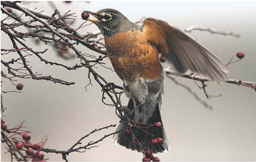
118-119 American Robin / Roodborstlijster Turdus migratorius , Grimsby, Lincolnshire, England, 4 January 2004