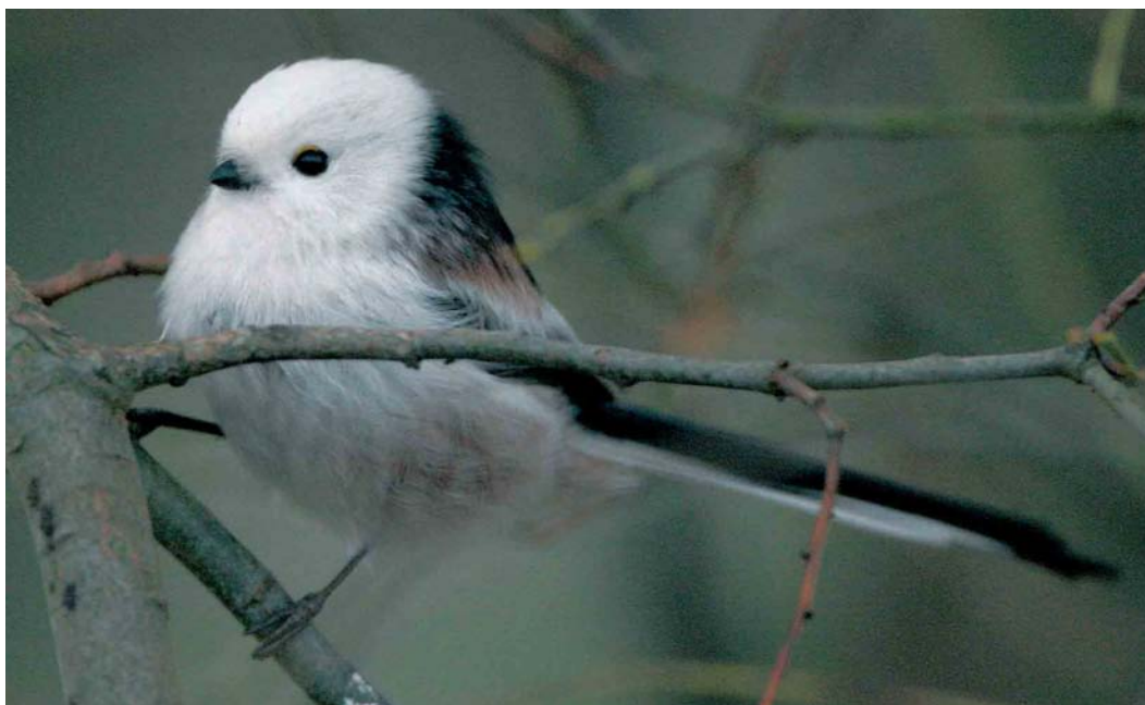
141 Witkopstaartmees / White-headed Long-tailed Tit Aegithalos caudatus caudatus , Makkum, Friesland, 29 november 2003 (Bas van den Boogaard)

bekend waarvan onomstotelijk vaststaat dat het Witkopstaartmezen betrof. Alle eerder gepubliceerde foto's van (mogelijke) Witkopstaartmezen in Nederland bleken na bestudering exemplaren uit de brede overgangszone van A c caudatus en A c europaeus of een A c europaeus met witte kop niet uit te sluiten. Eén van de weinige artikelen over voorkomen en herkenning van Witkopstaartmees in Nederland werd gepubliceerd door Koen van Dijken in Taxon 1: 10-14, 1997. De twee foto's van een witkoppige Staartmees in januari 1992 in Groningen, Groningen, bij dit artikel laten een vogel zien met veel kenmerken van Witkopstaartmees maar de vlektekening op het achterhoofd en de donkere flanken geven aan dat er toch sprake is van intermediaire of hybride kenmerken.