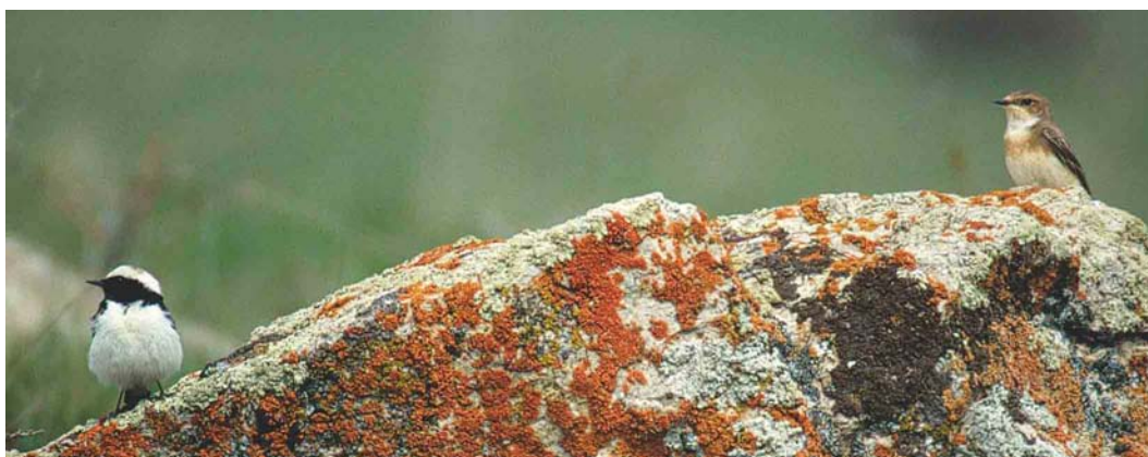
102 Pied Wheatears / Bonte Tapuiten Oenanthe pleschanka , Chokpak pass, Kazakhstan, April 2002 (Arend Wassink). Pale-throated ('vittata') morph female (right); same bird as in plate 99-101. This female was paired with a 'normal' male Pied Wheatear (left).

Observers should be aware that a number of 'vittata' females can look extremely similar to pale-throated and plain-faced melanoleuca females. Such 'vittata' females have also been recorded in the eastern part of the breeding range of pleschanka , for instance in western China (Hadoram Shirihai in litt), where melanoleuca is not present and, if reliably recorded, would be a true vagrant. In the field, they cannot be safely distinguished from melanoleuca . Even in the hand, the identification is difficult because of the large overlap in measurements (cf plate 99-102). The only reliable difference in the hand is the colouration of the basis to the throat-feathers, dark grey in 'vittata' and whitish in melanoleuca .