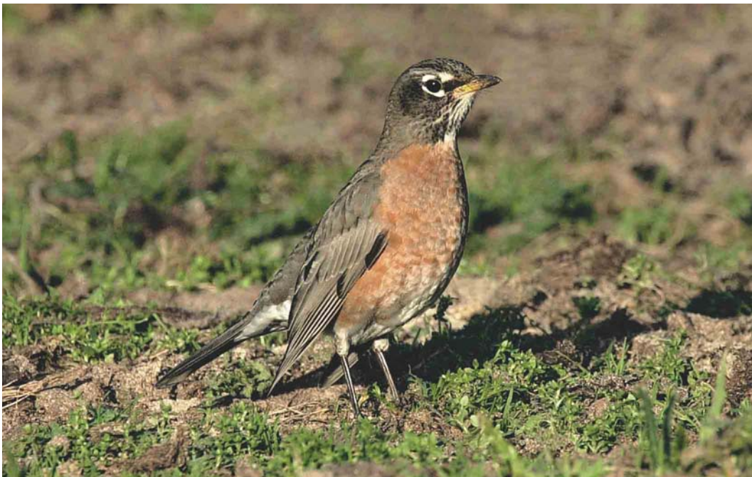
117 American Robin / Roodborstlijster Turdus migratorius , Godrevy Point, Cornwall, England, 16 December 2003 (Mike Malpass)