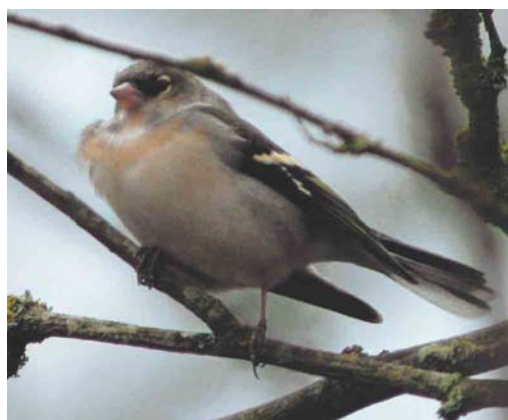
144-145 Afrikaanse Vink / African Chaffinch Fringilla coelebs africana , adult mannetje, Haren, Groningen, 11 december 2003 (Arnoud B van den Berg)

tweede een mannetje op 4 en 5 april 2003 op de Maasvlakte, Zuid-Holland, en de derde een mannetje waargenomen op de Grote Praambult, Oostvaardersplassen, Flevoland, op 14 april 2003. Elders in Noordwest-Europa zijn meer dan 10 waarnemingen bekend. Deze zijn echter ook (nog) niet aanvaard omdat er onduidelijkheid bestaat over mogelijke variatie bij Europese Vink. Afrikaanse Vink wordt vrijwel niet in gevangenschap aangetroffen en er is daarom geen reden om te denken aan ontsnapte kooivogels. Het is opvallend dat de meeste meldingen dateren uit april en dat er inclusief de drie van Nederland liefst vijf in 2003 werden ontdekt. Hieruit zou men kunnen afleiden dat Afrikaanse Vinken met de in Marokko overwinterende Europese Vinken meevliegen en dat daar in sommige jaren misschien een grotere kans op is dan normaal. De voorjaarstrek van Vink speelt zich rond de Straat van Gibraltar voornamelijk af in februari-april. En er zijn in Marokko ringterugmeldingen van Vinken uit noordelijke landen als Finland, Noorwegen en Rusland. Het lijkt aannemelijk dat een in het voorjaar met Vinken noordwaarts getrokken Afrikaanse Vink zich ook in de rest van het jaar bij Vinken aansluit. DUŠAN M BRINKHUIZEN, ARNOLD HEIKAMP & ARNOUD B VAN DEN BERG