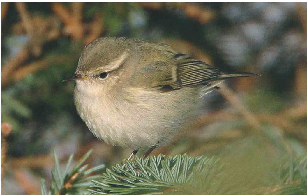
122 Hume's Leaf Warbler / Humes Bladkoning Phylloscopus humei , Bressay, Shetland, Scotland, November 2003

wall, from 14 December to at least late January (a first-winter female) and at Grimsby Lincolnshire, from 1 January onwards.