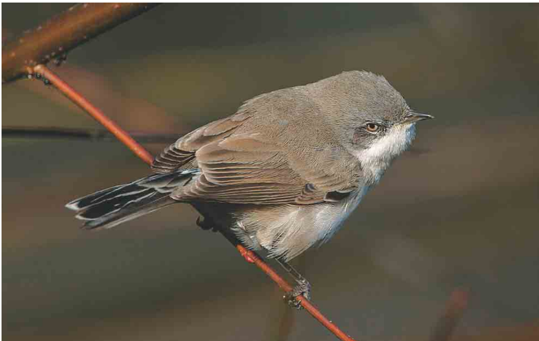
143 Mogelijke Woestijnbraamsluiper / possible Desert Whitethroat Sylvia curruca minula , Katwijk aan den Rijn, Zuid-Holland, 27 november 2003 (Bas van den Boogaard)