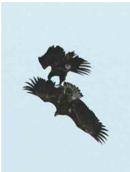
131 Taigaboomkruiper / Eurasian Treecreeper Certhia familiaris , Makkum, Friesland, 26 december 2003 132 Zeearenden / White-tailed Eagles Haliaeetus albicilla , Vossemeer, Flevoland, 15 november 2003 133 Woestijntapuit / Desert Wheatear Oenanthe deserti , vrouwtje, De Cocksdorp, Texel, Noord-Holland, 9 november 2003