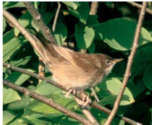
103 Savi's Warbler / Snor Locustella luscinioides , Zürich, Zürich, Switzerland, 2 September 2003

XII This mystery photograph shows a rather uniformly reddish-brown coloured bird perching in a tree and preening its rump and undertail-coverts. The unstreaked head, back and rump, slightly streaked undertail-coverts, pinkish legs, uniformly coloured upperwing and especially the smoothly curved wing-edge (straight in Acrocephalus warblers) point towards one of the unstreaked Locustella warblers. Three species of unstreaked Locustella warbler occur in the Western Palearctic, of which one is only a rare vagrant in Western Europe. This is Gray's Grasshopper Warbler L. fasciolata which has been recorded on Ouessant, Finistère, France (September 1913 and September 1933, both L. f. fasciolata and the Sakhalin taxon L. f. amnicola which is often regarded as specifically distinct) and in Denmark (September 1955). The two more regularly occurring species are River Warbler L. fluviatilis and Savi's Warbler L. luscinioides . Gray's Grasshopper Warbler is a very large bird, as large as Great Reed Warbler A. arundinaceus , and should show warm brownish-buff almost plain undertail-coverts. Although the tail of the mystery bird