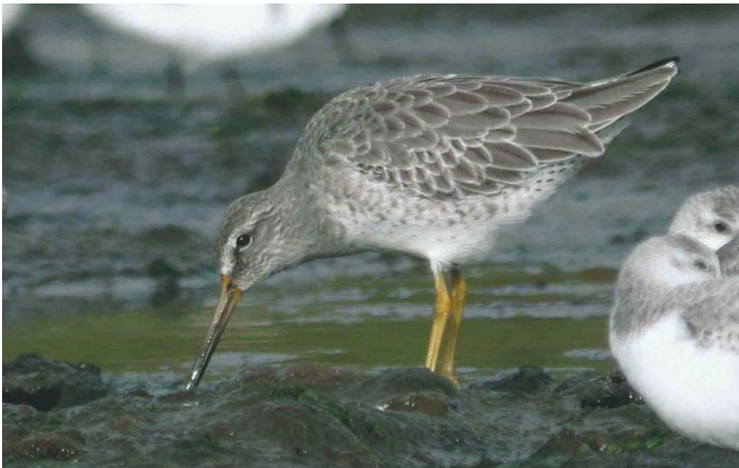
105 Short-billed Dowitcher / Kleine Grijsze Snip Limnodromus griseus , adult-winter, Cabo da Praia, Terceira, Azores, November 2003 (Magne Pettersen)