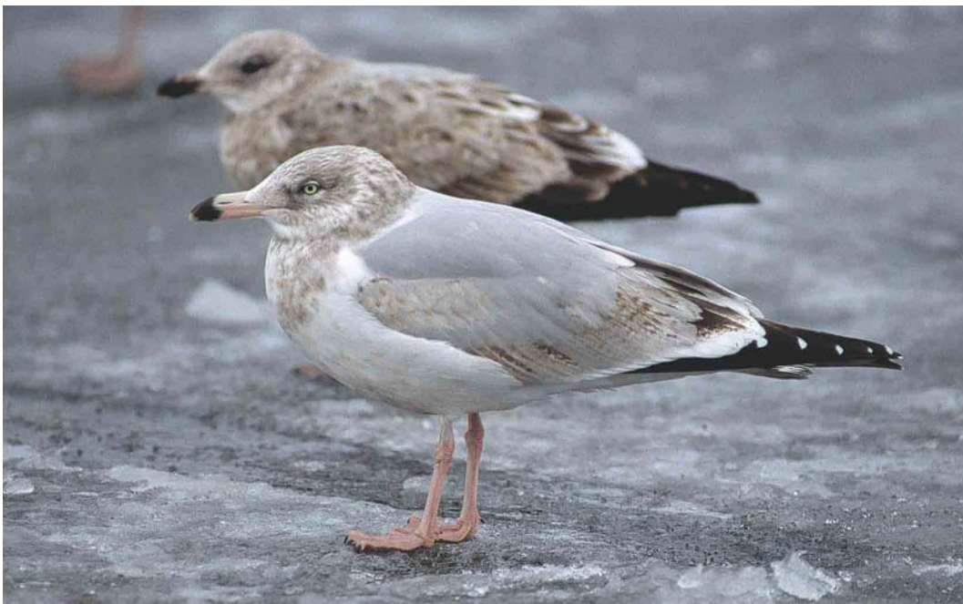
68 American Herring Gull / Amerikaanse Zilvermeeuw Larus smithsonianus , third-winter, Boston, Massachusetts, USA, January 2001 ( Pat Lonergan )