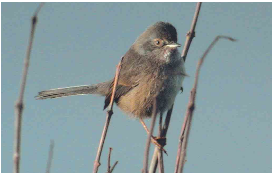
138 Provençaalse Grasmus / Dartford Warbler Sylvia undata , eerste-winter, Blankenberge, West-Vlaanderen, 9 december 2003