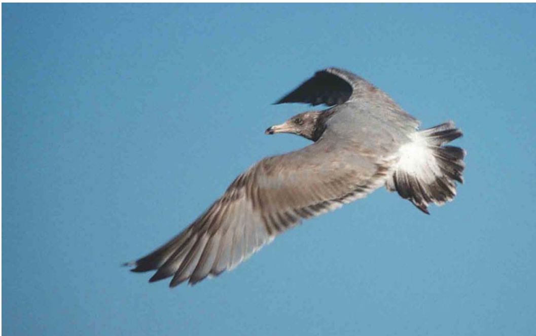
69 American Herring Gull / Amerikaanse Zilvermeeuw Larus smithsonianus , third-winter, Boston, Massachusetts, USA, January 1999 ( Pat Lonergan ). Note dark marks on secondaries and extensive dark in tail.