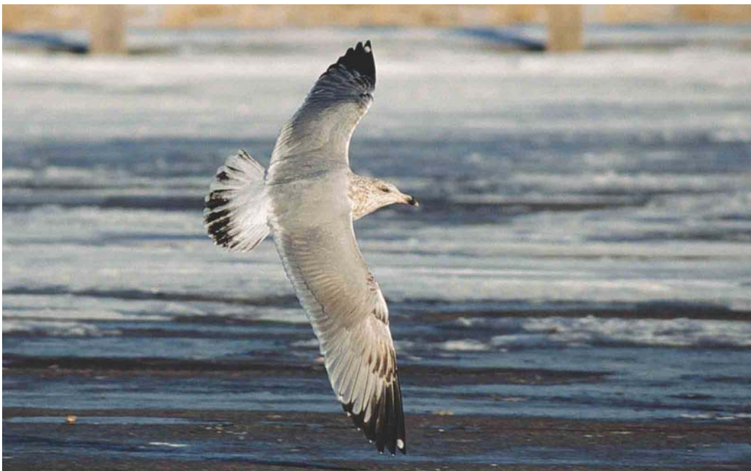
70 American Herring Gull / Amerikaanse Zilvermeeuw Larus smithsonianus , third-winter, Boston, Massachusetts, USA, January 2001. Rather advanced individual in some respects with unmarked adult-like secondaries. Note that tail is still rather heavily marked.