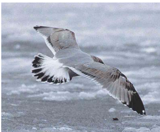
71 American Herring Gull / Amerikaanse Zilvermeeuw Larus smithsonianus , third-winter, Boston, Massachusetts, USA, January 2001. Note discrete black marks on secondaries and extensive black tail pattern.