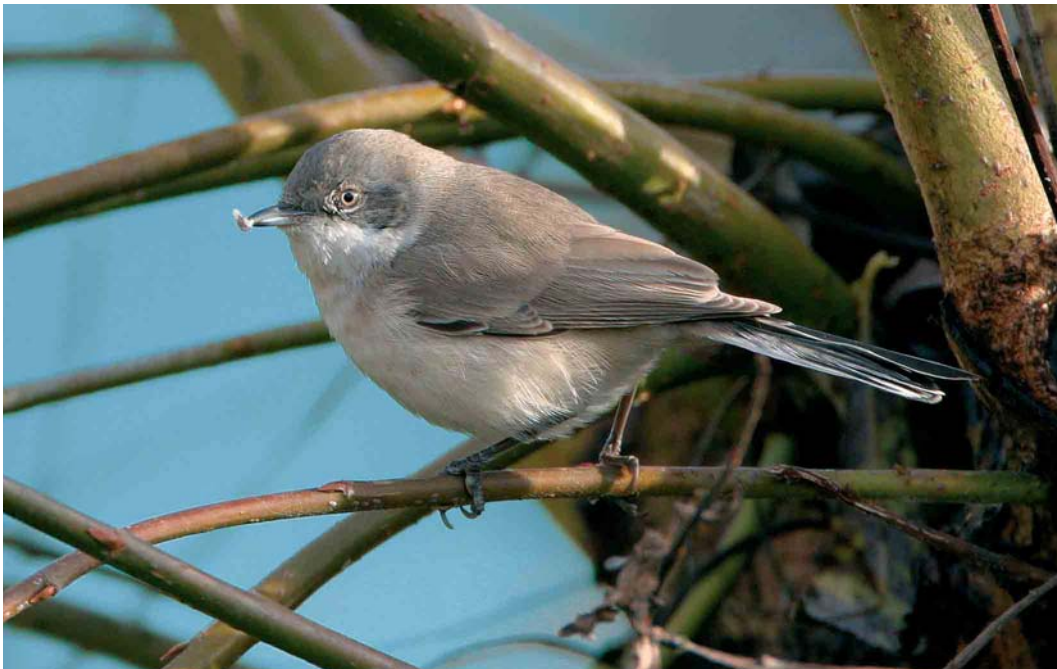
142 Mogelijke Woestijnbraamsluiper / possible Desert Whitethroat Sylvia curruca minula , Katwijk aan den Rijn, Zuid-Holland, 25 november 2003