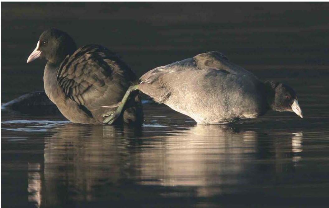
107 American Coot / Amerikaanse Meerkoet Fulica americana (right), with Eurasian Coot / Meerkoet F. atra , Lerwick, Mainland, Shetland, Scotland, November 2003