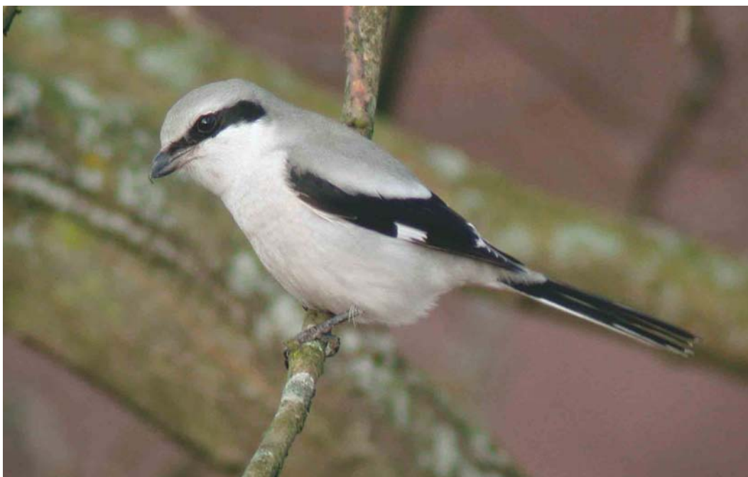
134 Klapekster / Great Grey Shrike Lanius excubitor , Gasterse Duinen, Drenthe, 27 december 2003 (Eelke Schoppers)

najaar) bij Castricum, Noord-Holland. De eerste Siberische Tjiftjaf P collybita tristis werd gemeld op 1 november bij de Makkumerzuidwaard, Friesland. Daarna volgden waarnemingen van 16 tot 22 november bij Lauwersoog (maximaal twee), op 21 november in Groningen, Groningen, op 23 en 24 november bij Starum en vanaf 29 december in Harlingen. Een late Grauwe Vliegenvanger Muscicapa striata werd op 1 november gezien bij Lauwersoog. Een groepje van drie (of meer) Witkopstaartmezen Aegithalos caudatus caudatus dat vanaf 1 november op camping de Holle Poarte bij Makkum verbleef, trok veel bekijks. Taigaboomkruipers Certhia familiaris werden gemeld op 2 november in Nes op Ameland en bij Ridderkerk, Zuid-Holland, en vanaf deze datum op de Holle Poarte bij Makkum, op 3 november op de Dwingelose Heide, Drenthe, op 6 november in Groningen, op 8 november in de Amsterdamse Waterleidingduinen en in Norg, Drenthe, en op 20 december bij Callantsoog, Noord-Holland. Een Notenkraker Nucifraga caryocatactes verbleef van 3 november tot 7 december in Norg en een andere vloog op 23 november langs Balk, Friesland. De laatste Roze Spreeuwen Sturnus roseus van dit opnieuw goede jaar voor deze soort betroffen een exemplaar dat tot 2 november in Goes verbleef en