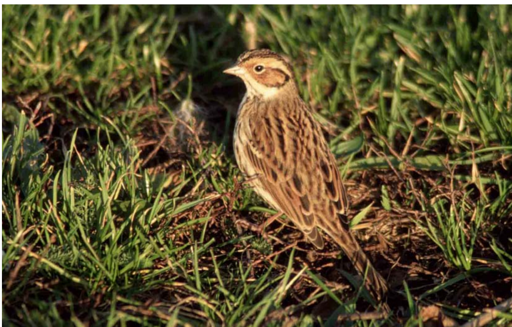
139 Dwerggors / Little Bunting Emberiza pusilla , eerste-winter, Nieuwpoort, West-Vlaanderen, 8 december 2003