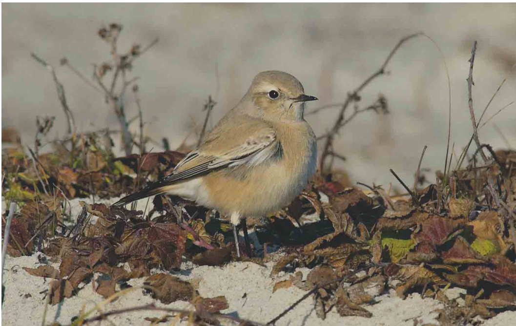
113 Desert Wheatear / Woestijntapuit Oenanthe deserti , female, De Cocksdorp, Texel, Noord-Holland, Netherlands, 9 November 2003