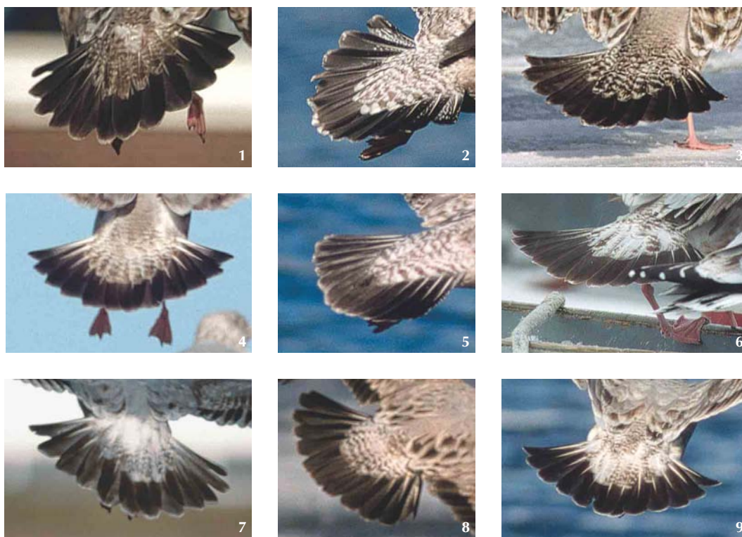
FIGURE 2 Variation in rump and tail pattern of second-winter American Herring Gull / Amerikaanse Zilvermeeuw Larus smithsonianus (Pat Lonergan & Killian Mullarney). Note that tail can be as extensively dark as in many first-winters.

59 American Herring Gull / Amerikaanse Zilvermeeuw Larus smithsonianus , third-winter, Boston, Massachusetts, USA, January 2001 (Pat Lonergan). Note solid markings on tertials and extensive black in tail.