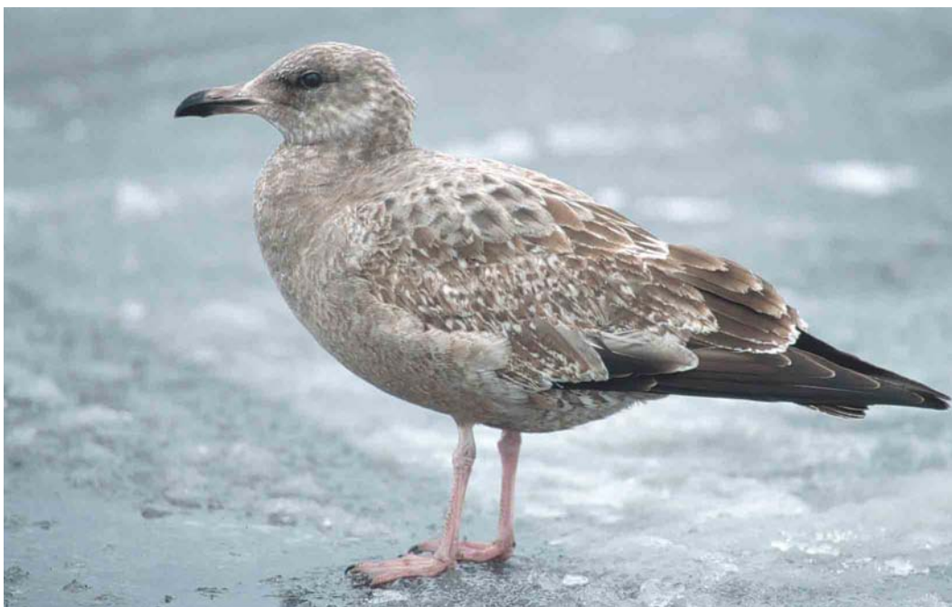
40 American Herring Gull / Amerikaanse Zilvermeeuw Larus smithsonianus , first-winter, Boston, Massachusetts, USA, January 2001. Very worn individual, with second-generation scapulars having pattern unlike that normally exhibited by European Herring Gulls L. argentatus .

ally be more uniform (and consequently darker looking), thus resembling smithsonianus (plate 21 and 34).