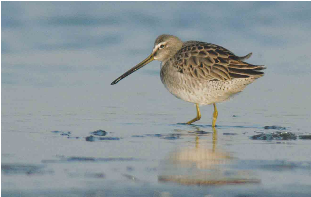
104 Long-billed Dowitcher / Grote Grijsze Snip Limnodromus scolopaceus , first-winter, Veerse Meer, Oud-Sabbinge, Zeeland, Netherlands, 3 January 2004 (Marten van Dijk)