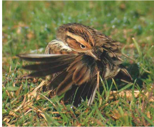
137 Dwerggors / Little Bunting Emberiza pusilla , eerste-winter, Nieuwpoort, West-Vlaanderen, 8 december 2003 (Koen Verbanck)