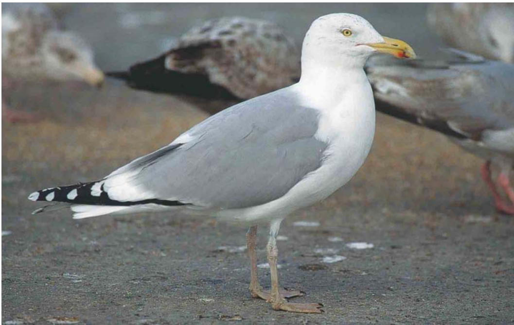
85 American Herring Gull / Amerikaanse Zilvermeeuw Larus smithsonianus , adult or near-adult, Boston, Massachusetts, USA, February 1999 ( Killian Mullarney )