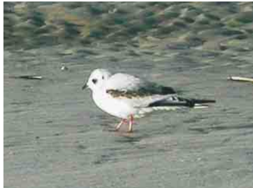
108-109 Scopoli's Shearwater / Scopoli's Pijlstormvogel Calonectris diomedea , Gdansk, Poland, 20 August 2003 110 Kelp Gull / Kelpmeeuw Larus dominicanus vetula , adult, with Yellow-legged Gull / Geelpootmeeuw L. michahellis , Zira, Mauritania, 28 November 2003 111 Ross's Gull / Ross' Meeuw Rhodostethia rosea , first-winter, Westerhever, Schleswig-Holstein, Germany, 29 December 2003

257, 2003). From 24 December, up to three were present around La Capelière, Camargue. An adult Demoiselle Crane Grus virgo was seen at the Hula valley, Israel, on 15 November. In Spain, one was found in a flock of 300 Common Cranes G. grus at Ataquines, Valladolid, on 11 January. In the Azores, an American Coot Fulica americana stayed at Lagoa das Furnas on São Miguel from 31 October to at least 22 November and two were present at Praia da Vitoria, Terceira, on 20-21 November. The first for Scotland (and the third for Britain), was at Clickimin Loch, Lerwick, Shetland, from 30 November to at least late January. In the UAE, three Red-knobbed Coots F. cristata were found with the long-staying third (since the summer of 2002) at Wimpey Pits, Dubai, on 10 November.