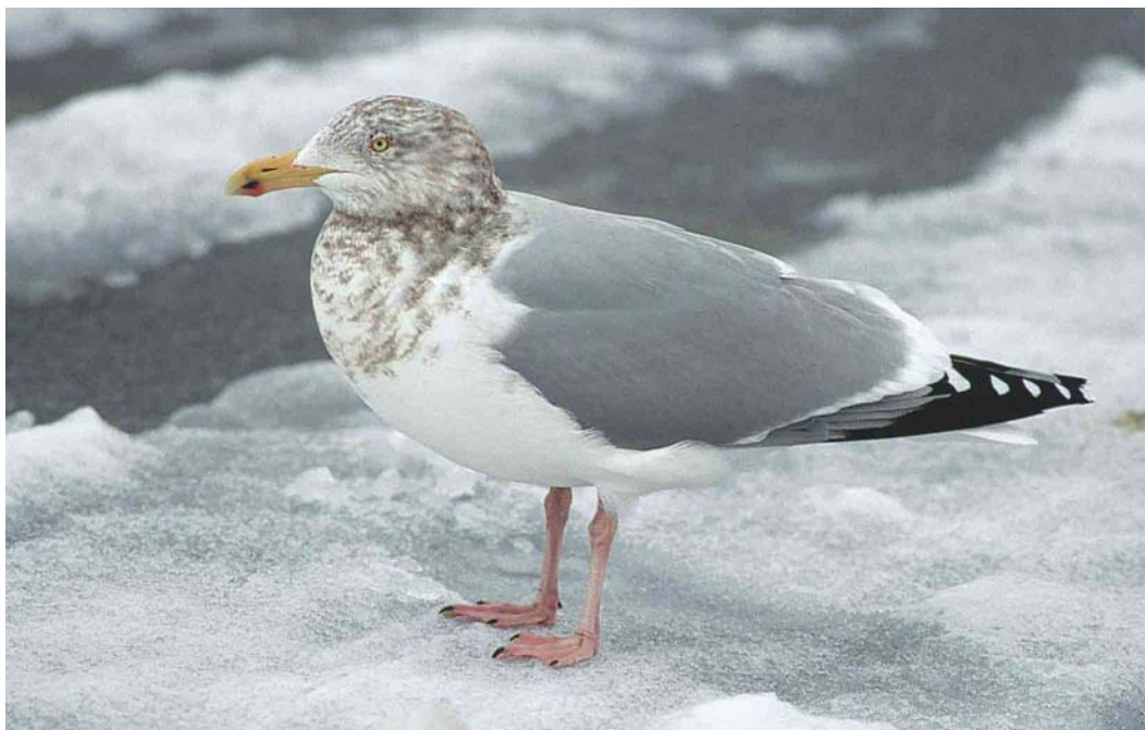
83 American Herring Gull / Amerikaanse Zilvermeeuw Larus smithsonianus, adult, Boston, Massachusetts, USA, January 2001. Note rather blotchy head pattern and very fine blackish shaft-streaks on primary coverts.