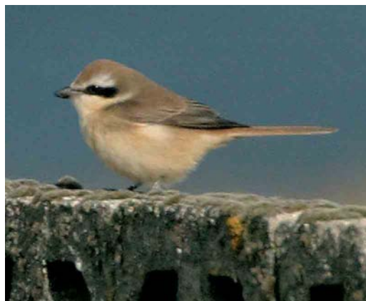
484-485 Purple Martin / Purperzwaluw Progne subis , juvenile, Butt of Lewis, Lewis, Outer Hebrides, Scotland, 6 September 2004 486-487 Purple Martin / Purperzwaluw Progne subis , juvenile, Butt of Lewis, Lewis, Outer Hebrides, Scotland, 6 September 2004 488 White-winged Lark / Witvleugelleeuwerik Melanocorypha leucoptera , female, Vardø, Finnmark, Norway, 19 July 2004 489 Brown Shrike / Bruine Klauwier Lanius cristatus , Skaw, Whalsay, Shetland, 22 September 2004