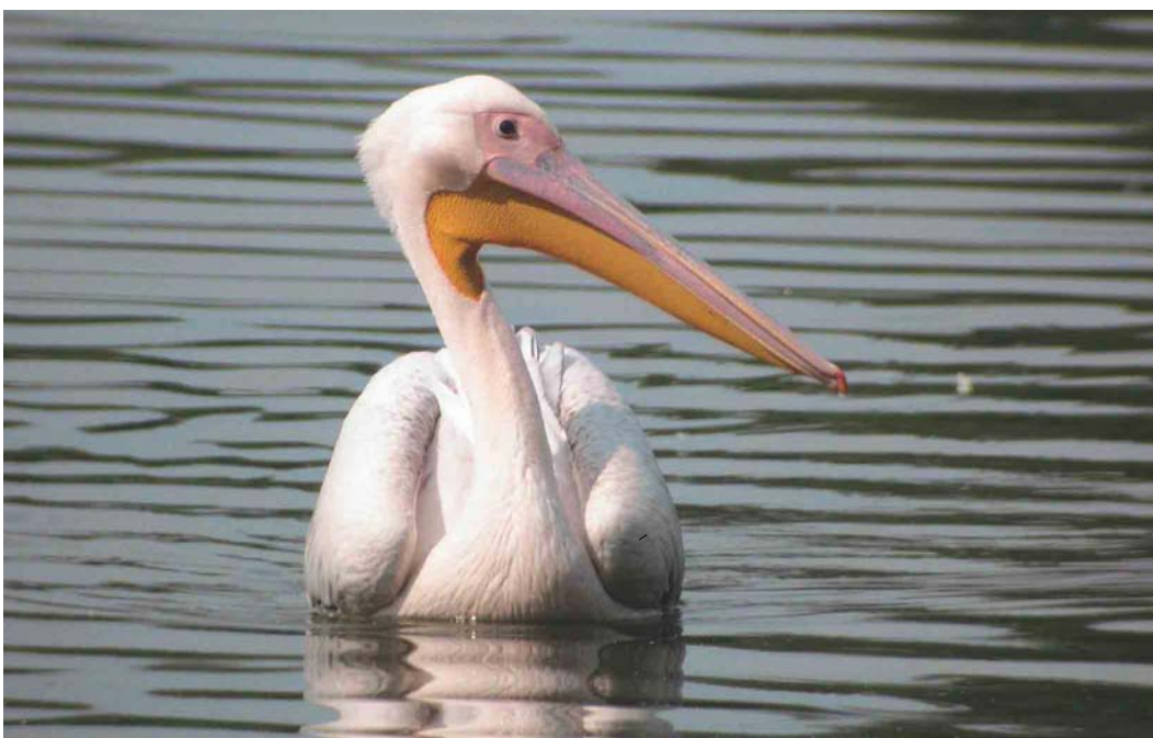
468 Great White Pelican / Roze Pelikaan Pelecanus onocrotalus , Raszyn fish ponds, Warszawa, Poland, 6 August 2004