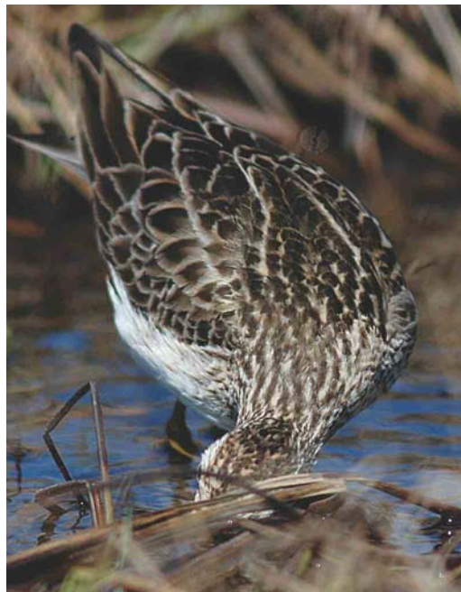
Mystery photograph X (June)

Photographs IX and X represent the fifth round of the 2004 competition. Please study the rules