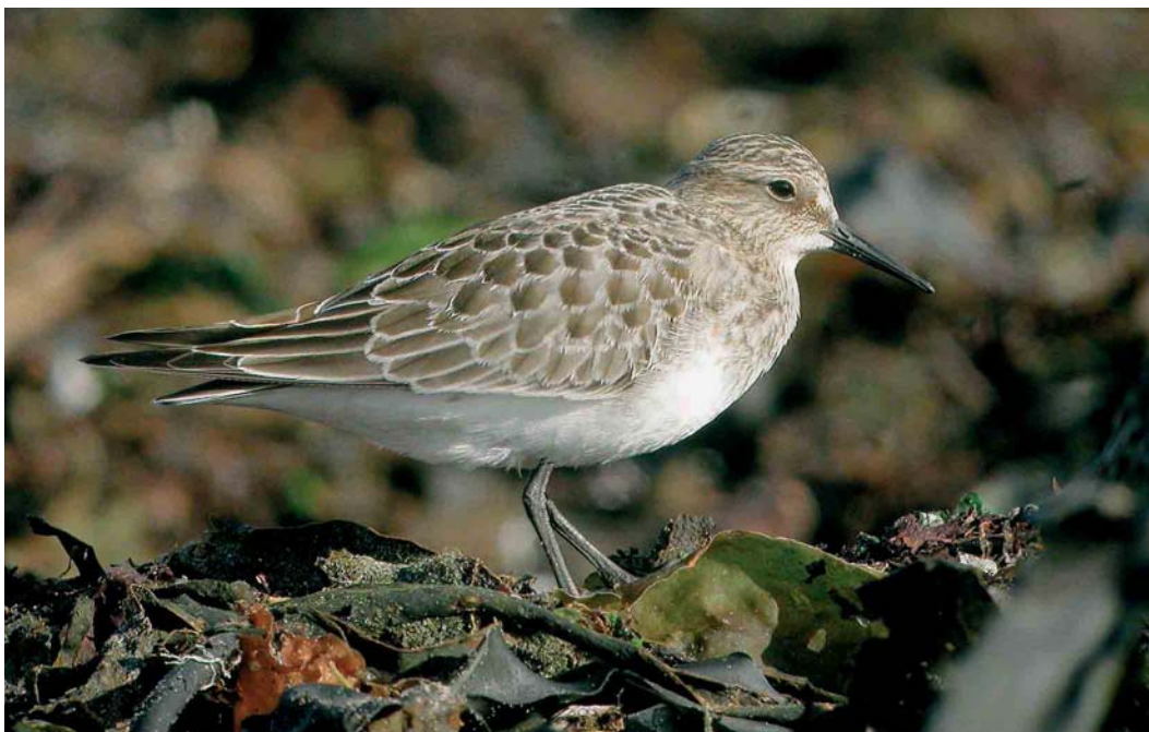
472 Baird's Sandpiper / Bairds Strandloper Calidris bairdii , juvenile, Sein, Finistère, France, 14 September 2004 (Aurélien Audevard)