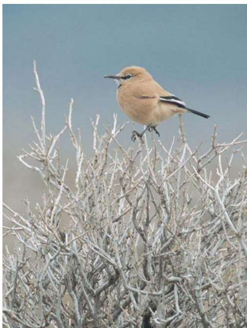
426 Goliath Heron / Reuzenreiger Ardea goliath, Khalasi, Hormozgan, Iran, 20 January 2004 427 Pleske's Ground Jay / Perzische Steppegaai Podocees pleskei, Touran, Semnan, Iran, 27 January 2004 428 Pleske's Ground Jay / Perzische Steppegaai Podocees pleskei, Touran, Semnan, Iran, 27 January 2004