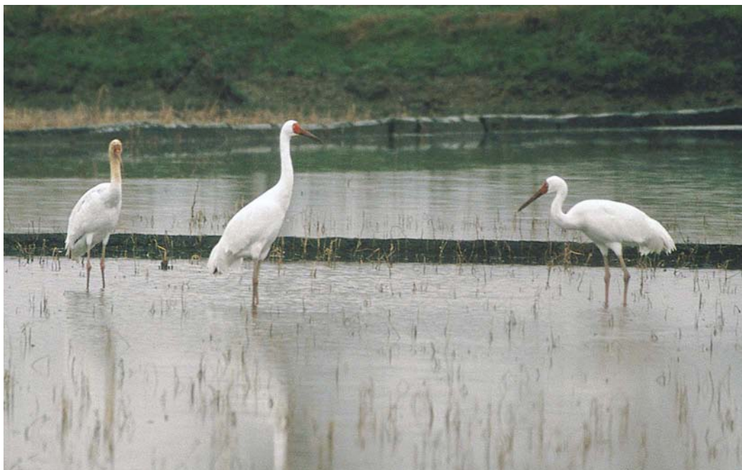
430 Siberian Cranes / Siberische Witte Kraanvogels Grus leucogeranus , pair with young, Fereidoonkenar Damgah, Mazandaran, Iran, 19 January 2004 (Mark Zekhuis)