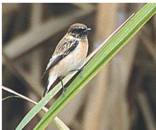
432 Breeding site of Brown Fish Owl Ketupa zeylonensis , Gaz, south of Sirik, Hormozgan, Iran, 18 January 2004 (Rob Felix). The nest cavity is the black spot right below the tree just left of the centre. 433 Black-winged Kite / Grijze Wouw Elanus caeruleus , juvenile, Karun fish ponds, Khuzestan, Iran, 22 January 2004 (Harvey van Diek) 434 Mesopotamian Crow / Mesopotamse Kraai Corvus cornix capellanus , near Hoveyzeh, Khuzestan, Iran, 19 January 2004 (Harvey van Diek) 435 Caspian Stonechat / Kaspische Roodborsttapuit Saxicola maurus variegatus , Amir Kabir sugar cane farm, Ahvaz, Khuzestan, Iran, 15 January 2004 (Harvey van Diek)