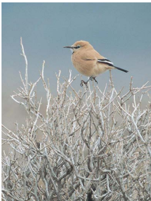
426 Goliath Heron / Reuzenreiger Ardea goliath, Khalasi, Hormozgan, Iran, 20 January 2004 427 Pleske's Ground Jay / Perzische Steppegaai Podoce pleskei, Touran, Semnan, Iran, 27 January 2004 428 Pleske's Ground Jay / Perzische Steppegaai Podoce pleskei, Touran, Semnan, Iran, 27 January 2004