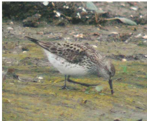
503 Zwarte Wouw / Black Kite Milvus migrans , Kennemermeer, IJmuiden, Noord-Holland, 10 augustus 2004 504 Ortolaan / Ortolan Bunting Emberiza hortulana , Zuidpier, IJmuiden, Noord-Holland, 18 augustus 2004 505 Breedbekstrandloper / Broad-billed Sandpiper Limicola falcinellus , adult, IJdoorn, Noord-Holland, 12 juli 2004 506 Bonapartes Strandloper / White-rumped Sandpiper Caldidris fuscicollis , Ezumakeeg, Friesland, 12 juli 2004

en voornamelijk in het IJsselmeergebied. Pleisterplaatsen (met maxima in augustus) waren bijvoorbeeld 13 bij Delfzijl, Groningen, zes in de Workumerwaard, vier op de Steile Bank en vier bij Den Oever. Op 29 juli vloog een Zwarte Zeekoet Cephus grylle langs Camperduin.