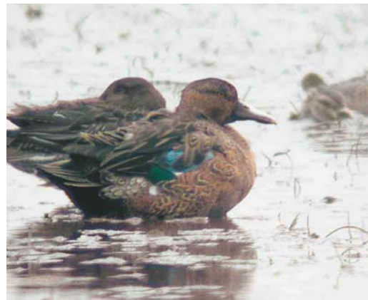
439 Trumpeter Swan / Trompetzwaan Cygnus buccinator , adult, Sophiapolder, Zeeland, 27 June 2004 (Pieter Dhaluin) 440 Emperor Goose / Keizergans Anser canagicus and Barnacle Geese / Brandganzen Branta leucopsis , Den Bommel, Zuid-Holland, 6 February 1999 (Arnoud B van den Berg) 441 Cinnamon Teal / Kaneeltaling Anas cyanoptera , first-year male, De Bijland, Gelderland, 19 October 2002 (Rik Winters) 442 Cinnamon Teal / Kaneeltaling Anas cyanoptera , second-year male, De Bijland, Gelderland, 28 September 2003 (Rik Winters). Probably the same bird as in plate 441.

18-19 October 2002, De Bijland, Rijnwaarden , Gelderland, juvenile or first-winter male, unringed, photographed (A Poelmans, R Winters et al).