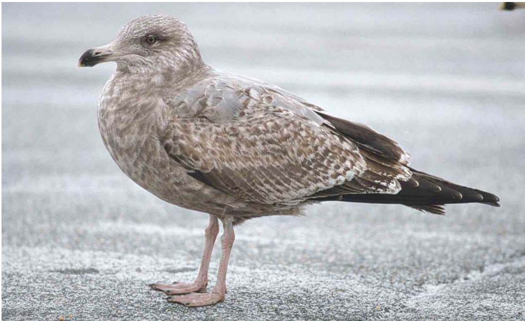
53 American Herring Gull / Amerikaanse Zilvermeeuw Larus smithsonianus , second-winter, Boston, Massachusetts, USA, January 2001 ( Pat Lonergan ). Note rather solidly dark hindneck, extensively brown underparts and reduced pale markings on tertial-tips. Dark greater-covert panel is not exclusive to smithsonianus . 54 American Herring Gull / Amerikaanse Zilvermeeuw Larus smithsonianus , second-winter, Boston, Massachusetts, USA, February 1999 ( Pat Lonergan ). Note rather uniform mantle and underparts and lack of barring in upperparts, a pattern seldom if ever seen in second-winter European Herring Gull L. argentatus .