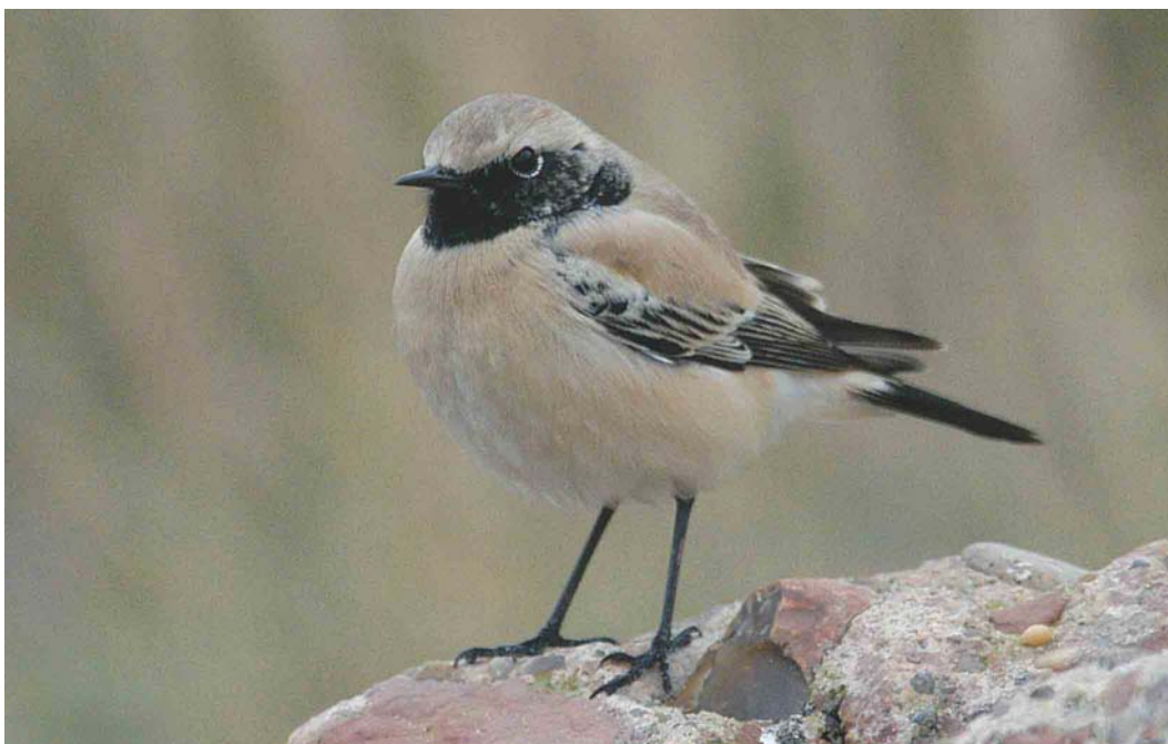
112 Desert Wheatear / Woestijntapuit Oenanthe deserti , male, Helgoland, Schleswig-Holstein, Germany, November 2003