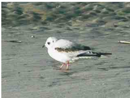
108-109 Scopoli's Shearwater / Scopoli's Pijlstormvogel Calonectris diomedea , Gdansk, Poland, 20 August 2003 110 Kelp Gull / Kelpmeeuw Larus dominicanus vetula , adult, with Yellow-legged Gull / Geelpootmeeuw L michahellis , Zira, Mauritania, 28 November 2003 111 Ross's Gull / Ross' Meeuw Rhodostethia rosea , first-winter, Westerhever, Schleswig-Holstein, Germany, 29 December 2003

257, 2003). From 24 December, up to three were present around La Capelière, Camargue. An adult Demoiselle Crane Grus virgo was seen at the Hula valley, Israel, on 15 November. In Spain, one was found in a flock of 300 Common Cranes G grus at Ataquines, Valladolid, on 11 January. In the Azores, an American Coot Fulica americana stayed at Lagoa das Furnas on São Miguel from 31 October to at least 22 November and two were present at Praia da Vitoria, Terceira, on 20-21 November. The first for Scotland (and the third for Britain), was at Clickimin Loch, Lerwick, Shetland, from 30 November to at least late January. In the UAE, three Red-knobbed Coots F cristata were found with the long-staying third (since the summer of 2002) at Wimpey Pits, Dubai, on 10 November.