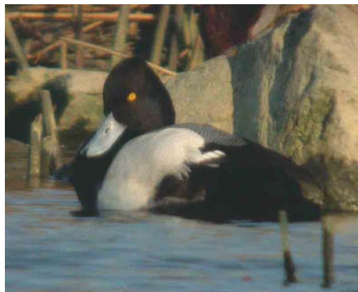
138 Witbuikrotganzen / Pale-bellied Brent Geese Branta hrota, Camperduin, Noord-Holland, 24 februari 2003 139 Groenlandse Kolgans / Greenland White-fronted Goose Anser albifrons flavirostris, Slochteren, Groningen, 9 februari 2003 140 Zwarte Rotgans / Black Brant Branta nigricans, adult, Grevenbicht, Limburg, 24 november 2002 cf Dutch Birding 25: 64, 71, 2003. 141 Witooggeend / Ferruginous Duck Aythya nyroca, mannetje, Schipbeek, Diepenheim, Overijssel, 17 februari 2003 142 Kleine Topper / Lesser Scaup Aythya affinis, adult mannetje, Scheelhoek, Zuid-Holland, 19 februari 2003