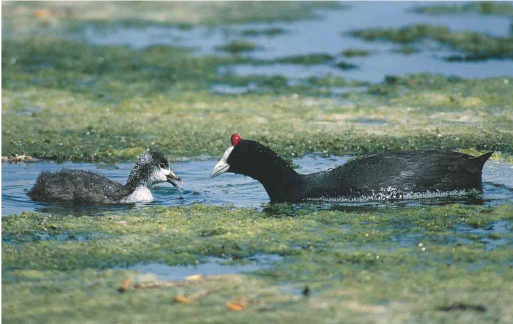
106 Red-knobbed Coots / Knobbelmeerkooten Fulica cristata , adult and juvenile, Ifrane, Morocco, 27 March 2002

cially rounder, the highest point at just a little more than halfway the back. Another difference between Red-knobbed and Eurasian in immature plumages is the overall body colour. Juvenile Red-knobbed is much darker overall than juvenile Eurasian. The body colour of Red-knobbed is dark black-grey, whereas the body colour in Eurasian is grey and even whitish on parts of the head and breast. A careful look at the mystery photograph shows that the white parts are restricted to the lores, chin and central parts of the throat and breast. Other parts of the head, such as ear-coverts and sides of the breast, are dark black-grey and this character is, therefore, in favour of Red-knobbed. A very important identification character of Red-knobbed at all ages is the shape or loreal feathering between bill and shield. In Eurasian, the loreal feathering projects forwards in a sharp point at the base of the upper mandible. In adults, this feature creates the well-known white indentation between the white frontal shield and the bill. In Red-knobbed, the loreal feathering is more or less rounded and does not project forwards in a point above the bill. In the mystery bird, the adult's shield is not present yet but the loreal feathering near the upper mandible can be seen well. The mystery bird shows