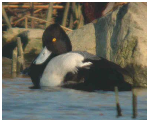
138 Witbuikrotganzen / Pale-bellied Brent Geese Branta hrota, Camperduin, Noord-Holland, 24 februari 2003 139 Groenlandse Kogans / Greenland White-fronted Goose Anser albifrons flavirostris, Slochteren, Groningen, 9 februari 2003 140 Zwarte Rotgans / Black Brant Branta nigricans, adult, Grevenbicht, Limburg, 24 november 2002 cf Dutch Birding 25: 64, 71, 2003. 141 Witooggeend / Ferruginous Duck Aythya nyroca, mannetje, Schipbeek, Diepenheim, Overijssel, 17 februari 2003 142 Kleine Topper / Lesser Scaup Aythya affinis, adult mannetje, Scheelhoek, Zuid-Holland, 19 februari 2003