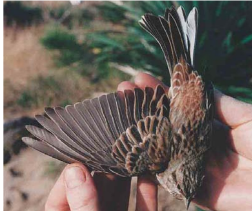
1 Pine Bunting / Witkopgors Emberiza leucocephalos , adult male, Duna di Migliarino, Toscana, Italy, 5 March 2000 ( Daniele Occhiato ). This individual shows a wide collar of dark grey spots. Note bright horn bill colour. 2 Pine Bunting / Witkopgors Emberiza leucocephalos , first-winter male, Duna di Migliarino, Toscana, Italy, December 1999 ( Daniele Occhiato ). 3 Pine Bunting / Witkopgors Emberiza leucocephalos , adult-winter male, Duna di Migliarino, Toscana, Italy, 17 December 1995 ( Roberto Gildi ). Note bright horn colour at basal corner of upper mandible, horn-coloured tones of lower mandible, conspicuous white borders to throat-feathers, and dark grey spots on white half-collar. 4 Pine Bunting / Witkopgors Emberiza leucocephalos , first-winter male, Duna di Migliarino, Toscana, Italy, December 1995 ( Emiliano Arcamone ). Note worn juvenile tertials, pointed tail-feathers, juvenile primary coverts, grey-brown lesser coverts and heavily streaked crown with only a hint of white median stripe.

ments. Hybrids present a further problem. Below, I briefly list the characters that can be used to separate female Pine Bunting from female Yellowhammer (first-winter birds and those with reduced yellow pigments), indicating which of these characters are age related.