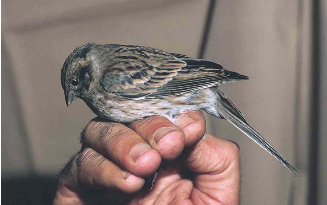
13 Pine Bunting / Witkoppors Emberiza leucocephalos , first-winter male, Westenschouwen, Zeeland, Netherlands (trapped on 19 October 1987), 29 October 1987