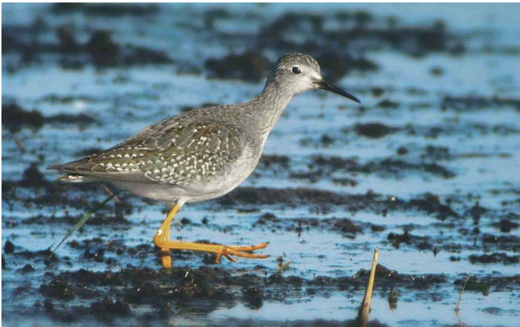
54 Kleine Geelpootruiter / Lesser Yellowlegs Tringa flavipes , juveniel, Amstelmeerdijk, Noord-Holland, 30 oktober 2002