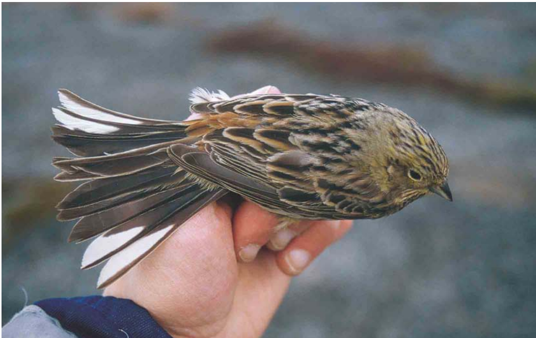
10 Yellowhammer / Geelgors Emberiza citrinella , female, Säppi ringing station, Luvia, Finland, May 1999