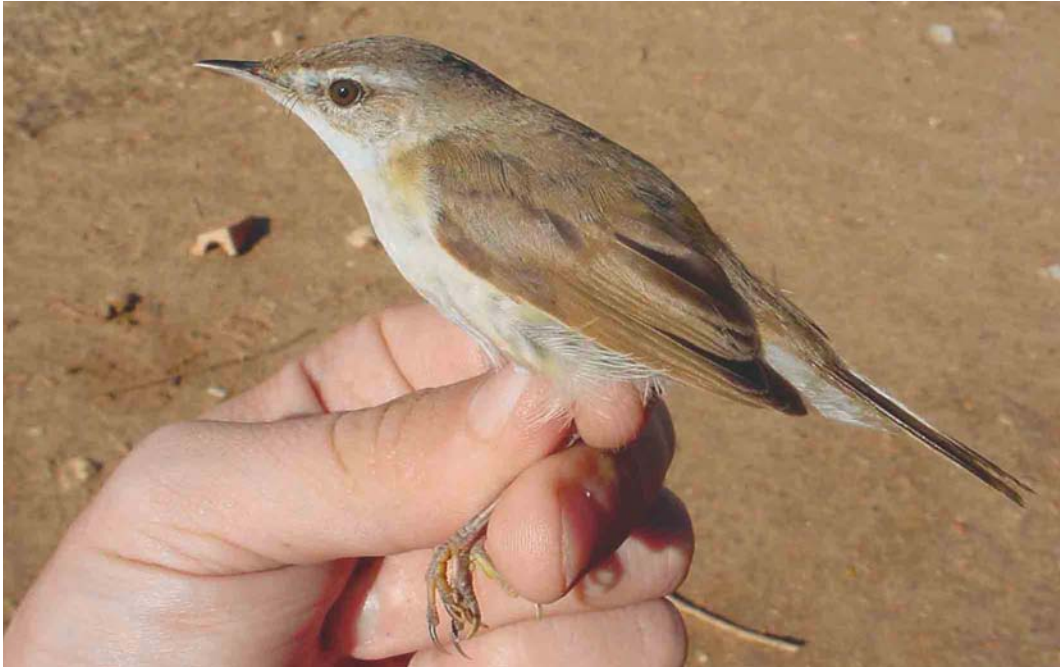
43 Paddyfield Warbler / Veldrietzanger Acrocephalus agricola , Canal Vell, Ebro delta, Tarragona, Spain, 27 November 2002 ( Oriol Clarabuch )