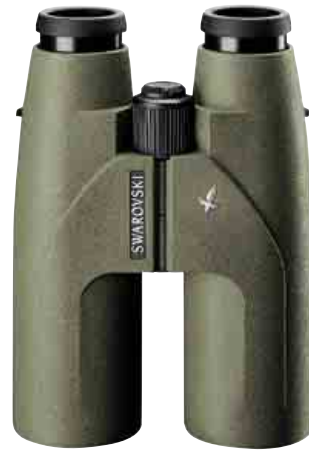
Swarovski SLC 10x50 WB binoculars

For each round, only one entry per person is