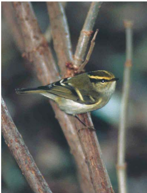
58 Pallas' Boszanger / Pallas's Leaf Warbler Phylloscopus proregulus , Zeebrugge, West-Vlaanderen, 5 november 2002 (Johan Buckens)

Weert, Vlaams-Brabant (43); Sint-Truiden, Limburg (150); Temse, Oost-Vlaanderen (28). Op 21 november vloegen er 22 over Brecht en op 21 en 22 november pleisterden er twee te Merelbeke, Oost-Vlaanderen. Daarna werd het iets rustiger, met waarnemingen te Bredene op 22 november (28); te Ovifat, Liège, op 8 december (150); en te Hingelen, Limburg, op 23 december (vijf). Ten slotte pleisterde vanaf 26 december één vogel bij Beveren. In Het Zwin te Knokke werd nog een Kleine Strandloper Calidris minuta gezien op 26 november. De eerste-winter Rosse Franjepoot Phalaropus fulicarius bleef nog tot 2 november aanwezig te Blankenberge, West-Vlaanderen, en op 4 november vloog er één langs Oostende. Daar vloog op 22 en 30 november ook een Grote Jager Stercorarius skua langs. Er werden in totaal zes Zwartkopmeeuwen Larus melanocephalus gezien, een normaal aantal voor de wintermaanden. Naast de klassieke spreiding van Pontische Meeuwen L. cachinnans was er een telling van 13 te Dilsen-Stokkem op 25 december. De adulte Grote Burgemeester L. hyperboreus vertoefde nog tot na de jaarwisseling in de haven van Oostende. Een Visdief Sterna hirundo bleef tot 16 november aanwezig in de Zeebrugse Haven. Op 1 november foerageerde daar nog een Zwarte Stern Chlidonias niger .