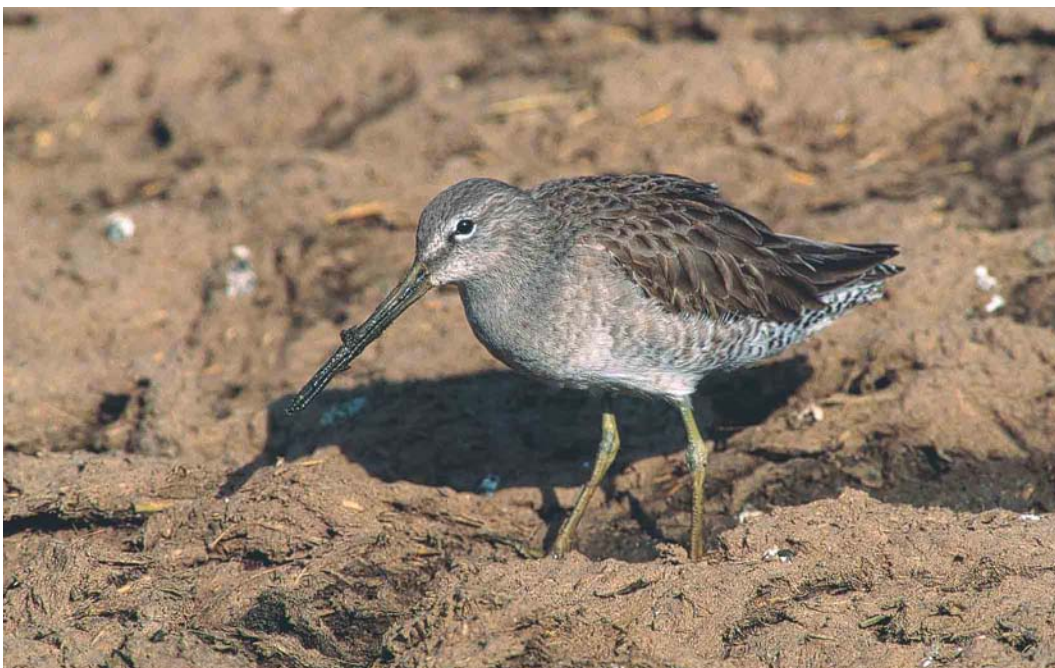
33 Long-billed Dowitcher / Grote Grijze Snip Limnodromus scolopaceus , adult, Sohar, Oman, 10 December 2002