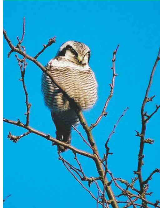
42 Northern Hawk Owl / Sperweruil Surnia ulula , Bialowieza, Poland, 22 December 2002

Warbler Phylloscopus trochiloides for Malta was trapped at Ghadira on 9 December. In England, unseasonal Yellow-browed Warblers P inornatus visited St Mary's, Scilly, on 12 December and Stiffkey, Norfolk, from 17 December to at least 18 January. In Slovenia, one was trapped on 13 October at Bilje, Nova Gorica. In Israel, one turned up at Yotvata on 19 November. Also in Israel, a Hume's Warbler P humei was seen at Shizzafon on 4 November. In Scilly, one stayed on St Mary's on 12-15 November. In Germany, singles were present on Helgoland, Schleswig-Holstein, on 12 November and at Bodensee, Baden-Württemberg, from 14 December to at least 12 January. In Sweden, one was seen in Skåne on 24-25 November. The Dusky Warbler P fuscatus found on St Mary's, Scilly, on 6 November remained until 27 November. Also in England, one was seen at Kessingland, Suffolk, from 30 December to at least 10 January. The Azure Tit Parus cyanus frequenting a feeder at Masugnsbyn, Torne Lappmark, Sweden, from late October was last seen on 25 December. The first Brown Shrike Lanius cristatus for the UAE was at Al Wathba camel track on 12 November. The first for Italy stayed at Tomina, Modena, northern Italy, from 1 December and it was not identified before being trapped in early January. A Steppe Grey Shrike L pallidirostris at Eilat, Israel, remained from 18 November through December. A Pied Crow Corvus albus was feeding on the beach and