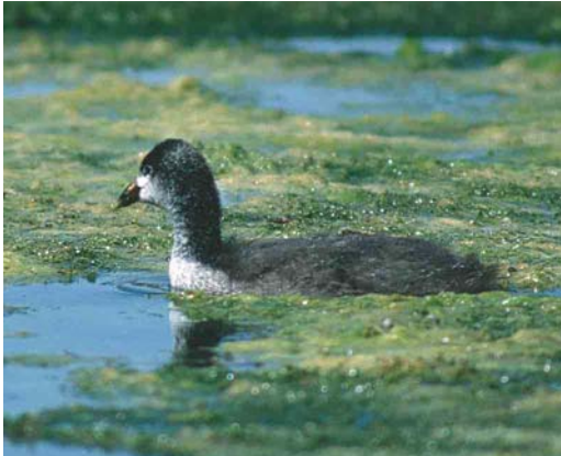
Mystery photograph I (March)