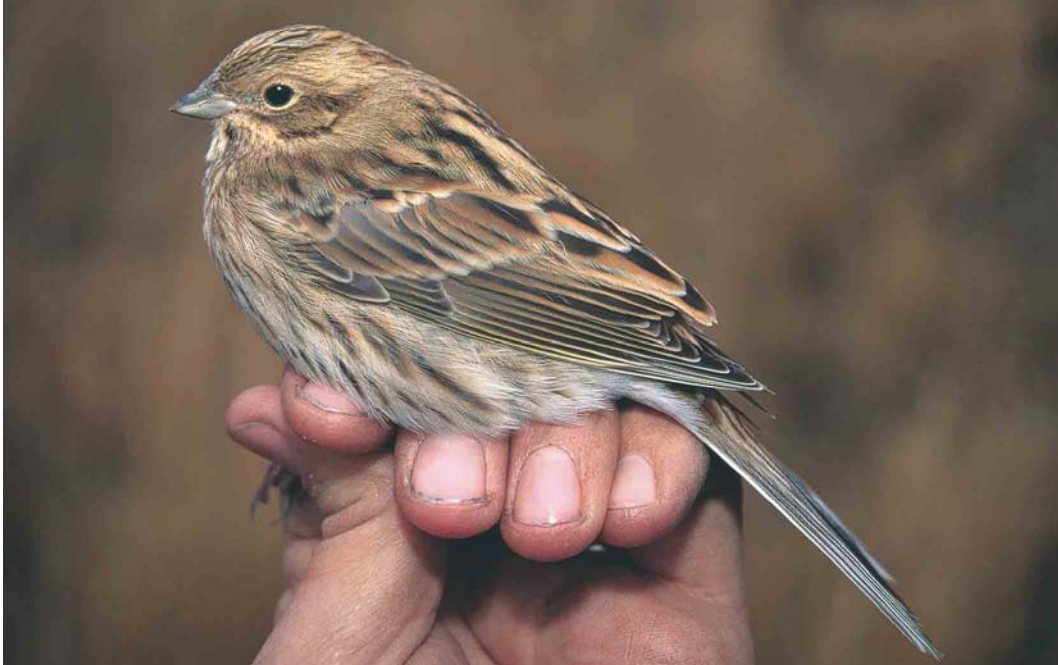
17 Hybrid Pine Bunting x Yellowhammer / Witkopgors x Geelgors Emberiza leucocephalos x citrinella , first-winter female, Lake Koybagar, Kostanay region, Kazakhstan, 1 October 2000. Same bird as in plate 15-16.

cilium is clearly wider and paler than in female Yellowhammer, especially on the lore. In adult female Pine Bunting, the ear-coverts are rather pale, buffy-white, with dark upper and lower borders, while in first-winter females they are generally darker and browner and contrast markedly with the pale supercilium, throat, and lores. In female Yellowhammer, the supercilium does not contrast with the rest of the head as it is darker and of the same colour as the lores and the ear-coverts, so that the head appears darker and more uniform than in Pine Bunting, especially in immatures. The pattern of the malar stripe is a distinctive but often overrated character. In Pine Bunting, there is generally a series of four to six dark streaks in the malar area, which are thicker in adult-winter and first-winter, but more contrasting and conspicuous in summer plumage. Yellowhammer normally shows three to four such streaks, which are not as well marked and less contrasting. This field mark is, however, rather variable and difficult to judge in the field, and there is some overlap. The sub-malar stripe is always wider and paler in Pine Bunting, regardless of age.