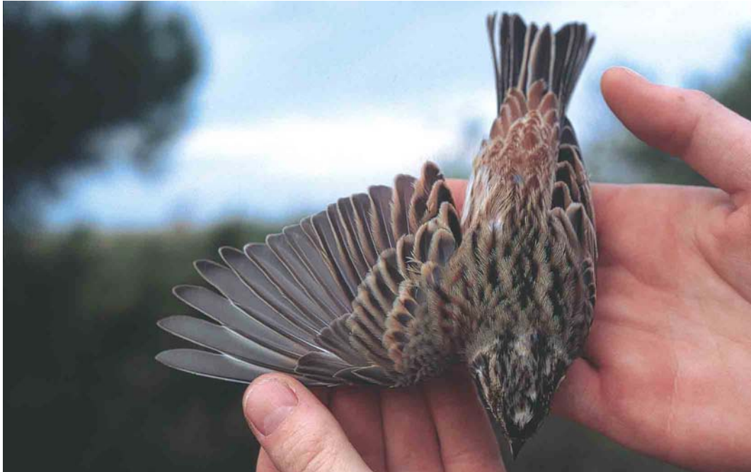
11 Pine Bunting / Witkopgors Emberiza leucocephalos , adult-winter male, Duna di Migliarino, Toscana, Italy, 17 December 1995 ( Roberto Gildi ). Note white crown and especially white forehead, with blackish-grey stripes.