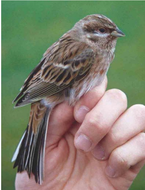
18 Hybrid Pine Bunting x Yellowhammer / Witkopgors x Geelgors Emberiza leucocephalos x citrinella , male, Hodne, Klepp, Rogaland, Norway, 9 November 2000 (Martin Eggen). Very like Pine Bunting, but note yellowish edges to primaries, indicative of hybrid origin.

always) shows a white half-collar on the upper breast, similar to that of the male. Female Yellowhammer sometimes also shows this half-collar but it is always much less conspicuous. In winter plumage, female Pine Bunting has lost most of its reddish tones (although close views reveal that some remain); the necklace of blackish-brown spots remains conspicuous and distinctive, while the whitish half-collar is much less evident and can be completely lacking. In first-winter female, the underparts are heavily streaked/spotted with dark brown and black on a whitish background, which becomes buffy towards the flank, and the dark necklace on the upper breast contrasts much less. The background colour is, however, always white or whitish, while Yellowhammer always shows some pale yellow tones, especially on the lower belly. The undertail is usually heavily streaked in female Yellowhammer. In female Pine Bunting, it is only weakly streaked (thinner and paler streaks), and the streaking can be absent altogether (although it is usually more evident in first-winters).