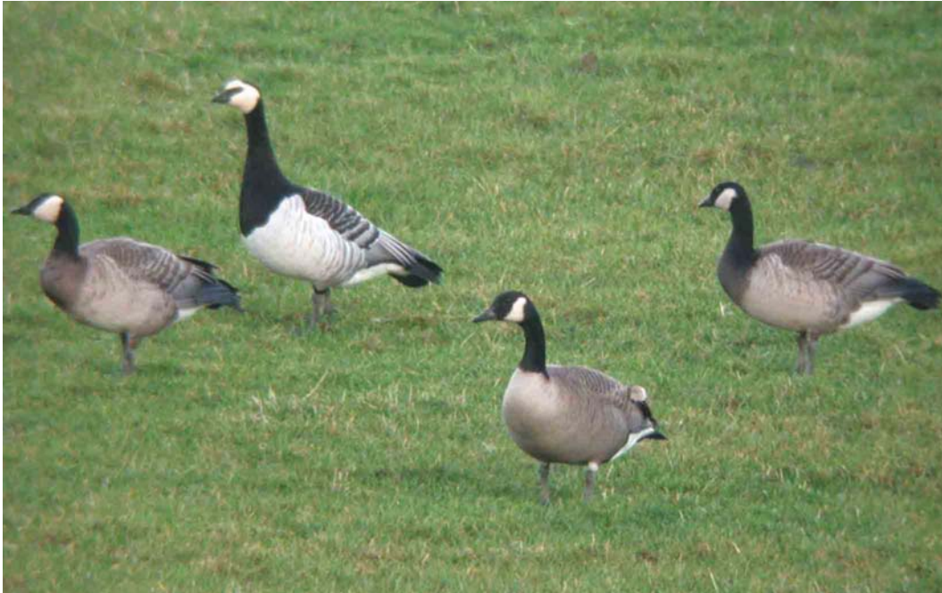
32 Intermediate Canada Goose / Middelste Canadese Gans Branta canadensis parvipes , with Barnacle Goose / Brandgans B leucopsis and hybrids Intermediate Canada x Barnacle Goose, Islay, Argyll, Scotland, November 2002