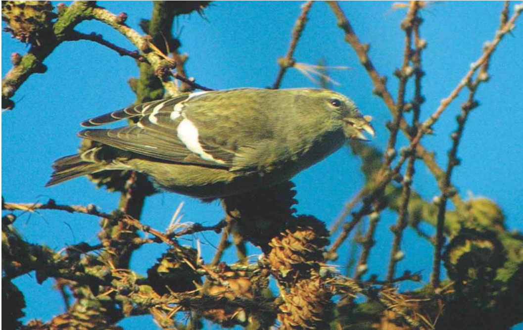
55 Witbandkruisbek / Two-barred Crossbill Loxia leucoptera bifasciata , vrouwtje, Zeven Linden, Baarn, Utrecht, 23 november 2002 (Phil Koken)