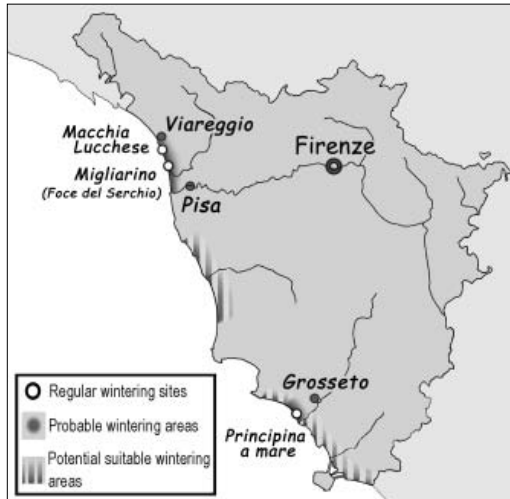
FIGURE 2 Distribution of Pine Bunting / Witkopgors Emberiza leucocephalos in Toscana, Italy. Dark areas show coastal tracts where Pine Bunting probably winters while small white circles show known regular wintering sites. Areas with pale-dark bands show potentially suitable wintering areas.

Camargue, Bouches-du-Rhône, France, it is likely to occur sporadically during migration and in winter.