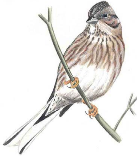
FIGURE 4 Pine Bunting / Witkopgors Emberiza leucocephalos , juvenile ( Daniele Occhiato ). Note dark streaking on underparts and dark and dirty head, with hint of pale median crown-stripe.

the entire wing can look darker and more uniform. The lesser coverts are greyish-brown. The underwing-coverts are usually uniformly white. The rectrices are dark blackish-brown, with a pale rufous-buff fringe proximally, and a whitish fringe distally. On t5-6 (counted from the central rectrices outward), the distal portion of the inner web is white, and the outer web is blackish-brown fringed white. In summer plumage males, the bill is usually blackish-grey on the upper mandible with an orange-horn colouration at the basal corner, while the lower mandible is rather bright horn above blending into dark grey below (contra Lewington et al 1991, Jonsson 1992, Byers et al 1995, Beaman & Madge 1998, Svensson et al 1999). A very small percentage show a pale bluish-grey lower mandible. The iris is dark brown. The legs are pale and variable in colour, which can be fleshy-orange, brownish-yellow, or fleshy-brown; this is apparently not age related.