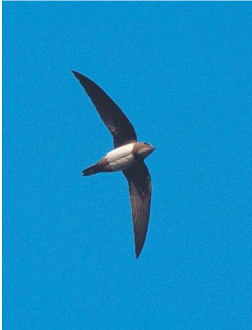
48 Alpengierzwaluw / Alpine Swift Apus melba , Wageningen, Gelderland, 17 november 2002

gen, en op 18 december twee ten noorden van Eindhoven, Noord-Brabant. Er was een melding van een vrouwtje Koningseider Somateria spectabilis op 4 januari bij Vlissingen, Zeeland. Lang in het binnenland verblijvende Parelduikers Gavia arctica waren tot 9 november te zien bij Windesheim, Overijssel, en van 25 tot 31 december bij Sprang-Capelle, Noord-Brabant. Niet minder dan 12 Ijsduikers G immer werden waargenomen, waaronder vier langstrekking aan de kust en pleisterende van 2 november tot 2 december bij de Brouwersdam, Zuid-Holland, van 2 november tot 27 december ten oosten van Apeldoorn, Gelderland, en van 10 tot 26 december bij Zwolle, Overijssel. De laatste Grauwe Pijlstormvogels Puffinus griseus van het najaar vlogen op 7 november langs Westkapelle, Zeeland, en op 9 november langs Scheveningen, Zuid-Holland, en 10 langs Ameland, Friesland. Een uitzonderlijke waarneming betrof een late Vale Pijlstormvogel P mauretanicus op 8 december langs Langevelderslag, Zuid-Holland. Het Wilson's Stormvogeltje Oceanites oceanicus dat op 7 november langs Westkapelle vloog, betreft indien aanvaard de eerste voor Nederland. Tot 9 november werden ook nog vijf Vale Stormvogeltjes Oceanodroma leucorhoa gezien. Daarna werd er nog één dood gevonden op 19 december op het strand bij Vlissingen. Slechts een 10-tal waarnemingen van Kuifaalscholvers Stictocorbo aristotelis sijpelde door. De Koereiger Bubulcus ibis van de Prunjepolder, Zeeland, hield het vol tot 7