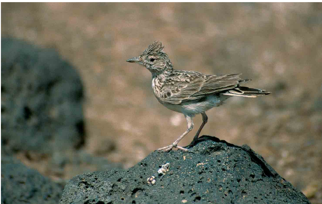
44 Raso Lark Razoleeuwerik Alauda razae , male, Raso, Cape Verde Islands, 7 March 2002