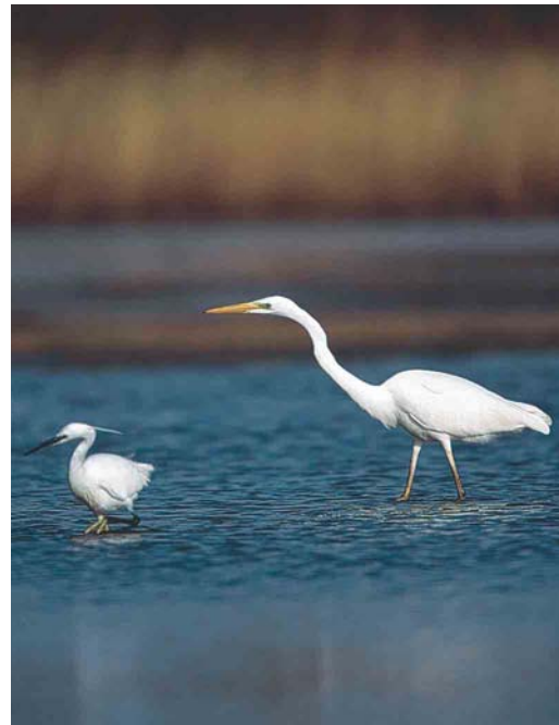
49 Grote Zilverreiger / Great Egret Casmerodius albus en Kleine Zilverreiger / Little Egret Egretta garzetta , Oostvoornse Meer, Zuid-Holland, 11 november 2002 (Jan van Holten)

december. Andere verbleven van 9 tot 11 november ten zuidwesten van Kampen, van 18 november tot 8 december twee bij Doornspijk, Gelderland, en van 23 tot 27 november één bij Vlagtwedde, Groningen. Kleine Zilverreigers Egretta garzetta waren beduidend schaarser dan de vorige periode. Alleen in de Delta verbleven nog grote aantallen, met bijvoorbeeld op 10 december 43 rond het Veerse Meer, Zeeland, en op 11 december 12, waarvan twee overleden, op Dwars in de Weg in de Grevelingen, Zeeland. Ook werden 10-tallen Grote Zilverreigers Casmerodius albus gezien, met 10 of meer op de volgende locaties: in de Oostvaardersplassen, Flevoland, in de polders bij Mijdrecht, Utrecht, en in de polders ten noorden van Nuland, Noord-Brabant. Naast de eeuwig aanwezige Zwarte Ibis Plegadis falcinellus langs de Belkmerweg in Noord-Holland, waren er waarnemingen op 14 november bij Moergestel, Noord-Brabant, en op 6 december bij Nieuw Vennep, Noord-Holland. Uitzonderlijk was de melding van een Zwarte Wouw Milvus migrans op 31 december in de Wieringermeer, Noord-Holland. Vanaf eind november werd een 11-tal Rode Wouwen M milvus gezien. Er werden 11 Zeearenden Haliaeetus albicilla gezien, waaronder tweetallen op 23 november in de Oostvaardersplassen en op 31 december op de Korendijkse Slikken en een adulte van 5 tot 11 december rond het Drontermeer,