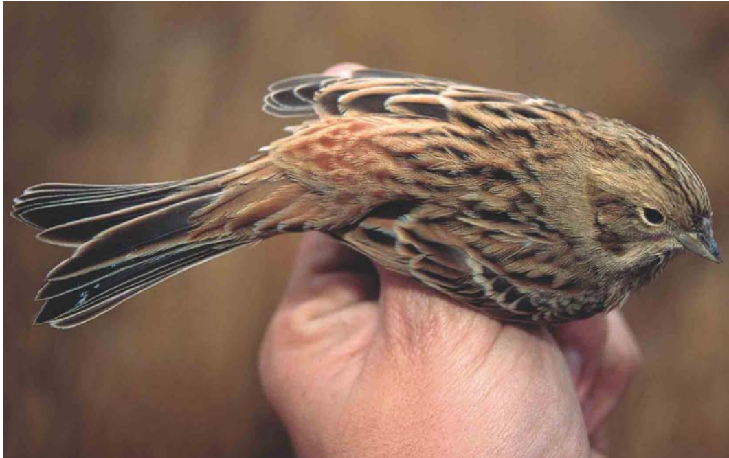
15-16 Hybrid Pine Bunting x Yellowhammer / Witkoppors x Geelgors Emberiza leucocephalos x citrinella , first-winter female, Lake Koybagar, Kostanay region, Kazakhstan, 1 October 2000