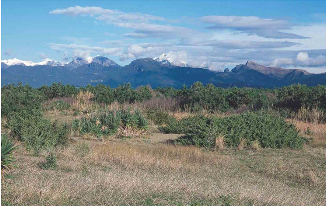
19 Macchia Lucchese dunes, Toscana, Italy, December 2001. Part of the dunes furthest from the sea, used by Pine Buntings Emberiza leucocephalos as a temporary refuge during the day, or for nocturnal roosting.

Arrigoni degli Oddi (1904, 1929) and Moltoni (1951: 20 individuals reported between 1941 and 1951) considered the species to be an irregular, but not rare, migrant, and identified Veneto as one of the regions where the species occurred most frequently. Foschi et al (1996) list six captures between 1888 and 1907, while Giancarlo Fracasso (in litt) reported 18 captures between 1962 and 1970 in Vicenza province.