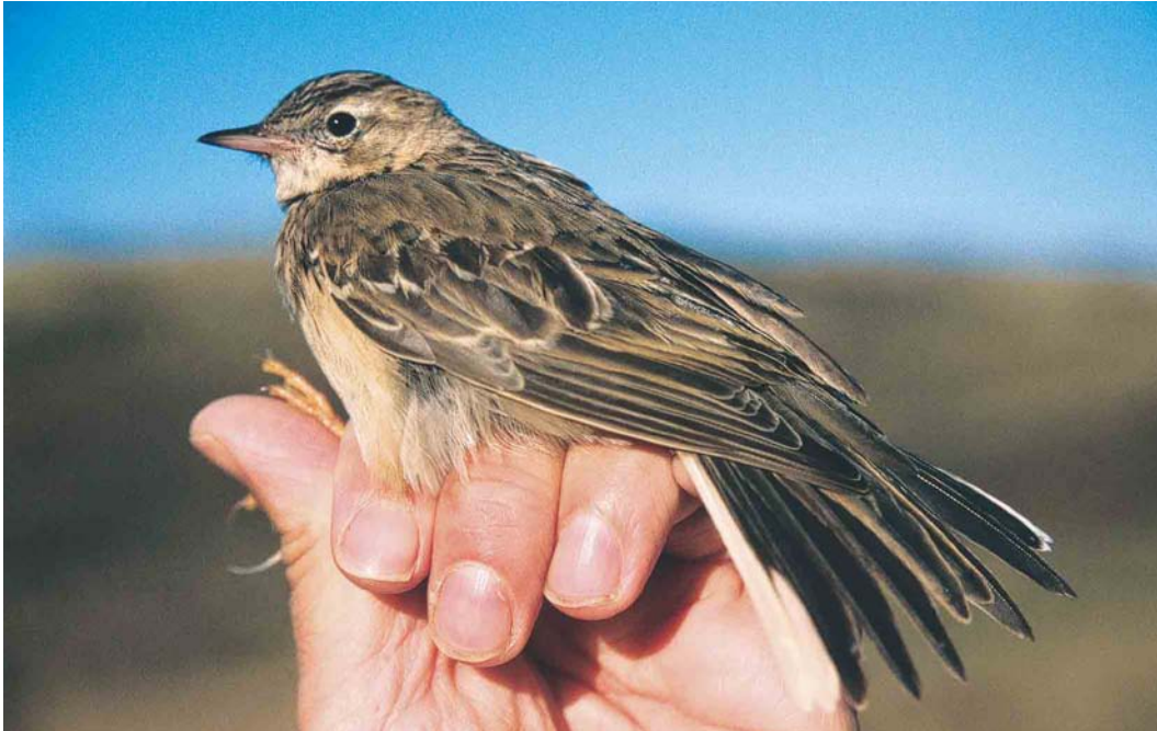
21 Mongoolse Pieper / Blyth's Pipit Anthus godlewskii , eerste-winter, 24 november 2002, Kennemerduinen, Bloemendaal, Noord-Holland

t4-6 postjuveniel (ruiscore 4); rechts t1 postjuveniel (ruiscore 4), t2-6 juveniel.