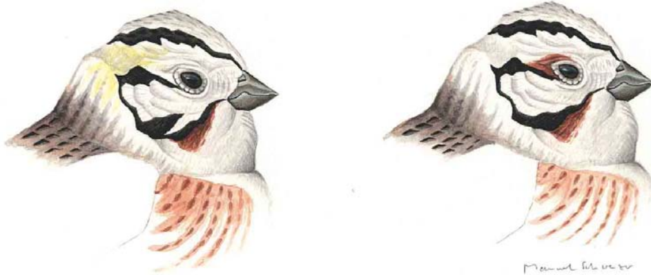
FIGURE 1 Hybrids Pine Bunting x Yellowhammer / Witkopgors x Geelgors Emberiza leucocephalos x citrinella , Fereydoon Kenar, Mazandaran province, Iran, 27 February 2001 (Manuel Schweizer)

lesser underwing-coverts; the median underwing-coverts were pale greyish, the greater underwing-coverts whitish and the axillaries white. Apart from this, no conclusive hybrid feature could be detected. The outermost pair of rectrices did not show a very large amount of white as would be typical for Pine Bunting. On the inner web, the blackish colour reached to c 2 cm from the tip (no exact measurement available). However, there is much variation in this feature and the differences are often useless on a single bird (Byers et al 1995).