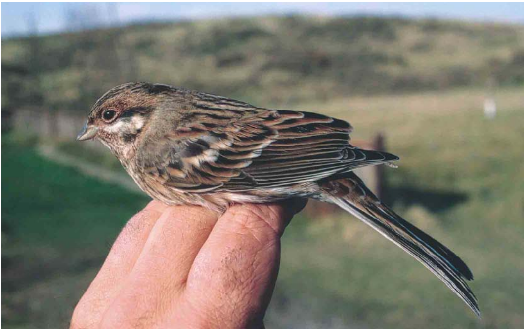
14 Pine Bunting / Witkoppors Emberiza leucocephalos , first-winter male, Kennemerduinen, Bloemendaal, Noord-Holland, Netherlands, 4 November 1987