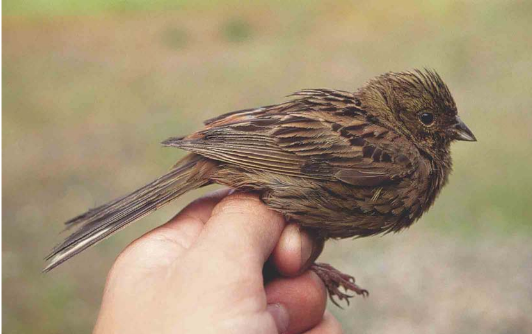
9 Yellowhammer / Geelgors Emberiza citrinella , first-winter female, Tauvo ringing station, Siikajoki, Finland, August 1991