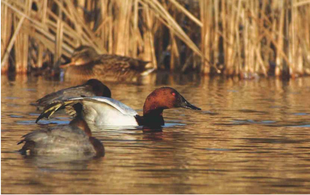
60 Grote Tafeleend / Canvasback Aythya valisineria , mannetje, Castricum, Noord-Holland, 9 januari 2003 (Phil Koken)