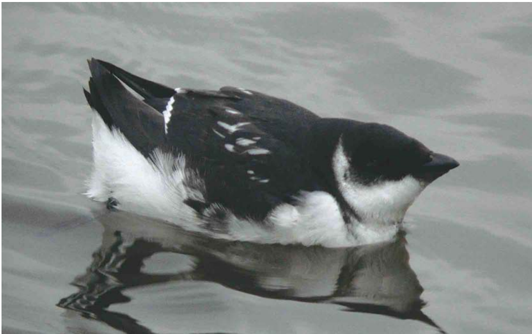
47 Kleine Alk / Little Auk Alle alle , Zierikzee, Zeeland, 29 november 2002 (Bas de Bruijn)