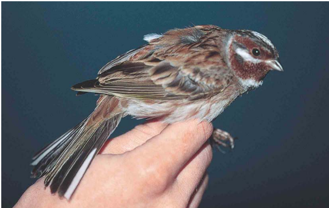
20 Hybrid Pine Bunting x Yellowhammer / Witkopgors x Geelgors Emberiza leucocephalos x citrinella, Fereydoon Kenar, Mazandaran province, Iran, 27 February 2001