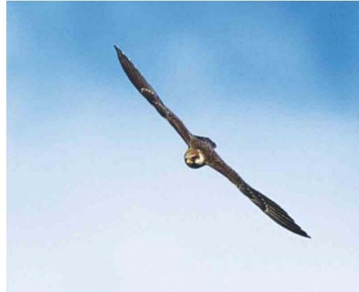
Mystery photograph II (September)

Tawny has a rather short hindclaw, at least much shorter than shown by the mystery bird.