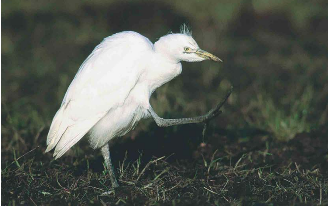
46 Koereiger / Cattle Egret Bubulcus ibis , Vlagtwedde, Groningen, 24 november 2002