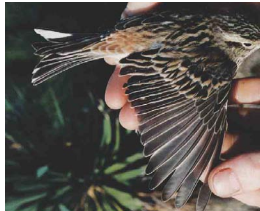
5 Pine Bunting / Witkopgors Emberiza leucocephalos , first-winter male, Duna di Migliarino, Toscana, Italy, 17 December 1995 ( Roberto Gildi ). Note heavy dark grey-brown streaking on underparts, and conspicuous dark spots on upper breast. 6 Pine Bunting / Witkopgors Emberiza leucocephalos , first-winter female, Katwijk, Zuid-Holland, Netherlands, 25 November 1996 ( René van Rossum ) 7 Pine Bunting / Witkopgors Emberiza leucocephalos , adult-winter female, Duna di Principina, Toscana, Italy, January 2001 ( Daniele Occhiato ). Note typical pale nape spot bordered by two dark stripes, and streaked crown with paler median stripe. 8 Pine Bunting / Witkopgors Emberiza leucocephalos , first-winter female, Duna di Migliarino, Toscana, Italy, December 1995 ( Emiliano Arcamone ). Note uniformly streaked crown, brown cheeks and ear-coverts contrasting with the whitish supercilium, pointed tail-feathers, worn juvenile tertials, juvenile primary coverts and grey-brown lesser coverts.

Bunting is strikingly different from that of Yellowhammer, more contrasting and totally lacking yellow pigments. There are often reddish tones to the supercilium and throat. Pine Bunting's crown shows finer, neater dark streaking; these streaks are usually more evident on the sides of the crown, while on the centre the streaks are thinner and less conspicuous, on a paler background. The pattern is thus similar to that of males. In adult-winter female, the median crown-stripe is generally more streaked and less