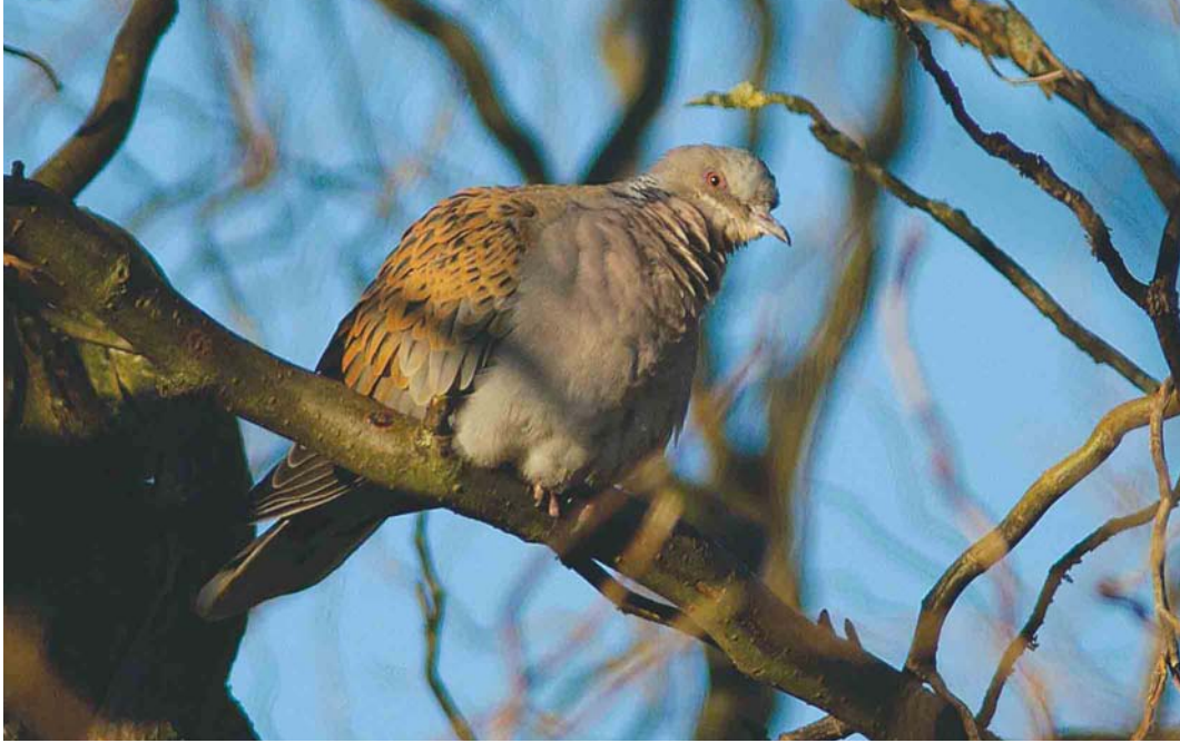
53 Zomertortel / European Turtle Dove Streptopelia turtur , Julianadorp, Noord-Holland, 9 december 2002