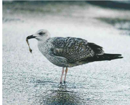
51 Geelpootmeeuw / Yellow-legged Gull Larus michahellis , Brouwersdam, Zeeland, 9 november 2002

Holland. Er werden slechts 16 Kleine Alken Alle alle geteld. Papegaaiduikers Fratercula arctica vlogen op 6 en 7 november langs Westkapelle en op deze dagen ook twee respectievelijk één langs Camperduin, Noord-Holland, en op 9 november langs Ameland.