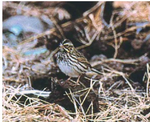
38-39 Oriental Turtle Dove / Oosterse Tortel Streptopelia orientalis , first-winter, Stromness, Orkney, Scotland, 6 December 2002 (Chris Batty) 40 Azure Tit / Azuurmees Parus cyanus , Masugnsbyn, Torne Lappmark, Sweden, 10 December 2002 (Michael Bergman) 41 Savannah Sparrow / Savannahgors Passerculus sandwichensis , Fajagrande, Flores, Azores, 31 October 2002 (Kris De Rouck) cf Dutch Birding 24: 381, 2002

Another at Litvatnet, Sør-Trøndelag, Norway, was last seen on 1 January. The first Oriental Turtle Dove S. orientalis meena for Britain since 1975 was a first-winter at Stromness, Orkney, from late November until 26 December. If accepted, a nominate Oriental Turtle Dove S. o. orientalis at Eilat on 2 November will be the sixth for Israel and the third this autumn. Also in Israel, at least 12 Striated Scops Owls Otus brucei were found during December, in remote wadis over the southern Arava and Eilat mountains. In Ireland, an adult male Snowy Owl Nyctea scandiaca took residence at Belmullet Peninsula, Mayo, from 23 November through December. From the second week of December onwards, a Northern Hawk Owl Surnia ulula visited Bialowieza, Poland. The latest ever Pallid Swifts Apus pallidus for Britain were at Exe Estuary, Devon, and at Christchurch, Dorset, on 22 November and in Kent on 29 November. The first Alpine Swift A. melba