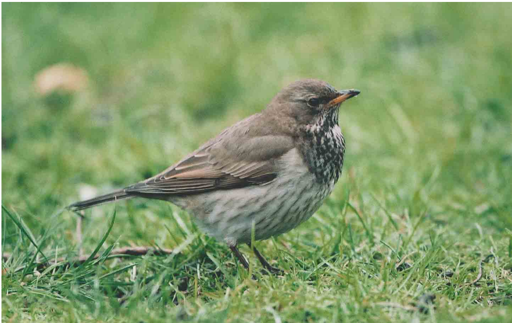
56 Zwartkeellijster / Black-throated Thrush Turdus ruficollis atrogularis , Harlingen, Friesland, 25 december 2002 (Jan den Hertog)