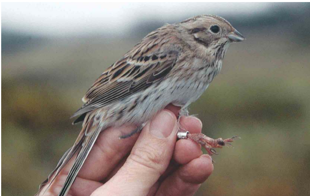
12 Pine Bunting / Witkopgors Emberiza leucocephalos , first-winter female, Castricum, Noord-Holland, Netherlands, 8 November 1999