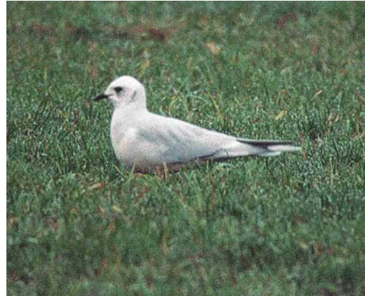
34 Forster's Tern / Forsters Stern Sterna forsteri , Belmullet Peninsula, Mayo, Ireland, 30 November 2002 (Paul Kelly) 35 Snowy Owl / Sneeuwuil Nyctea scandiaca , Belmullet Peninsula, Mayo, Ireland, 30 November 2002 (Paul Kelly) 36 Siberian Crane / Siberische Witte Kraanvogel Grus leucogeranus , juvenile, Mai Po, Hong Kong, China, 10 December 2002 (Yu Yat-tung) 37 Ross's Gull / Ross' Meeuw Rhodostethia rosea , Ulm, Baden-Württemberg, Germany, 6 December 2002 (Tobias Epple)

L. michahellis colour-ringed on Mendes island off north-eastern Spain in late May 2002 was subsequently seen at several sites in Noord-Holland, in early August (Hondsbossche Zeewering), October (IJmuiden) and December (Amsterdam). The first Great Black-backed Gull L. marinus for Malta was an adult at Elmo on 31 December. An adult Kumlien's Gull L. glaucooides kumlieni was photographed at Glommen, Halland, Sweden, on 10 January. In Kerry, Ireland, a Ross's Gull Rhodostethia rosea was briefly seen on 21 November. An adult was present between Öpfingen and Griesingen near Ulm, Baden-Württemberg, Germany, on 5-6 December. In Wales, a first-winter Ivory Gull Pagophila eburnea was showing well at Blackpill, Swansea, South Wales, from 28 November to 5 December. Unseasonal Gull-billed Terns Gelochelidon nilotica were an adult and a first-winter at Lentini lake, Sicily, from 22 December. In the Netherlands, 13 Sandwich