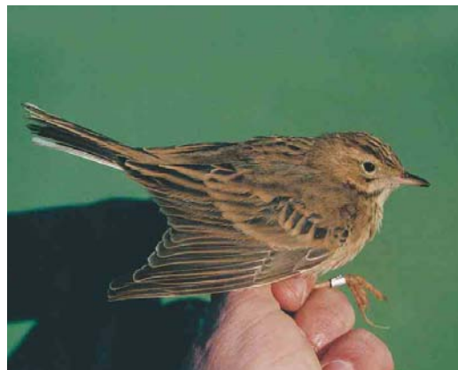
22-25 Mongoolse Pieper / Blyth's Pipit Anthus godlewskii , eerste-winter, 24 november 2002, Kennemerduinen, Bloemendaal, Noord-Holland 26-27 Grote Pieper / Richard's Pipit Anthus richardi , eerste-winter, 9 december 2002, Kennemerduinen, Bloemendaal, Noord-Holland