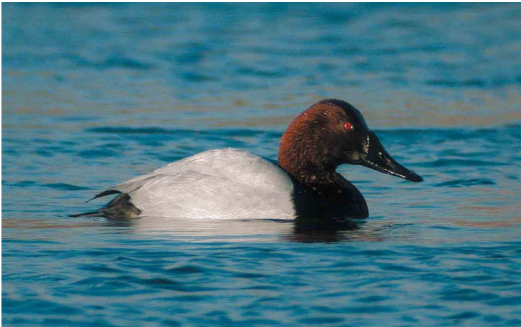
61 Grote Tafeleend / Canvasback Aythya valisineria , mannetje, Castricum, Noord-Holland, 10 januari 2003