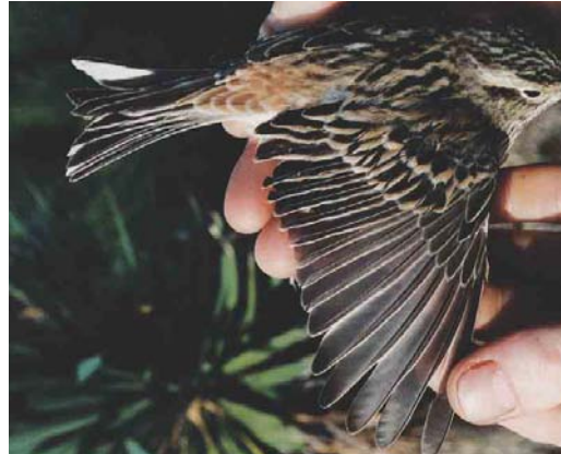
5 Pine Bunting / Witkopgors Emberiza leucocephalos , first-winter male, Duna di Migliarino, Toscana, Italy, 17 December 1995. Note heavy dark grey-brown streaking on underparts, and conspicuous dark spots on upper breast. 6 Pine Bunting / Witkopgors Emberiza leucocephalos , first-winter female, Katwijk, Zuid-Holland, Netherlands, 25 November 1996 7 Pine Bunting / Witkopgors Emberiza leucocephalos , adult-winter female, Duna di Principina, Toscana, Italy, January 2001. Note typical pale nape spot bordered by two dark stripes, and streaked crown with paler median stripe. 8 Pine Bunting / Witkopgors Emberiza leucocephalos , first-winter female, Duna di Migliarino, Toscana, Italy, December 1995. Note uniformly streaked crown, brown cheeks and ear-coverts contrasting with the whitish supercilium, pointed tail-feathers, worn juvenile tertials, juvenile primary coverts and grey-brown lesser coverts.

Bunting is strikingly different from that of Yellowhammer, more contrasting and totally lacking yellow pigments. There are often reddish tones to the supercilium and throat. Pine Bunting's crown shows finer, neater dark streaking; these streaks are usually more evident on the sides of the crown, while on the centre the streaks are thinner and less conspicuous, on a paler background. The pattern is thus similar to that of males. In adult-winter female, the median crown-stripe is generally more streaked and less