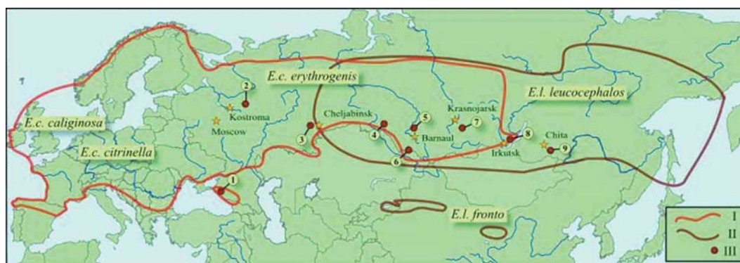
FIGURE 1 Breeding ranges and observed populations of Yellowhammer / Geelgors Emberiza citrinella and Pine Bunting / Witkopgors E leucocephalos . I breeding range of citrinella ; II breeding range of leucocephalos ; III studied populations

Clear differences in plumage and, more subtly, behaviour and osteology (Il'ichev 1962, Panov 1973, 1989) support the view that citrinella and leucocephalos are separate species. Moreover, it is quite possible that they may not be sister species since they originally belonged to different zoogeographical complexes. Citrinella is a typi-