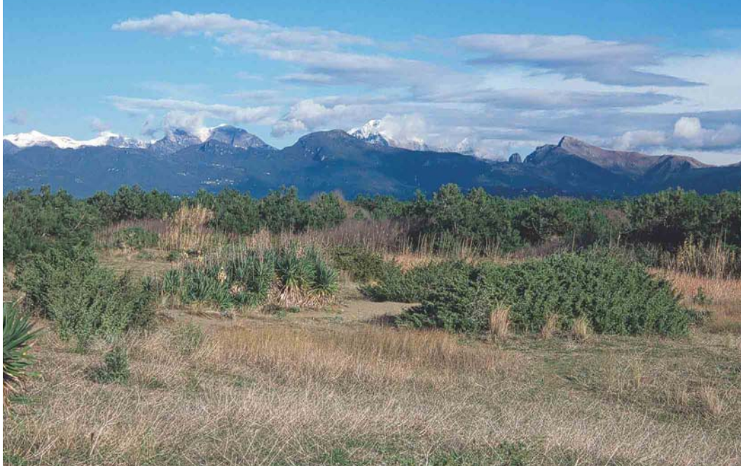
19 Macchia Lucchese dunes, Toscana, Italy, December 2001 ( Daniele Occhiato ). Part of the dunes furthest from the sea, used by Pine Buntings Emberiza leucocephalos as a temporary refuge during the day, or for nocturnal roosting.

Arrigoni degli Oddi (1904, 1929) and Moltoni (1951: 20 individuals reported between 1941 and 1951) considered the species to be an irregular, but not rare, migrant, and identified Veneto as one of the regions where the species occurred most frequently. Foschi et al (1996) list six captures between 1888 and 1907, while Giancarlo Fracasso (in litt) reported 18 captures between 1962 and 1970 in Vicenza province.