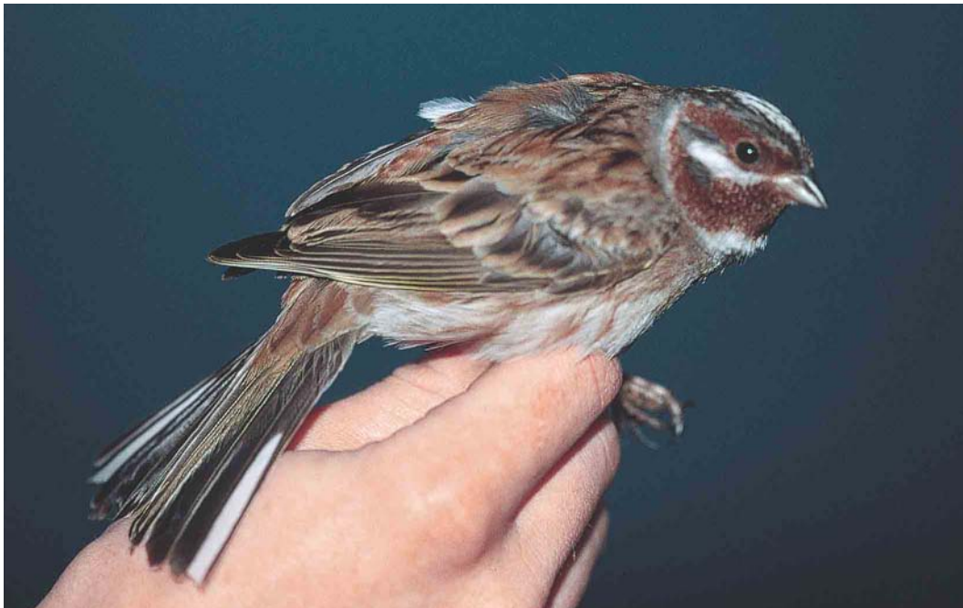
20 Hybrid Pine Bunting x Yellowhammer / Witkopgors x Geelgors Emberiza leucocephalos x citrinella, Fereydoon Kenar, Mazandaran province, Iran, 27 February 2001