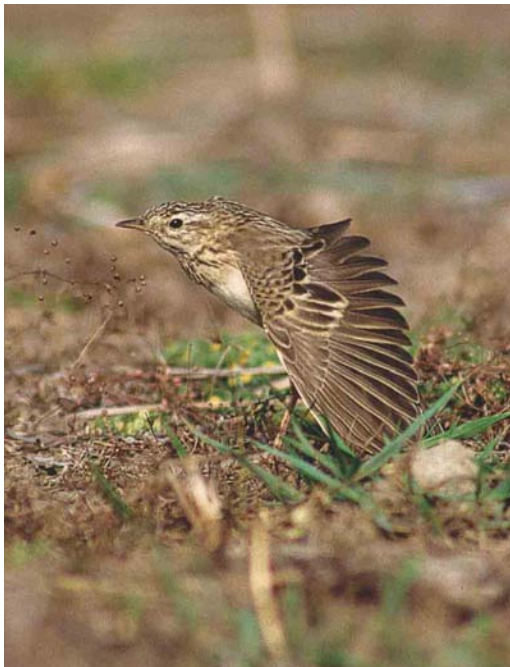
29 Blyth's Pipit / Mongoolse Pieper Anthus godlewskii , Goa, India, 9 March 2002 (Diederik Kok). Note blunt, almost square, dark centre of adult type median coverts.