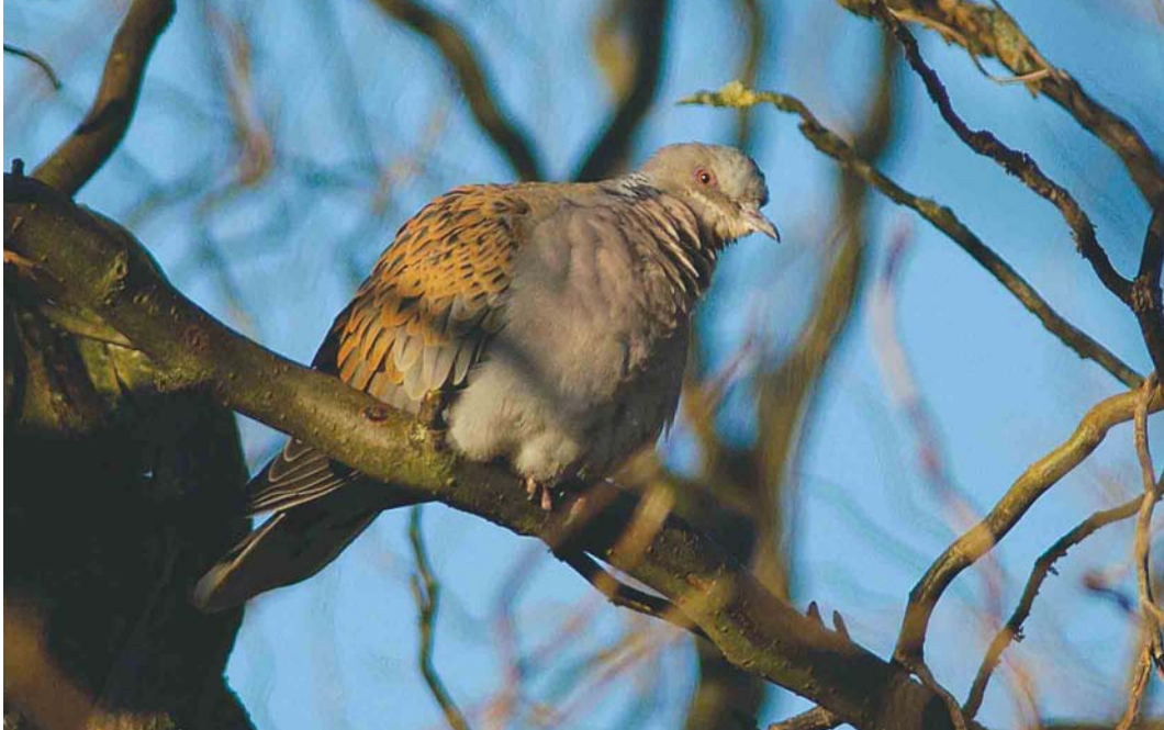
53 Zomertortel / European Turtle Dove Streptopelia turtur , Julianadorp, Noord-Holland, 9 december 2002