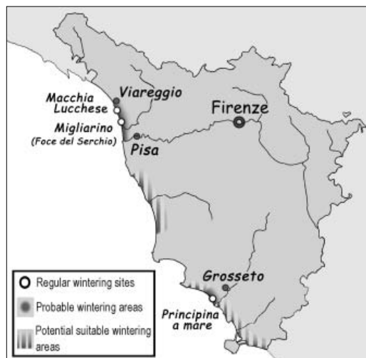
FIGURE 2 Distribution of Pine Bunting / Witkopgors Emberiza leucocephalos in Toscana, Italy. Dark areas show coastal tracts where Pine Bunting probably winters while small white circles show known regular wintering sites. Areas with pale-dark bands show potentially suitable wintering areas.

Camargue, Bouches-du-Rhône, France, it is likely to occur sporadically during migration and in winter.