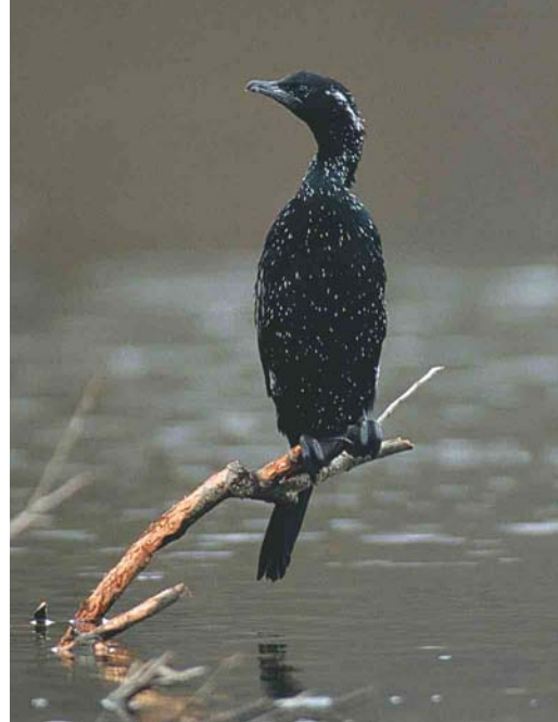
155 Dwergaalscholver / Pygmy Cormorant Microcarbo pygmeus , adult, Eijsder Beemden, Limburg, 7 maart 2003

werd gedacht dat het om een (ontsnapte) aalscholver uit Zuid-Azië of Australië ging. Later op de dag bleek dit gelukkig vals alarm. In het weekend van 8 en 9 maart trokken veel waarnemers naar Zuid-Limburg om de Dwergaalscholver te bekijken; op deze dagen was de vogel de meeste tijd op zijn Nederlandse stek te vinden. Op 16 maart was de vogel nog aanwezig.