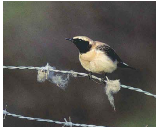
89-90 Presumed Eastern Black-eared Wheatear / vermoedelijke Oostelijke Blonde Tapuit Oenanthe melanoleuca , immature male, Aagtekerke, Zeeland, Netherlands, June 1996 91-92 Presumed Eastern Black-eared Wheatear / vermoedelijke Oostelijke Blonde Tapuit Oenanthe melanoleuca , immature male, Aagtekerke, Zeeland, Netherlands, June 1996. Obvious 'immature impression' increased by slight brownish tinge to black greater coverts is a character for melanoleuca . The contrast between the greyish, 'dirty' crown/nape and 'cleaner' ochre mantle is typical for melanoleuca . The throat-bib is too large for Western Black-eared Wheatear O. hispanica , while the ochre of the breast reaching the throat-bib is more typical for melanoleuca . Moreover, there is too much black on the lores for hispanica .