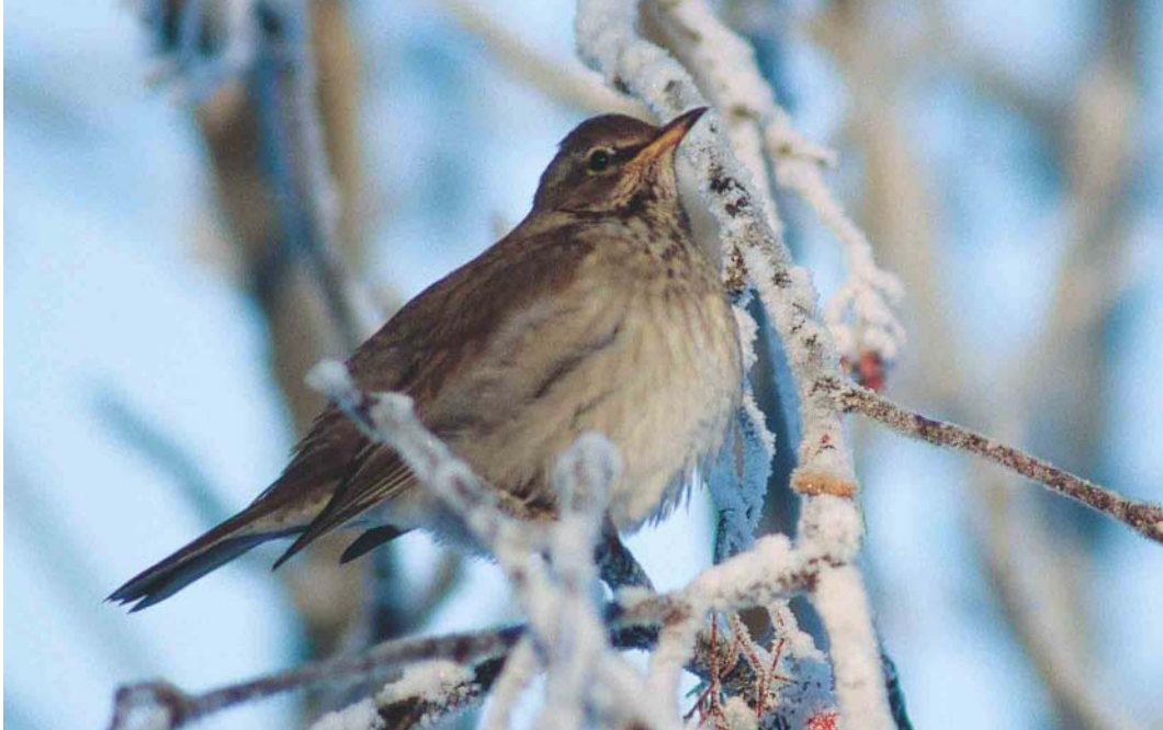
127 Black-throated Thrush / Zwartkeellijster Turdus ruficollis atrogularis , Rautjärvi, Finland, January 2003