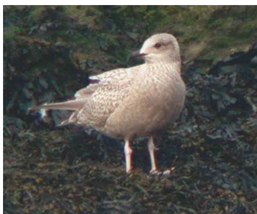
123 Lesser Short-toed Lark / Kleine Kortteenleeuwerik Calandrella rufescens , Utlängan, Blekinge, Sweden, 14 February 2003 124 Glaucous Gull / Grote Burgemeester Larus hyperboreus , second-winter, Punta de Jandia, Fuerteventura, Canary Islands, 7 February 2003 125-126 Thayer's Gull / Thayers Meeuw Larus glaucooides thayeri , juvenile, Killybegs, Donegal, Ireland, 24 February 2003

Another adult occurred at Castro Urdiales, Cantabria, Spain, from 9 February to March. A first-winter was present at Entressen, La Crau, Bouches-du-Rhône, from 25 February to at least 9 March, together with a first-winter Ring-billed Gull L. delawarensis and an adult Glaucous Gull L. hyperboreus . In both France and Spain, eight Ring-billed Gulls were reported during February alone. At Pt Saint Elmo, Malta, a first-winter Slender-billed Gull L. genei and a first-winter European Herring Gull L. argentatus were seen on 18 January and several Pontic Gulls L. cachinnans in January-February. On 16 February, seven migratory Lesser Black-backed Gulls flew over Reykjavík, Iceland. In the third week of February, six first-winter American Herring Gulls L. smithsonianus were reported from Cork and Londonderry, Ireland, and one from Cornwall, England. Up to 11 were present in the Azores in February. On 2 February, a juvenile Thayer's Gull L. glaucooides thayeri