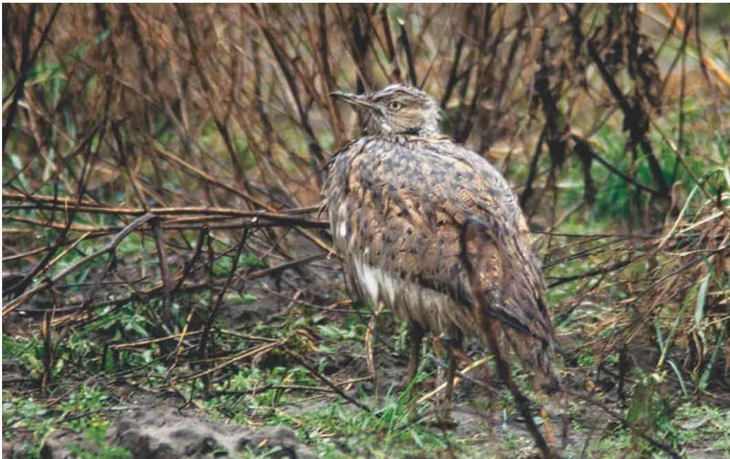
111 Macqueen's Bustard / Oostelijke Kraagtrap Chlamydotis macqueenii , first-winter, Lombardsijde, West-Vlaanderen, Belgium, 20 January 2003 (Johan Buckens)