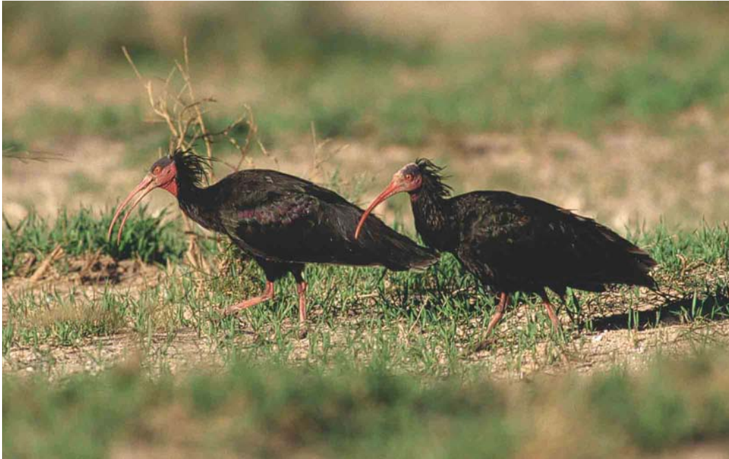
110 Northern Bald Ibises / Kaalkopibissen Geronticus eremita , Tamri, Morocco, January 2003 ( Eric Koops )