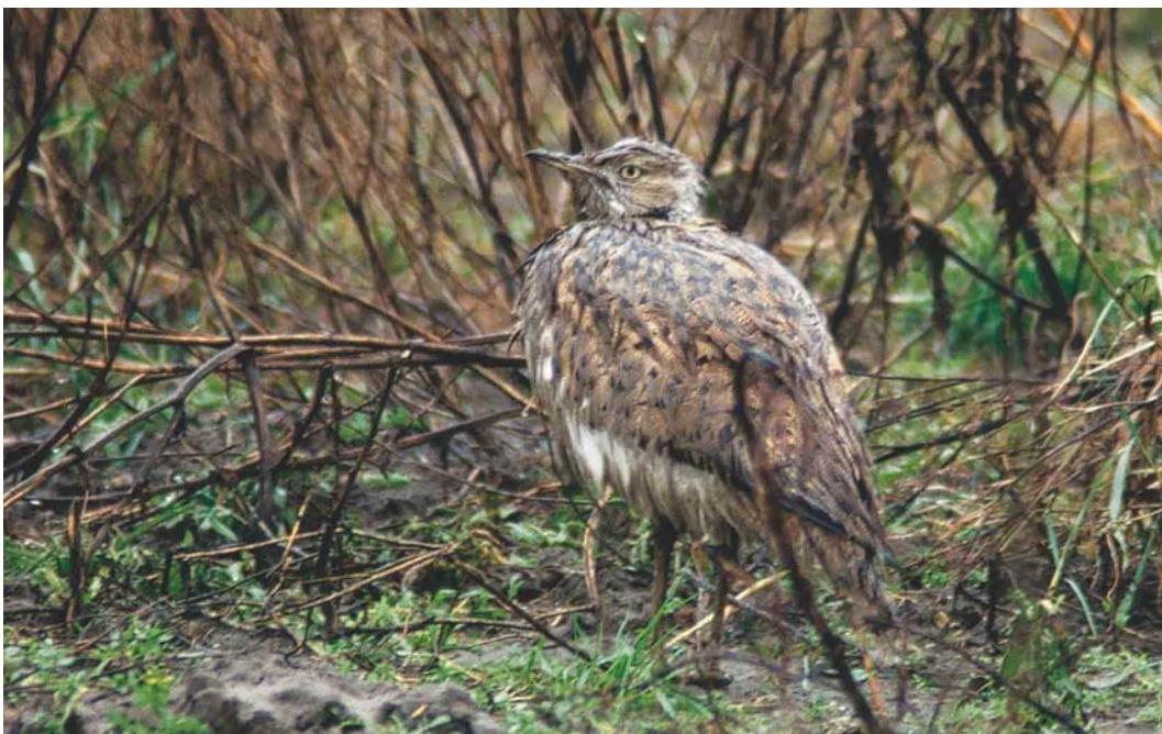
111 Macqueen's Bustard / Oostelijke Kraagtrap Chlamydotis macqueenii , first-winter, Lombardsijde, West-Vlaanderen, Belgium, 20 January 2003 ( Johan Buckens )